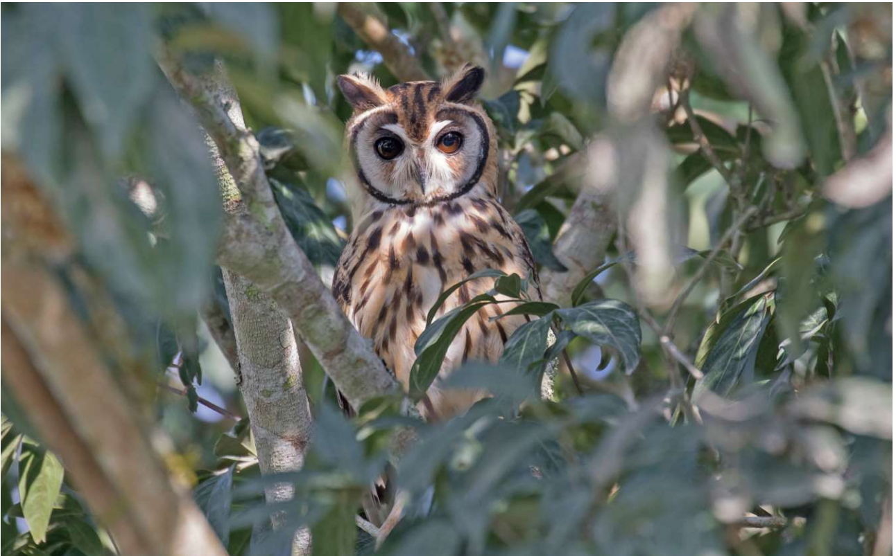
Some sharp-eyed spotting got us this superb Striped Owl

Woodcreeper and Yellow-crested Tanager. Antbirds were well represented, and we notched up a number of species including Fasciated, Lined and Plain-winged Antshrikes, Ornate and Stripe-chested Antwrens and Peruvian Warbling and Spot-winged Antbirds. Unfortunately the skulking Chestnut-throated Spinetail was heard but only glimpsed. On one afternoon we birded some more open habitats nearby. Here we were delighted to finally find a magnificent Striped Owl! Nearby we found Cinereous-breasted Spinetail, Rusty-backed Antwren and Black-faced Tanager, whilst a nearby pool held a spectacular gathering of Masked Ducks, and we also teased some dapper little Russet-crowned Crakes into view.