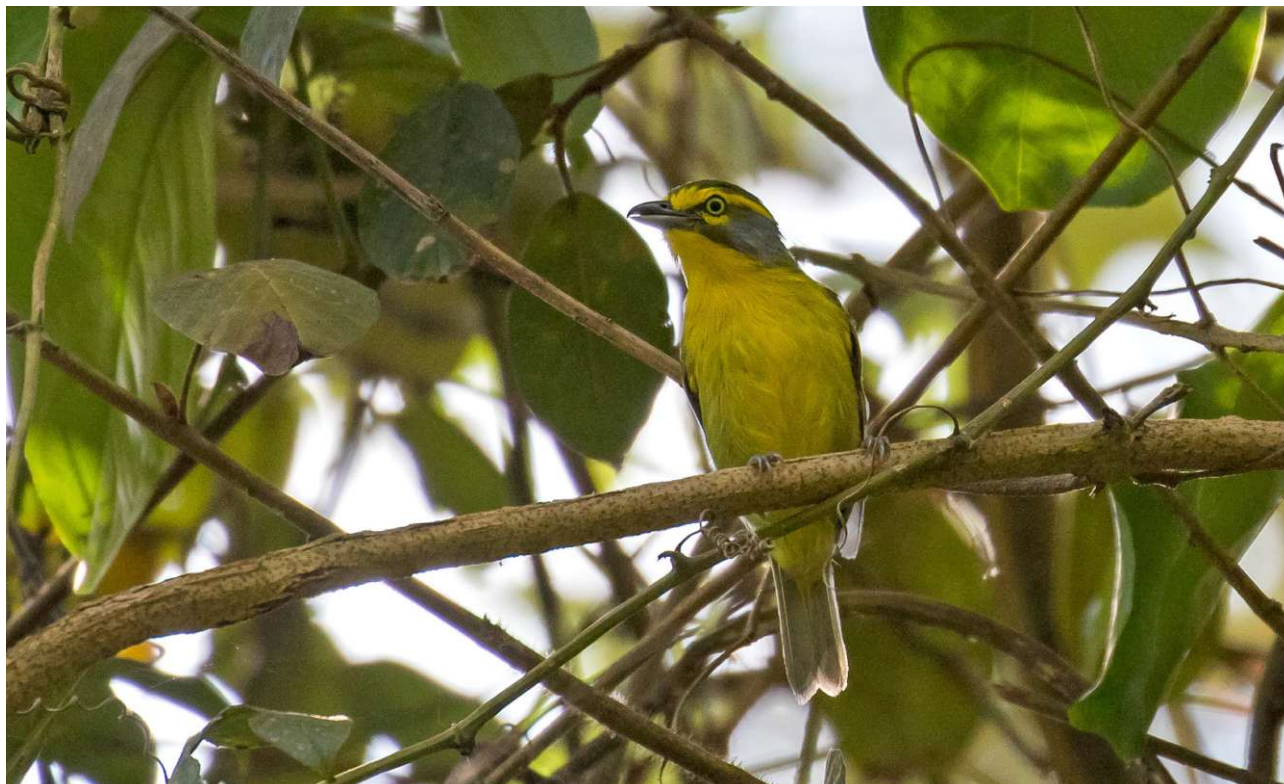
The often elusive Slaty-capped Shrike-Vireo showed unusually well (Pete Morris)

Slaty-capped Shrike-Vireo Vireolanius leucotis A few seen and heard. The first of showed very well at Waqanki Lodge.