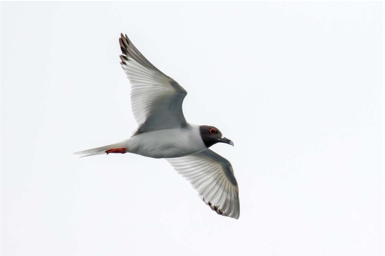
More pelagic highlights! Swallow-tailed Gull and Pink-footed Shearwater

were joined by smaller numbers of superb Hornby's Storm Petrels, as well as several Wedge-rumped and Black Storm Petrels This has to be one of THE trips for storm petrels anywhere in the world; incredible stuff. But it wasn't just the storm petrels. There was plenty else besides! Several graceful Waved Albatrosses visit-