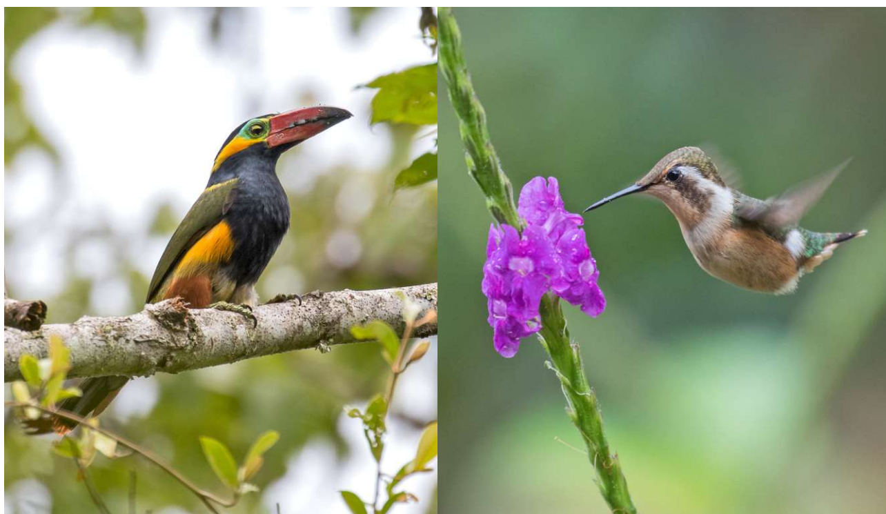
Golden-collared Toucanet and juvenile Amethyst Woodstar at Aguas Verdes

By the time we left Abra Patricia we were doing pretty well, if a little tired after rather a few nocturnal forays! We headed for Aguas Verdes where some new feeders gave us the chance to see a few new species that may otherwise prove tricky! The trickiest thing was the viewing – the screen was certainly not designed for a large group! Nevertheless, we did all manage to see Cinereous and Little Tinamous at close range, feeding alongside Orange-billed Sparrows and Grey-necked Wood Rails. The hummingbird feeders nearby were productive, and here we found several territorial Many-spotted Hummingbirds, some gorgeous Blue-fronted Lancebills, several chunky Grey-breasted Sabrewings, Golden-tailed Sapphires, Sapphire-spangled Emeralds and diddy Amethyst Woodstars. A nearby pair of Golden-collared Toucanets were much appreciated, as were the endemic Huallaga Tanager and our first flock of dazzling Paradise Tanagers.