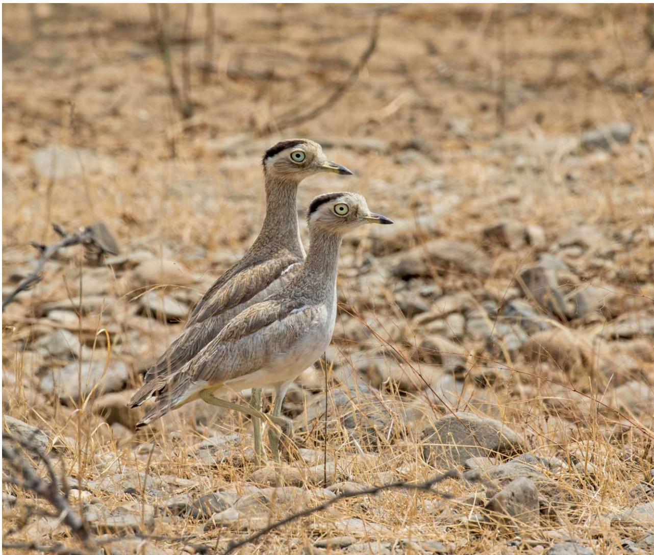
Good numbers of Peruvian Thick-knees gave wonderful views

Plumbeous Rail Pardirallus sanguinolentus Seen well near to Cruz Conga and at Rio Chonta [ tschudii ]. Purple Gallinule Porphyrio martinicus A few. First seen at the roadside pond near Olmos. Common Gallinule Gallinula galeata Good numbers at a few sites, first at the reservoir near Chaparri [ pauvilla ]. Andean Coot Fulica ardesiaca Good numbers at the reservoir near Chaparri and at Laguna Paraiso [ atrura ]. Limpkin Aramus guarauna A few seen, first in the ricefields around Moyobamba and one at Bellavista [nominated]. Peruvian Thick-Knee Burhinus superciliaris Great views of c40 on the journey back from Quebrada Frejolillo.