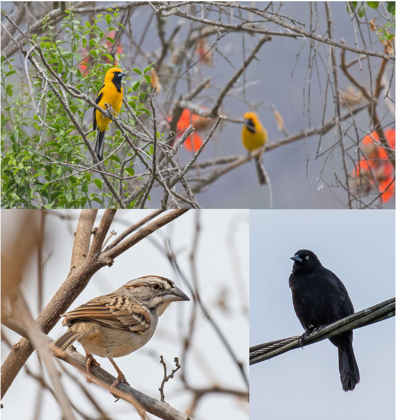
Yet more goodies form the tour! White-edged Oriole, Pale-eyed Blackbird and Tumbes Sparrow