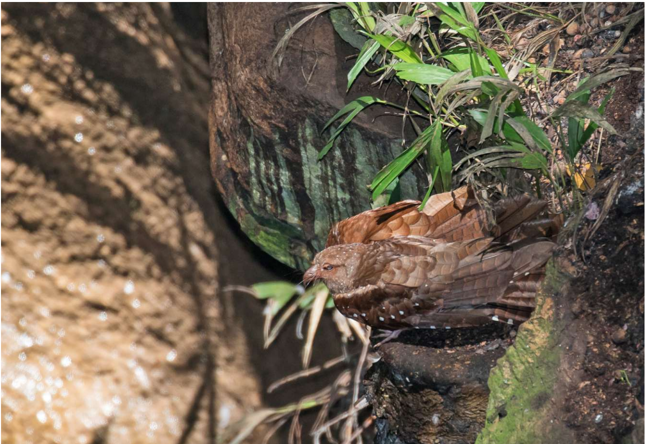
Oilbirds in the sun from the road!! Yes, really...

All too soon it was time to move again, and as we headed south towards Tarapoto we made a few stops, the most productive of which saw us watching some remarkable Oilbirds right by the road! Surely the easiest Oilbirds in the world?! White-banded Swallows were all we could find of note along the Huallaga River, and we spent the late afternoon birding at Quebrada Mishquiyacu. This turned out to be pretty good but still left us in need of the odd bird! We did manage great views of several Northern (Huallaga) Slaty Antshrikes, a lovely pair of Southern Chestnut-tailed Antbirds, obliging Plain-crowned Spinetails, a tiny little White-bellied Pygmy-Tyrant and some Chestnut-vented Conebills.