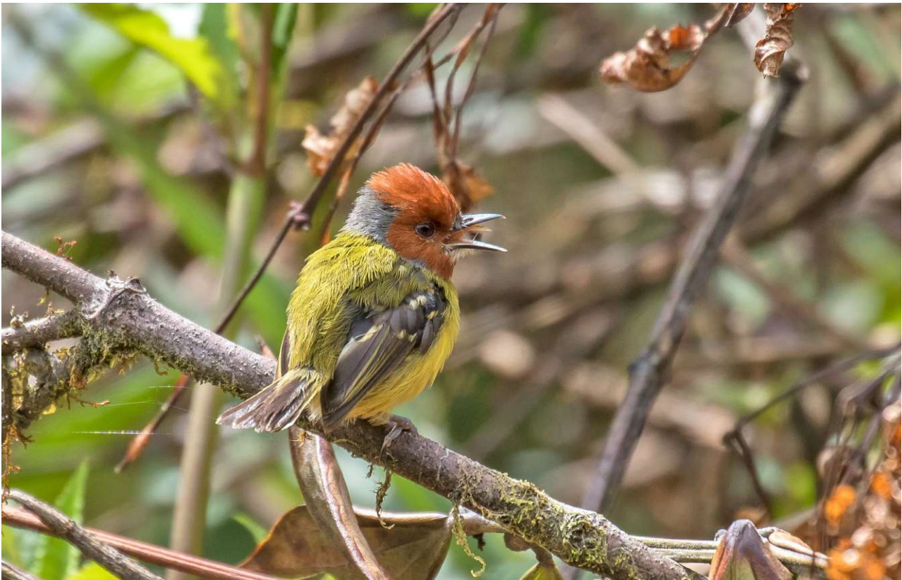
The relatively recently-described Lulu's Tody-Flycatcher was another favourite at Abra Patricia