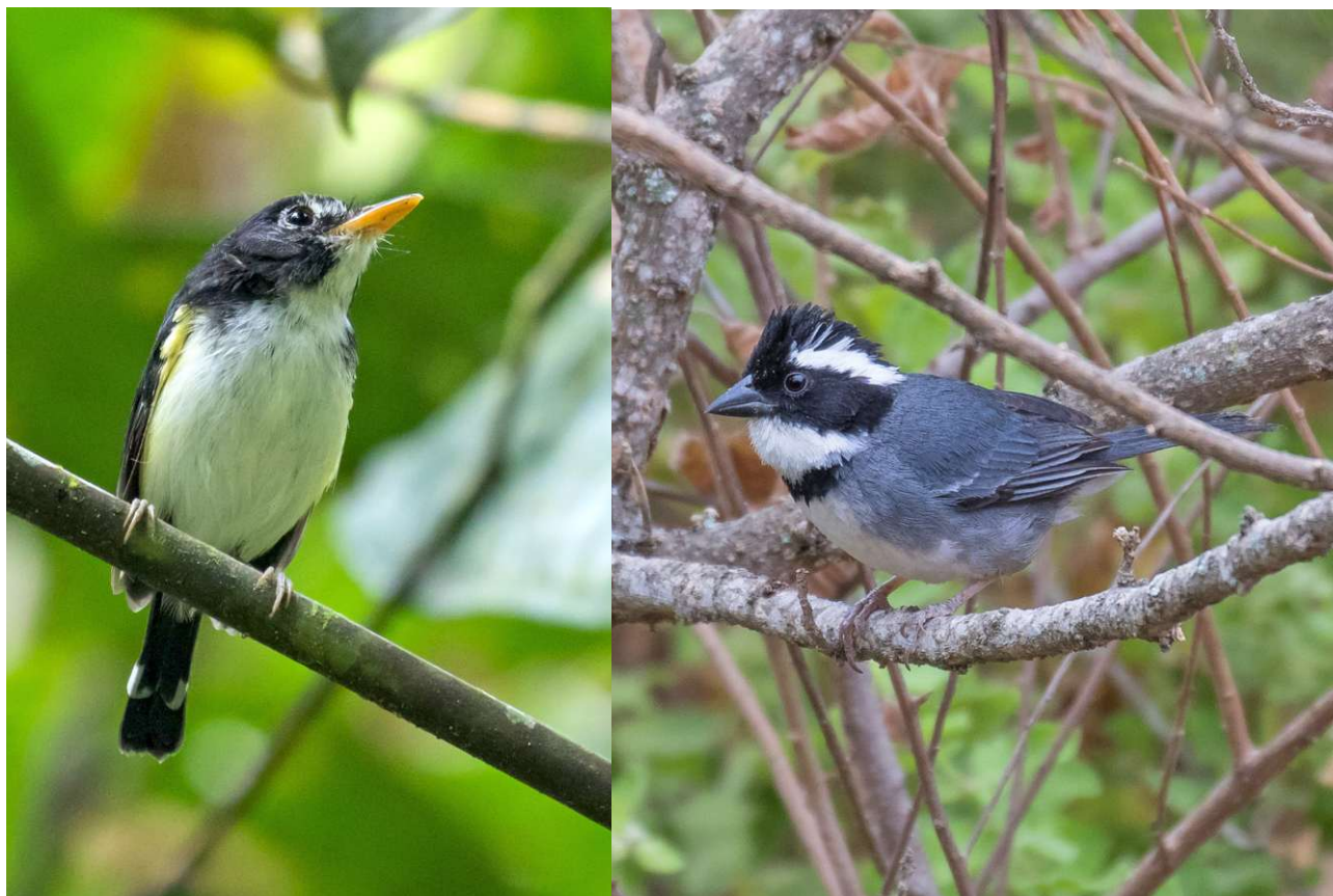
Black-and-white Tody-Flycatcher from Waqanki Lodge, and a fine Black-capped Sparrow from the northwest (Pete Morris)

One seen well for most of the group on the way up to Flor del Café, Plataforma, and then good scope views of a group of three below the tunnel at Tarapoto [nominate].