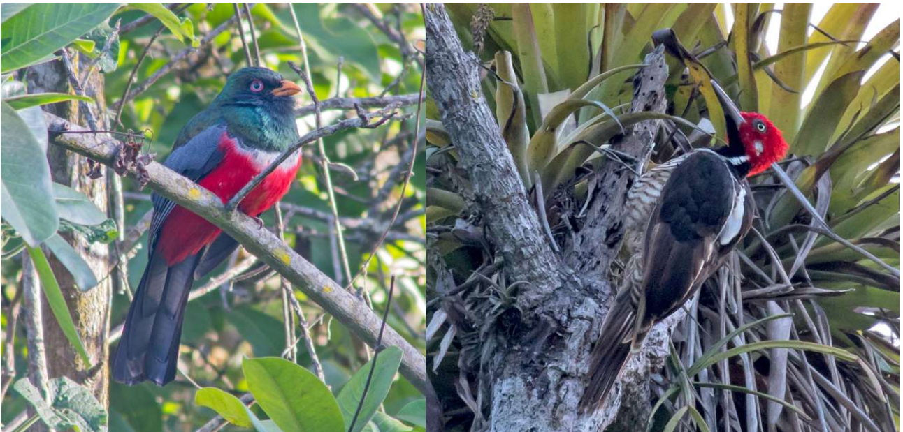
Ecuadorian Trogon and Guayaquil Woodpecker provided colour! (Pete Morris)

The following morning we visited the nearby forest at Casupe. Birding along a lightly-used gravel road, we were we were able to add a number of Tumbesian specialities to our list. Although we had already seen the rather confiding re-introduced White-winged Guans at Chaparri, we were delighted to see our first 'wild'