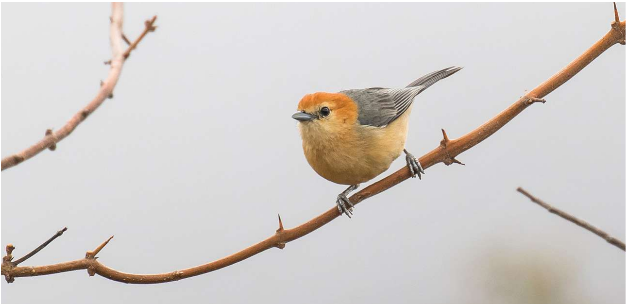
The delightful Buff-bellied Tanager was seen at several sites (Pete Morris)