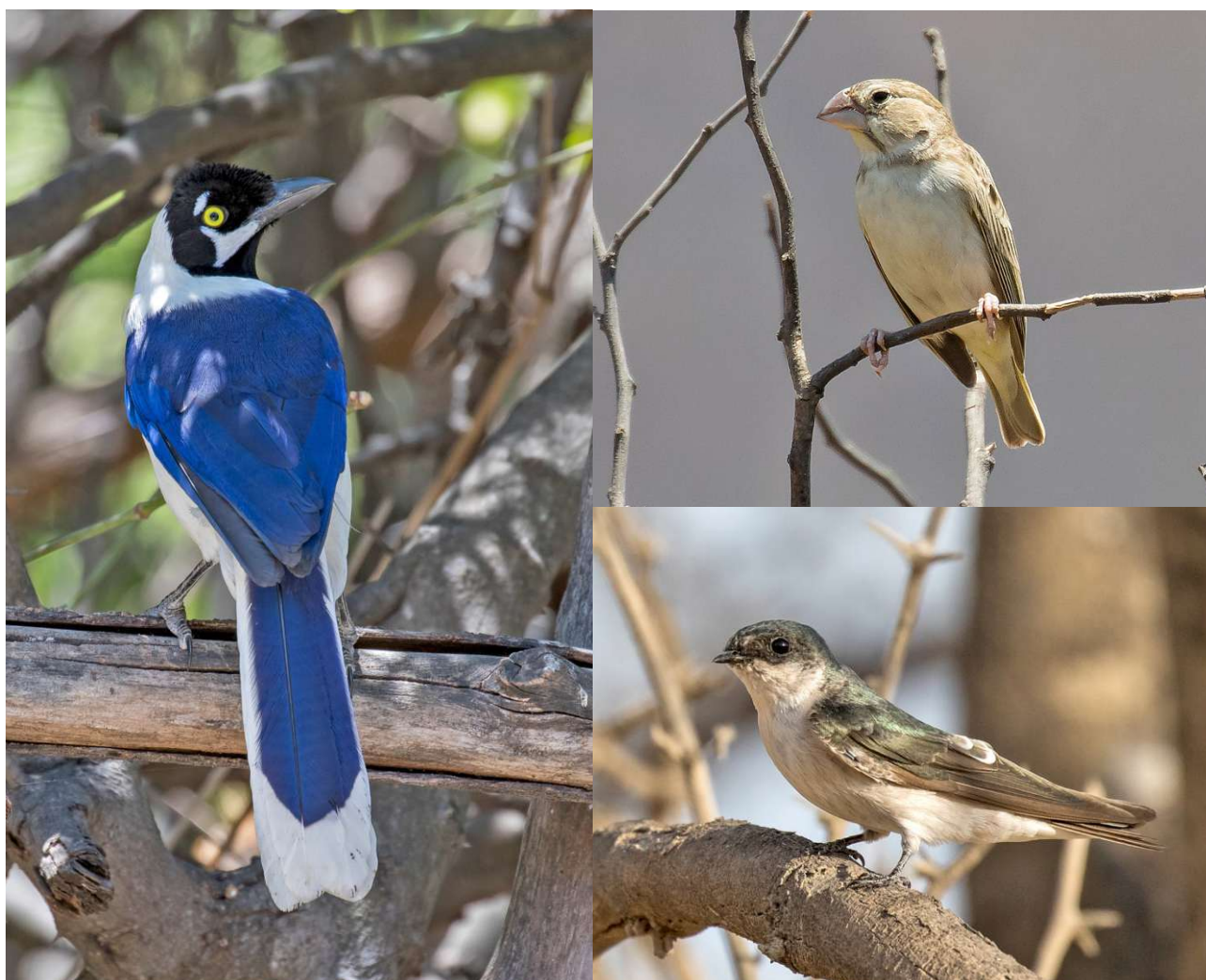
Highlights from the Tumbes region included White-tailed Jay, the localized Sulphur-throated Finch and Tumbes Swallow (Pete Morris)

Making our way back to Chaparri, we paused to watch Purple-collared and Short-tailed Woodstars, noted some smart Scarlet-backed Woodpeckers and Pacific Parrotlets, and stopped at a waterhole where we finally got some great views of the scarce Sulphur-throated Finch, alongside hundreds of Parrot-billed Seedeaters. As we ate a fine lunch, we were entertained by some very striking White-tailed Jays. It was then time to pack up and move on to our next base at Olmos. We paused at a nearby reservoir where amongst the large groups of White-cheeked Pintail and Cinnamon Teal we found a Comb Duck and a Black-faced Ibis from the very localized population which clings on in this area. Also present were Pied-billed and Great Grebes and our only Savanna Hawk of the trip. We also called in at Bosque de Pomac where, as well as finding another smart Rufous Flycatcher, we were delighted to get great views of a number of confiding Tumbes Swallows. As we supped a beer with dinner that evening, news arrived that our final two group members had now arrived in Lima.