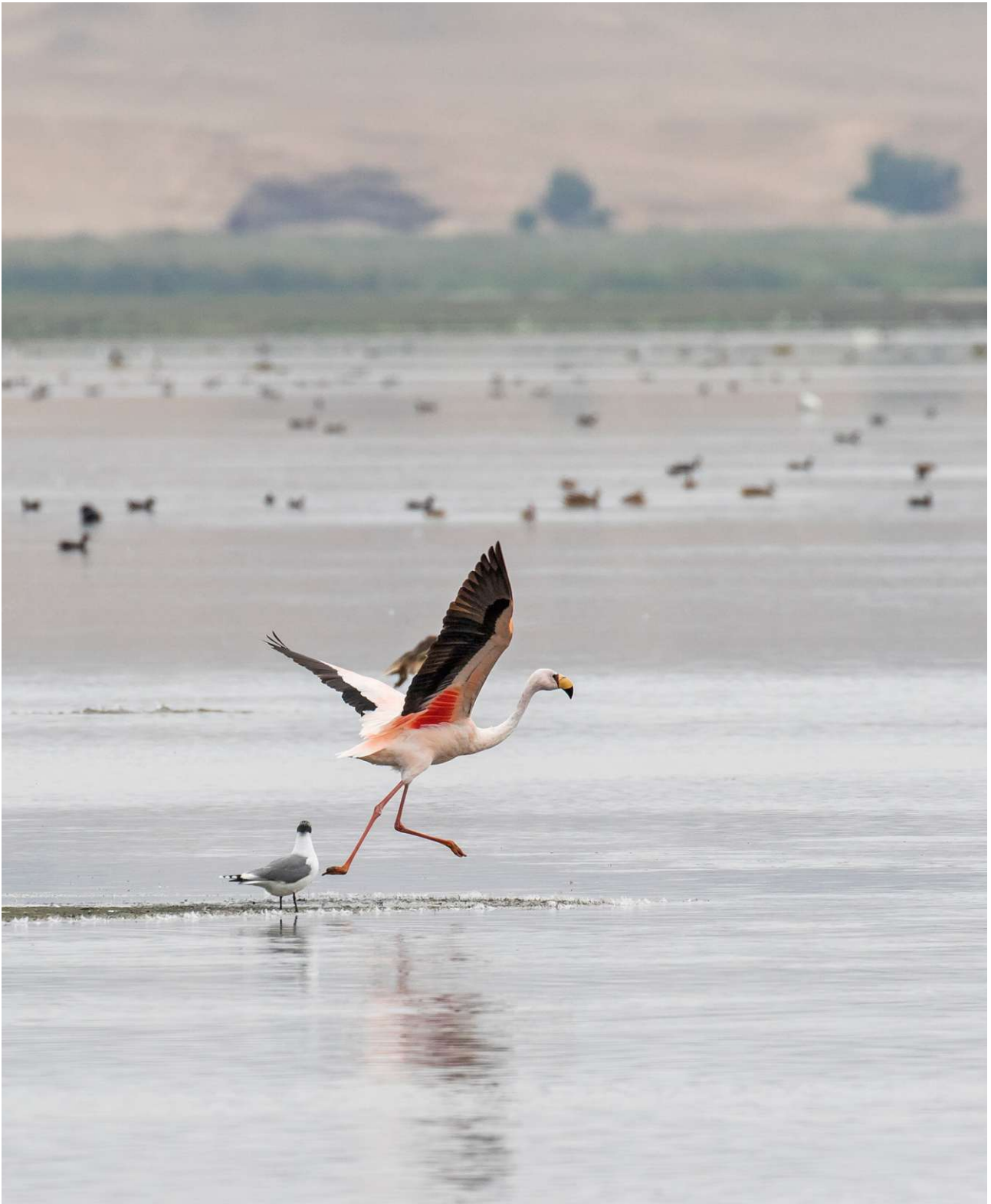
This James's Flamingo was perhaps the biggest surprise of the tour

All too soon, it was time to head back to Lima for the end of the tour. It had been an action-packed few weeks, with a great group who were determined to overcome the difficulties of travel in the remote Peruvian Andes. With so much to offer, this is unquestionably one of those not to miss trips, and we made sure we got our fair share!!