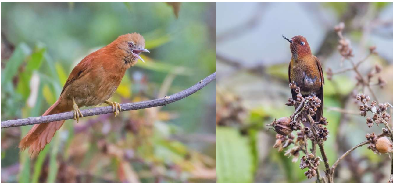
We were relieved to get back to Abra Barra Megra and find Russet-mantled Softtail and Coppery Metaltail

Like true Birdquesters, we soon shrugged off this experience by tucking into some fried eggs and... going birding! Of course we should have been birding the montane forest patches above Leymebamba the previous day, so we had to make up for lost time! Smiles were soon restored as we quickly located a small group of smart endemic Russet-mantled Softtails which proceeded to show incredibly well! Hummers buzzed around the bushes and these included Black-tailed Trainbearer and the smart endemic Coppery Metaltail. We also encountered a couple of impressive mixed flocks led by Scarlet-bellied Mountain-Tanagers. Amongst these we picked out the local Drab Hemispingus as well as delightful Pearled Treerunners, Barred Becards, Yellow-breasted Brush Finch, smart and unusually showy Buff-breasted Mountain Tanagers, colourful Blue-backed Conebills and Moustached Flowerpiercers. Right up at the highest elevations we also found the local form of White-chinned Thistletail and some smart Many-striped Canasteros, and we paused for a roadside Fulvous (Rufous) Antpitta which showed well to most. It was amazing to hear how different the song was to the Cajamarca (Rufous) Antpittas just down the road!