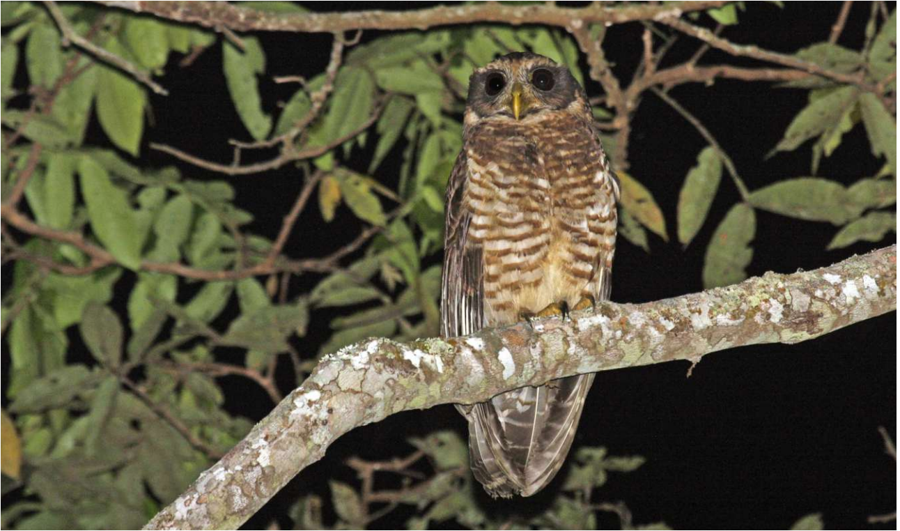
Band-bellied Owl at Waqanki Lodge

Woodcreeper and Yellow-crested Tanager. Antbirds were well represented, and we notched up a number of species including Fasciated, Lined and Plain-winged Antshrikes, Ornate and Stripe-chested Antwrens and Peruvian Warbling and Spot-winged Antbirds. Unfortunately the skulking Chestnut-throated Spinetail was heard but only glimpsed. On one afternoon we birded some more open habitats nearby. Here we were delighted to finally find a magnificent Striped Owl! Nearby we found Cinereous-breasted Spinetail, Rusty-backed Antwren and Black-faced Tanager, whilst a nearby pool held a spectacular gathering of Masked Ducks, and we also teased some dapper little Russet-crowned Crakes into view.