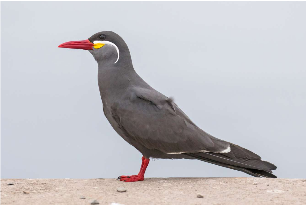
Inca Terns always impress!

Chilean Skua Stercorarius chilensis (PE) One seen on the pelagic from Callao, Lima. Pomarine Skua Stercorarius pomarinus (PE) c50 seen on the pelagic with many great views. Long-tailed Jaeger (L-t Skua) Stercorarius longicaudus (PE) c20 seen well on the pelagic. Skuas are not easy [ pallascens ]. Rock Dove (Feral Pigeon) Columba livia Introduced vermin! Scaled Pigeon Patagioenas speciosa One seen well in the scope at Flor del Café, Plataforma. Band-tailed Pigeon Patagioenas fasciata Good numbers at several sites. First seen at Abra Porculla [ albilinea ]. Pale-vented Pigeon Patagioenas cayennensis Several in the south. First seen on the drive to Tarapoto [ sylvestris ].