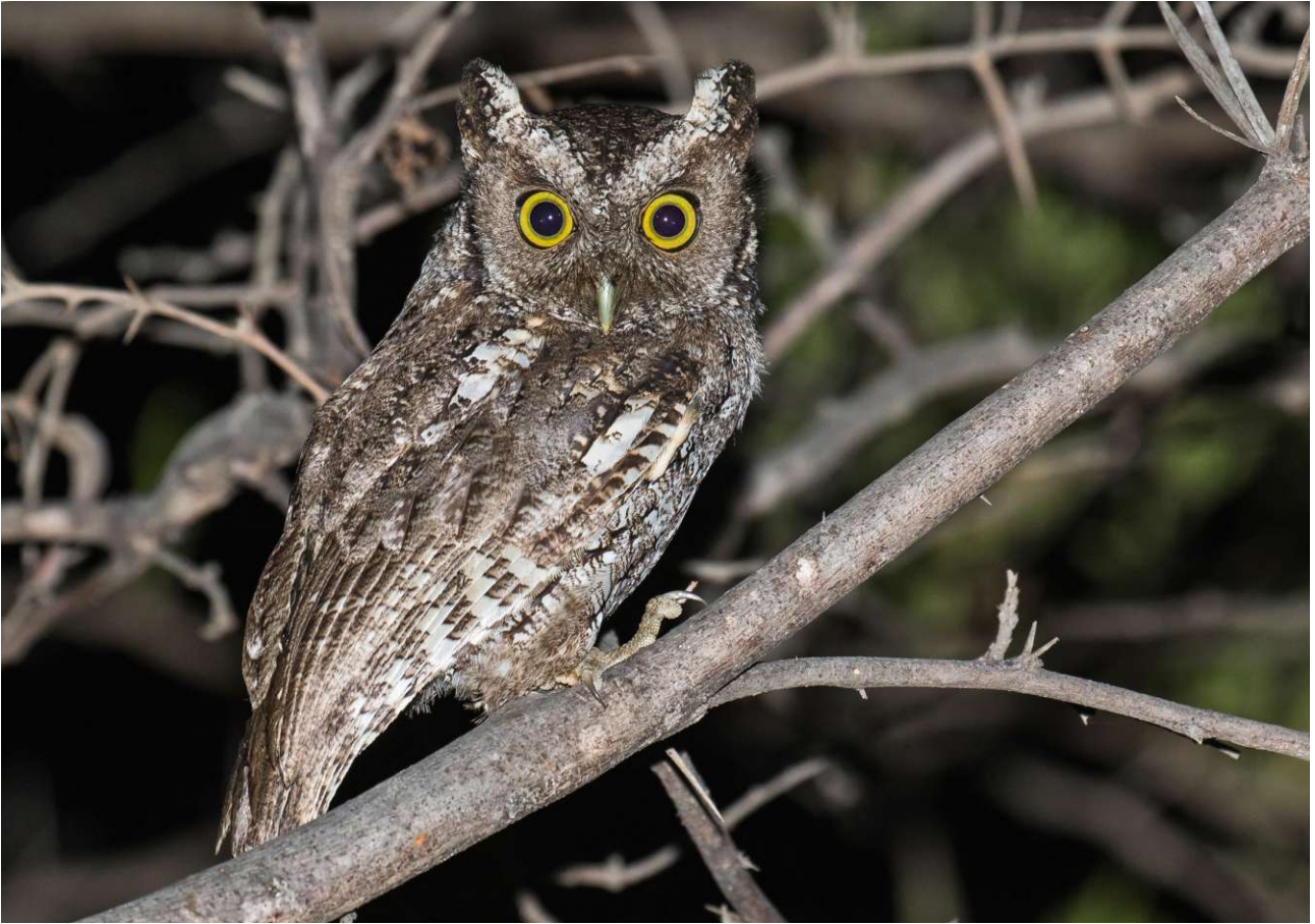
West Peruvian Screech Owl - my first species with the group

Meanwhile, some of the party were still marooned in Europe, whilst as dark approached, I finally made it to Chaparri Lodge, meeting the group on the access road where they had already bagged Anthony's Nightjar. It wasn't too long before we were back out in action, and soon had a cute West Peruvian Screech Owl in the scope. A nice way for me to start the tour at least, on what was to become an owl-filled tour!