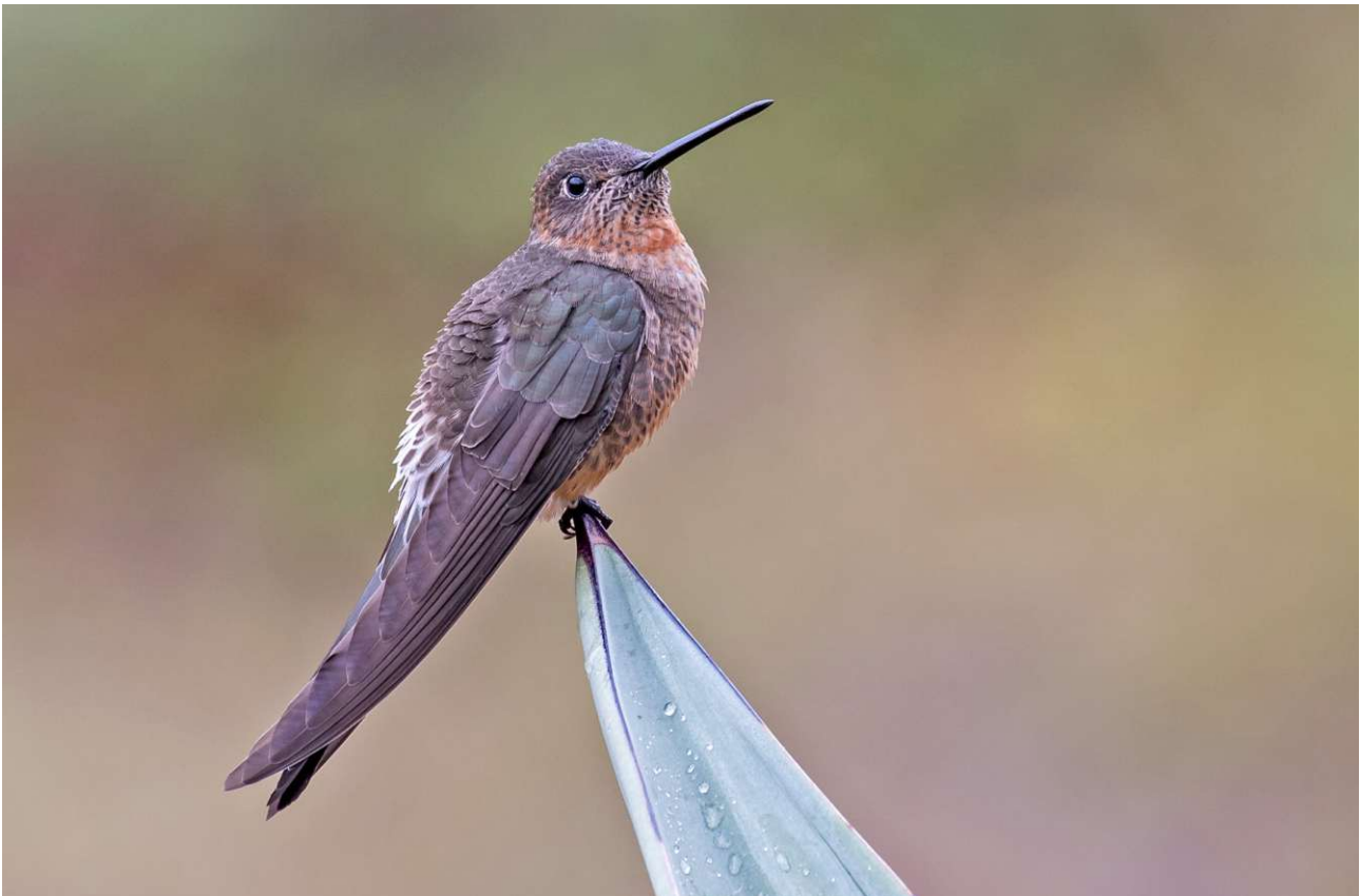
Giant Hummingbird is a cracking bird when seen up close and personal! (Pete Morris)