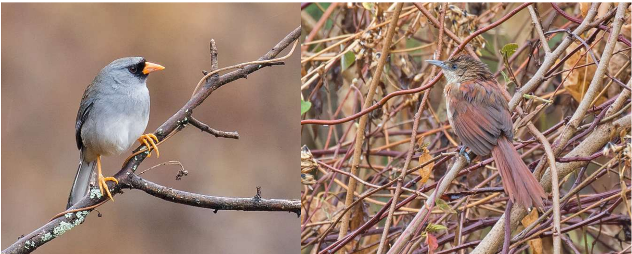
Two localized endemics: Grey-winged Inca Finch and Chestnut-backed Thornbird