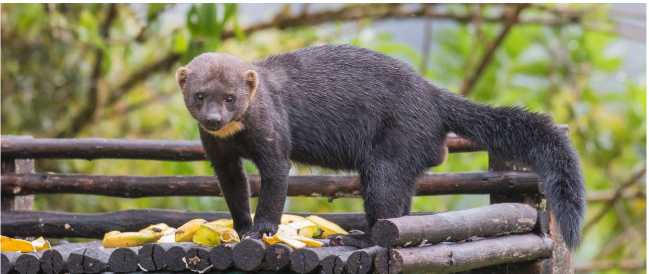
Shame about the bananas! A Tayra at Abra Patricia!

Dusky Dolphin Lagenorhynchus obscurus (PE) Several groups seen well during the pelagic.