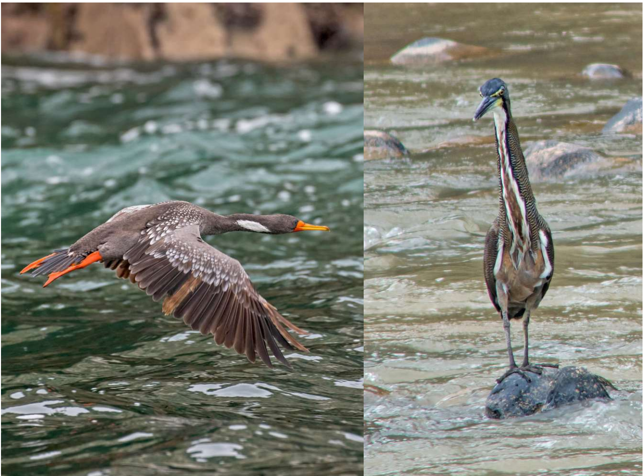
Red-legged Cormorant from the pelagic, and a fishing Fasciated Tiger Heron

Neotropic Cormorant Phalacrocorax brasilianus Biggest numbers were at the reservoir, Tinajones, near Chaparri. Guanay Cormorant ◊ Leucocarbo bougainvillii (PE) (NT) Plenty on the pelagic from Callao. Anhinga Anhinga anhinga (NL) A couple of sightings in the Bellavista area. Turkey Vulture Cathartes aura Common and widespread. Black Vulture Coragyps atratus Common and widespread. King Vulture Sarcoramphus papa Just one, seen well at Quebrada Frejolillo. Western Osprey Pandion haliaetus One at the reservoir near Chaparri and another at Laguna Paraiso [carolinensis]. Pearl Kite Gampsonyx swainsonii A pair on the first day were the only ones. Grey-headed Kite Leptodon cayanensis One displaying over Quebrada Upaquihua [nominate]. Swallow-tailed Kite Elanoides forficatus Quite a few seen, the first around Abra Patricia [yetapa].