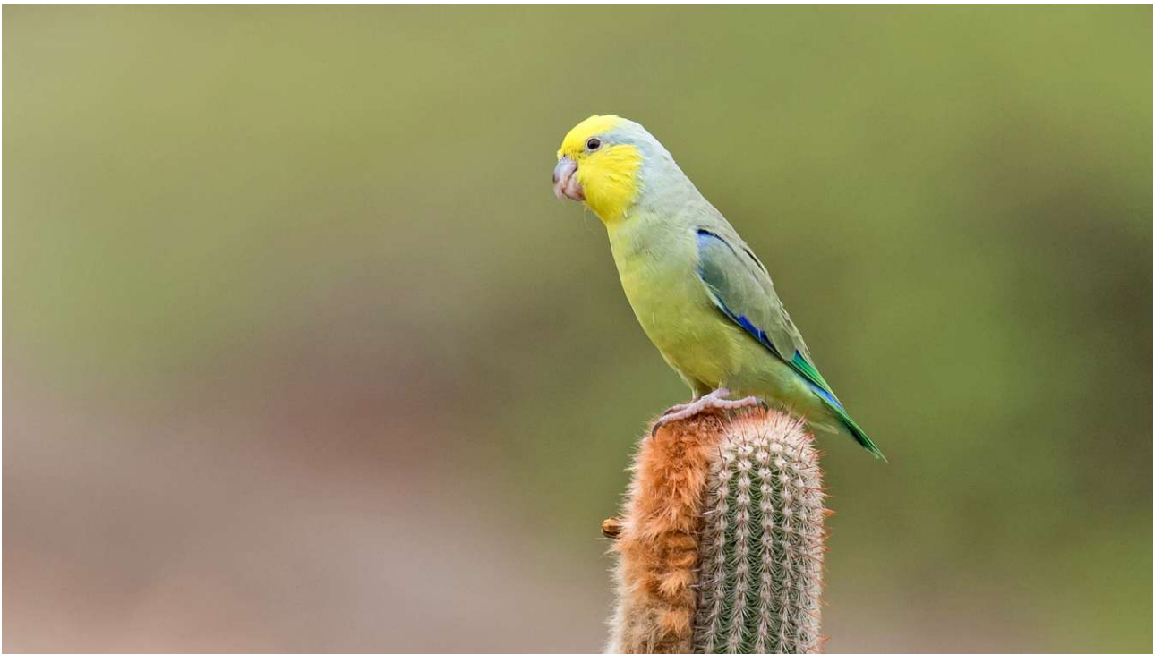
Yellow-faced Parrotlets were a highlight of our visit to the Balsas Canyon (Pete Morris)