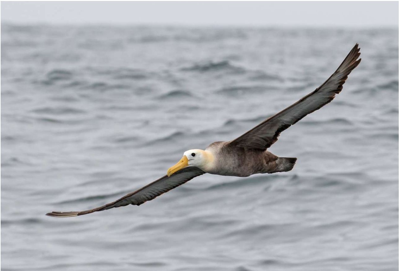
Stunning Waved Albatrosses were a feature of the pelagic (Pete Morris)

Peruvian Plantcutter are still doing us proud! Of particular note on this tour were the 18 species (if one splits Marañon Screech Owl) of owl recorded (14 of which were seen well), and the sixty species of hummingbirds. By special request, we also added a short extension at the end of the tour. This produced spectacular numbers of storm petrels, including the rare Hornby's Storm Petrel, good movements of skuas and Sabine's Gulls (the latter joined by spectacular but similarly-plumaged Swallow-tailed Gulls!), and some stunning Waved Albatrosses as well as a few cetaceans.