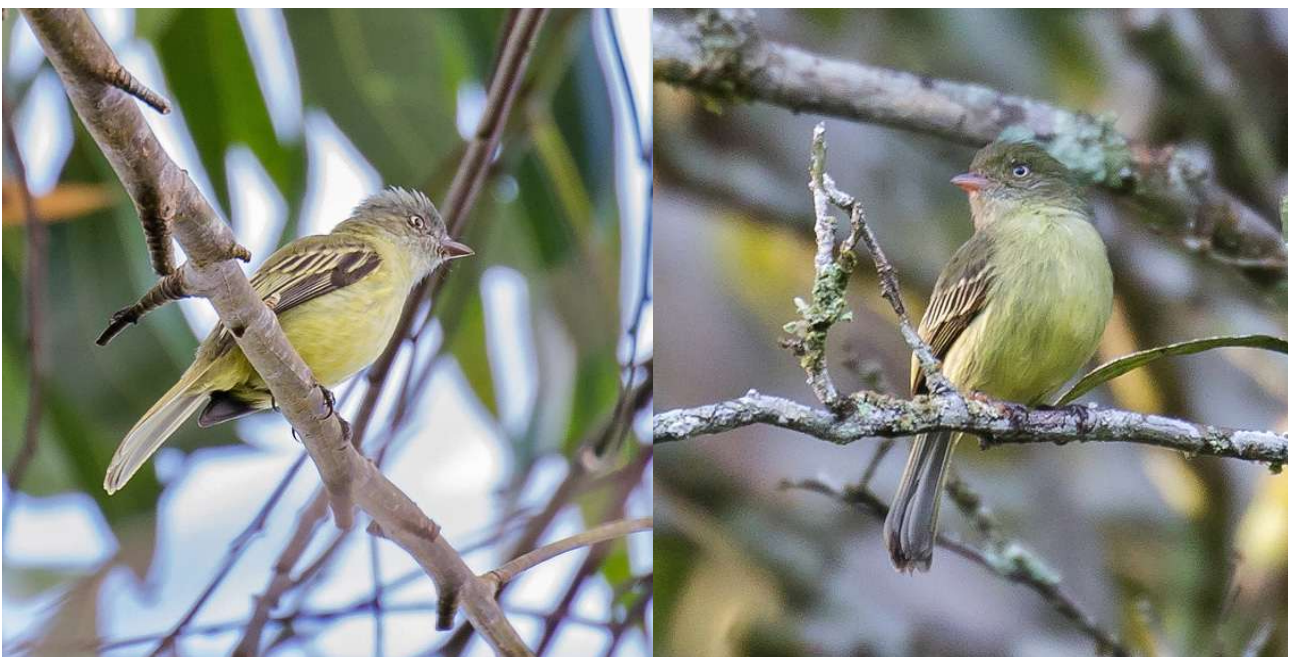
Two rare tyrannulets: Red-billed Tyrannulet on the left and the similar Mishana Tyrannulet

All too soon it was time to move again, and as we headed south towards Tarapoto we made a few stops, the most productive of which saw us watching some remarkable Oilbirds right by the road! Surely the easiest Oilbirds in the world?! White-banded Swallows were all we could find of note along the Huallaga River, and we spent the late afternoon birding at Quebrada Mishquiyacu. This turned out to be pretty good but still left us in need of the odd bird! We did manage great views of several Northern (Huallaga) Slaty Antshrikes, a lovely pair of Southern Chestnut-tailed Antbirds, obliging Plain-crowned Spinetails, a tiny little White-bellied Pygmy-Tyrant and some Chestnut-vented Conebills.