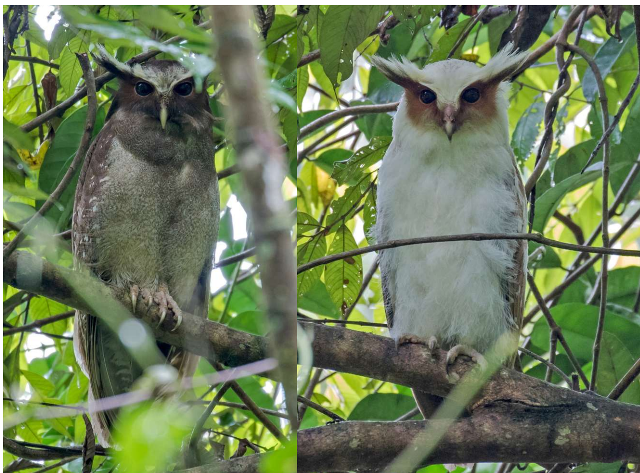
This adult and juvenile Crested Owl were a lovely last minute surprise! (Pete Morris)