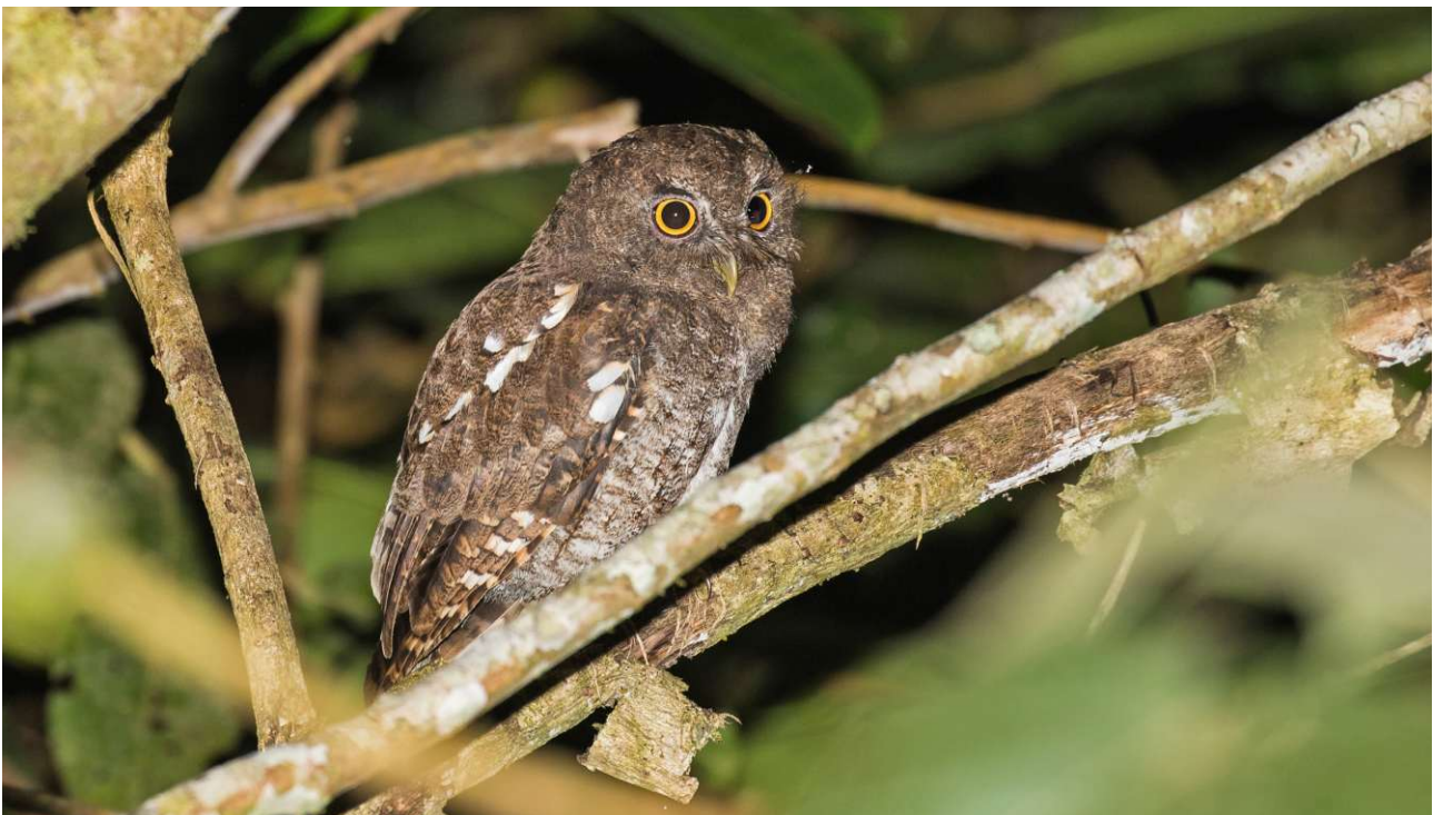
Napo Screech Owl gave stunning views!

Until very recently, one needed to make a rather demanding and difficult week long expedition in order to see the spectacular Scarlet-banded Barbet. Well, things have changed a little now, and, for us at least, even the drive to the new site wasn't that bad. Ok it was a bit muddy and a bit of fun, but we were there by lunchtime! During the interesting drive up to Plataforma we saw a few new trip birds including Ruddy Pigeon, Lesser Swallow-tailed Swift and Short-tailed Pygmy-Tyrant. As we approached Plataforma we stopped in the first areas of decent forest, and almost immediately dropped-in on some quality birds. First Blackish Pewees showed superbly and then a Grey-tailed Piha posed for all to admire. With the appetites whetted we continued to add more goodies including Violet-headed Hummingbird, Rose-fronted Parakeet, Blue-rumped (Milky-rumped) Manakin, and the poorly-known Red-billed Tyrannulet. And it wasn't too long before we located the holy grail. A fine group of Scarlet-banded Barbets growled at us from the canopy, offering spectacular scope views – once more high fives all round and plenty of smiles. We spent the rest of the afternoon and most of the following day