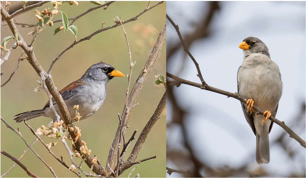
Two more 'good' finches: Little Inca Finch and the localized Cinereous Finch (Pete Morris)