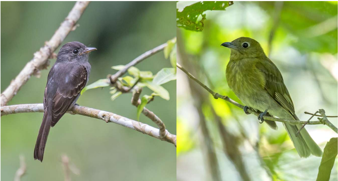
The rare Blackish Pewee and the elusive Grey-tailed Piha were two great birds at Plataforma

Until very recently, one needed to make a rather demanding and difficult week long expedition in order to see the spectacular Scarlet-banded Barbet. Well, things have changed a little now, and, for us at least, even the drive to the new site wasn't that bad. Ok it was a bit muddy and a bit of fun, but we were there by lunchtime! During the interesting drive up to Plataforma we saw a few new trip birds including Ruddy Pigeon, Lesser Swallow-tailed Swift and Short-tailed Pygmy-Tyrant. As we approached Plataforma we stopped in the first areas of decent forest, and almost immediately dropped-in on some quality birds. First Blackish Pewees showed superbly and then a Grey-tailed Piha posed for all to admire. With the appetites whetted we continued to add more goodies including Violet-headed Hummingbird, Rose-fronted Parakeet, Blue-rumped (Milky-rumped) Manakin, and the poorly-known Red-billed Tyrannulet. And it wasn't too long before we located the holy grail. A fine group of Scarlet-banded Barbets growled at us from the canopy, offering spectacular scope views – once more high fives all round and plenty of smiles. We spent the rest of the afternoon and most of the following day