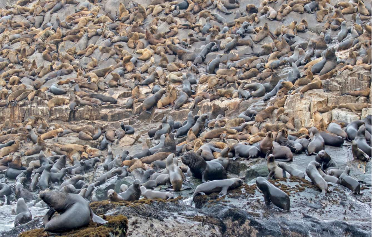
An incredible spectacle! Thousands of South American Sea Lions! (Pete Morris)