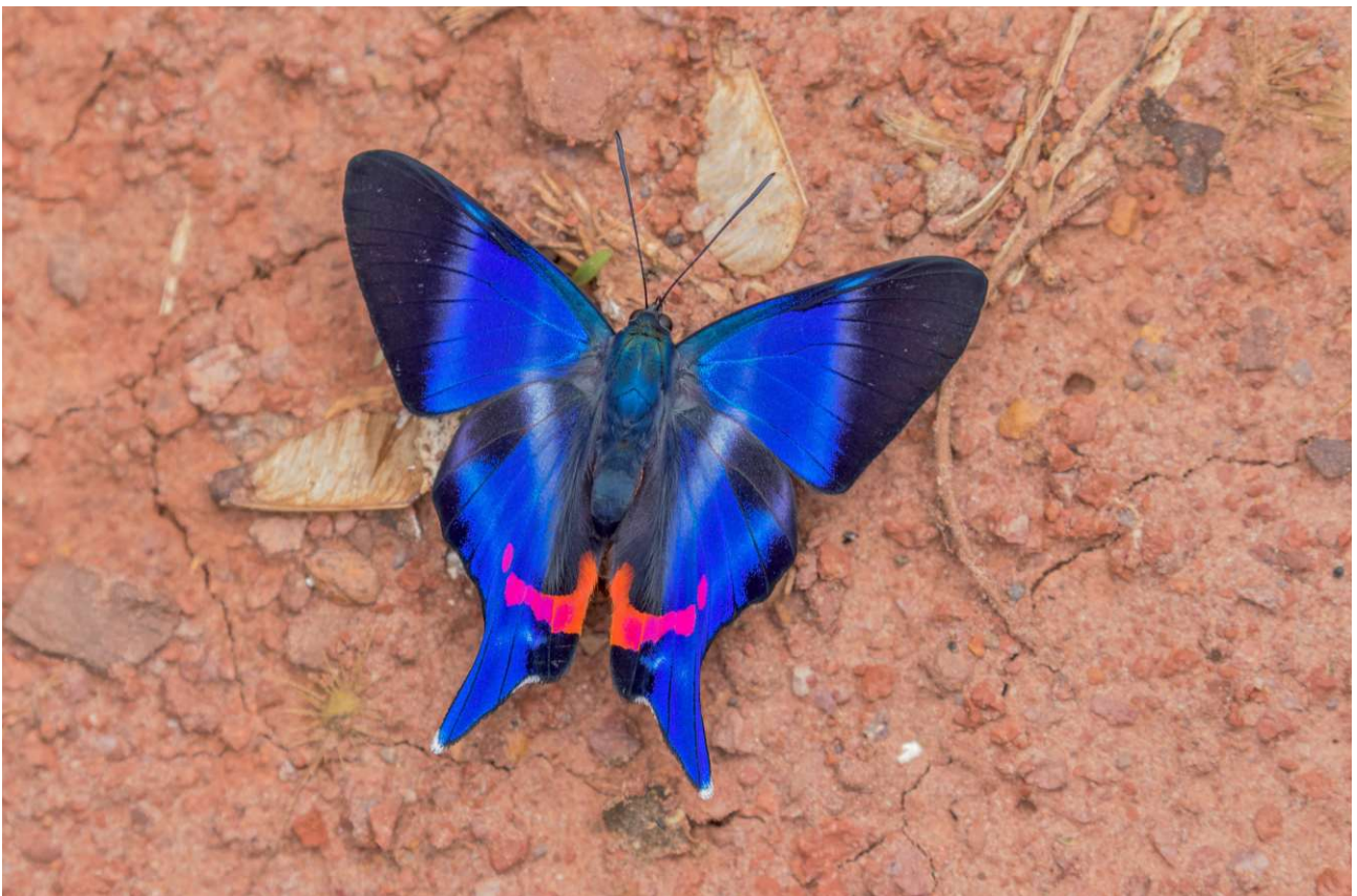
We saw many stunning moths and butterflies! Here's a Blue Doctor ( Rhetus dysonii) from Plataforma

I really struggled to identify the small opossum that we saw two nights running at the Fundo Alta Nieva reserve. This is the closest match I could come up with, but I am not totally sure.