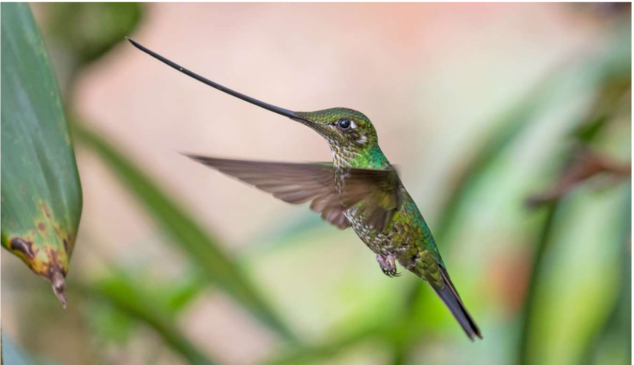
Sword-billed Hummingbird needs no words!

By the time we arrived back down to Leymebamba, it was nearly lunchtime, but we did manage to squeeze in a few more birds. Sword-billed Hummingbird, Rainbow Starfrontlet, our first Chestnut-breasted Coronets and Purple-throated Sunangels entertained around the feeders, Maroon-belted Chat-Tyrant and gorgeous Red-hooded Tanagers showed along the river, and, as we tucked into our lunch, we were delighted to find a male Andean Slaty Thrush and a pair of Rufous-winged Tyrannulets right under our noses!! It was then time to relax as we were driven to our overnight stop at Pomacochos, where, those that wished, sampled the traditional dish of cavy (a.k.a. guinea pig!). Delicious according to some!!