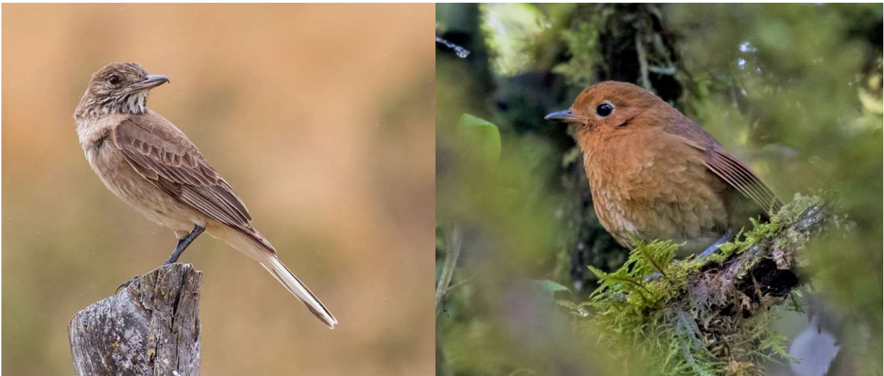
The Cajamarca area brought us White-tailed Shrike-Tyrants and Cajamarca (Rufous) Antpittas amongst others