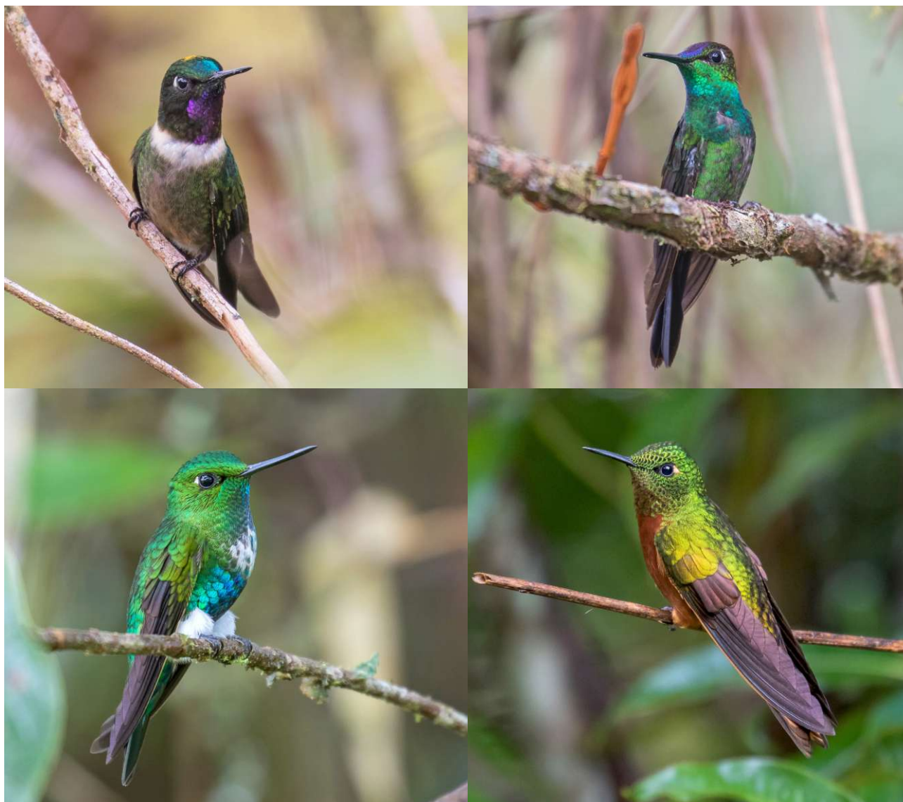
We enjoyed so many fabulous hummingbirds! Here, clockwise from top left, are: Amethyst-throated Sunangel; Violet-fronted Brilliant; Chestnut-breasted Coronet and the gorgeous Emerald-bellied Puffleg