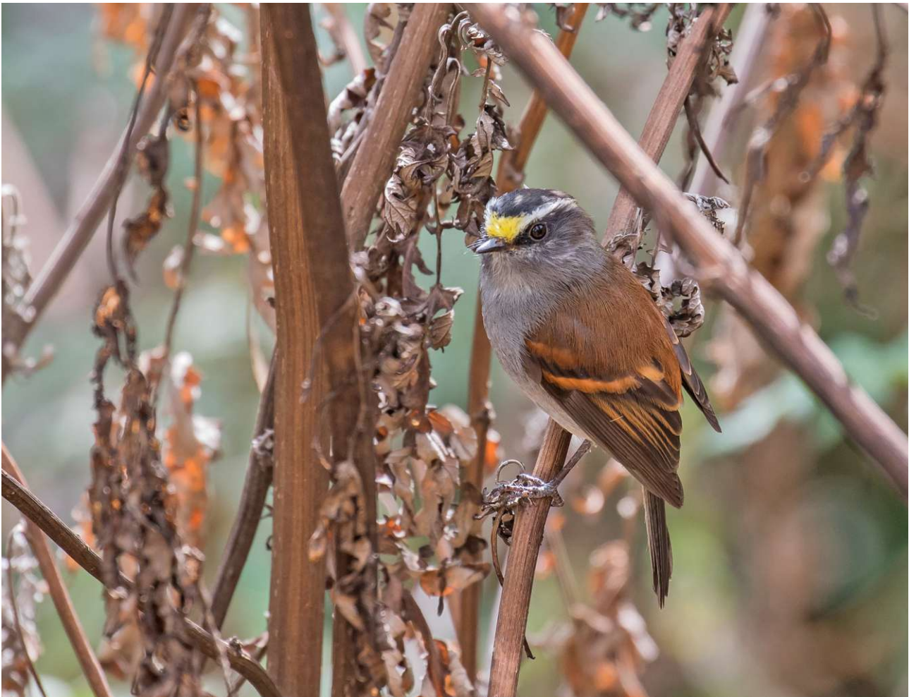
The fabulous Jelski's Chat-Tyrant was a welcome bonus at the Rio Chonta