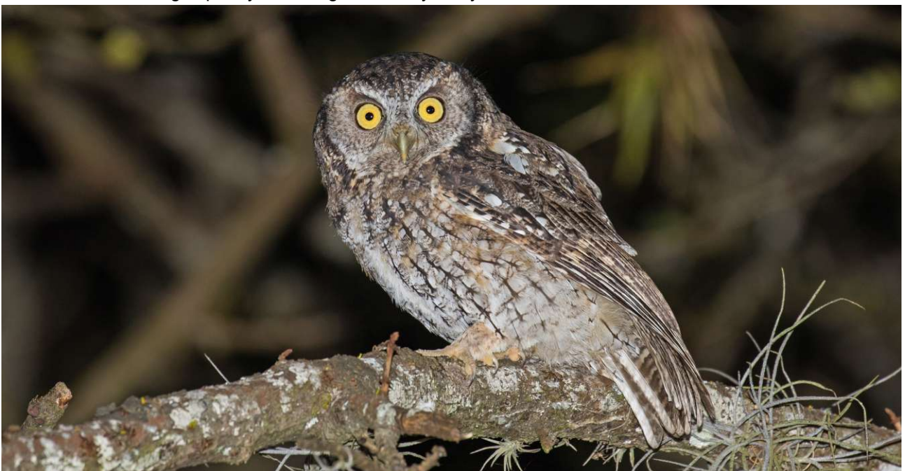
Oh no, not another owl! This one is the endemic Koepcke's Screech Owl