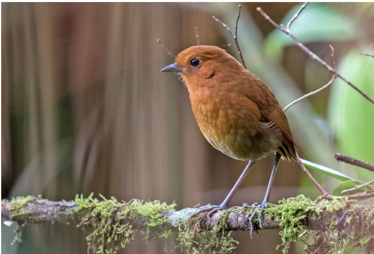
This gorgeous Chestnut Antpitta was a star at Abra Patricia!

White-plumed Antbird Pithys albifrons Good views of at least three near Tarapoto. A bit lastminute.com! [ peruvianus ]. Hairy-crested Antbird ◊ Rhegmatorhina melanosticta See note. Common Scale-backed Antbird Willisornis poecilinotus Excellent views of a female near Tarapoto [ lepidonota ]. Rufous-breasted Antthrush Formicarius rufipectus Several heard and one seen well to tape at Flor del Café [ thoracicus ]. Barred Antthrush Chamaeza mollissima (H) Heard distantly at Abra Patricia [nominated]. Scaled Antpitta Grallaria guatemalensis (H) One heard at dusk at Flor del Café, Plataforma [ sororia ]. Chestnut-crowned Antpitta Grallaria ruficapilla (H) Heard at several sites, but no sightings [ albiloris ]. Pale-billed Antpitta ◊ Grallaria carrikeri (NT) Brilliant views of c4 birds above San Lorenzo. Real megas! Rusty-tinged Antpitta ◊ Grallaria przewalskii (VU) Good views for some of one at San Lorenzo. Many more heard. Rufous (or Fulvous) Antpitta ◊ Grallaria [rufula] obscura Excellent views, for most, of one above Abra Barra Negro. Rufous (or Cajamarca) Antpitta ◊ Grallaria [rufula] cajamarcae See note. Chestnut Antpitta ◊ Grallaria blakei (NT) Brilliant views of one at Abra Patricia and a couple of others heard there.