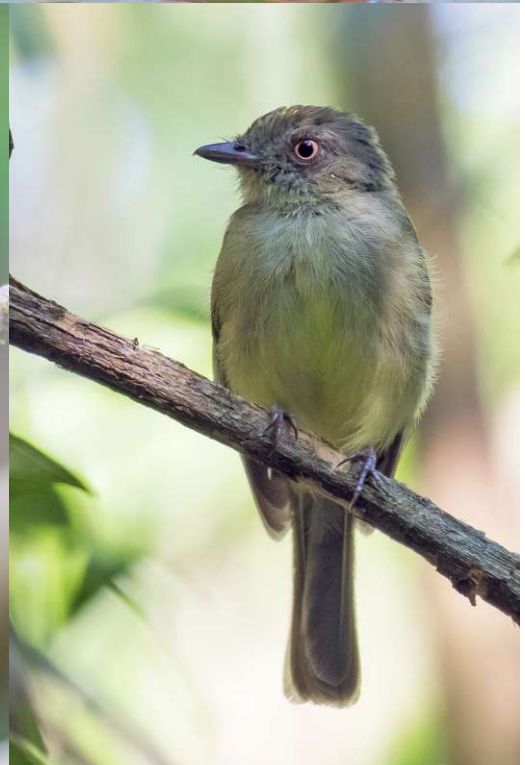
Some rather random highlights! Masked Duck, Long-tailed Sylph and Sulphur-bellied Tyrant-Manakin (Pete Morris)