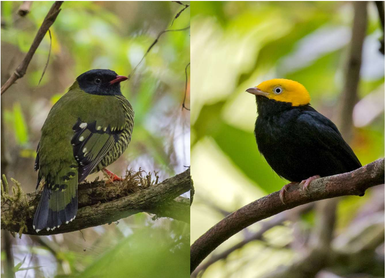
Another couple of crackers! Barred Fruiteater and Golden-headed Manakin

Sooty-crowned Flycatcher ◊ Myiarchus phaeocephalus Good views of one at Quebrada Frejolillo [nominate]. Brown-crested Flycatcher Myiarchus tyrannulus A few seen, the first at Gotas de Agua, Jaen [nominate]. Red-crested Cotinga Ampelion rubrocristatus Three seen, the first two at the top of the Balsas Canyon. Peruvian Plantcutter ◊ Phytotoma raimondii (EN) Great views of three at Bosque Rafan. Green-and-black Fruiteater Pipreola riefferii Quite common around Abra Patricia [ chachapoyas ]. Barred Fruiteater Pipreola arcuata Excellent views of a pair above San Lorenzo [nominate]. Fiery-throated Fruiteater ◊ Pipreola chlorolepidota (NT) A male and then a female seen well by most at Waqanki Lodge. Scaled Fruiteater ◊ Ampelioides tschudii Superb views of a stunning female at Afluente.