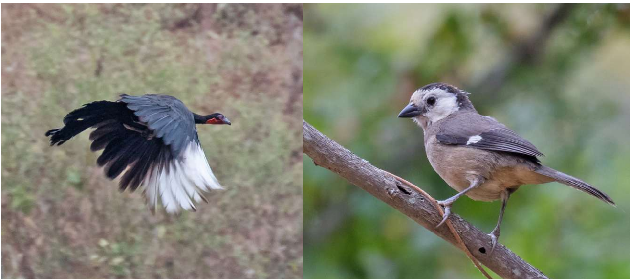
White-winged Guan and White-headed Brushfinch both showed very well

Meanwhile, Gunnar and Marcell were doing a sterling job. Having driven back down to Chiclayo and picked up our two remaining clients, they guided them through an action packed day, finding all of the key birds so far including Peruvian Plantcutter, Rufous Flycatcher, White-winged Guan, Tumbes Flycatcher and Tumbes Hummingbird, as well as an excellent supporting cast. Finally, we sat down for a meal together, the group complete!!