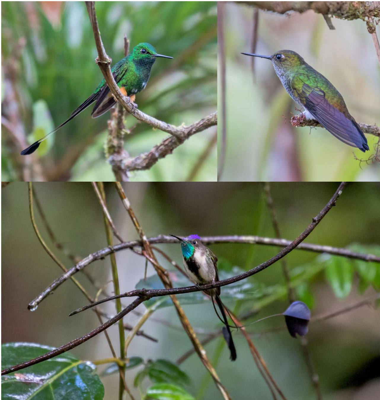
More brilliant hummingbirds! Booted Racket-tail, white-thighed form of Buff-thighed Puffleg and the amazing Marvellous Spatuletail

Marvellous Spatuletail ◊ Loddigesia mirabilis (EN) Brilliant views of at least two stunning males and a female at Huembo.