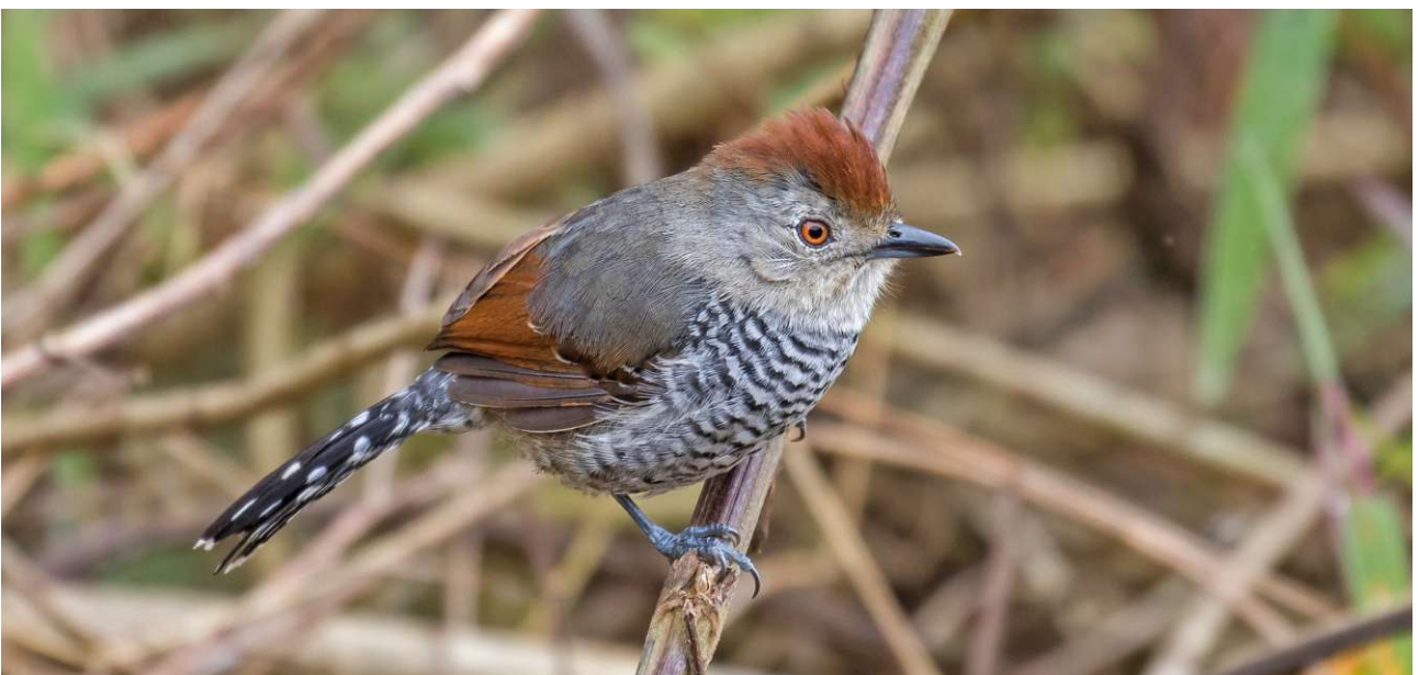
The delightful Rufous-capped Antshrike

The following day was to be a 'big one' as a potentially tough walk lay between us and our quarry – the spectacular Pale-billed Antpitta. A pair of White-throated Screech Owls got the adrenalin going even before first light, and as it turned out, the uphill slog was nowhere near as bad as we had been led to believe, and all made it comfortably, all enjoying spectacular views of this excellent antpitta at close range! As we poked around in the bamboo, we found a number of other interesting species, including Lacrimose Mountain Tanagers, colour-