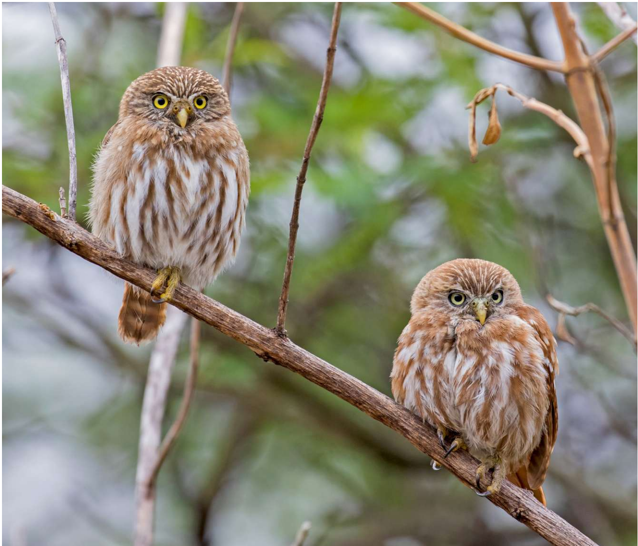
There are few owls as common, as easy to see, and as cute as the Pacific Pygmy Owl!! (Pete Morris)

Crested Owl Lophostrix cristata Brilliant views of a stunning adult and juvenile at roost near Tarapoto [nominate]. Spectacled Owl Pulsatrix perspicillata (H) Heard quite distantly near to Waqanki Lodge [nominate]. Band-bellied Owl ◊ Pulsatrix melanota Excellent spotlight views of a pair at Waqanki Lodge. Ferruginous Pygmy Owl Glaucidium brasilianum Singles near to Waqanki Lodge and at Flor del Café [ucayalae]. Pacific Pygmy Owl Glaucidium peruanum Amazingly common and easy - more than 20 noted, the first at Casupe.