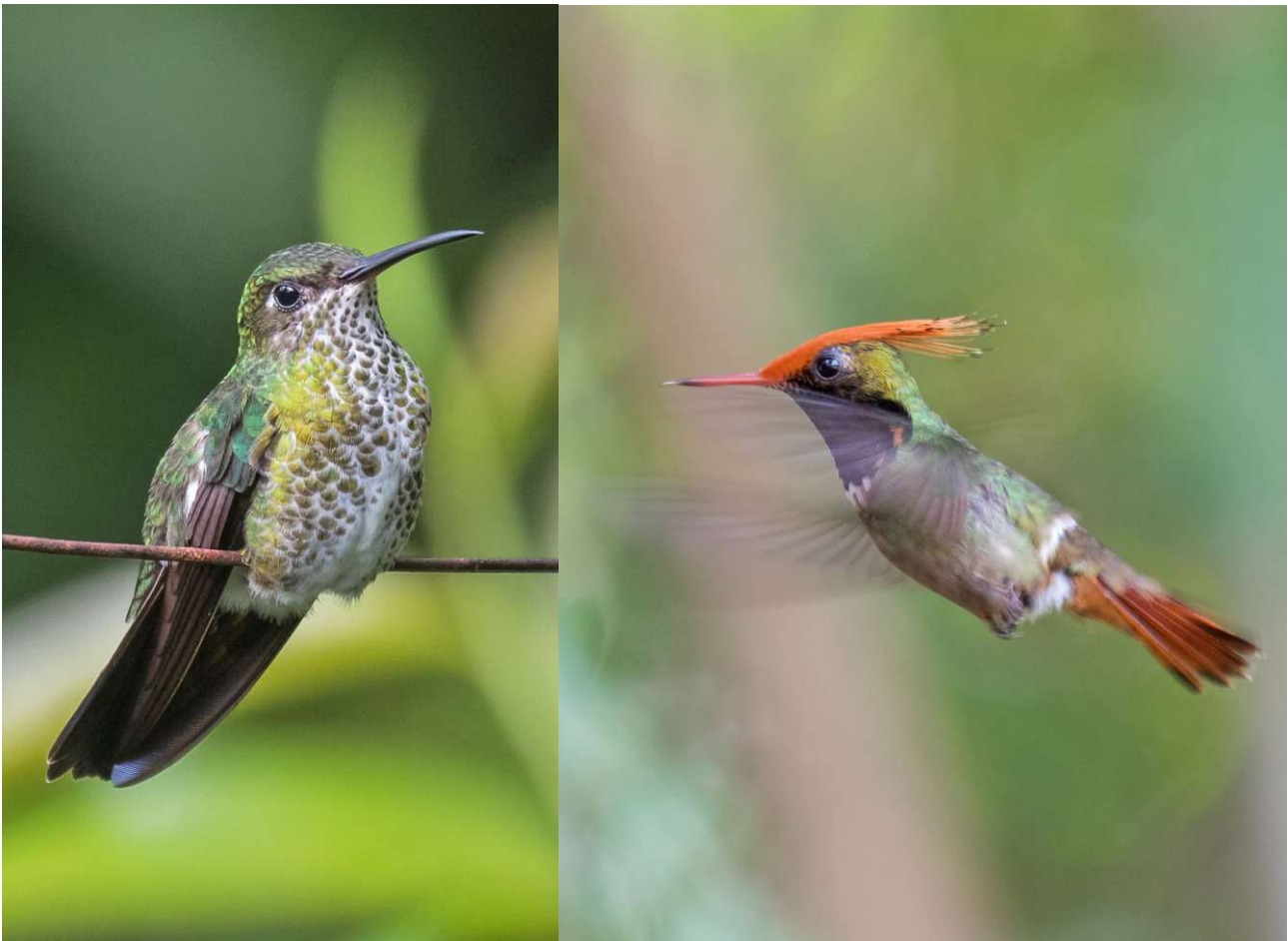
Many-spotted Hummingbird and the brilliant Rufous-crested Coquette (Pete Morris)

Blue-tailed Emerald Chlorostilbon mellisugus Just three, the first couple at Aguas Verdes [ peruanus ]. Fork-tailed Woodnymph Thalurania furcata Quite common. First seen at the feeders at Aguas Verdes [ viridipectus ]. White-chinned Sapphire Hylocharis cyanus Singles at Quebrada Upaquiuhua on two dates [ rostrata ]. Golden-tailed Sapphire Chrysuronia oenone Common at several feeders, first at Aguas Verdes [ josephinae ]. Tumbes Hummingbird ◇ Leucippus baeri Great views of several at Quebrada Frejolillo. Spot-throated Hummingbird ◇ Leucippus taczanowskii Quite a good number seen, the first at Abra Porculla. Many-spotted Hummingbird ◇ Taphrospilus hypostictus Great views of several at the feeders at Aguas Verdes. White-bellied Hummingbird Amazilia chionogaster A few seen, the first at the feeders at Leymebamba.