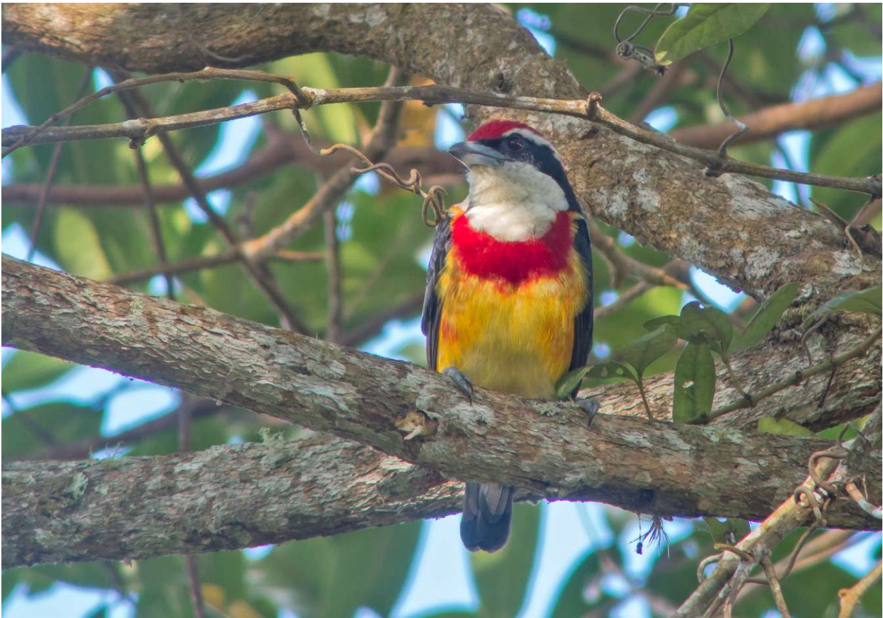
Scarlet-banded Barbet - another of the tour's 'signature birds', and what a bird! (Pete Morris)