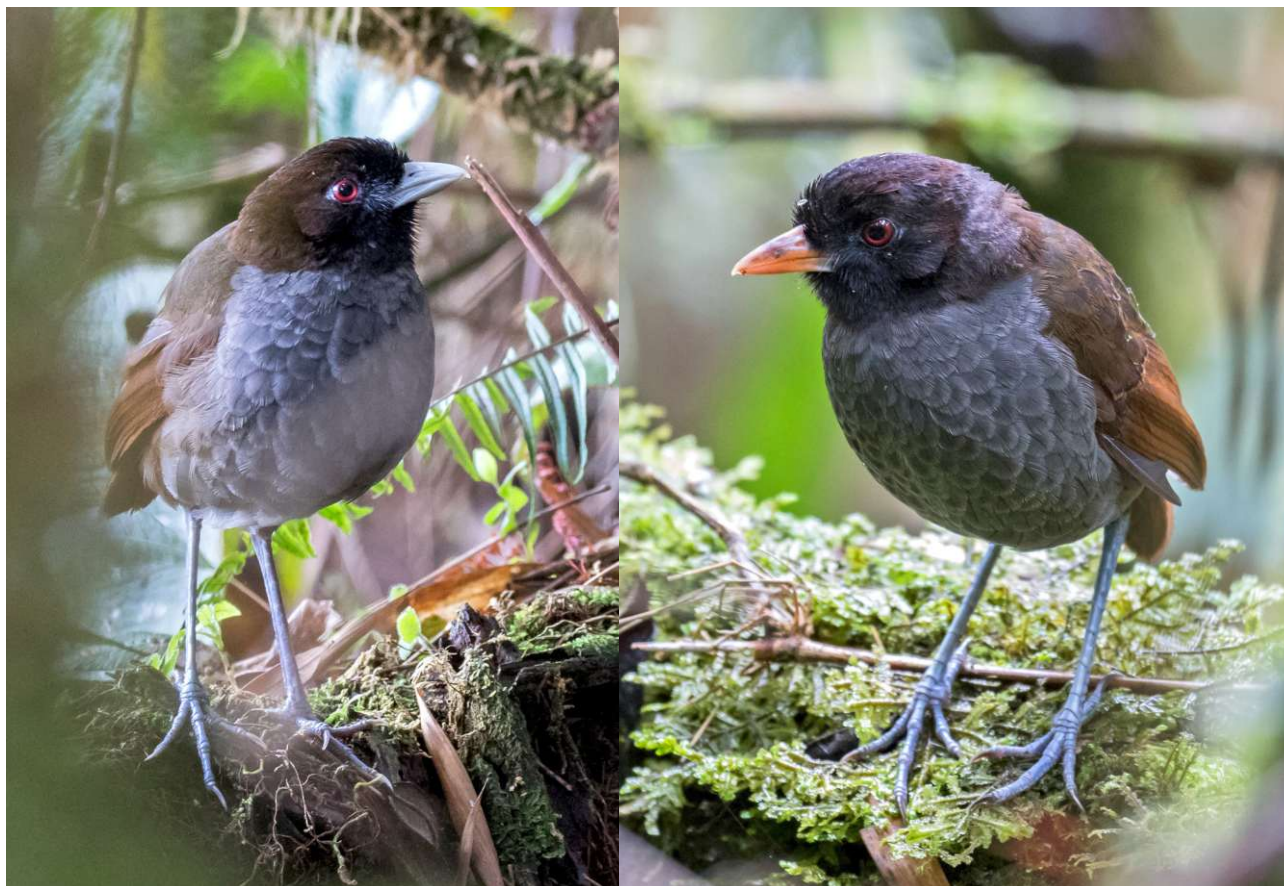
Pale-billed Antpittas (adult left and juvenile) gave us an outstanding performance!

ful Grass Green Tanagers and, for some, the charismatic Plushcap. Songs led us into the understory and here we unearthed Rufous-capped Antshrikes, Ash-colored Tapaculos, a fine Golden-browed Chat-Tyrant and a lovely pair of Barred Fruiteaters, whilst out in the more open areas we enjoyed a pair of Crimson-mantled Woodpeckers and several Violet-throated Starfrontlets. On the walk down we made the first of several concerted efforts to see the elusive Rusty-tinged Antpitta, and although we met with some success, some gaining good views, it eluded some of us, a theme that sadly continued with this tricky species.