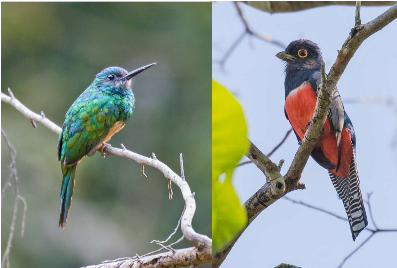
Two splashes of colour! Bluish-fronted Jacamar and Blue-crowned Trogon (Pete Morris)