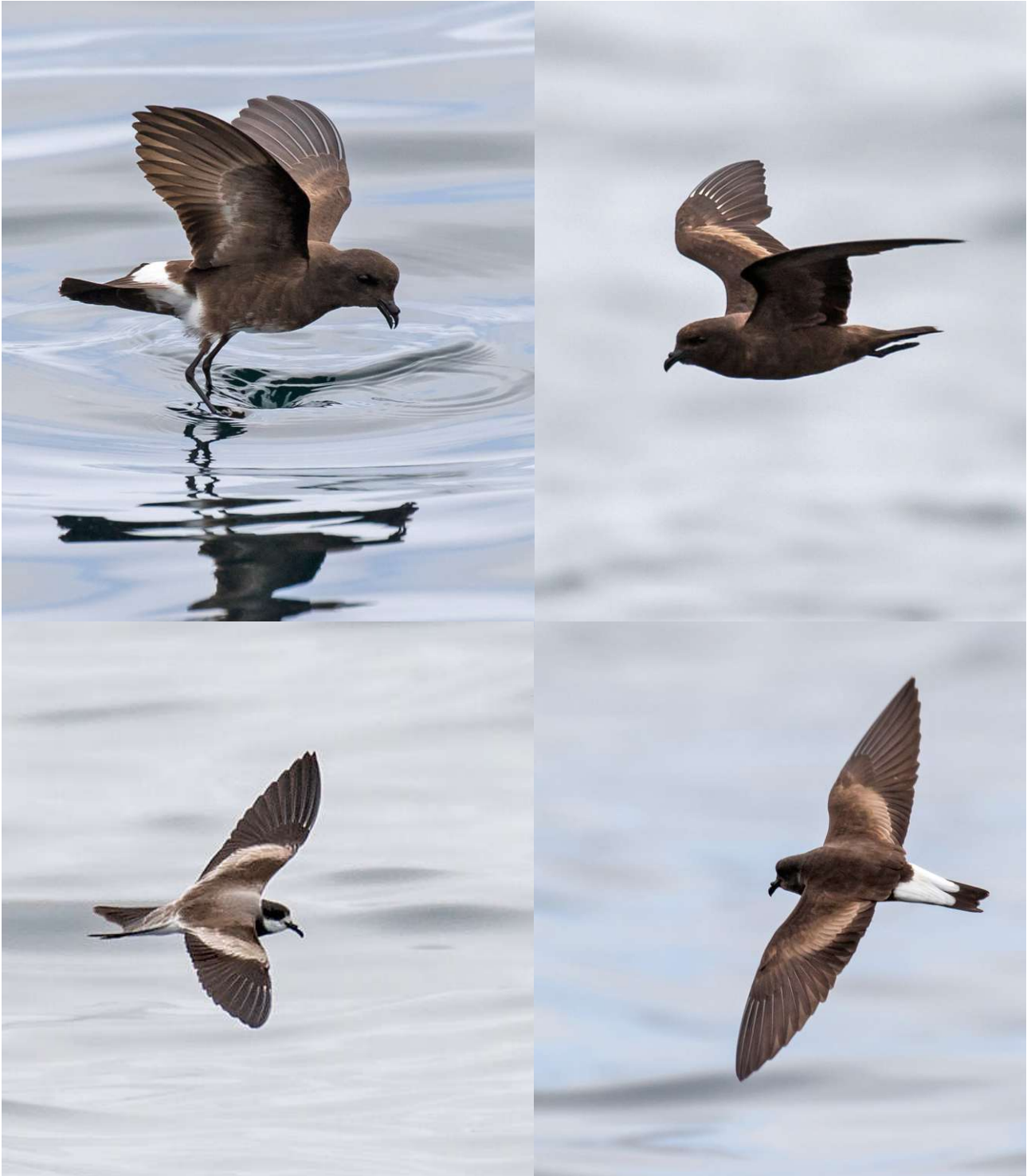
The pelagic was storm petrel heaven! Clockwise from top left: Elliot's; Black; Wedge-rumped and Hornby's Storm Petrels

For some that was it, but for the majority of the group, by special request, we had laid on an additional couple of days to allow us to make a pelagic into the cool waters of the Humboldt current. We assembled at the harbour where a ridiculous number of Franklin's Gulls were present, and boarded our spacious vessel. As we headed out to sea, we soon found good numbers of Peruvian Boobies and Guanay Cormorants followed by Elliot's Storm Petrels and Sooty Shearwaters, and it soon became apparent that many migrants were present including good numbers of Pomarine and Long-tailed Skuas, Sabine's Gulls and both Red and Red-necked Phalaropes. As we started chumming we attracted in excellent numbers of Elliot's Storm Petrels, and these