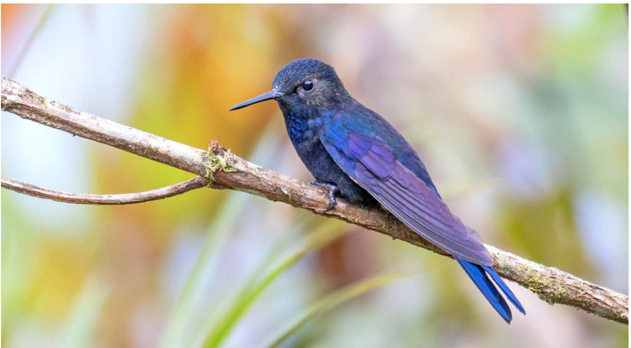
Royal Sunangel. There aren't too many blue hummingbirds!

around the lodge and on the adjacent trails and road. Here, feeders held Fawn-breasted Brilliants, Collared Incas and Emerald-bellied Pufflegs, bold Tayras and Black Agoutis raided the fruit, and other highlights included some confiding White-throated Quail-doves, a female Swallow-winged Nightjar, Black-throated Toucanets, Streak-headed Antbirds, a wonderful Chestnut Antpitta, the endemic Rufous-vented Tapaculo, Peruvian Tyrannulet, Ornate Flycatcher, Black-throated Tody-Tyrant, numerous Green-and-black Fruiteaters, a smart pair of White-collared Jays, Sepia-brown Wren and Andean Solitaire. A little lower, another reserve held a surprise Greater Ani (a reserve first, what was it doing so high?!) as well as Buff-thighed Puffleg, buff-booted Booted Racket-tails, White-bellied Woodstars and a confiding Spotted Barbtail. Lower along the road, White-capped Dippers were found along the river, Sickie-winged Guans gorged on fruit and stunning Golden-headed Quetzals sang by the road as did sneaky Northern White-crowned Tapaculos. Mixed flocks held Versicoloured Barbets, Rufous-rumped Antwrens, Inca Flycatchers, migrant Cerulean and Blackburnian Warblers, Bronze-green Euphonia and stunning Vermillion Tanagers. Indeed the whole area was great for tanagers, and over