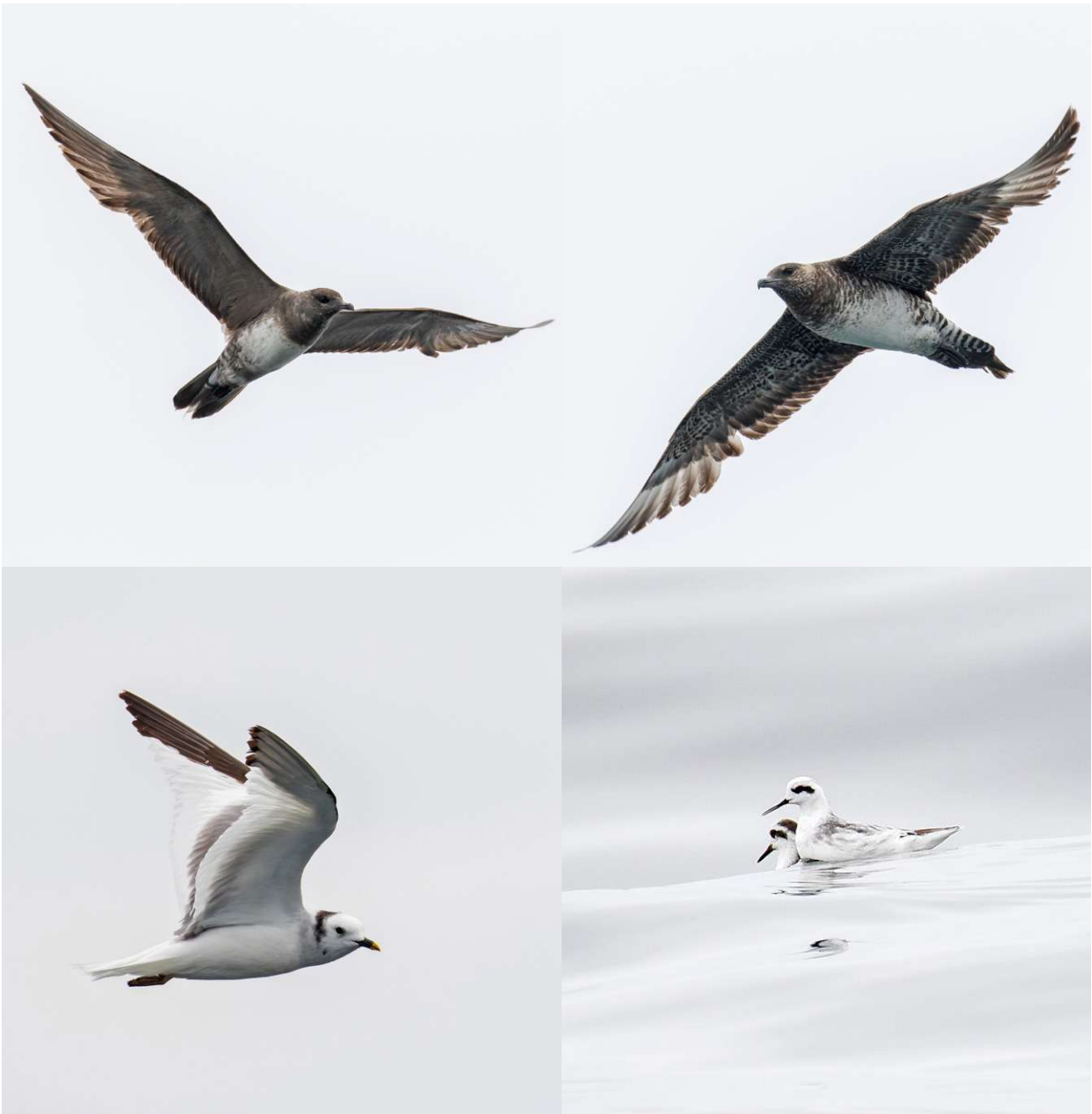
Migrants included Long-tailed (left) and Pomarine Skuas, Sabines Gull and Red (behind) and Red-necked Phalaropes

ed the boat, and another visitor from the Galapagos, Swallow-tailed Gull also put in many appearances, even occasionally joining the Sabine's Gulls, appearing like giant versions! Other species included numerous White-chinned Petrels, Pink-footed Shearwaters and a Chilean Skua, and on the way back we saw several Peruvian Diving Petrels. Common Bottle-nosed and Dusky Dolphins entertained, and closer to the coast we visited some islands where we enjoyed our first views of the endemic Peruvian Seaside Cinclodes as well as brilliant views of breeding seabirds including colourful Peruvian Pelicans and Red-legged Cormorants, amazing Inca Terns, Peruvian Boobies, a lone Blue-footed Booby and smart Humboldt Penguins alongside thousands of South American Sea-Lions. Back in the harbour, we had a quick look at some Surfbirds and Blackish Oystercatchers.