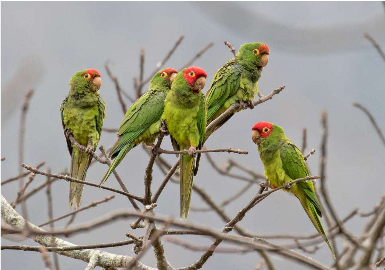
Red-masked Parakeets showed wonderfully at Quebrada Frejolillo (Pete Morris)