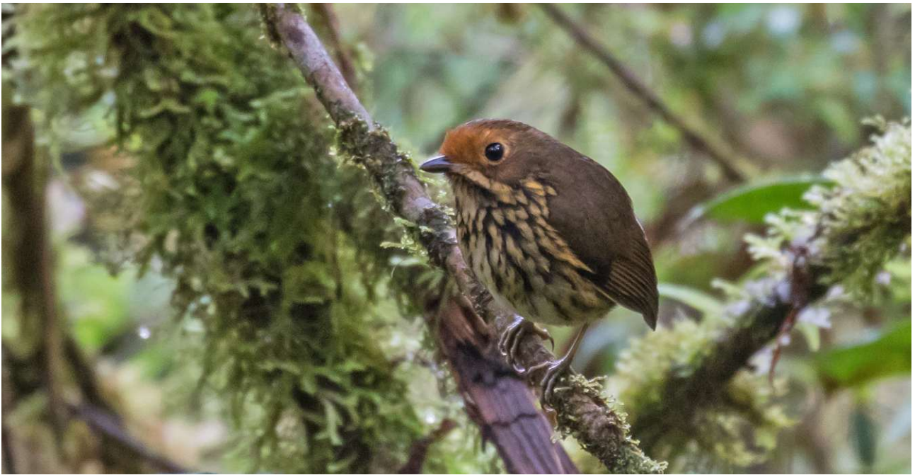
The brilliant Ochre-fronted Antpitta was another favourite (Pete Morris)

around the lodge and on the adjacent trails and road. Here, feeders held Fawn-breasted Brilliants, Collared Incas and Emerald-bellied Pufflegs, bold Tayras and Black Agoutis raided the fruit, and other highlights included some confiding White-throated Quail-doves, a female Swallow-winged Nightjar, Black-throated Toucanets, Streak-headed Antbirds, a wonderful Chestnut Antpitta, the endemic Rufous-vented Tapaculo, Peruvian Tyrannulet, Ornate Flycatcher, Black-throated Tody-Tyrant, numerous Green-and-black Fruiteaters, a smart pair of White-collared Jays, Sepia-brown Wren and Andean Solitaire. A little lower, another reserve held a surprise Greater Ani (a reserve first, what was it doing so high?!) as well as Buff-thighed Puffleg, buff-booted Booted Racket-tails, White-bellied Woodstars and a confiding Spotted Barbtail. Lower along the road, White-capped Dippers were found along the river, Sickie-winged Guans gorged on fruit and stunning Golden-headed Quetzals sang by the road as did sneaky Northern White-crowned Tapaculos. Mixed flocks held Versicoloured Barbets, Rufous-rumped Antwrens, Inca Flycatchers, migrant Cerulean and Blackburnian Warblers, Bronze-green Euphonia and stunning Vermillion Tanagers. Indeed the whole area was great for tanagers, and over