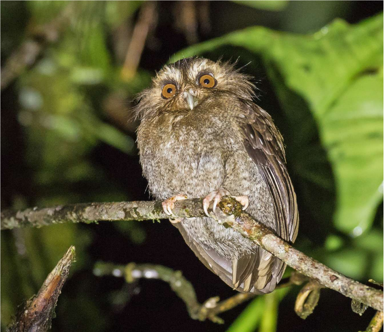
The superb Long-whiskered Owlet - our inevitable bird-of-the-trip! (Pete Morris)