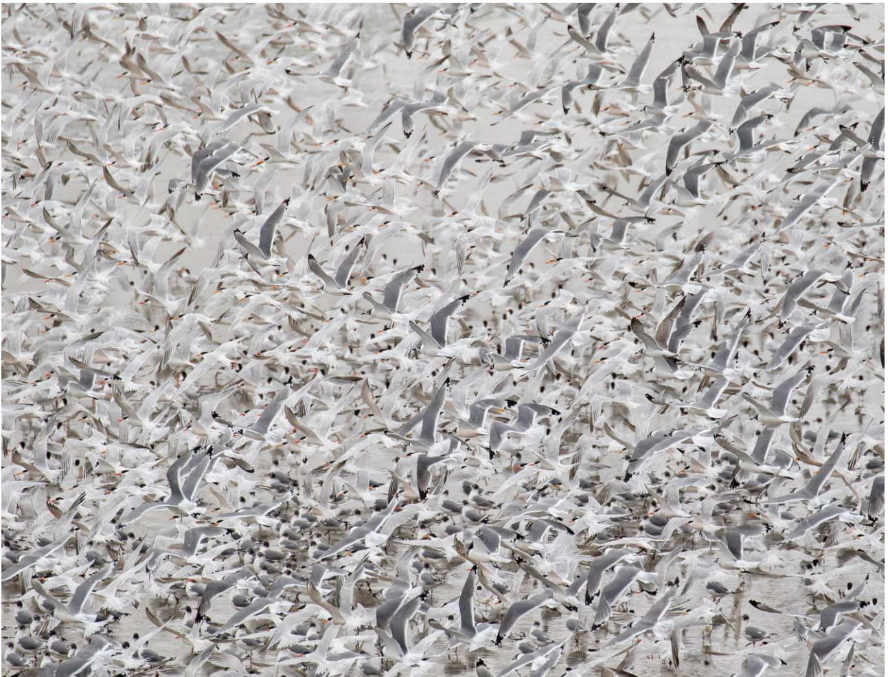
The Lima area held ridiculous numbers of Franklin's Gulls and Elegant Terns