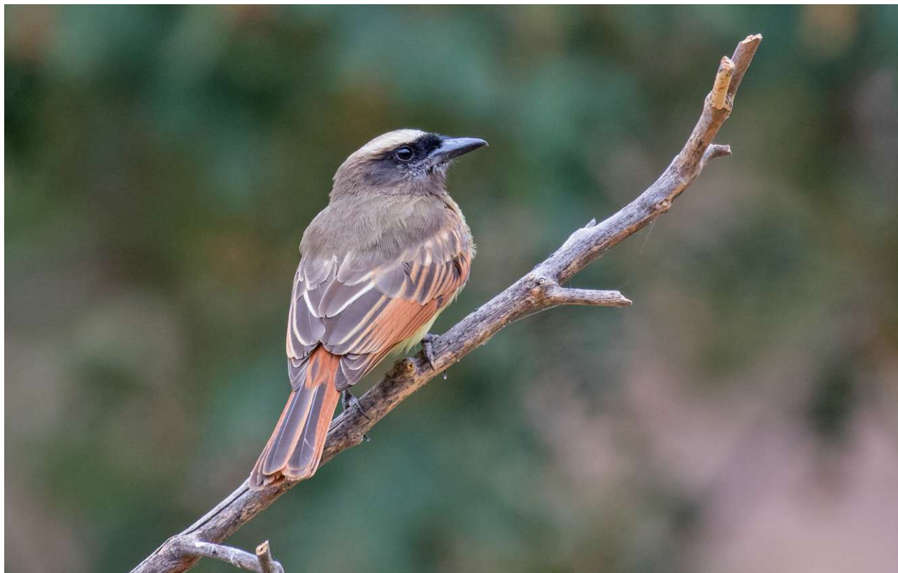
The localized Baird's Flycatcher was seen well on several occasions (Pete Morris)