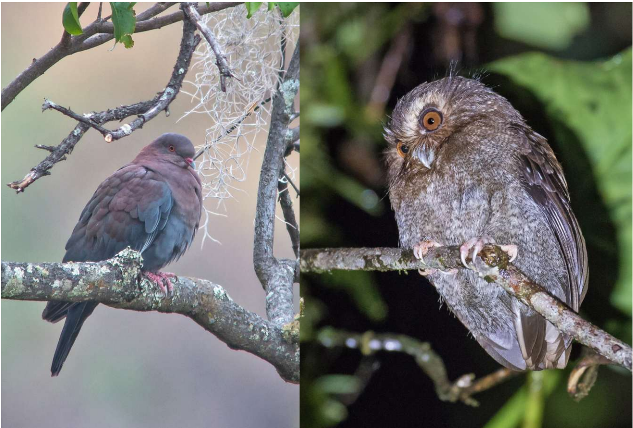
The endemic Maranon Pigeon and another view of the Long-whiskered Owlet (Pete Morris)