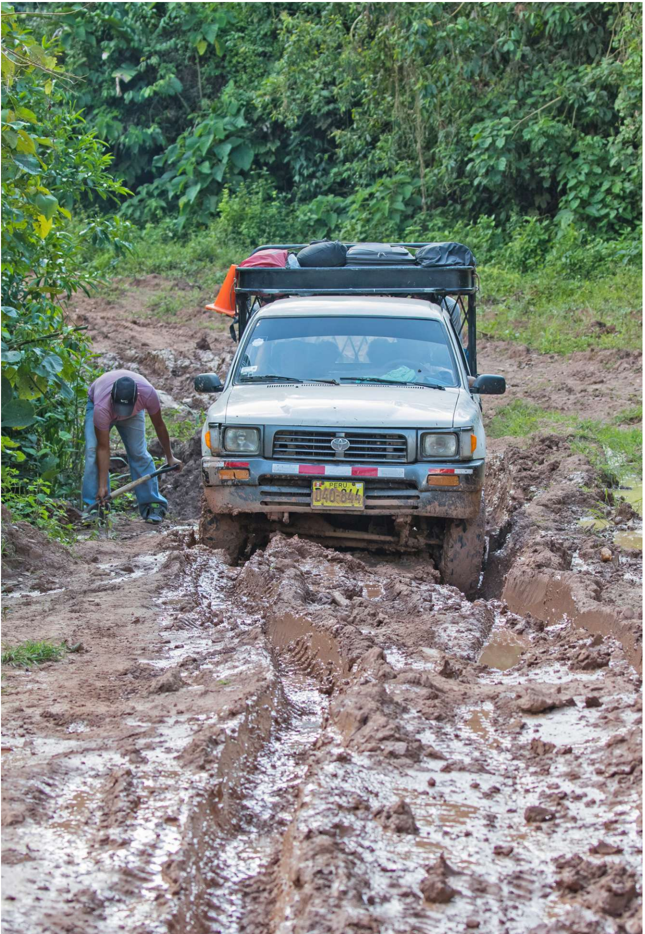
In case you needed a reminder, this was the road to the Scarlet-banded Barbets. Fun though!! (Pete Morris)