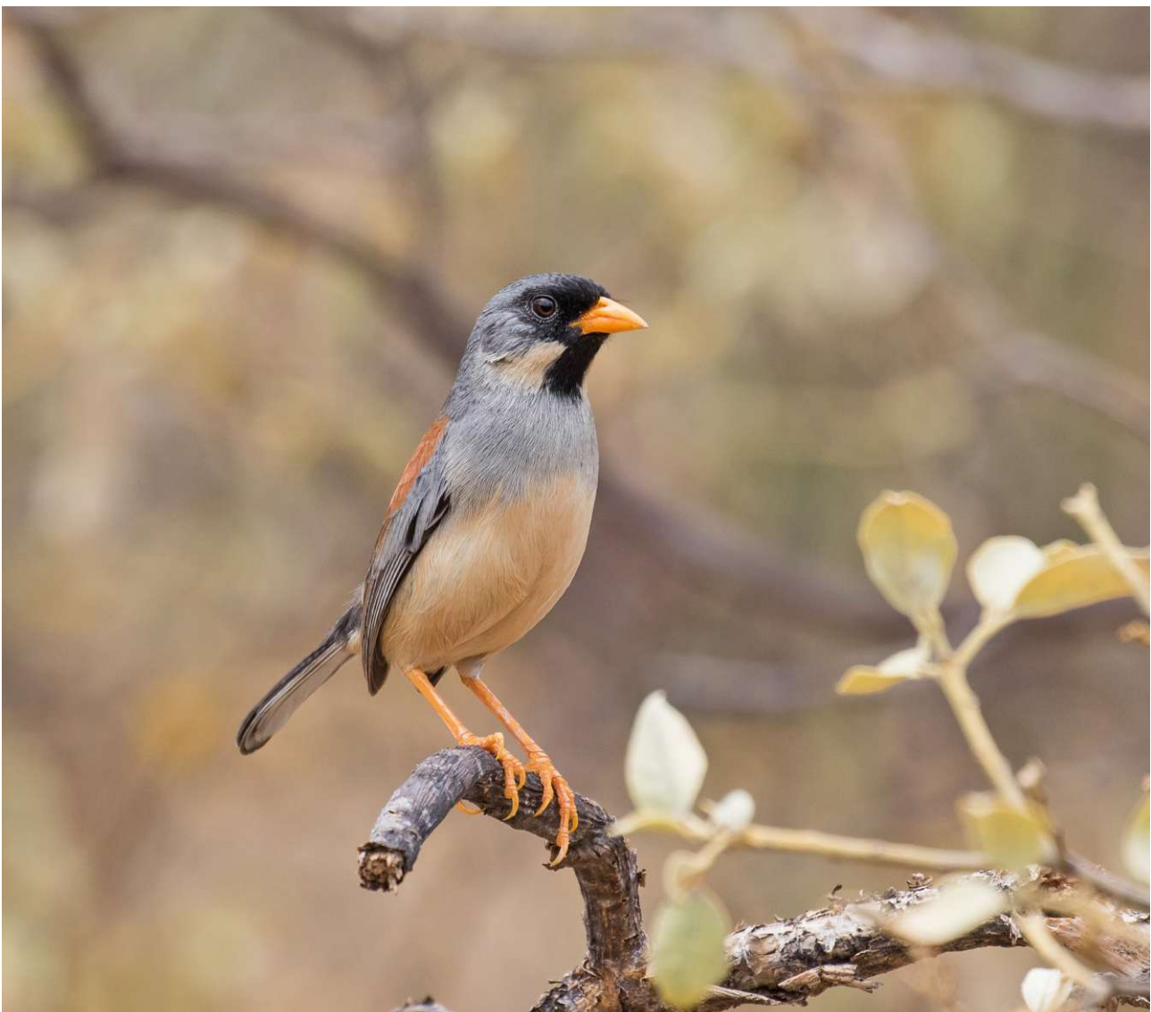
The stunning little Buff-bridled Inca Finch was another favourite (Pete Morris)