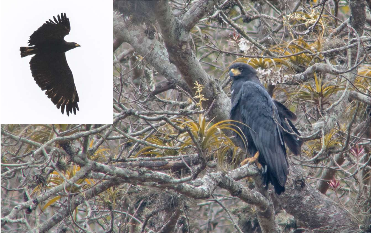
(Montane) Solitary Eagle was a fantastic bonus!

Tumbes Hummingbirds were pleasingly common, whilst the thicker scrub held Necklaced Spinetails, delightful Elegant Crescentchest, another colourful Tumbes Tyrant, a subtle Sooty-crowned Flycatcher, numerous Tumbes and Black-capped Sparrows and great flocks of White-headed Brush Finches. On the drive out we stopped to admire some rather large gatherings of superb Peruvian Thick-knees as well as more Cinereous Finches. That afternoon was somewhat quiet, though we did manage some fine views of a Spotted Rail as well as a flock of Chestnut-throated Seedeaters and several entertaining Pacific Pygmy Owls.