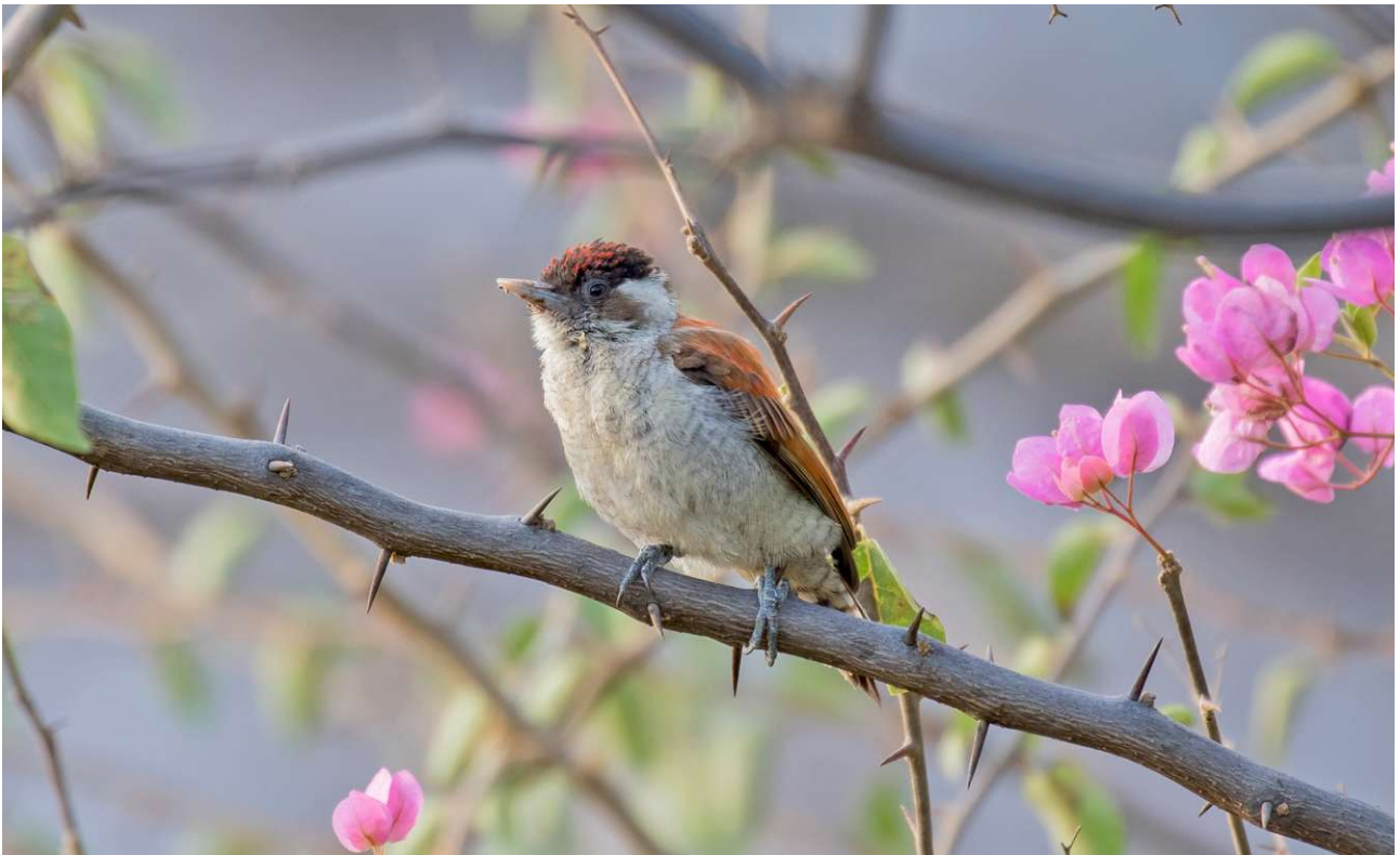
Several smart little Scarlet-backed Woodpeckers entertained us in the northwest (Pete Morris)