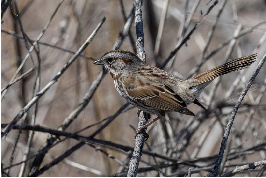
Song Sparrow