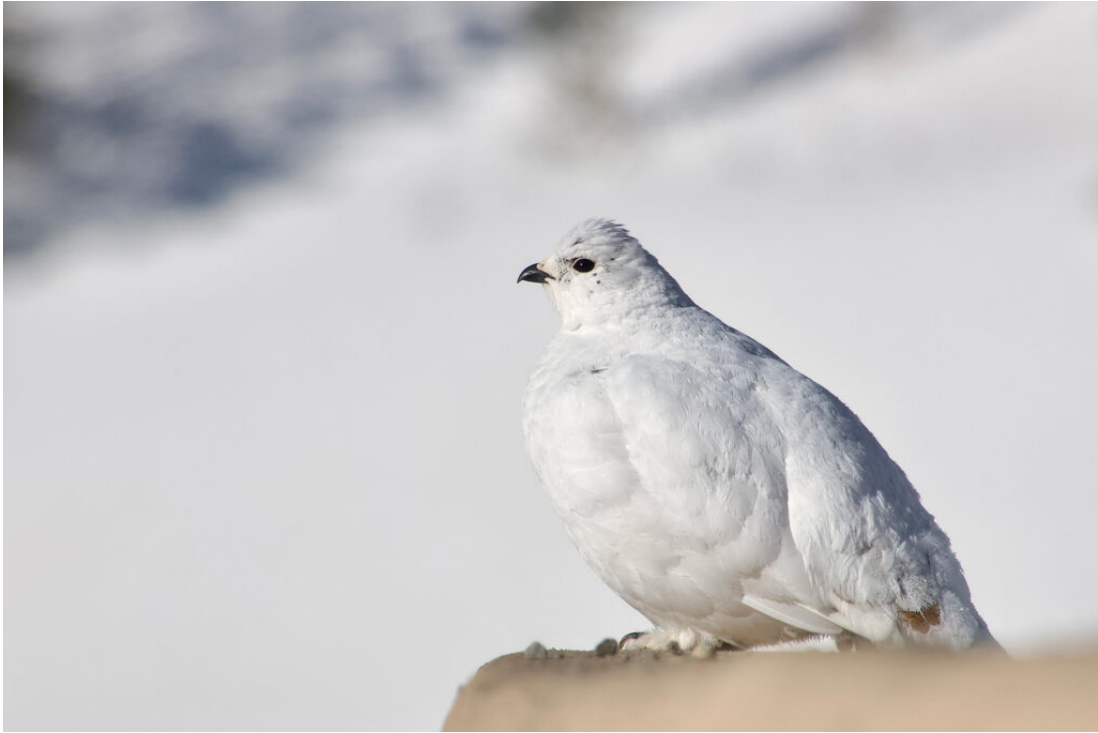
White-tailed Ptarmigan