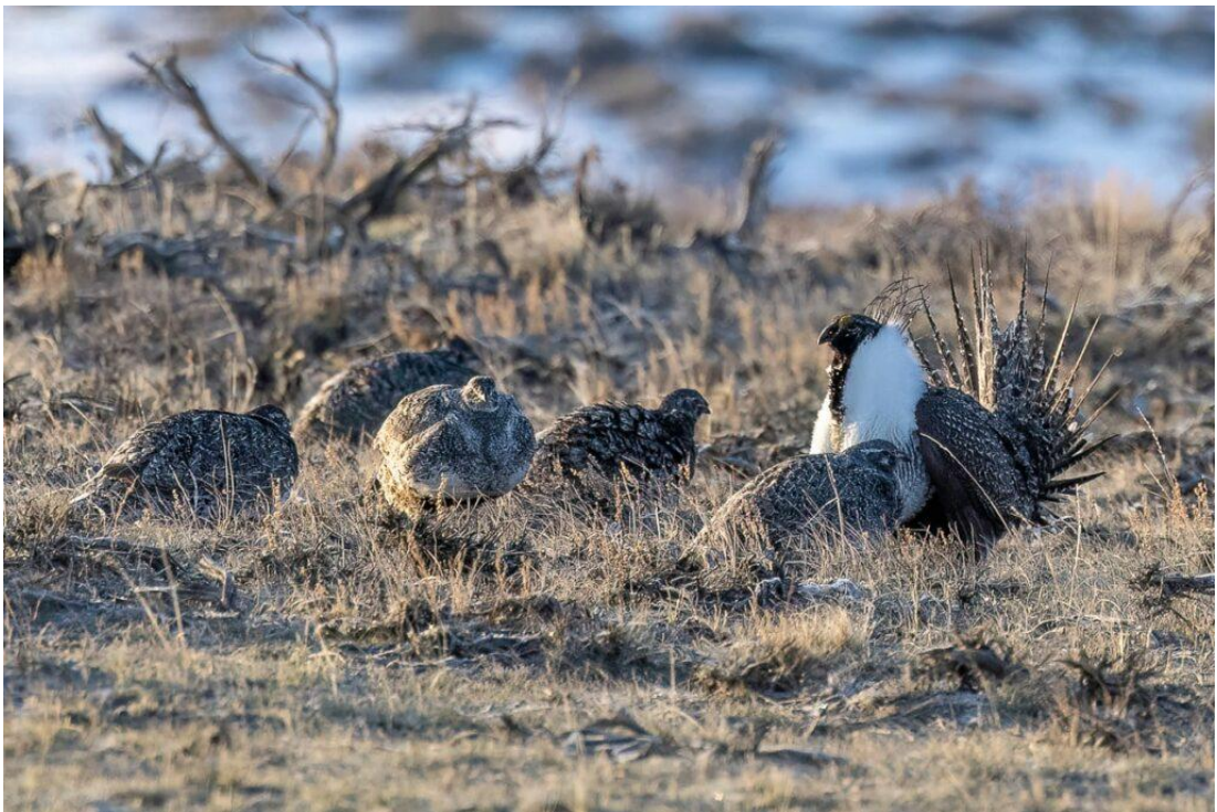
Sage Grouse