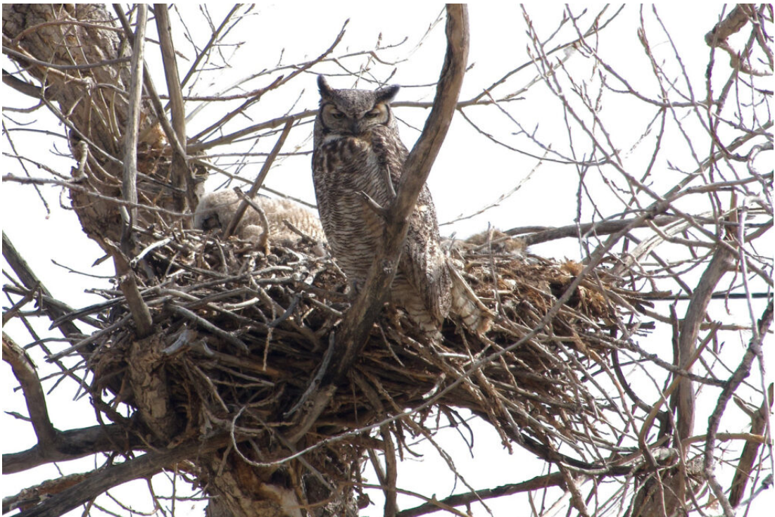
Great Horned Owl