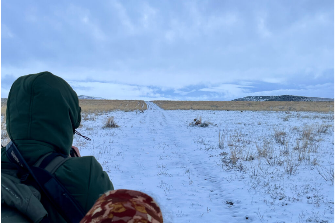
Watching lekking Sharp-tailed Grouse