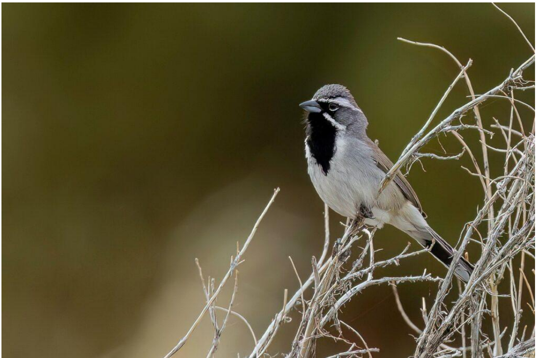
Black-throated Sparrow