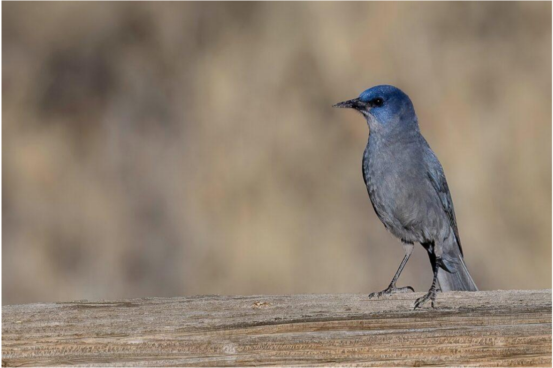
Pinyon Jay