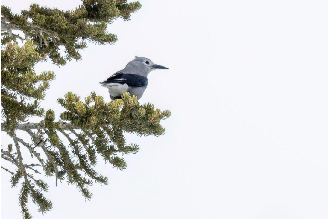
Clark's Nutcracker