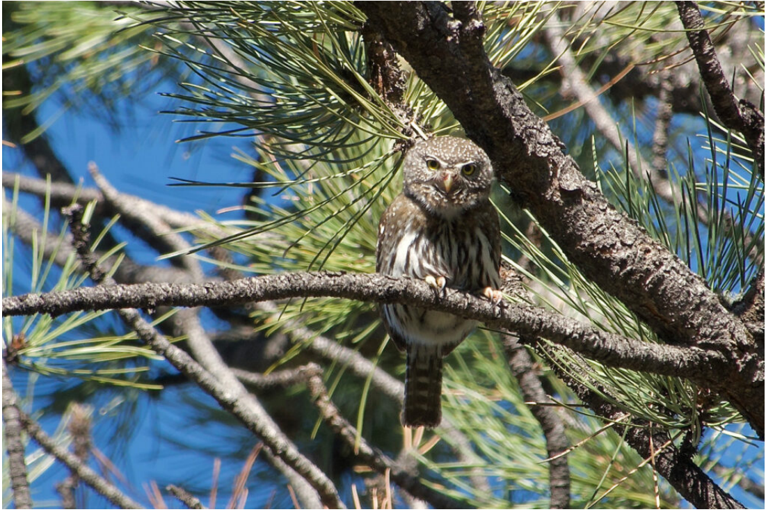
Northern Pygmy Owl