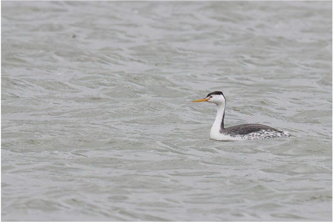
Clark's Grebe