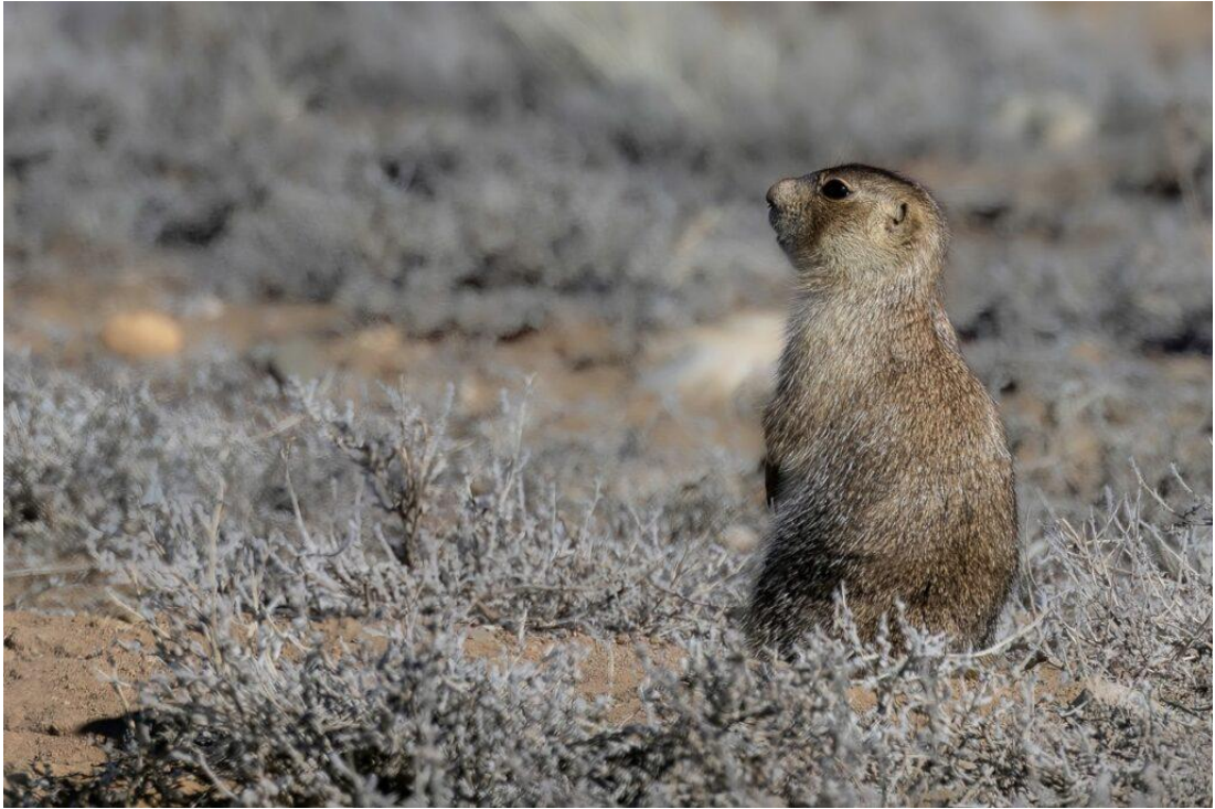
Gunnison's Prairie Dog