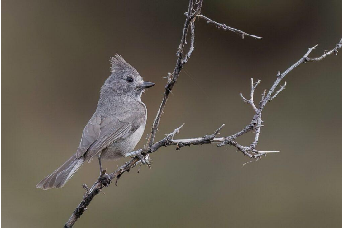
Juniper Titmouse