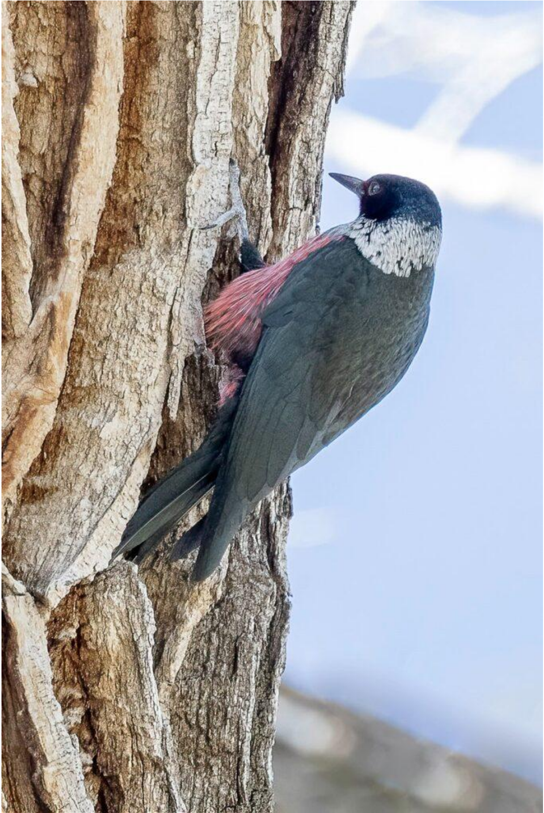
Lewis's Woodpecker