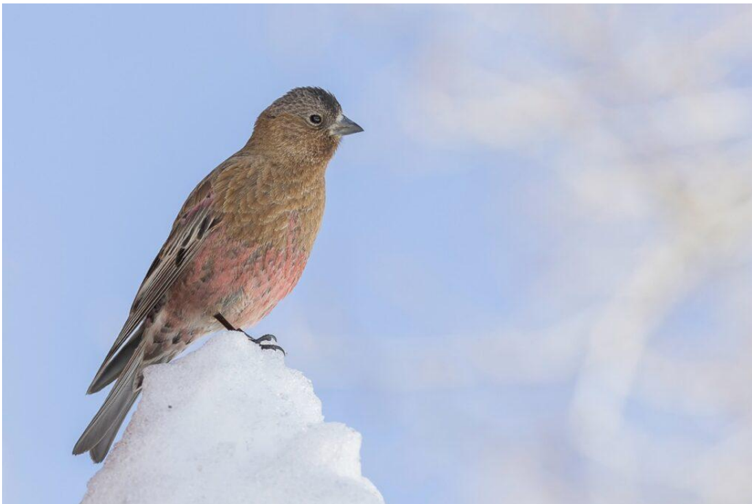
Brown-capped Rosy Finch