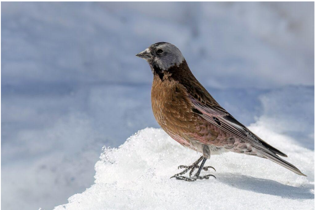
Grey-crowned (Hepburn's) Rosy Finch