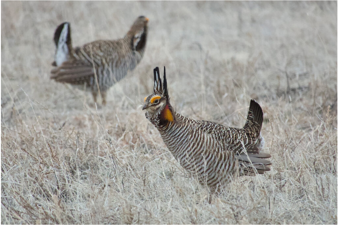
(hybrid) Greater x Lesser Prairie Chicken