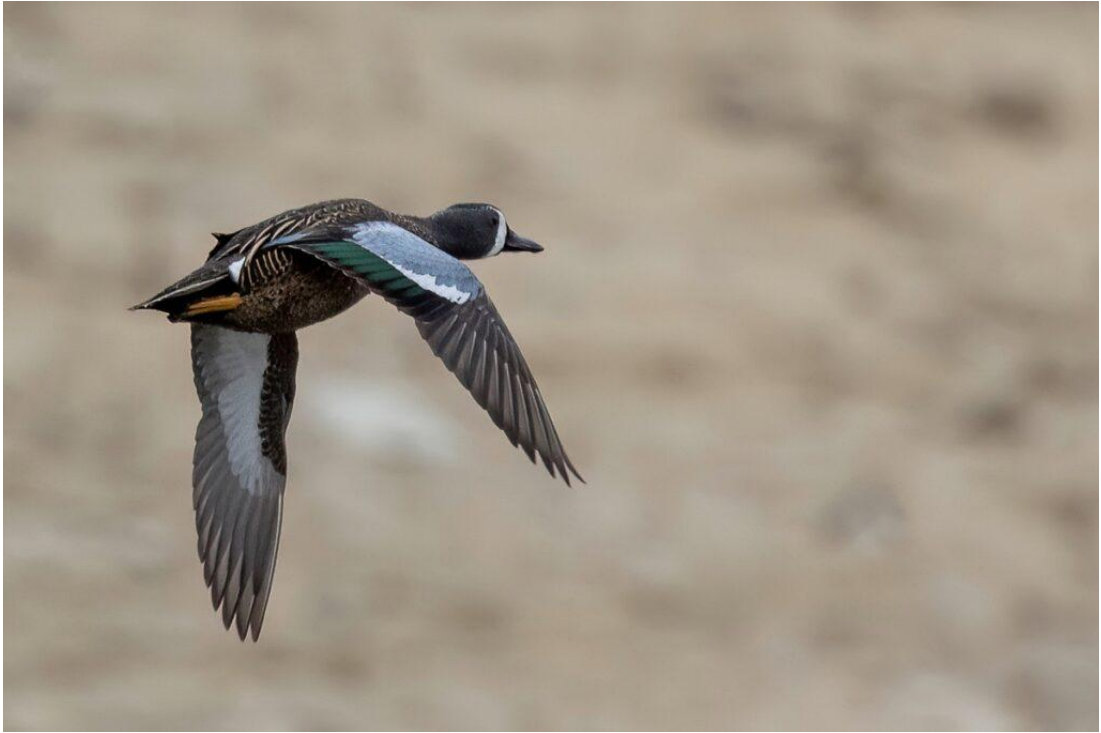
Blue-winged Teal