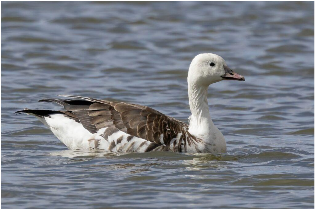
Snow x Cackling Goose (hybrid)