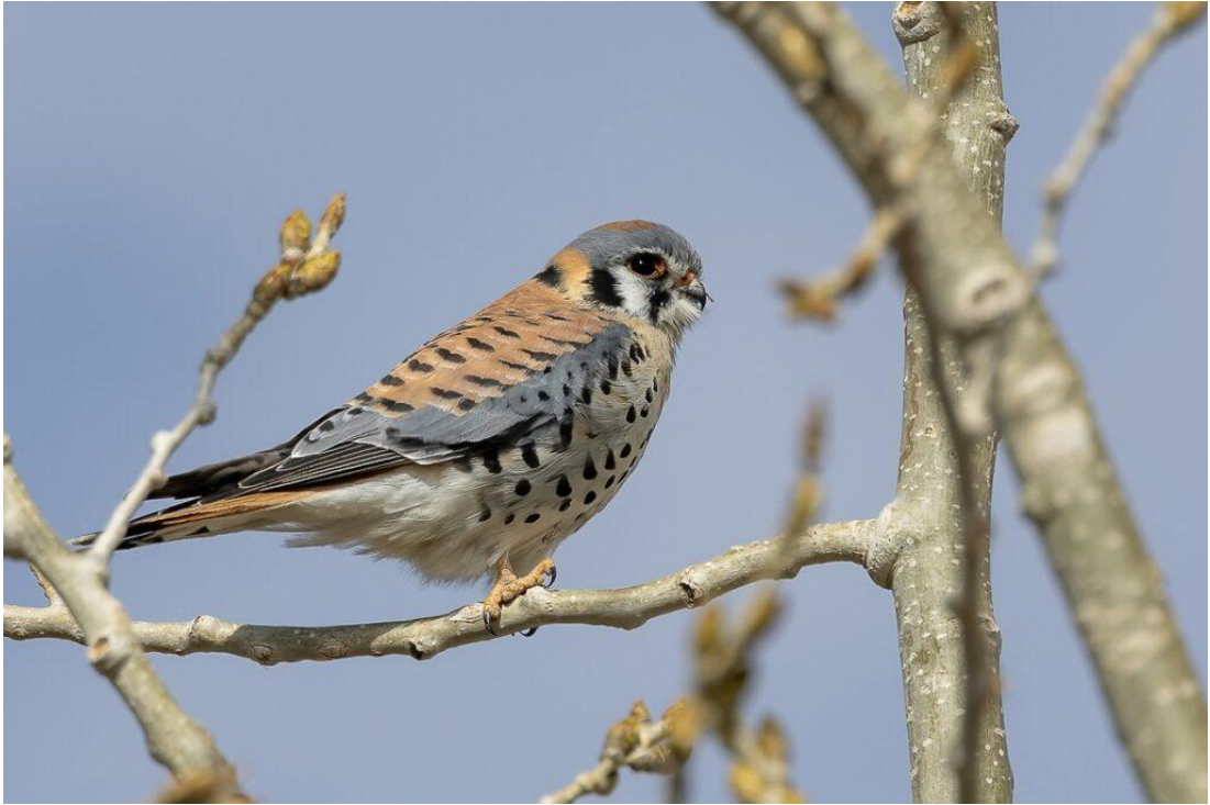
American Kestrel