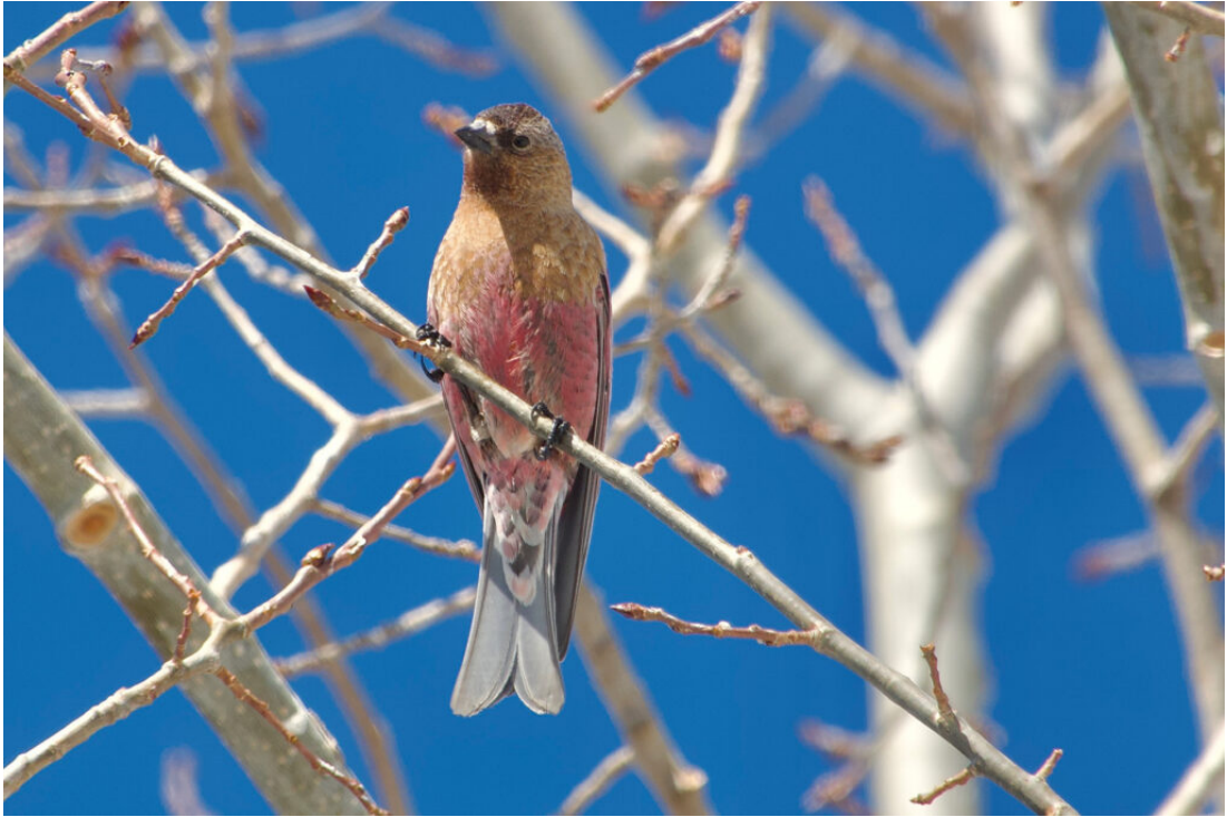
Brown-capped Rosy Finch