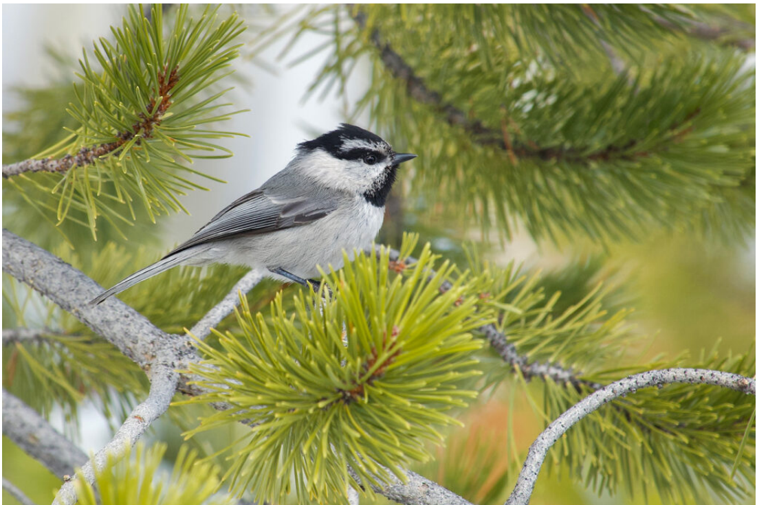
Mountain Chickadee (image by Craig Robson)