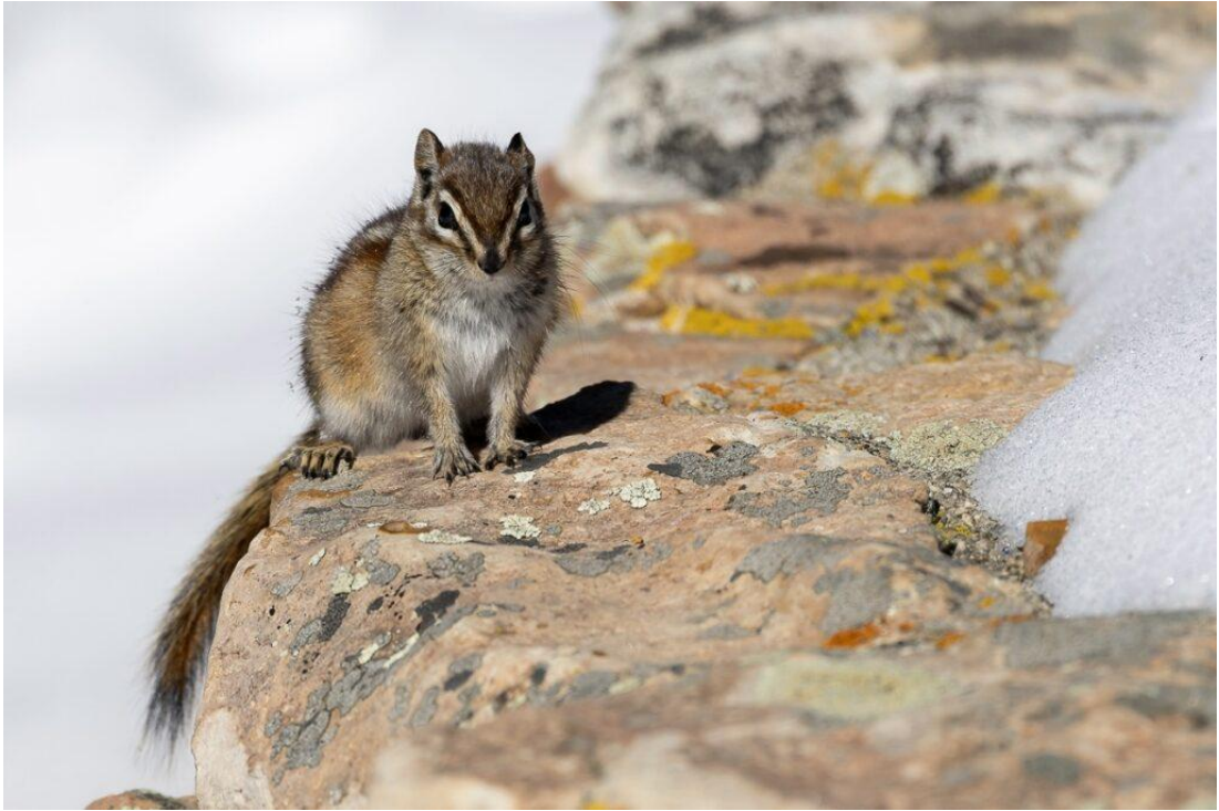
Least Chipmunk