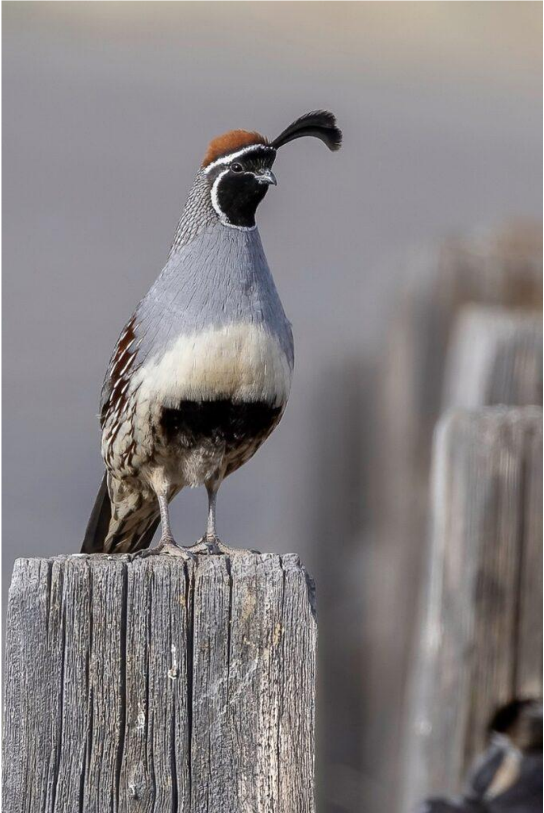
Gambel's Quail