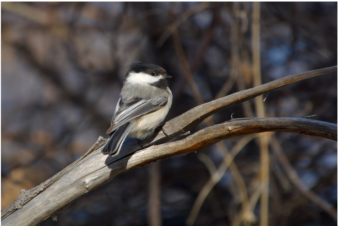
Black-capped Chickadee