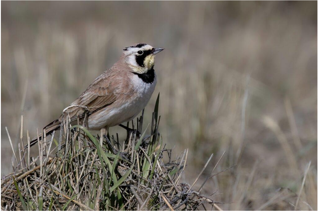
Horned Lark