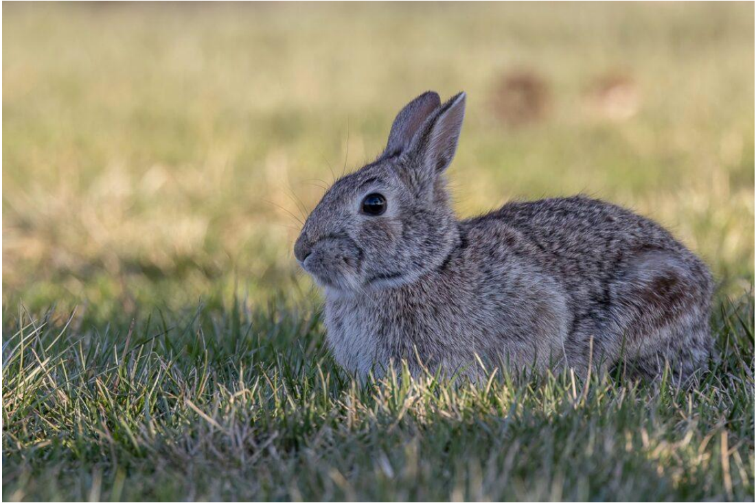
Eastern Cottontail