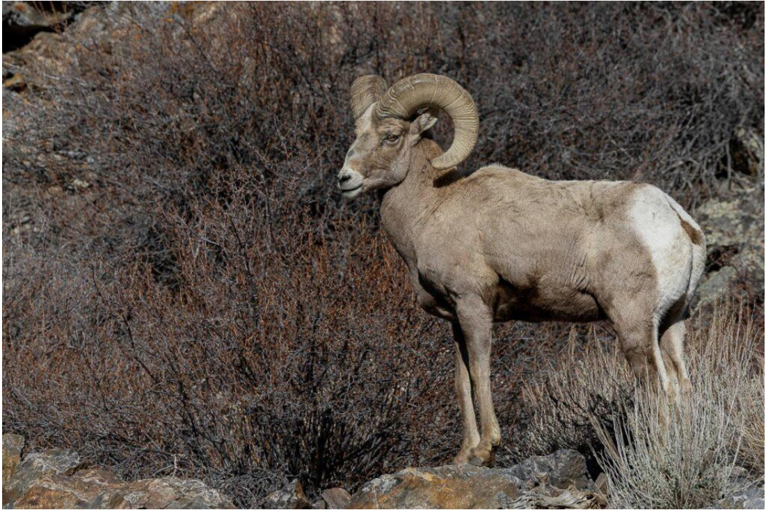
Bighorn Sheep