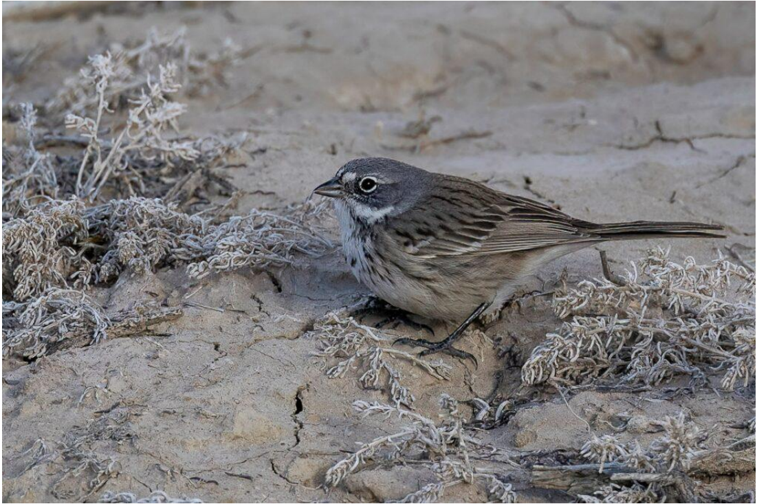
Sagebrush Sparrow