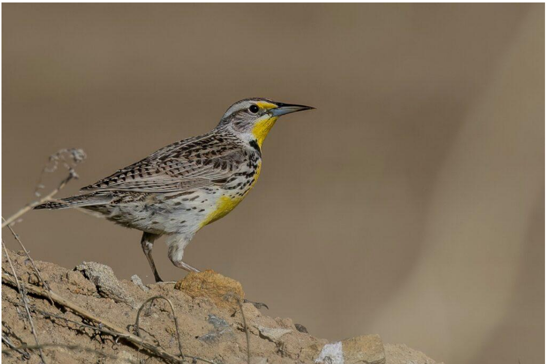
Western Meadowlark