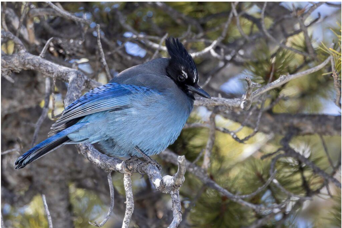
Steller's Jay