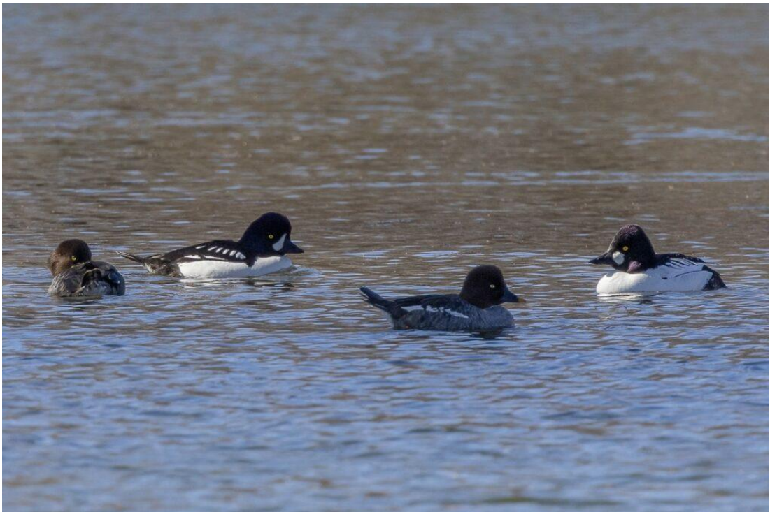
Common & Barrow's Goldeneyes