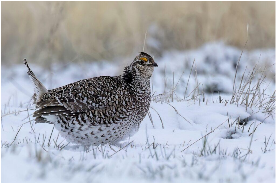
Sharp-tailed Grouse