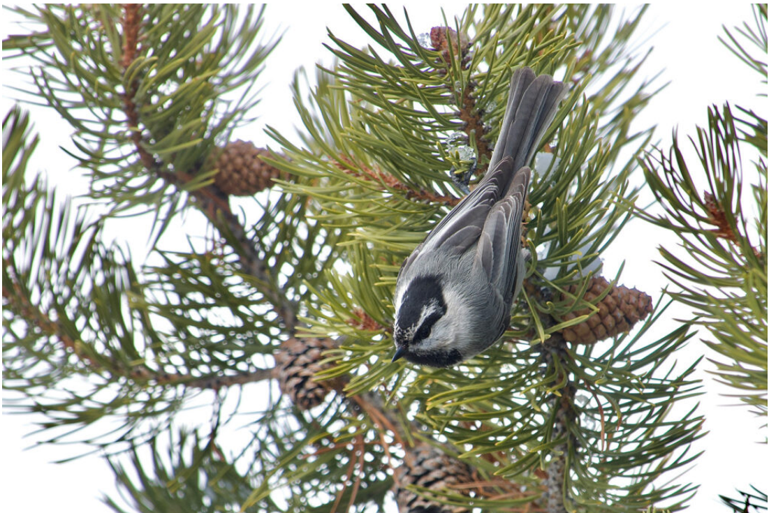
Mountain Chickadee