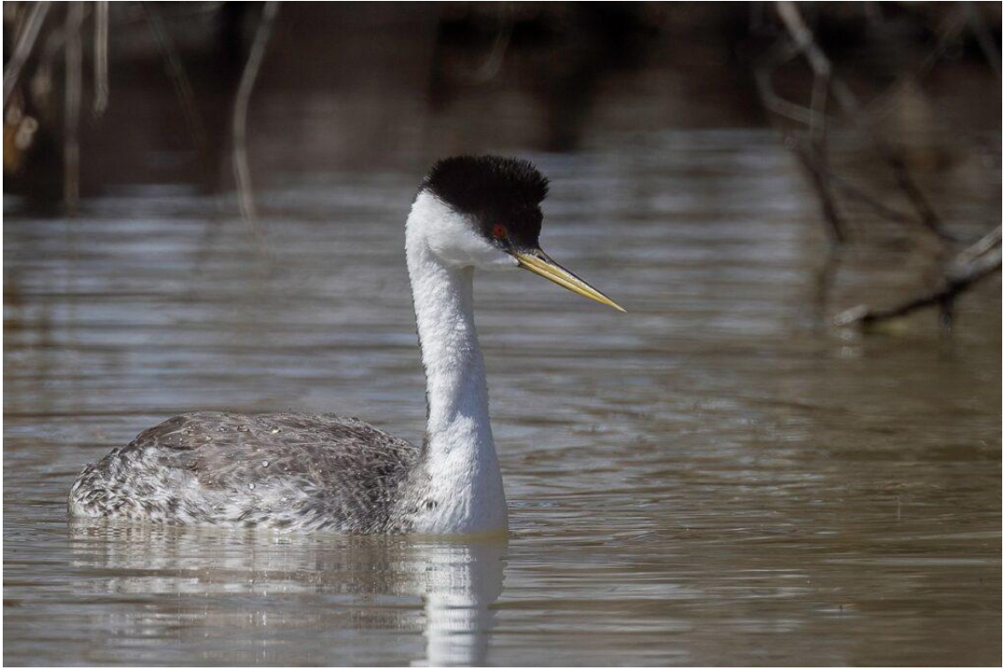
Western Grebe