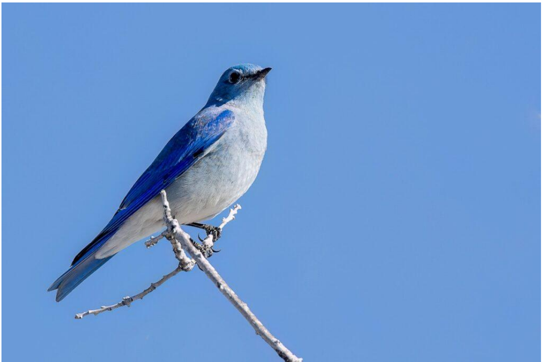
Mountain Bluebird