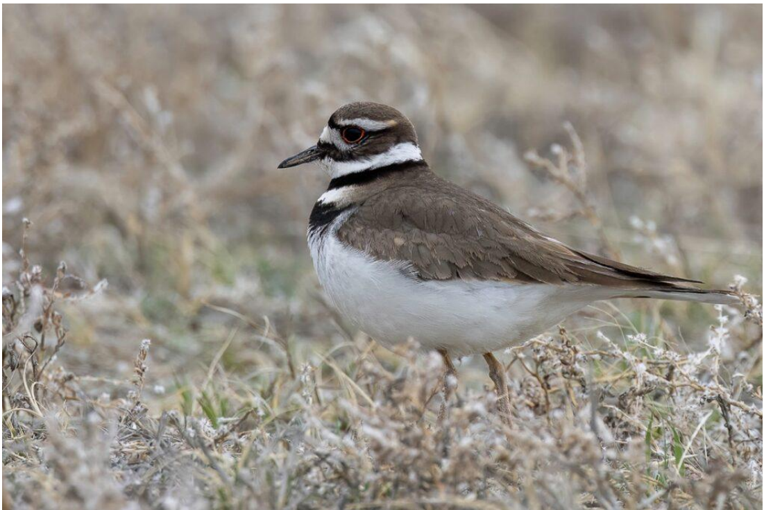
Killdeer