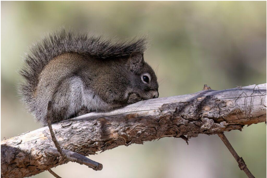
American Red Squirrel