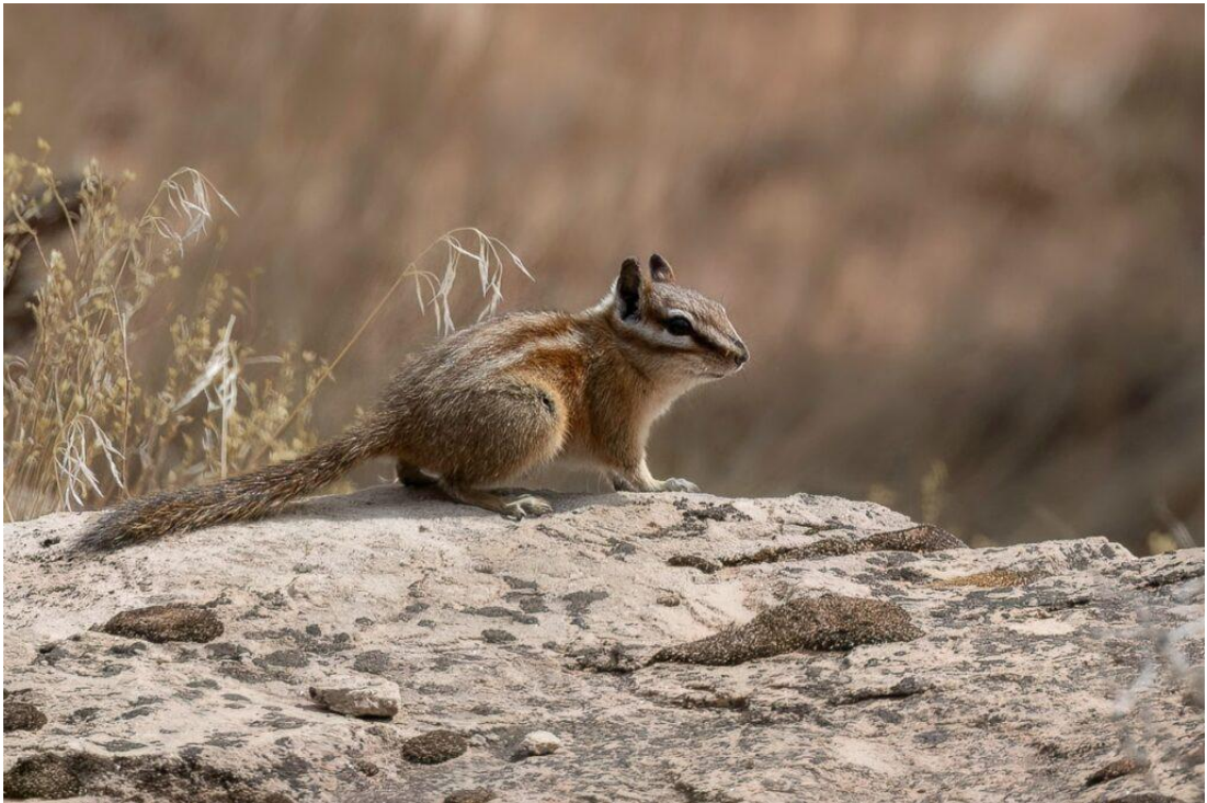
Hopi Chipmunk