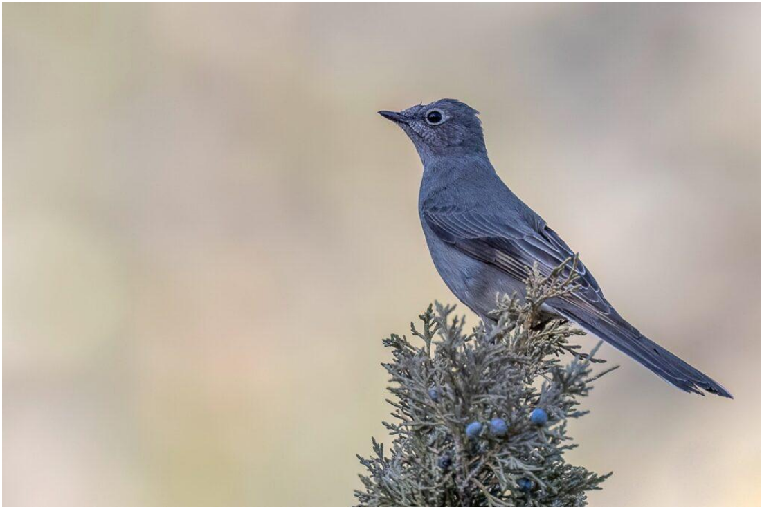
Townsend's Solitaire