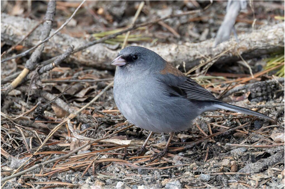
Dark-eyed (Grey-headed) Junco