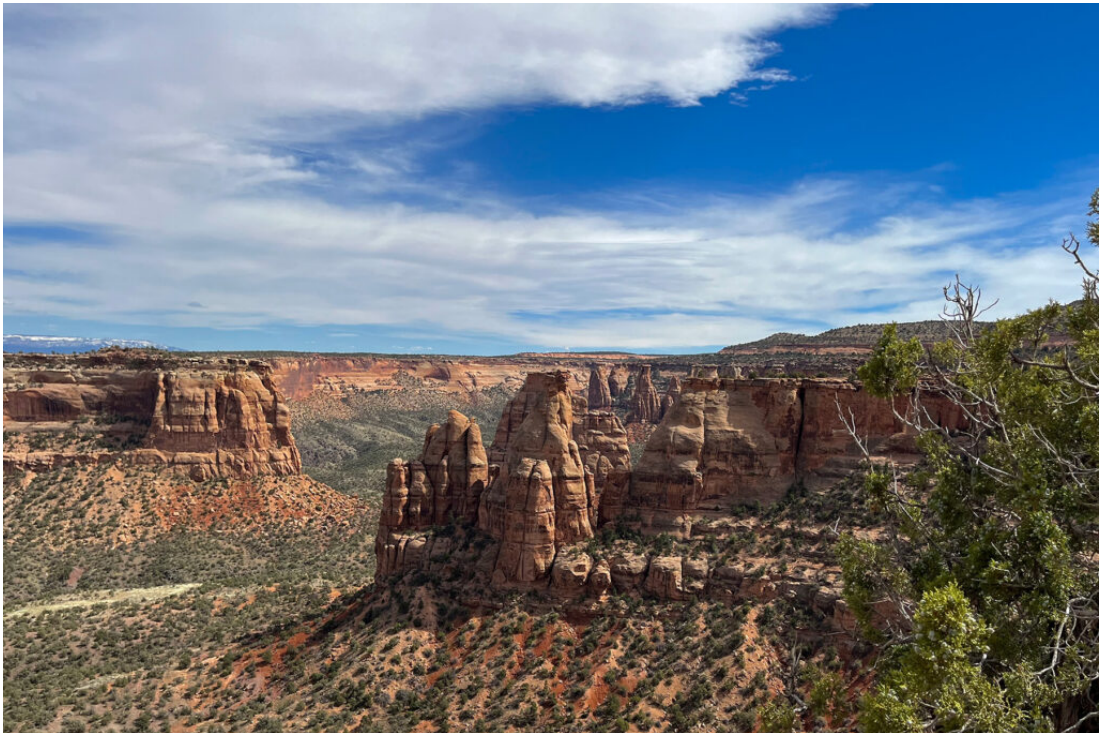
Colorado National Monument