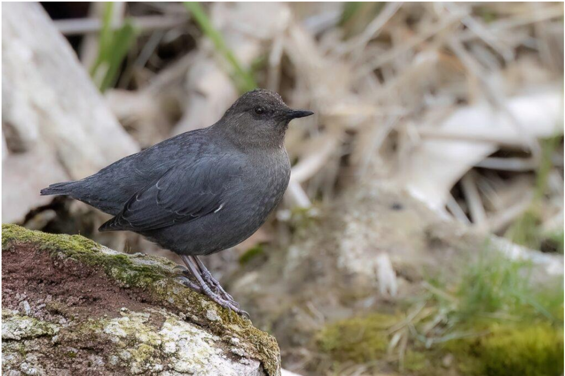
American Dipper