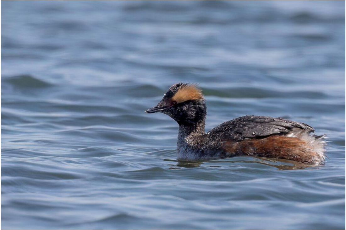
Horned Grebe