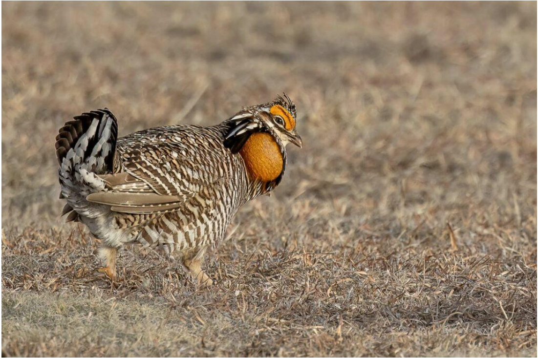
Greater Prairie Chicken