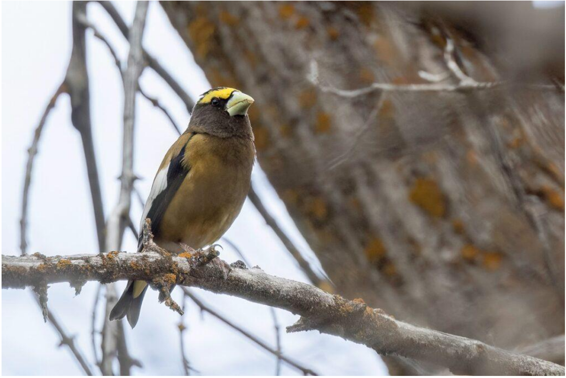
Evening Grosbeak