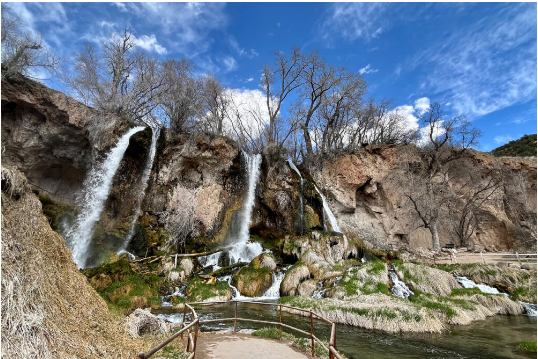
Rifle Falls