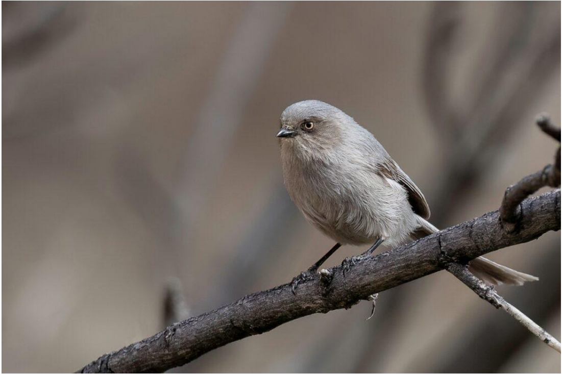
American Bushtit