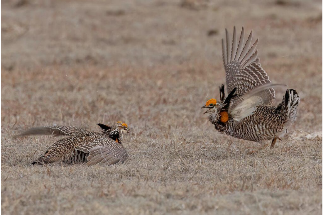
Greater Prairie Chicken