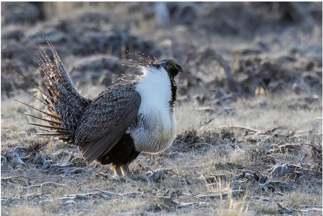
Sage Grouse