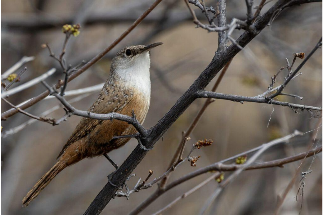
Canyon Wren