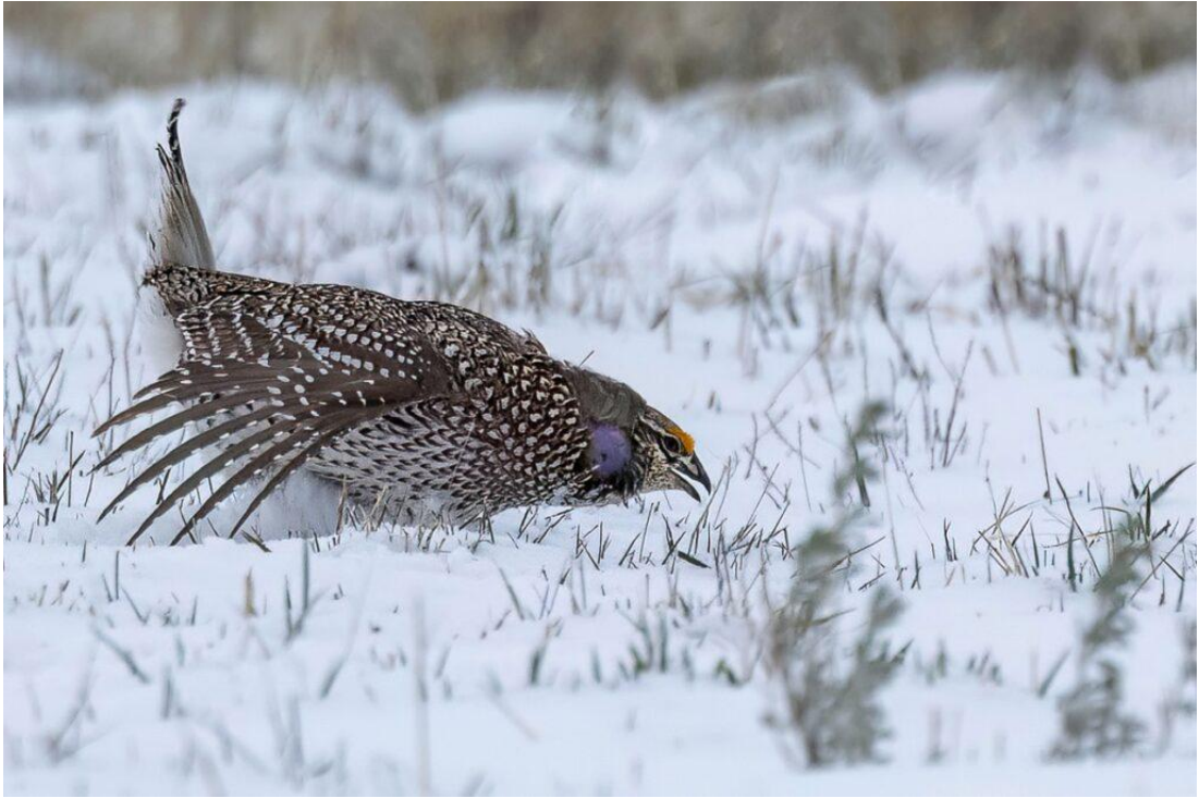
Sharp-tailed Grouse