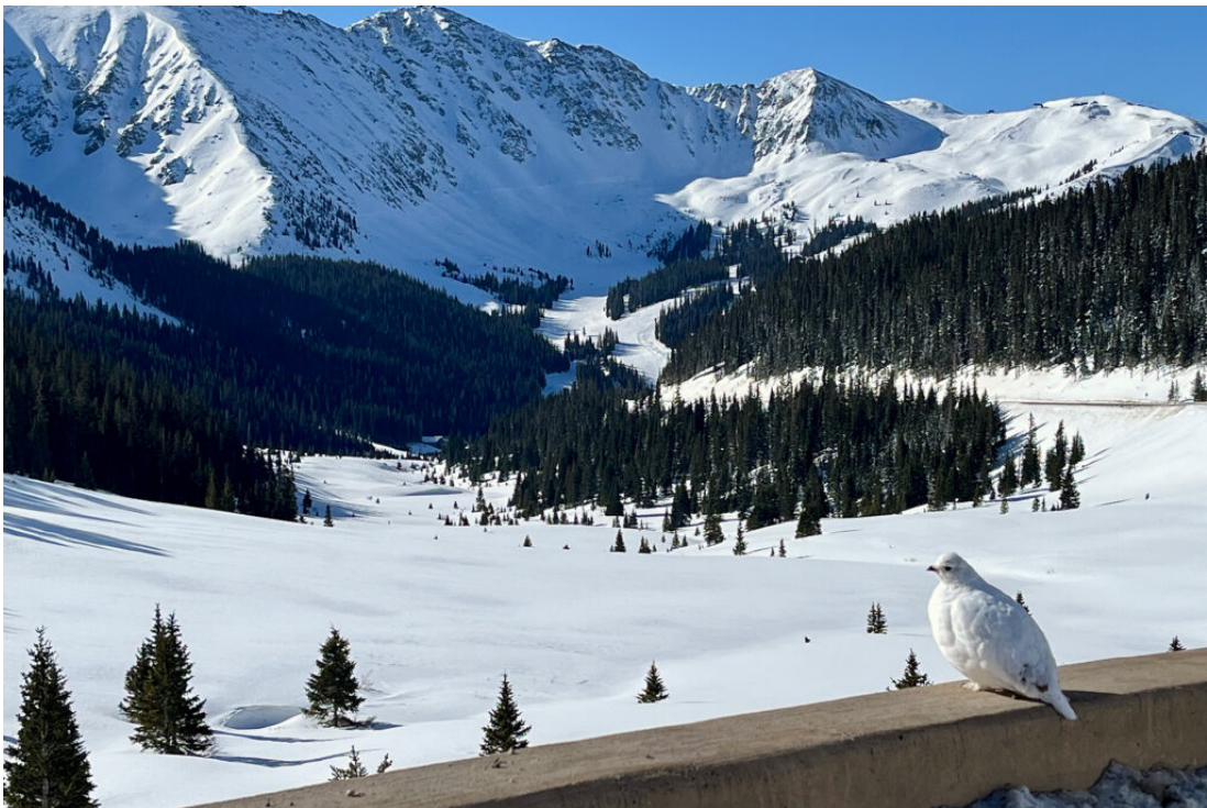
White-tailed Ptarmigan enjoying the view!