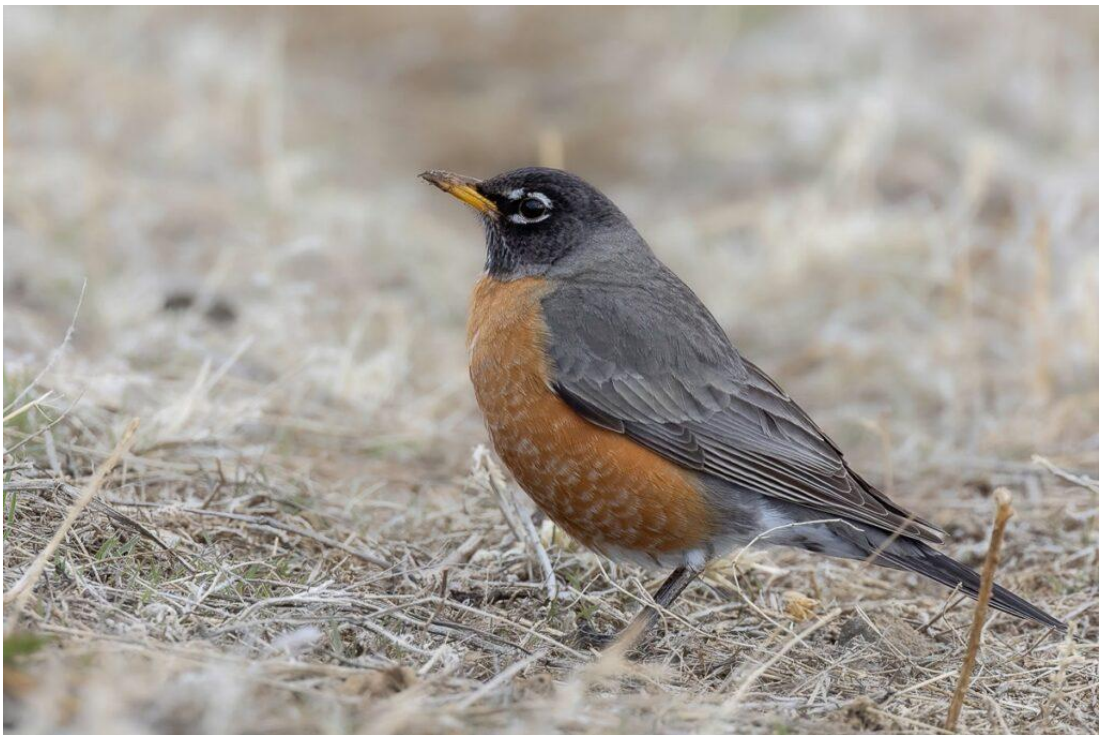
American Robin