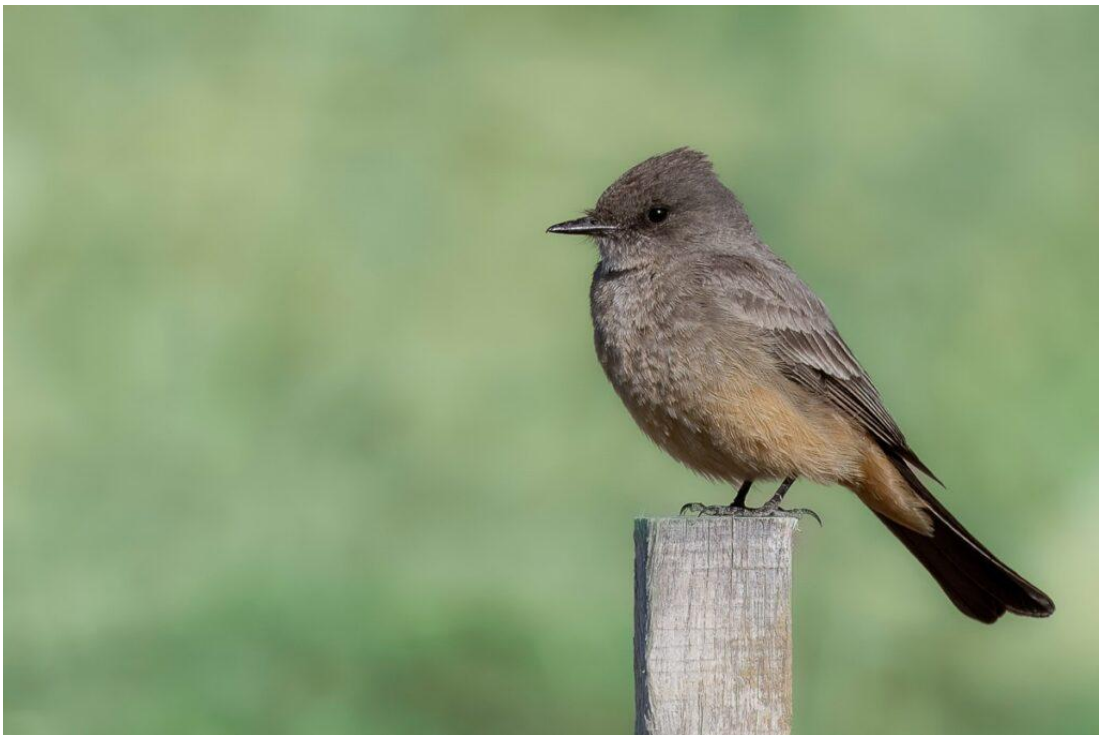
Say's Phoebe