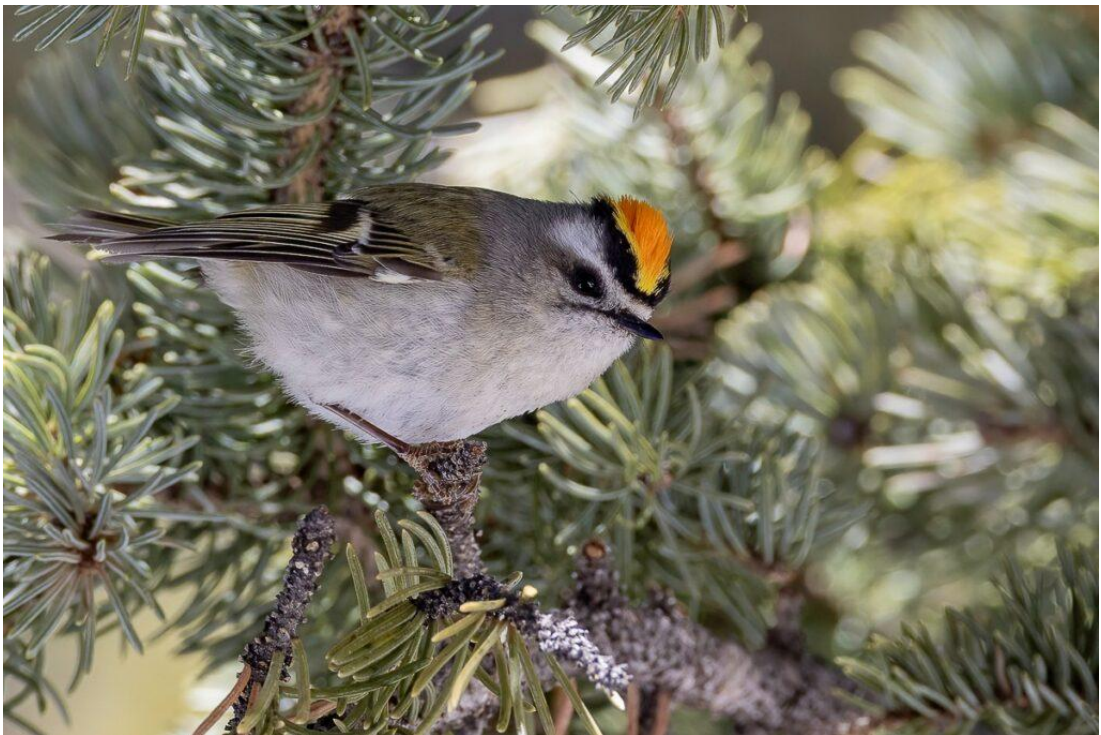
Golden-crowned Kinglet