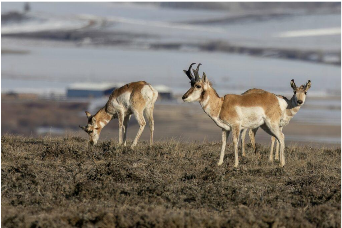
Pronghorns