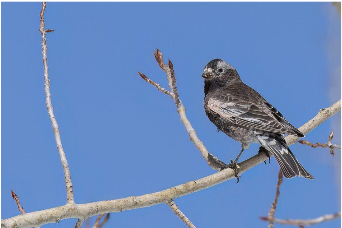
Black Rosy Finch