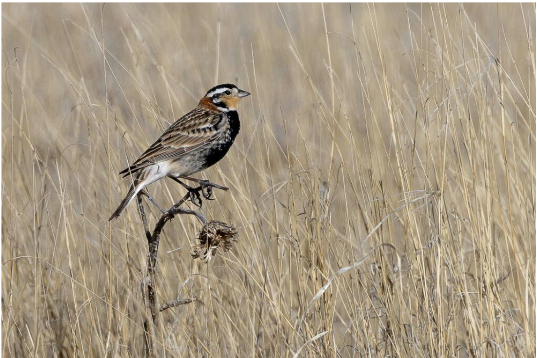
Chestnut-collared Longspur