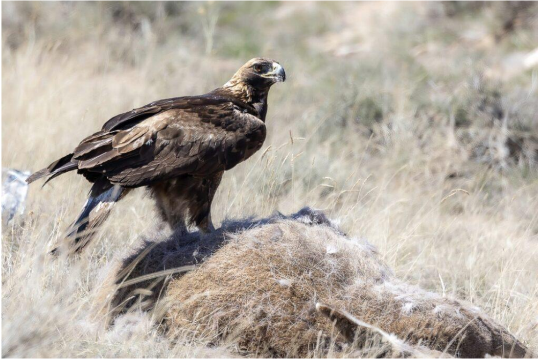
Golden Eagle