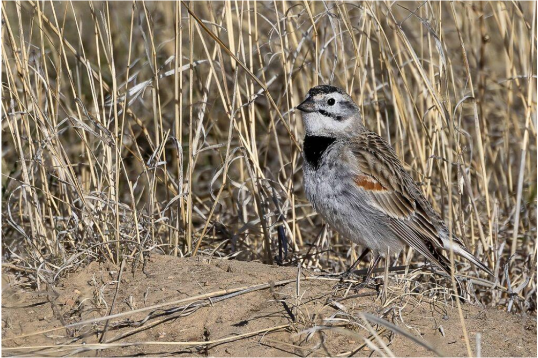
Thick-billed Longspur