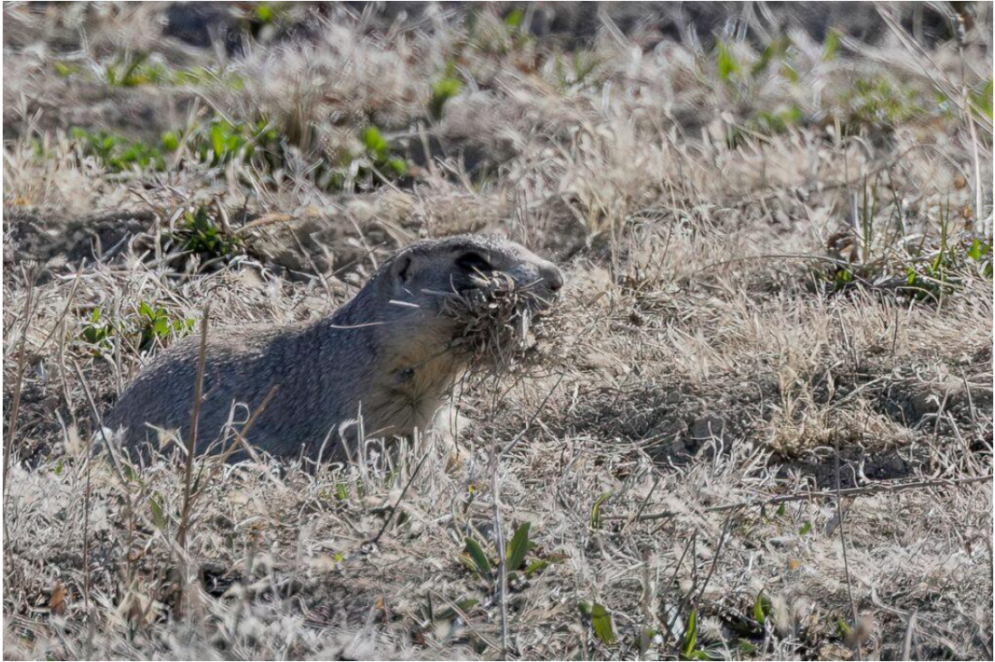
White-tailed Prairie Dog