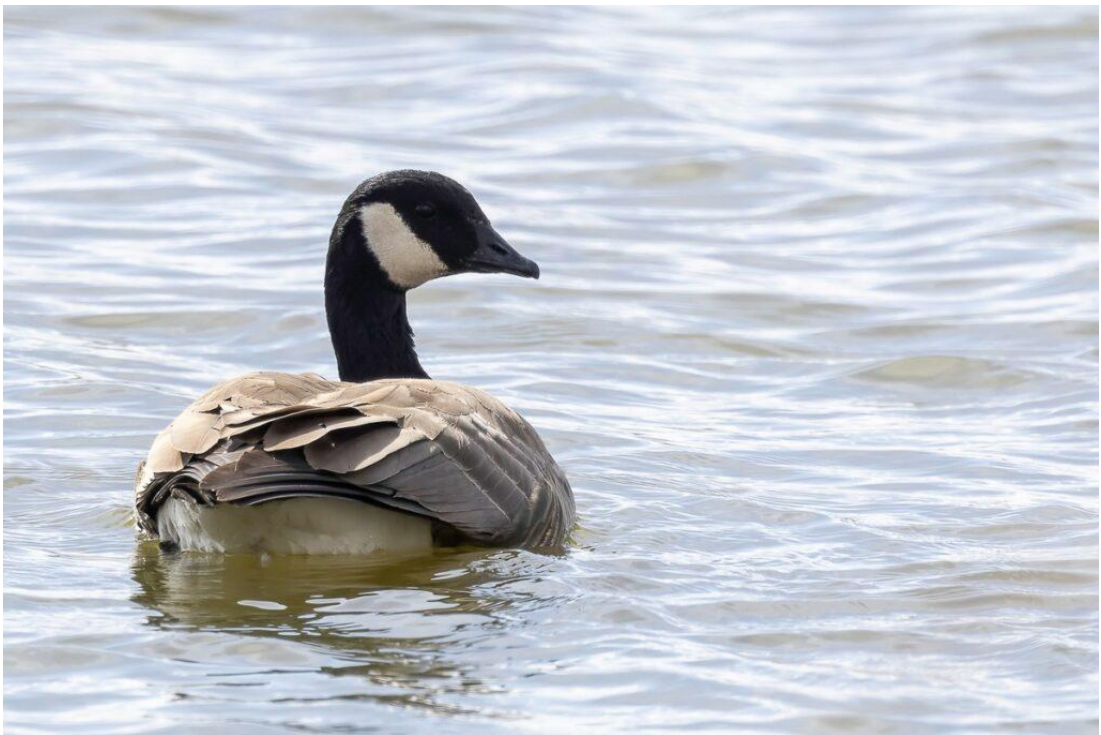
Cackling Goose