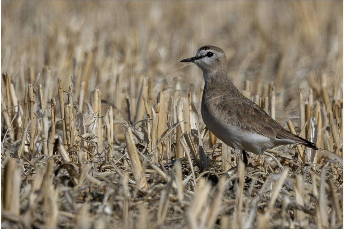
Mountain Plover