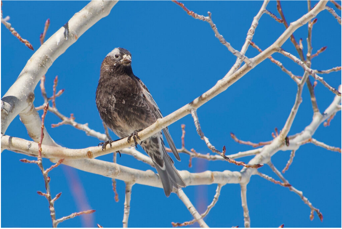
Black Rosy Finch