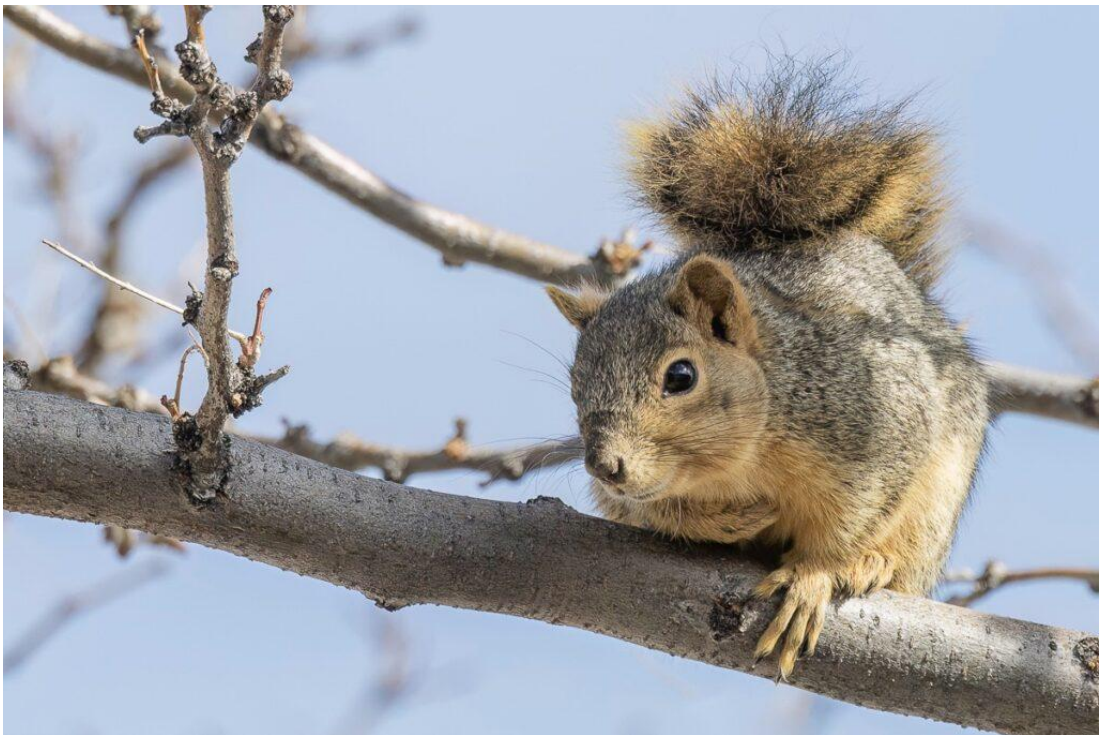
Eastern Fox Squirrel