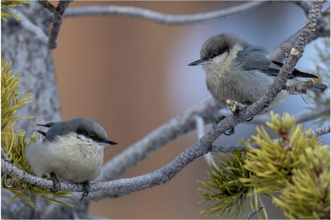
Pygmy Nuthatches