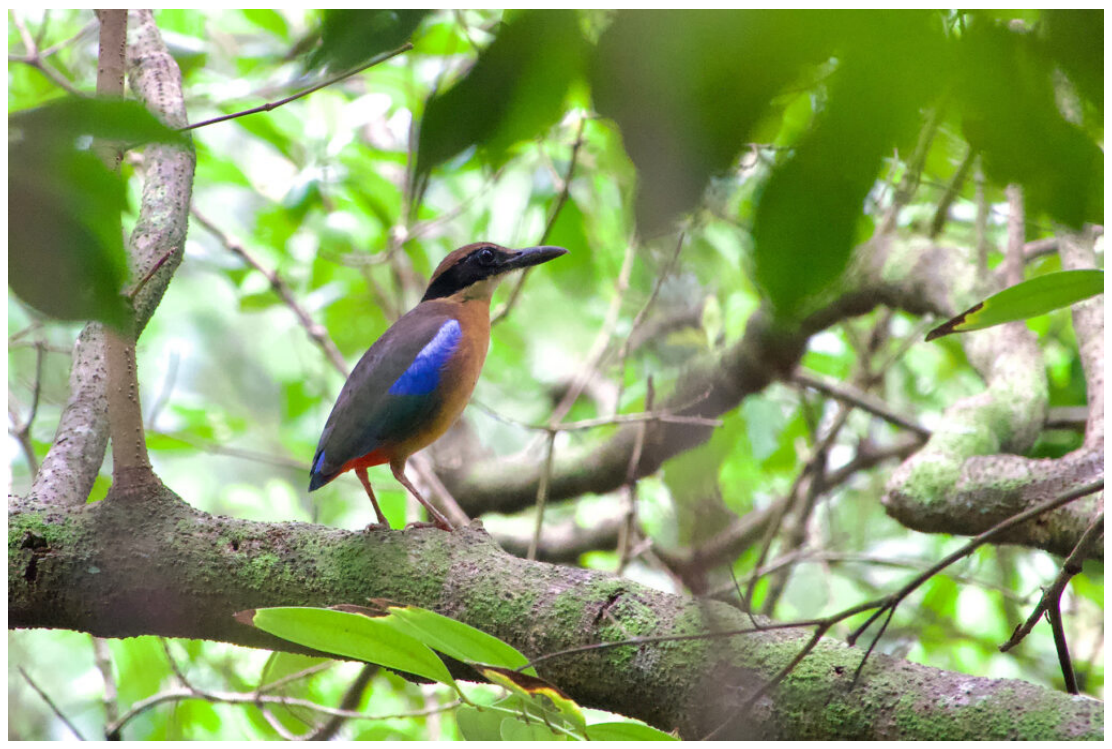
Mangrove Pitta