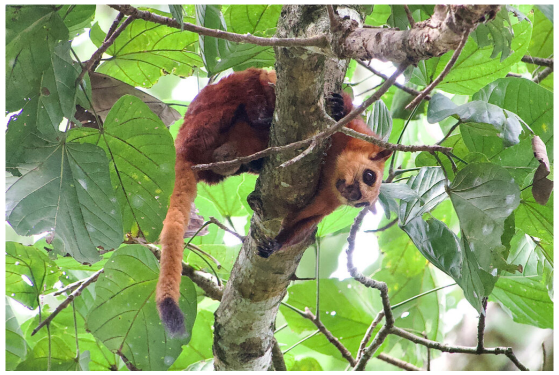
Red Giant Flying Squirrel (image by Craig Robson)