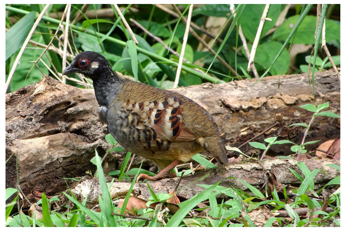
Malayan Partridge