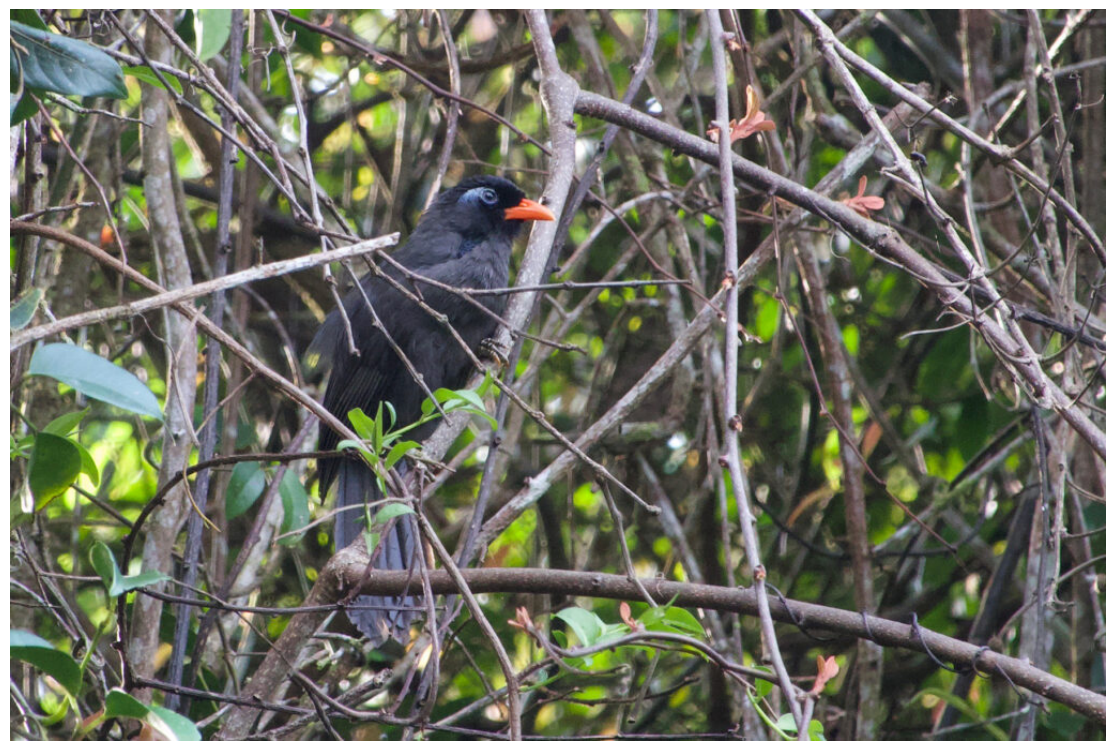
Black Laughingthrush