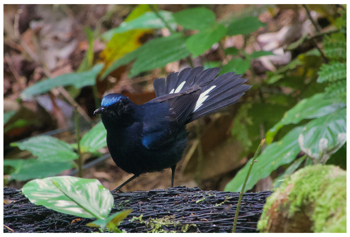
White-tailed Robin