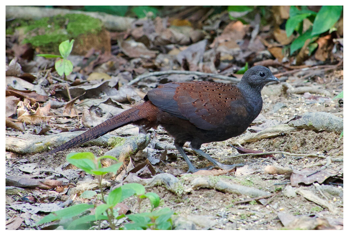
Mountain Peacock-Pheasant