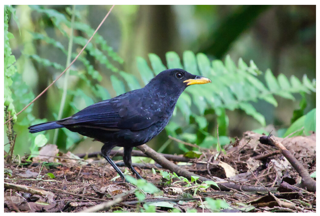
Blue Whistling Thrush ssp dichrorhynchus