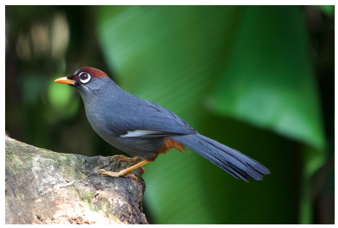
Chestnut-capped Laughingthrush