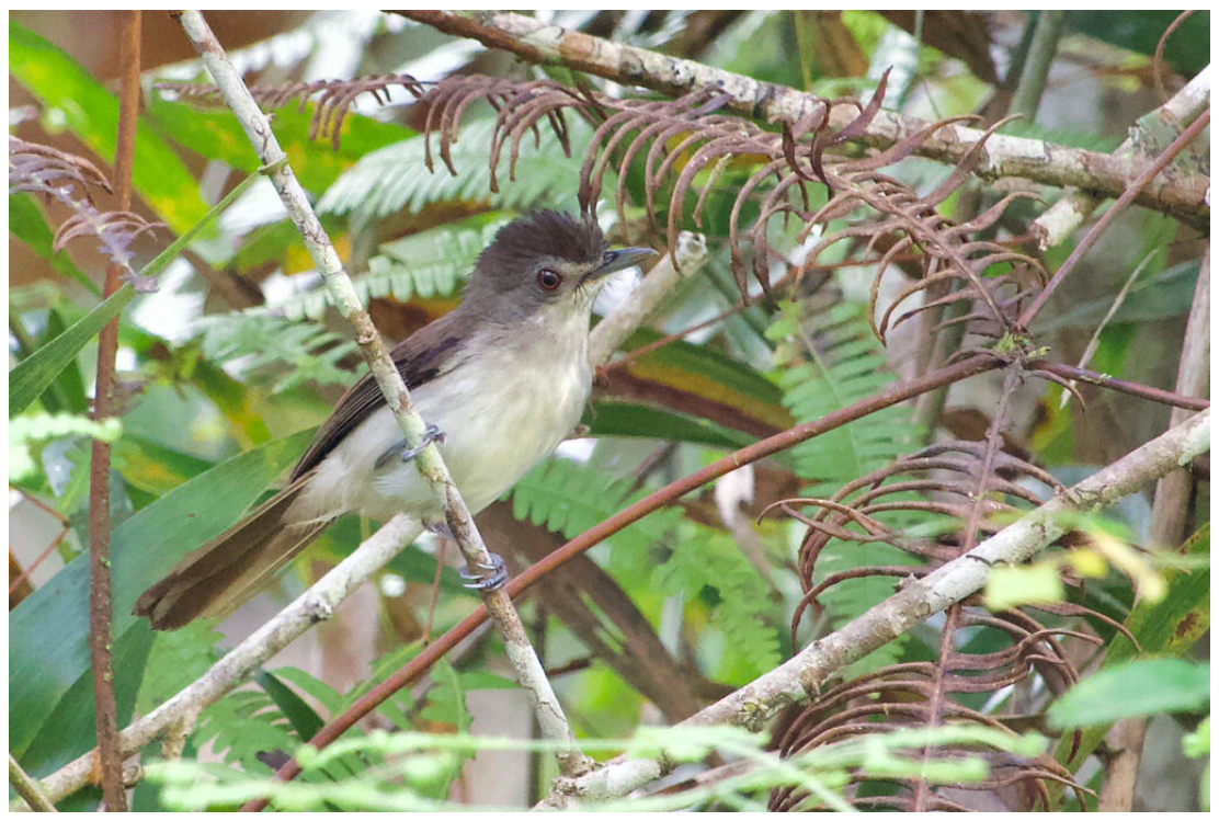
Sooty-capped Babbler