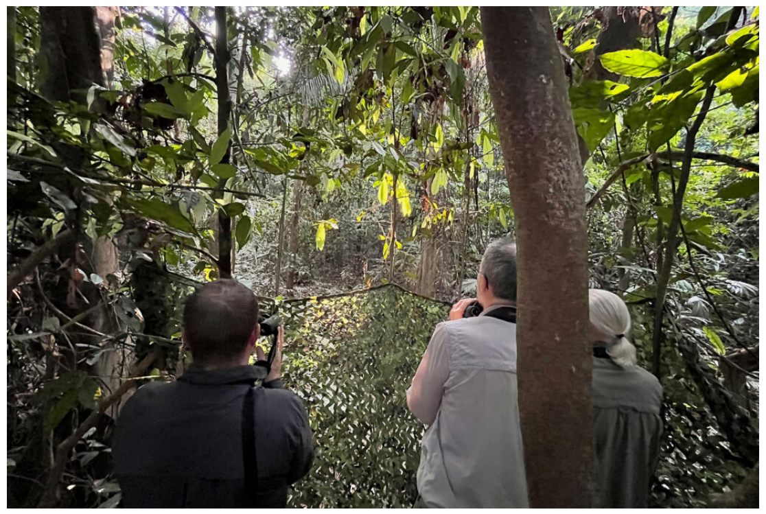
Watching Malayan Banded Pitta at Taman Negara