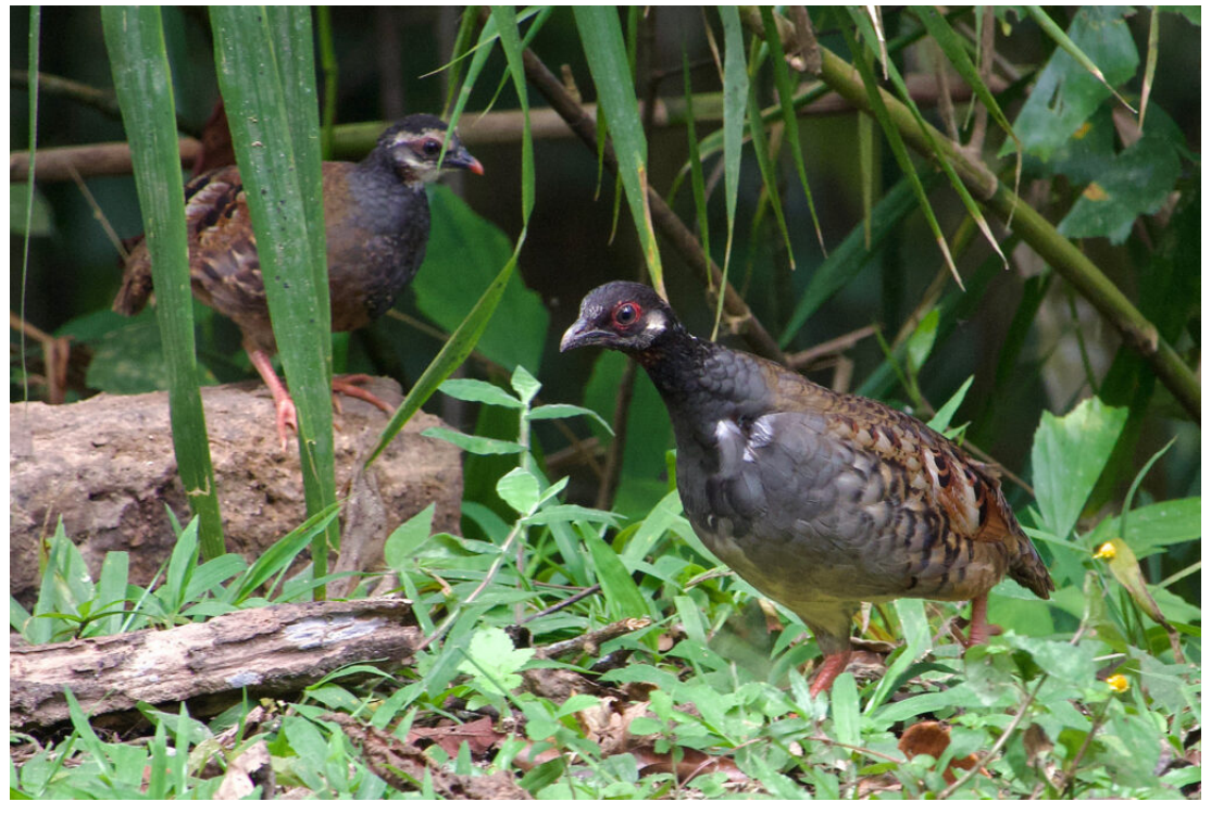
Malayan Partridge