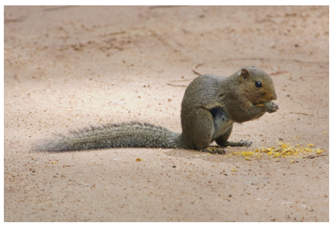
Black Striped Squirrel