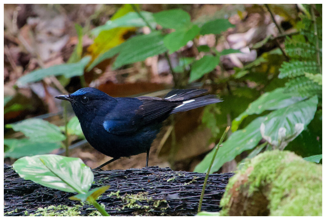
White-tailed Robin