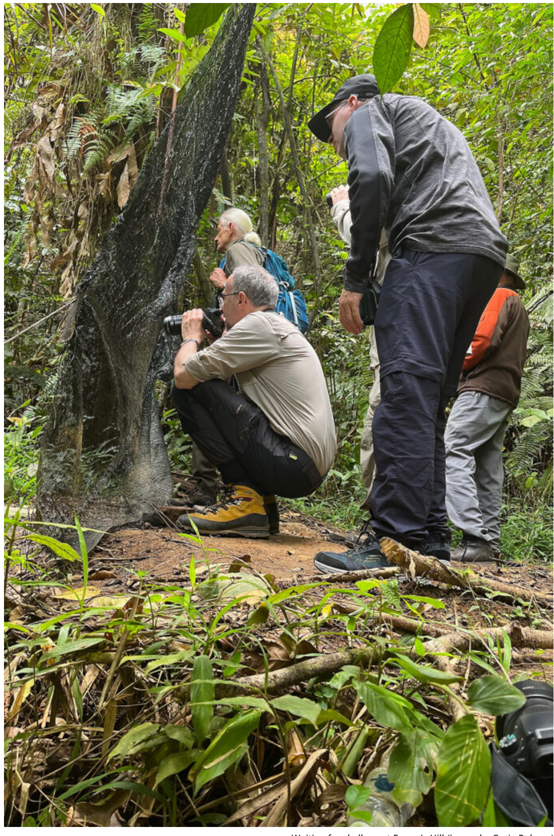
Waiting for skulkers at Fraser's Hill