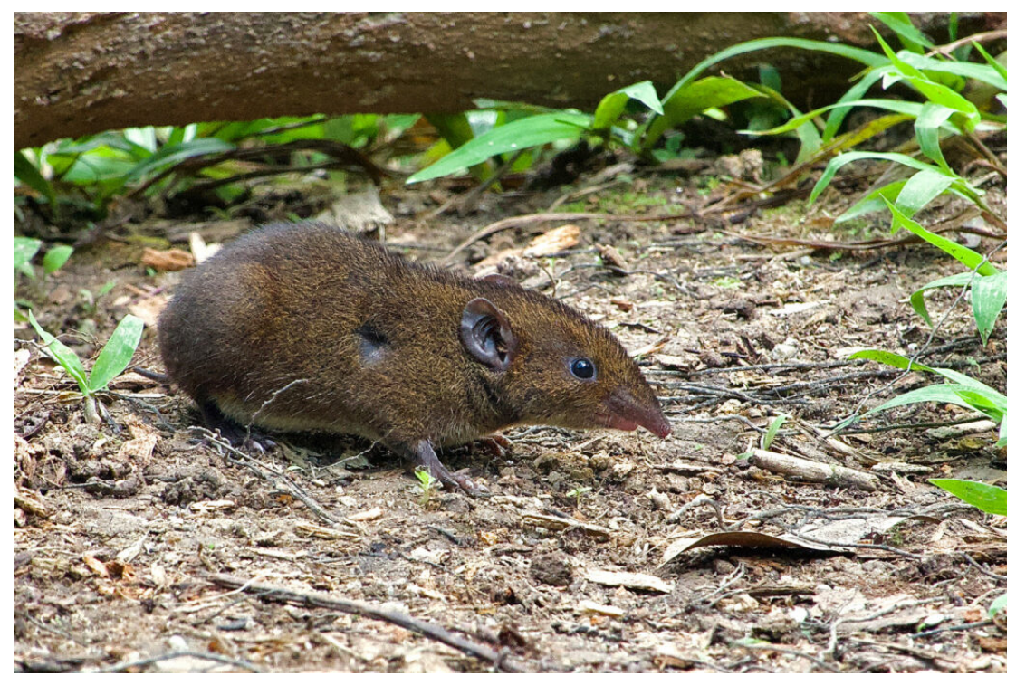
Short-tailed Gymnure