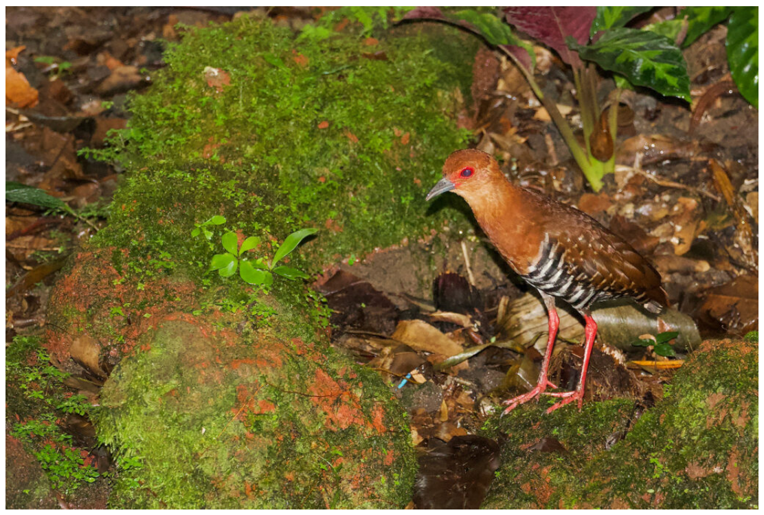
Red-legged Crake