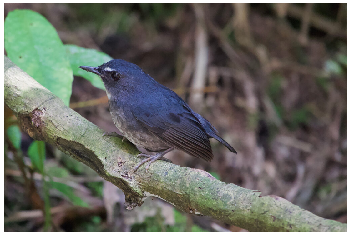
Lesser Shortwing