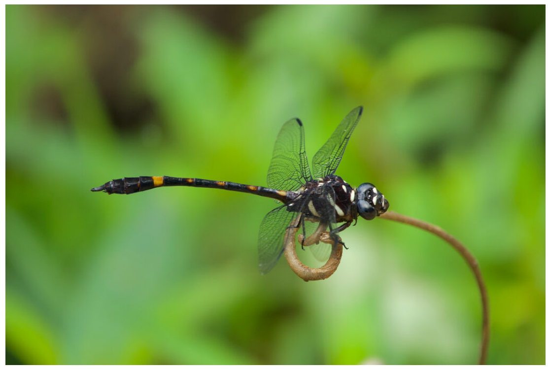
Abbott's Tiger