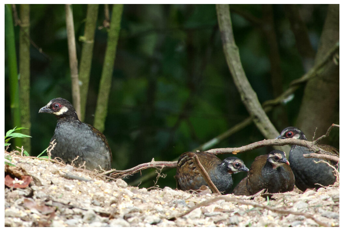
Malayan Partridge