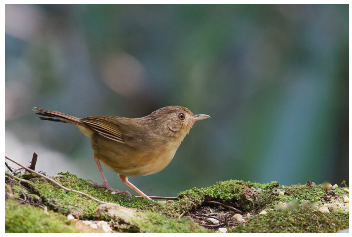
Buff-breasted Babbler