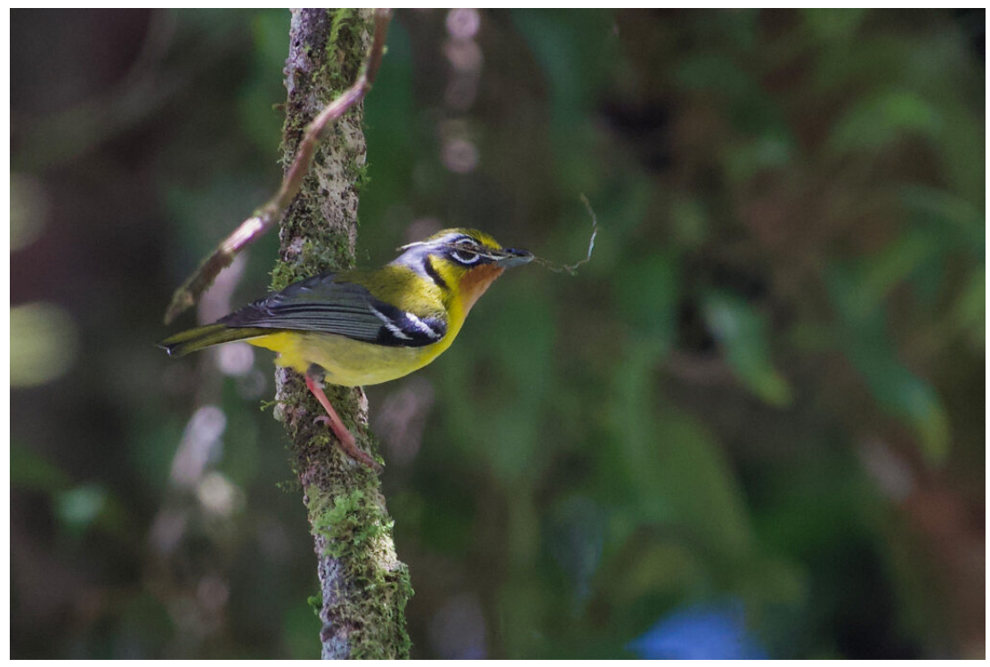
Black-eared Shrike-Babbler