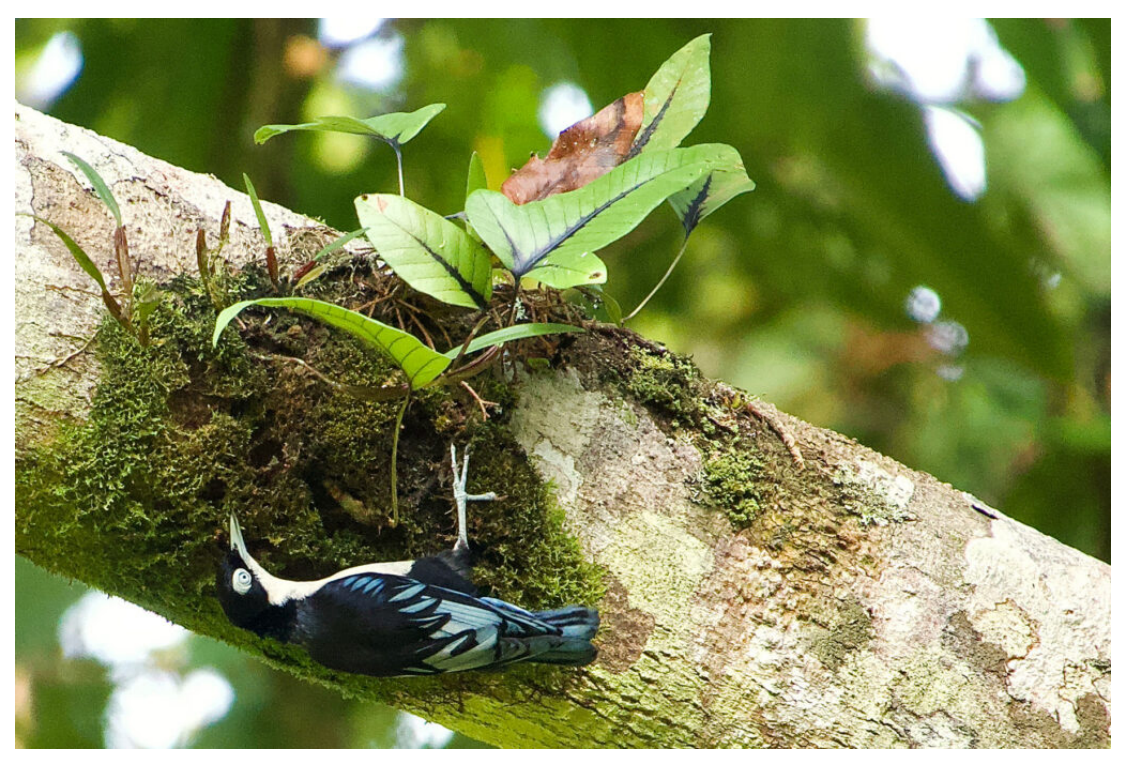
Blue Nuthatch