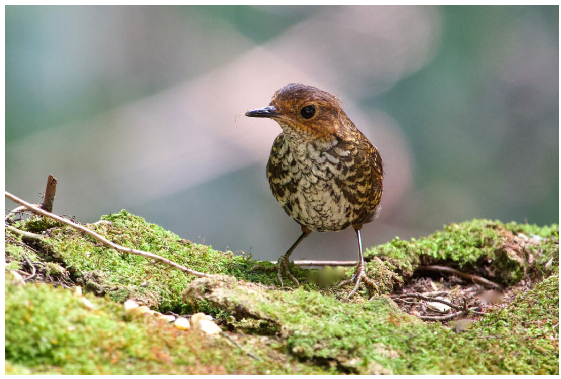
Pygmy Cupwing