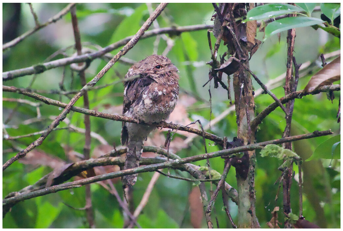
Blyth's Frogmouth