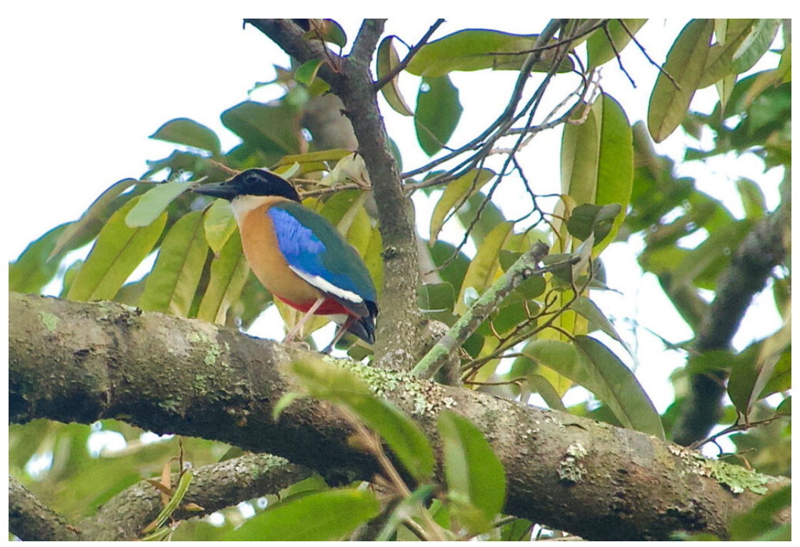
Blue-winged Pitta