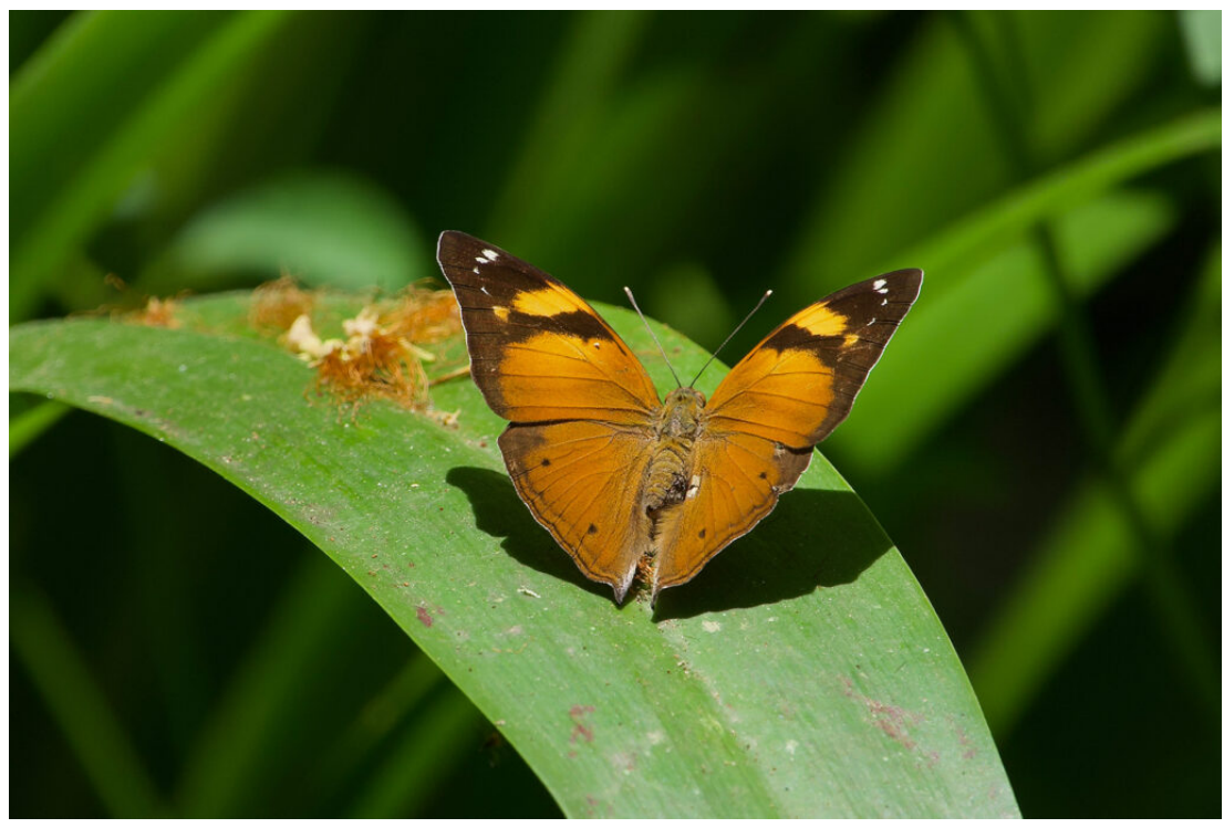
Autumn Leaf (image by Craig Robson)