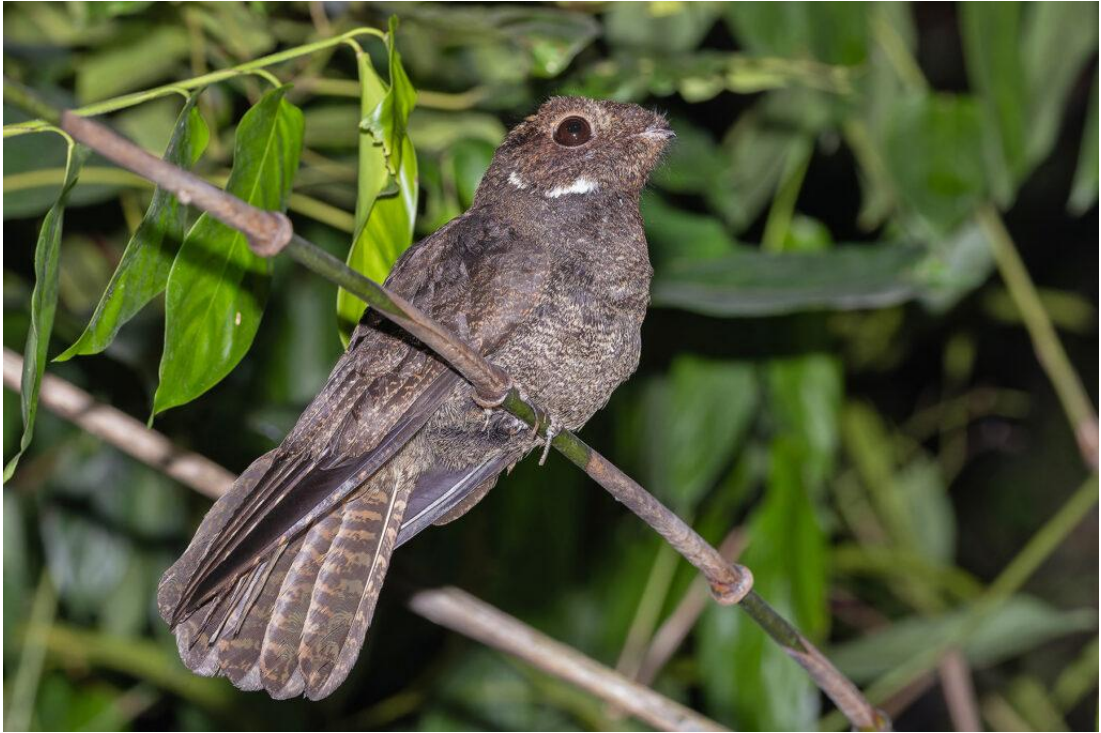
Brown Nightjar