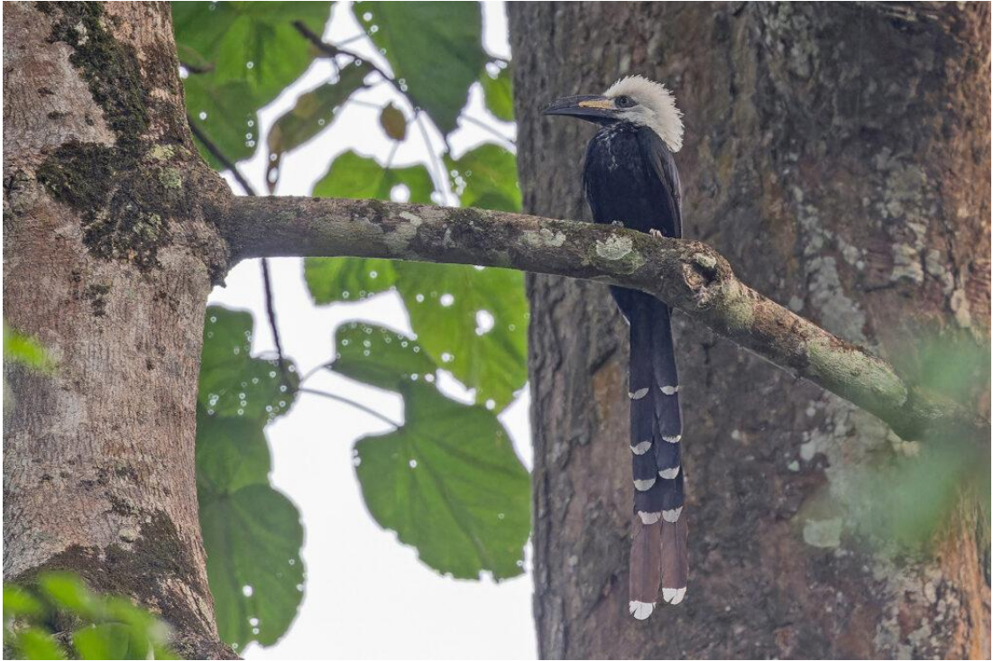
White-crested Hornbill