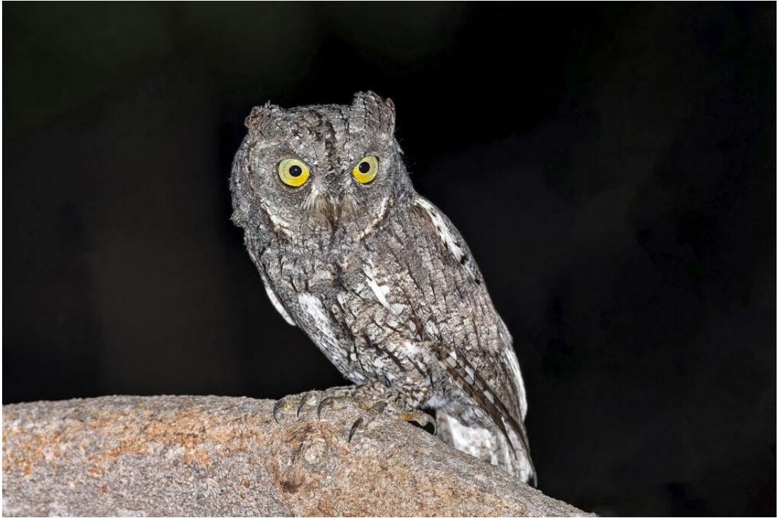
African Scops Owl