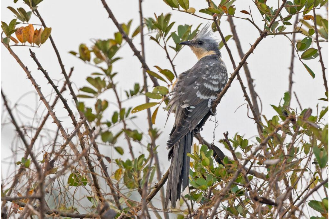
Great Spotted Cuckoo