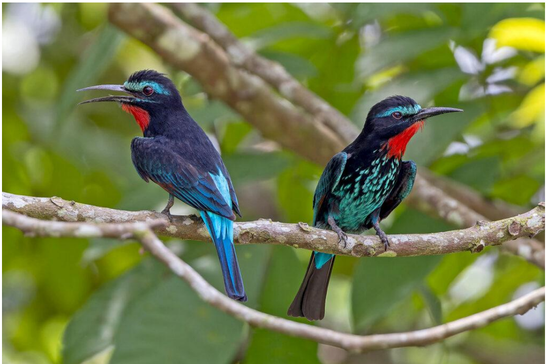
Black Bee-eaters