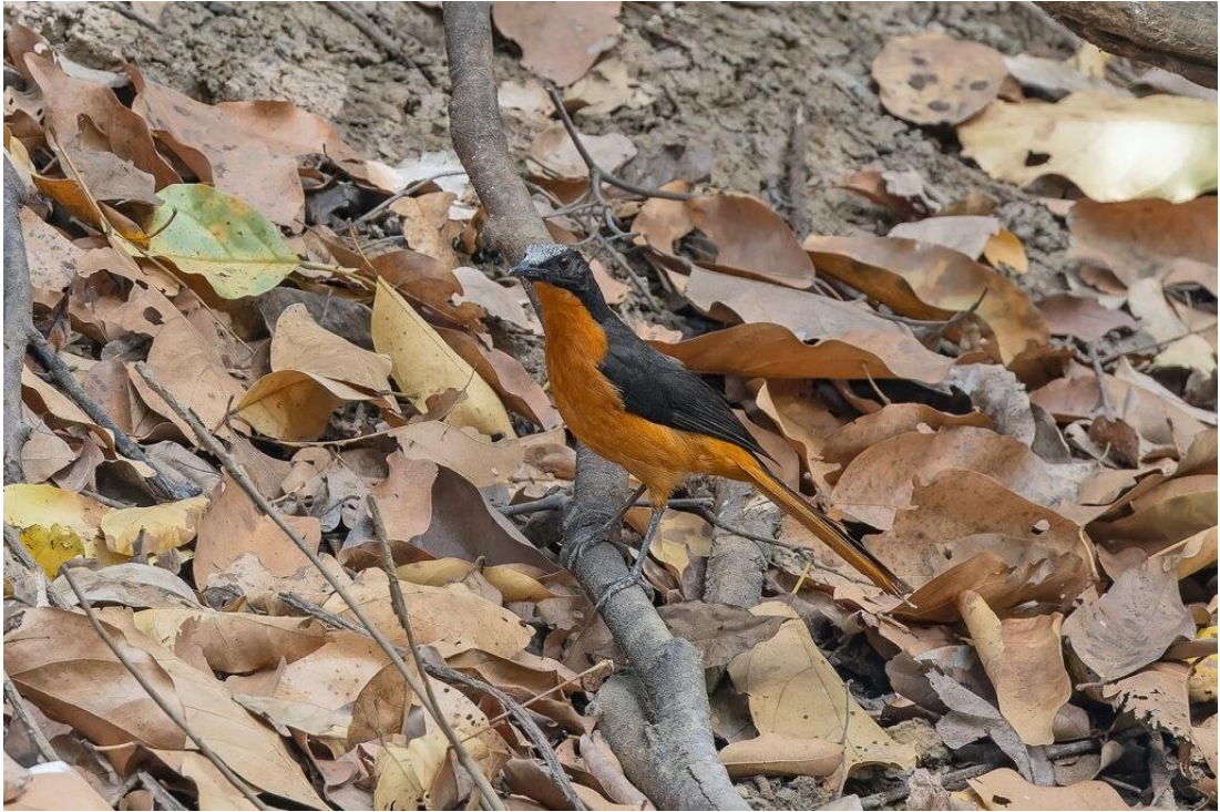
White-crowned Robin-Chat