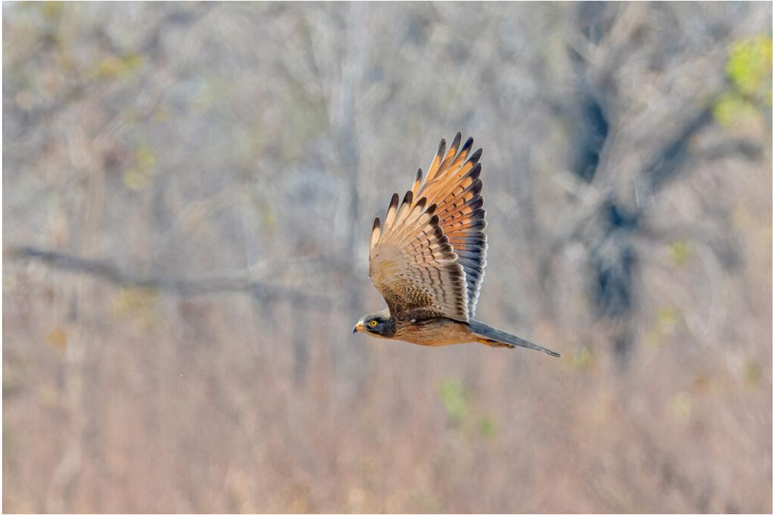
Grasshopper Buzzard