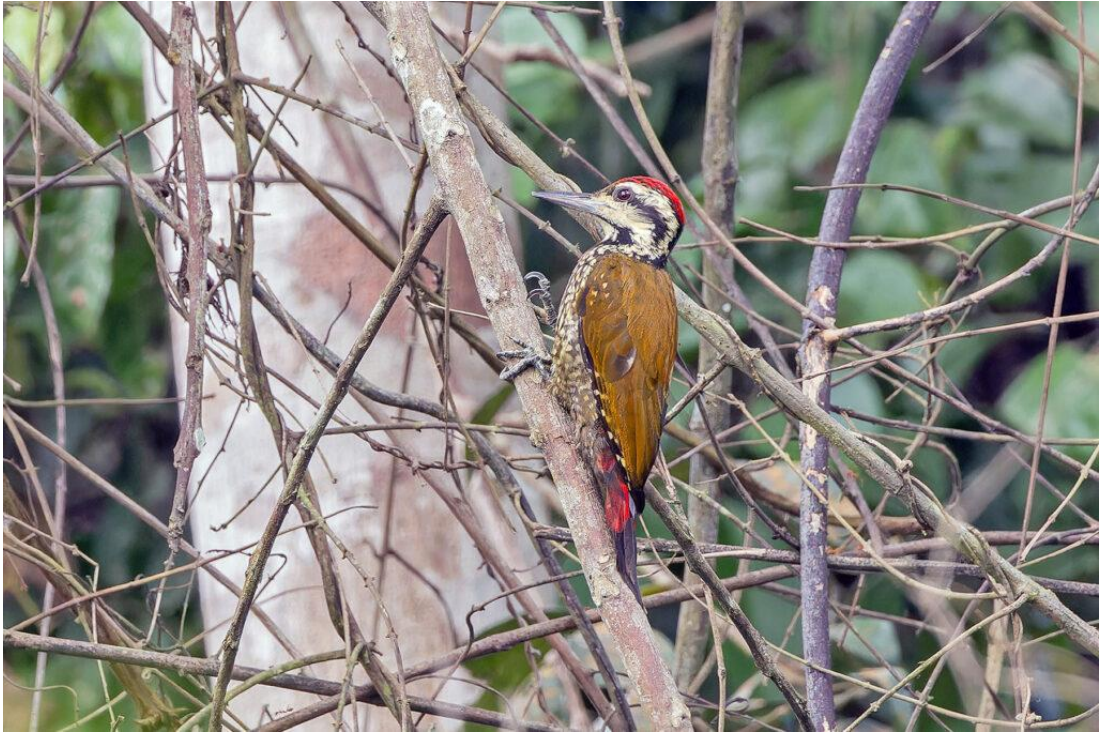
Fire-bellied Woodpecker