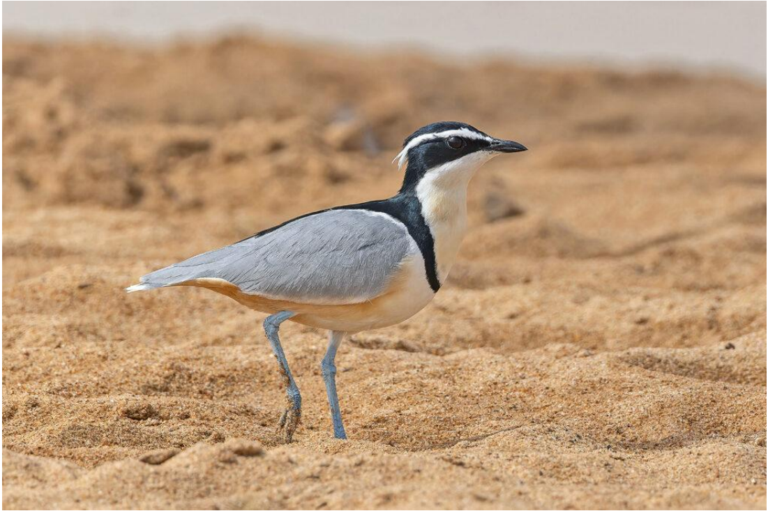
Egyptian Plover