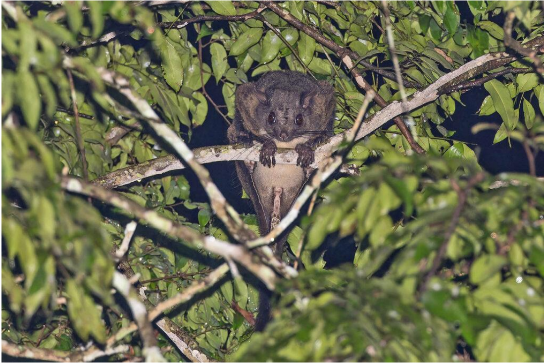
Lord Darby's Anomalure