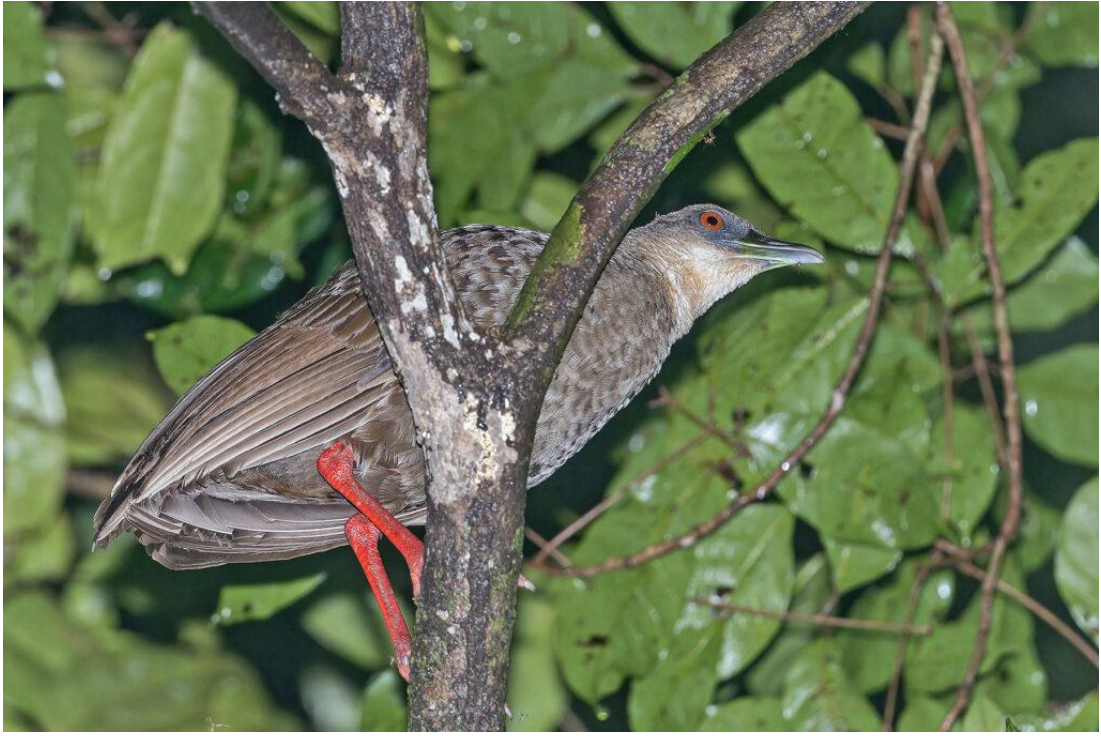
Nkulengu Rail