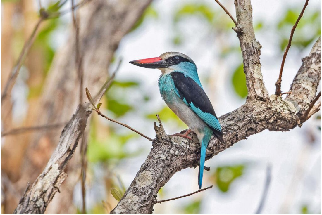
Blue-breasted Kingfisher