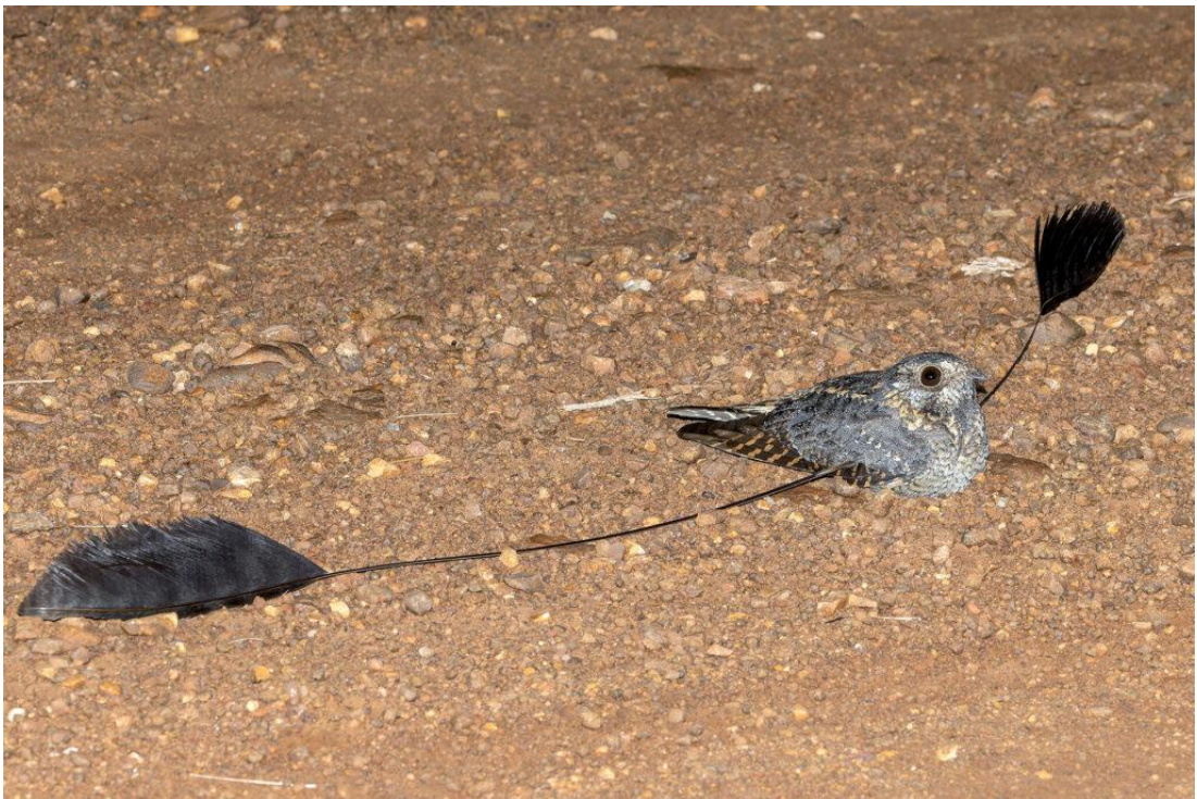
Standard-winged Nightjar