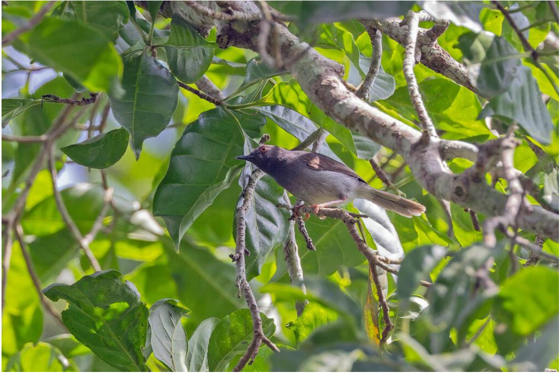
Sharpe's Apalis