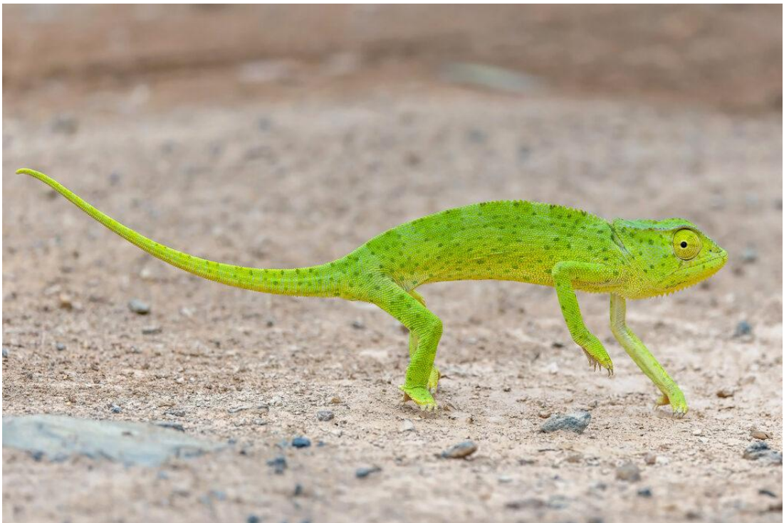
Graceful Chameleon