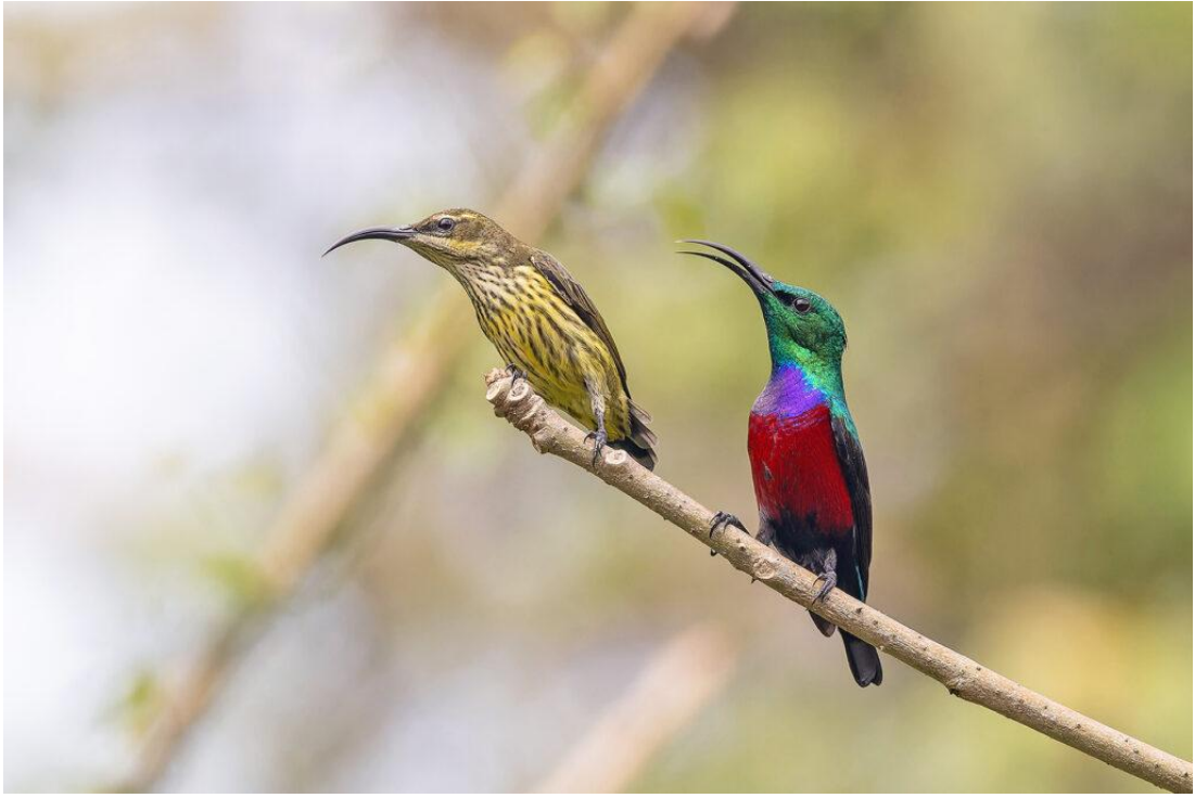
Johanna's Sunbird