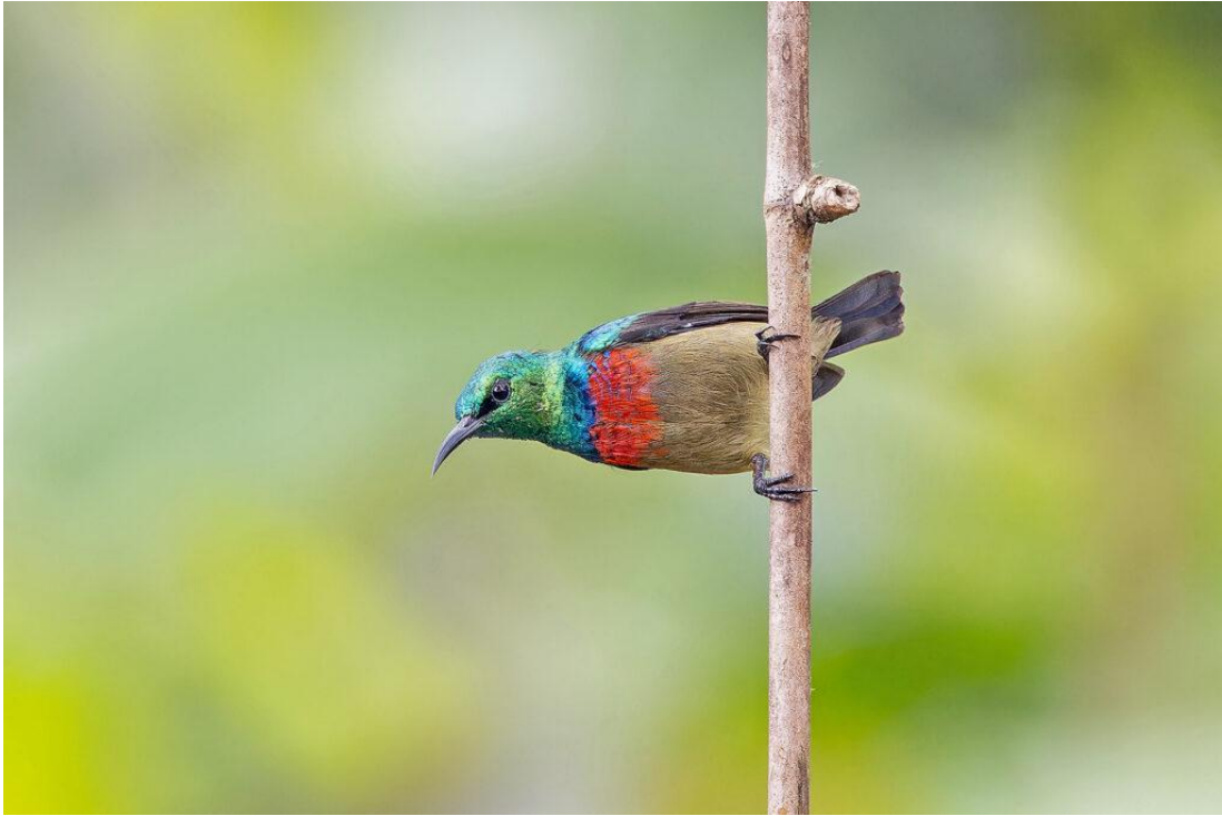
Tiny Sunbird