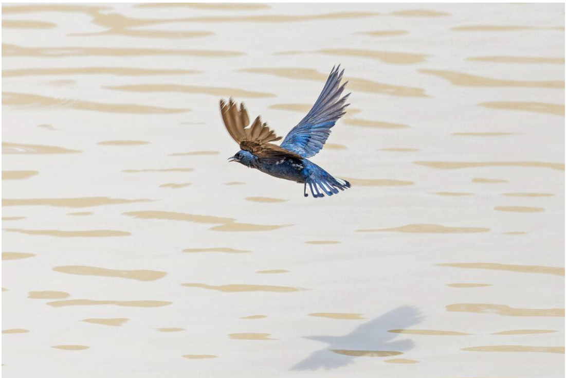
White-bibbed Swallow