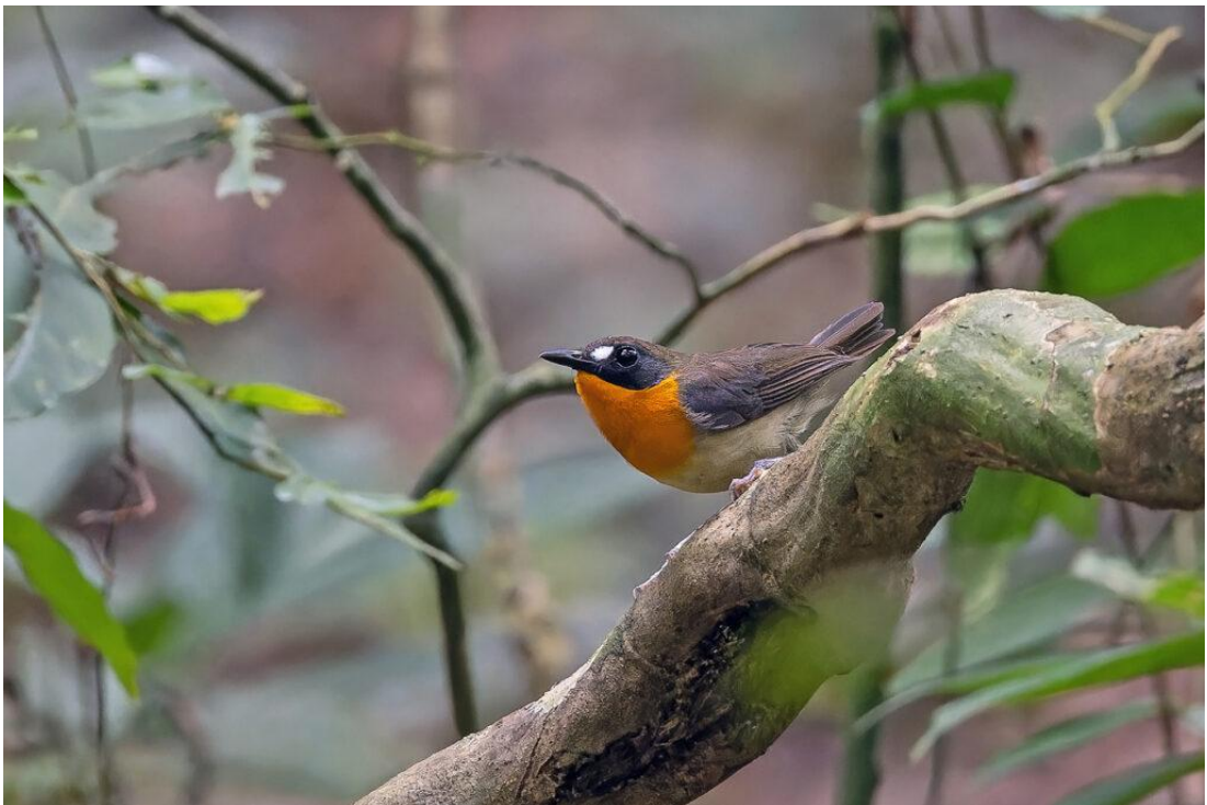
Forest Robin