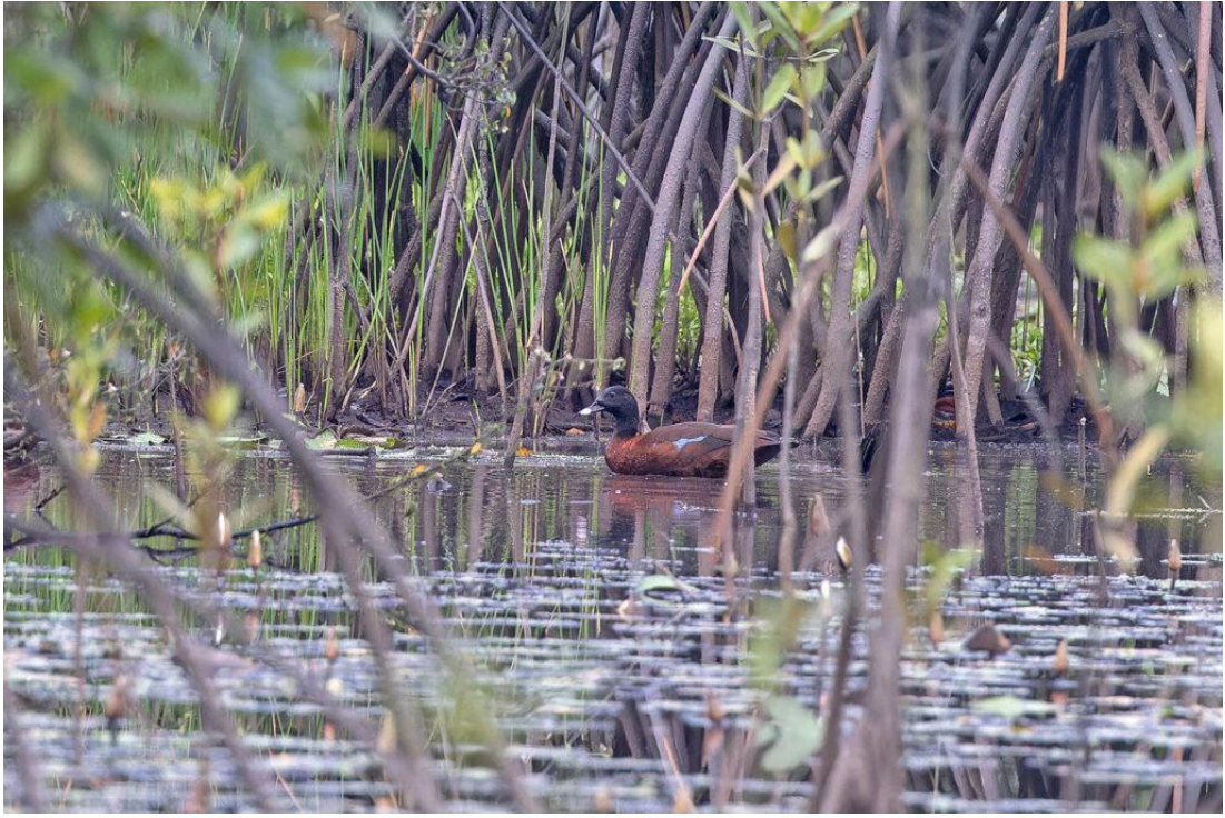
Hartlaub's Duck