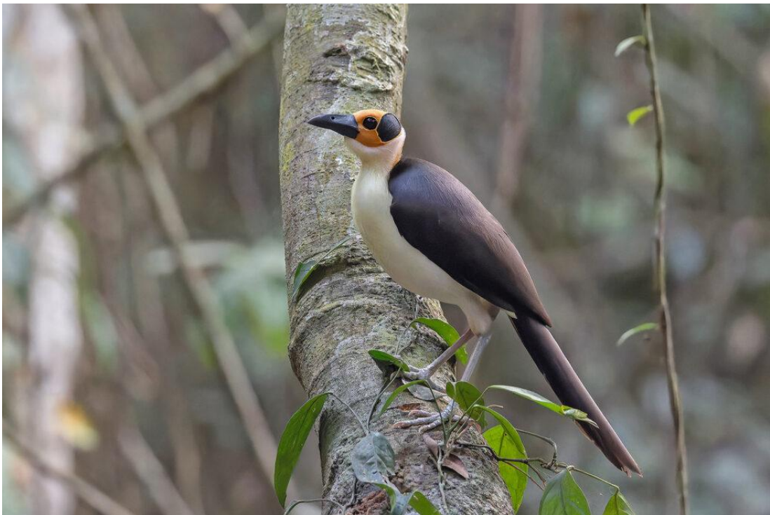
White-necked Rockfowl