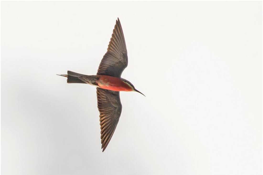
Rosy Bee-eater