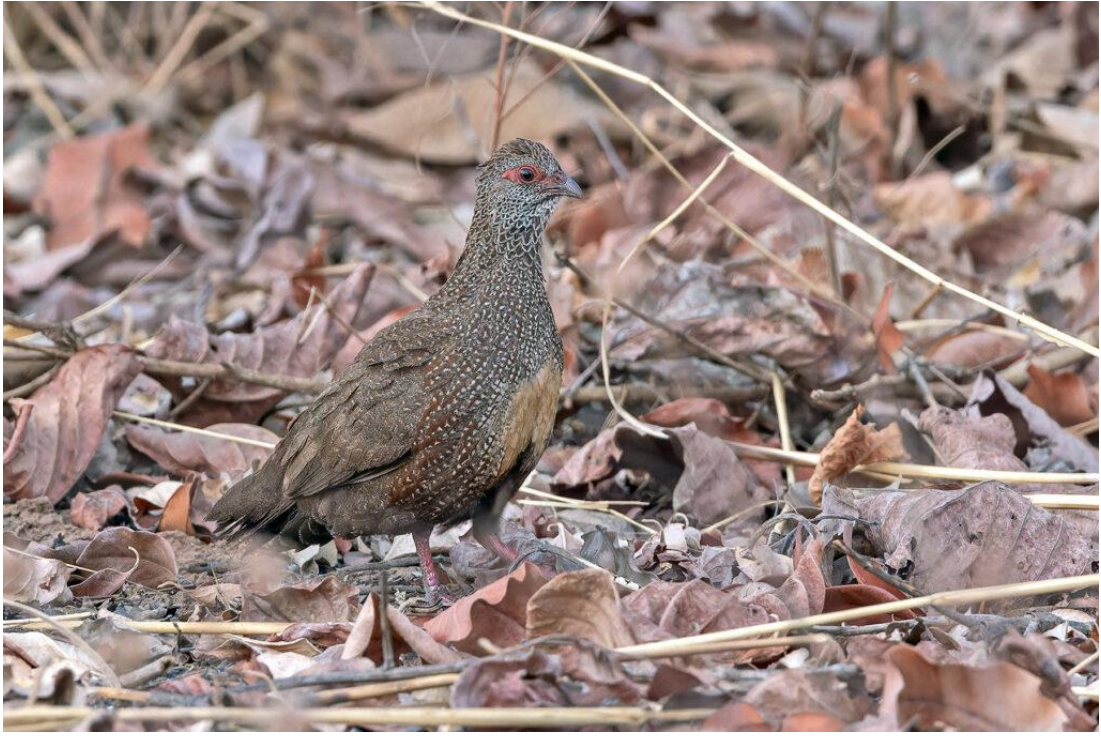
Stone Partridge