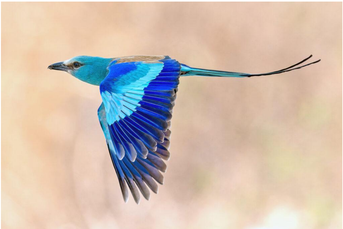
Abyssinian Roller