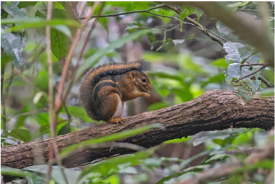
Fire-footed Rope Squirrel