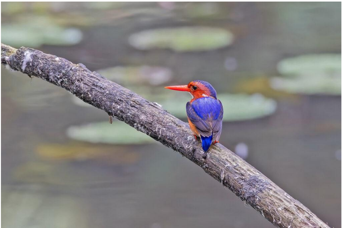
White-bellied Kingfisher