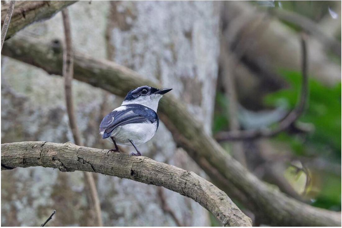
West African Wattle-eye