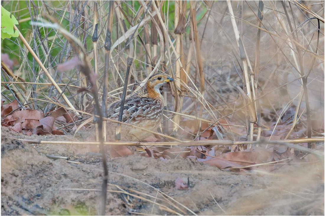
White-throated Francolin