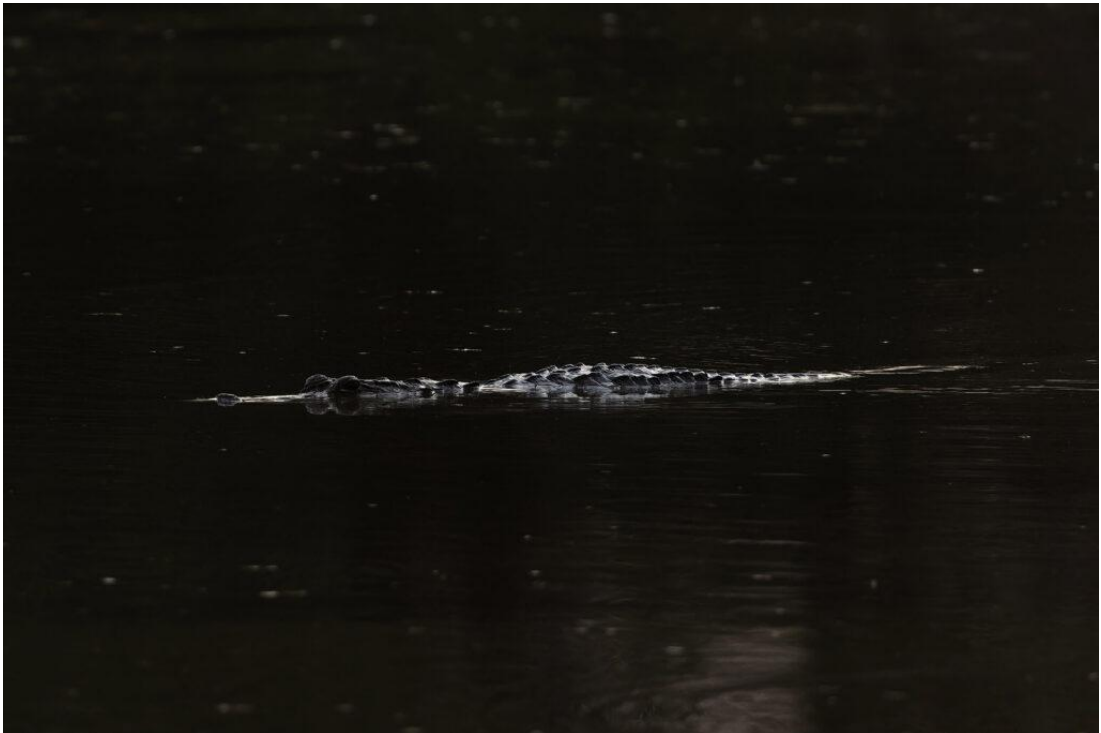
Nile Crocodile