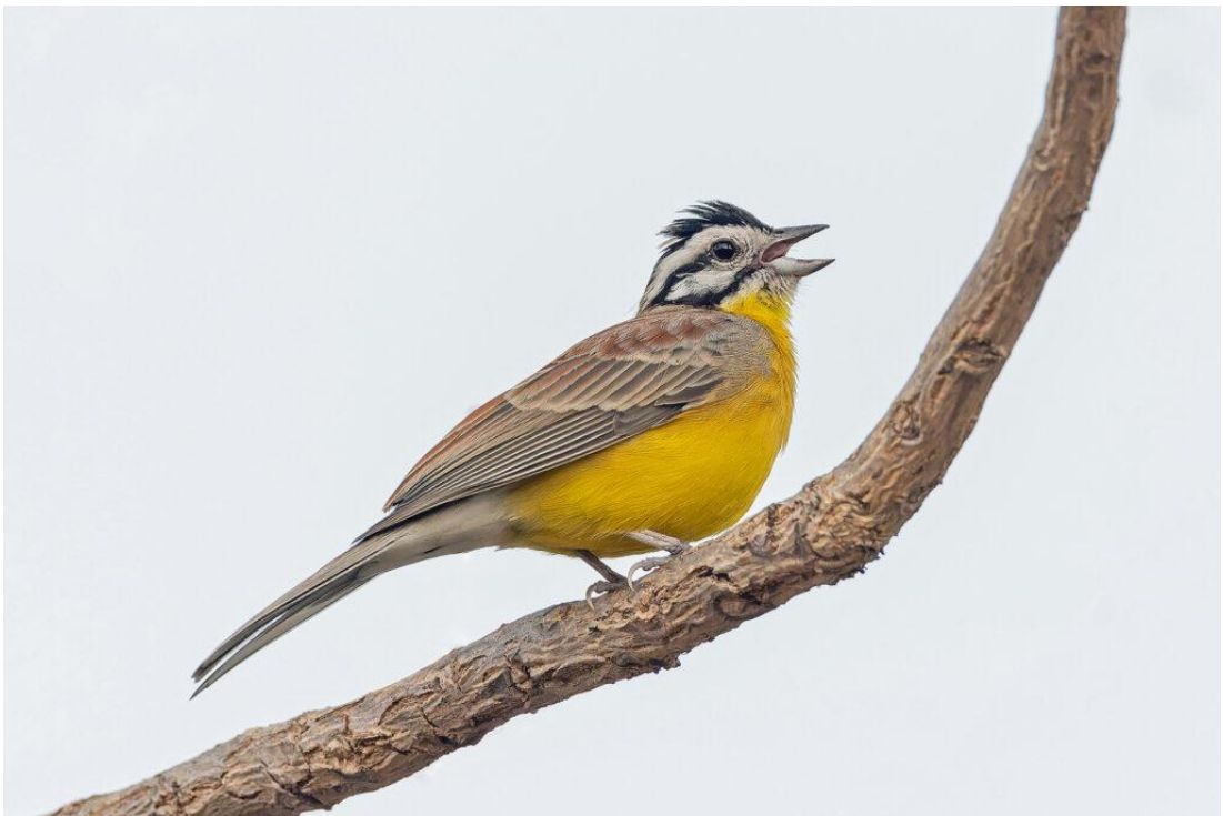
Brown-rumped Bunting