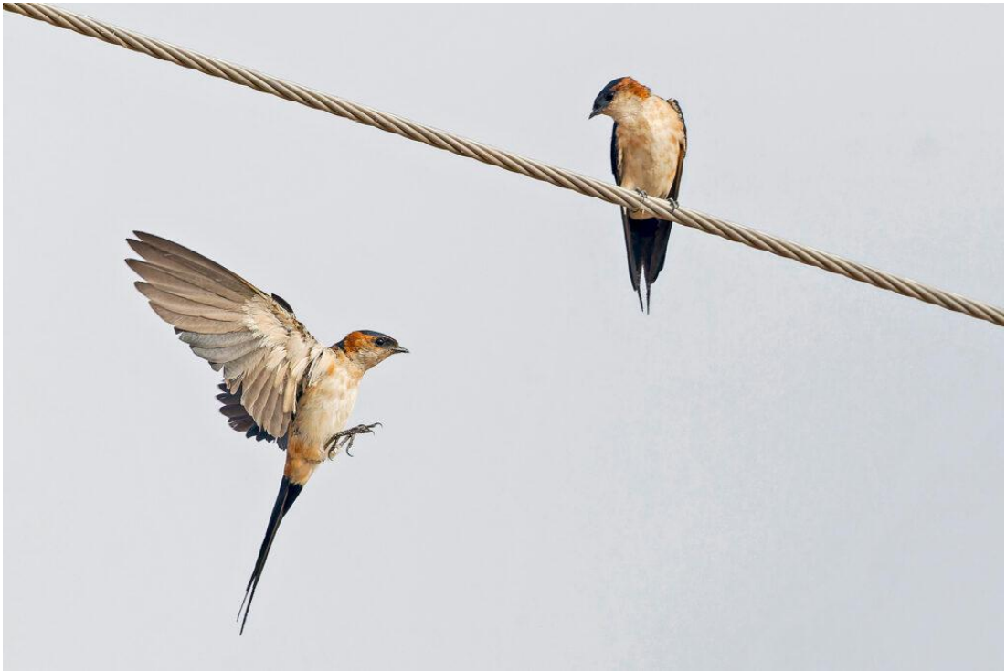
West African Swallow