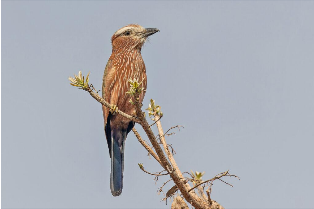
Purple Roller