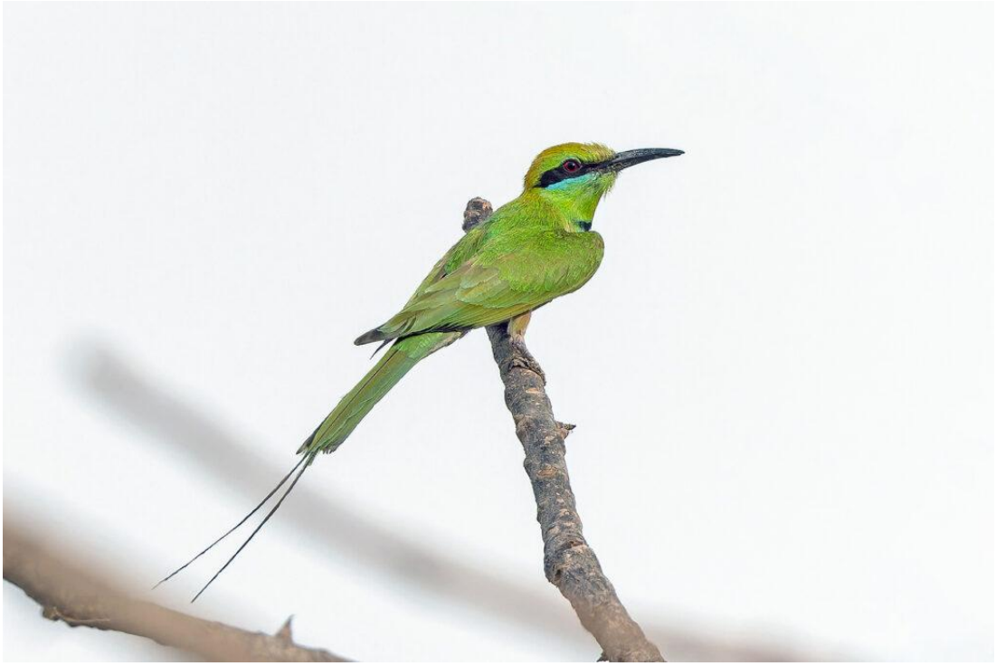
African Green Bee-eater