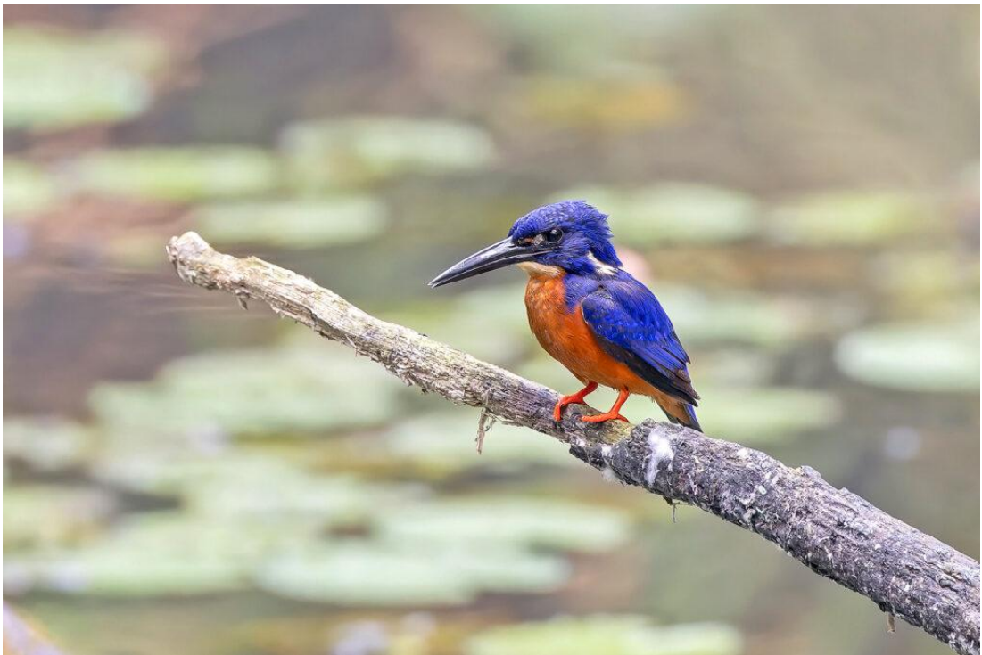
Shining-blue Kingfisher