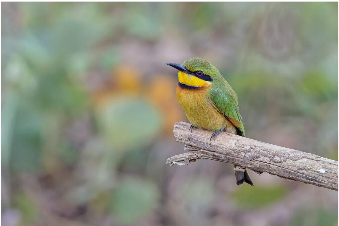
Little Bee-eater