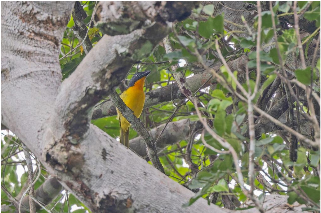
Lagden's Bushshrike