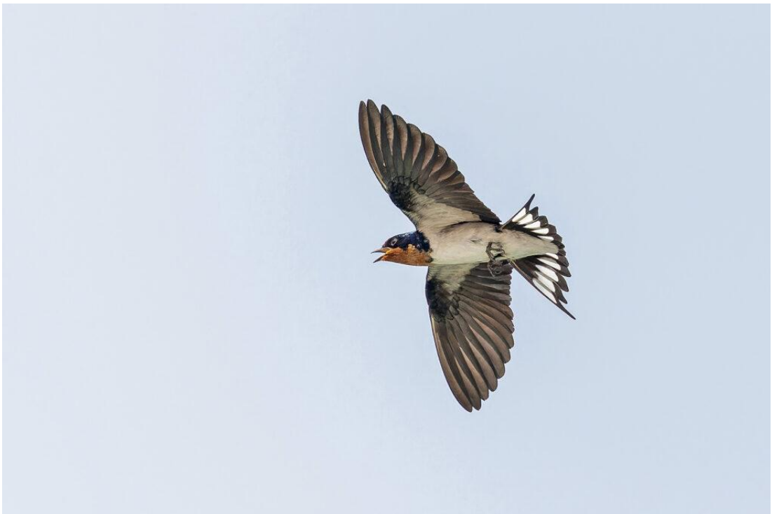
Red-chested Swallow