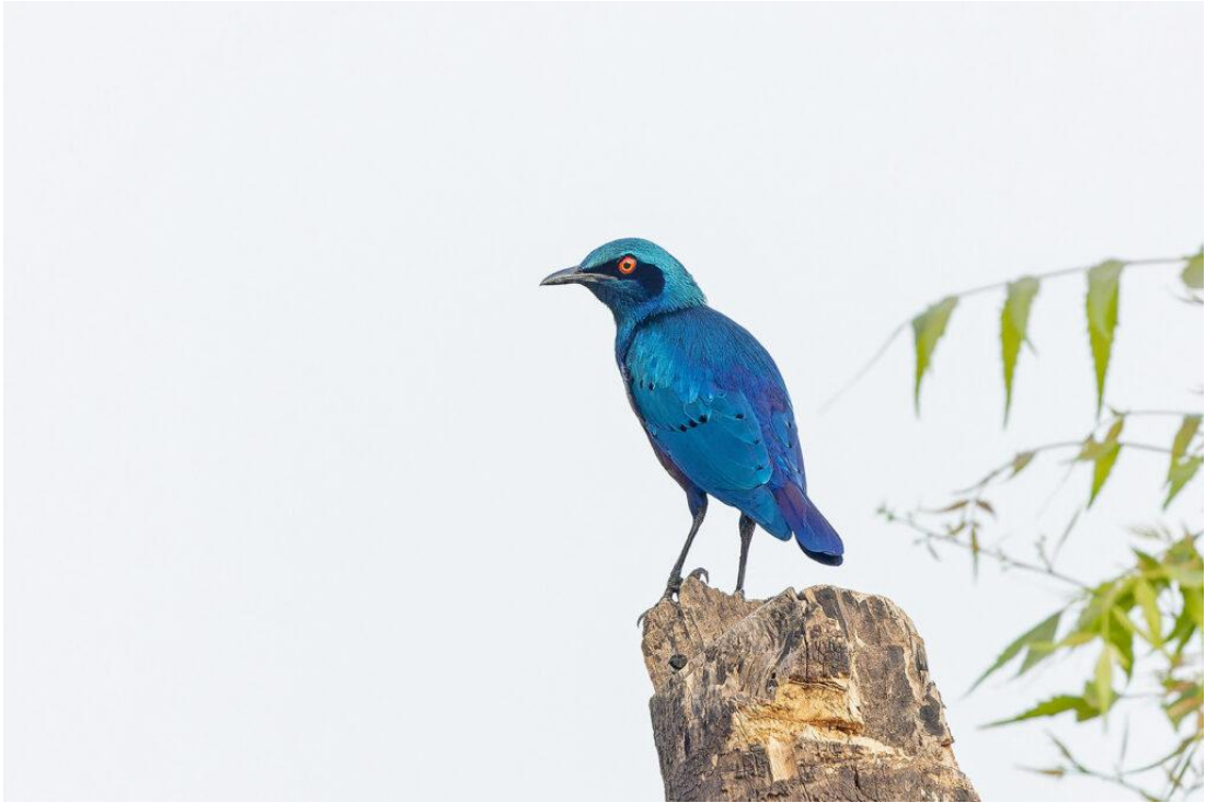
Bronze-tailed Starling