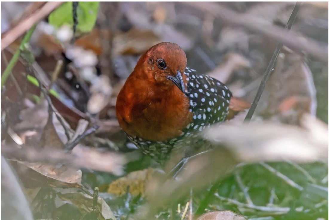
White-spotted Flufftail