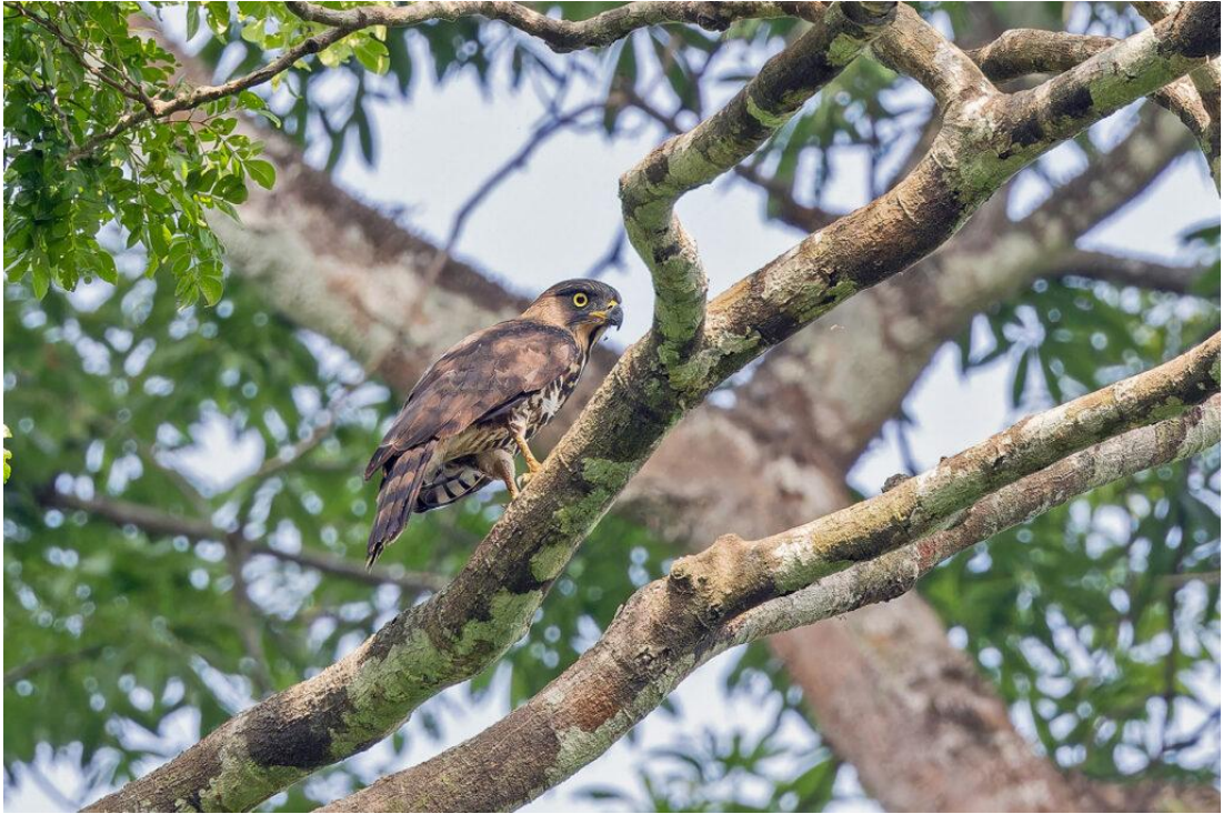
Congo Serpent Eagle