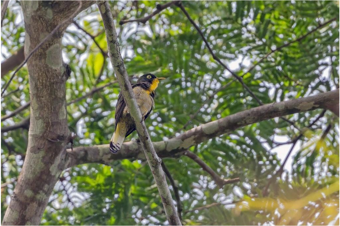
Yellow-throated Cuckoo