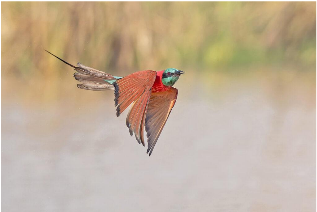
Northern Carmine Bee-eater