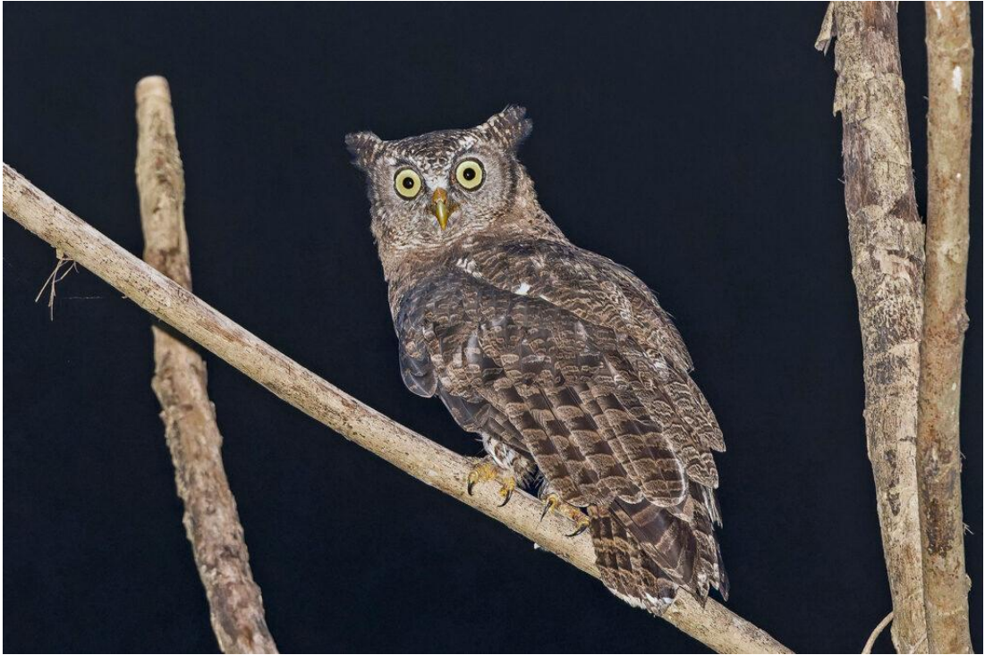
Akun Eagle-Owl