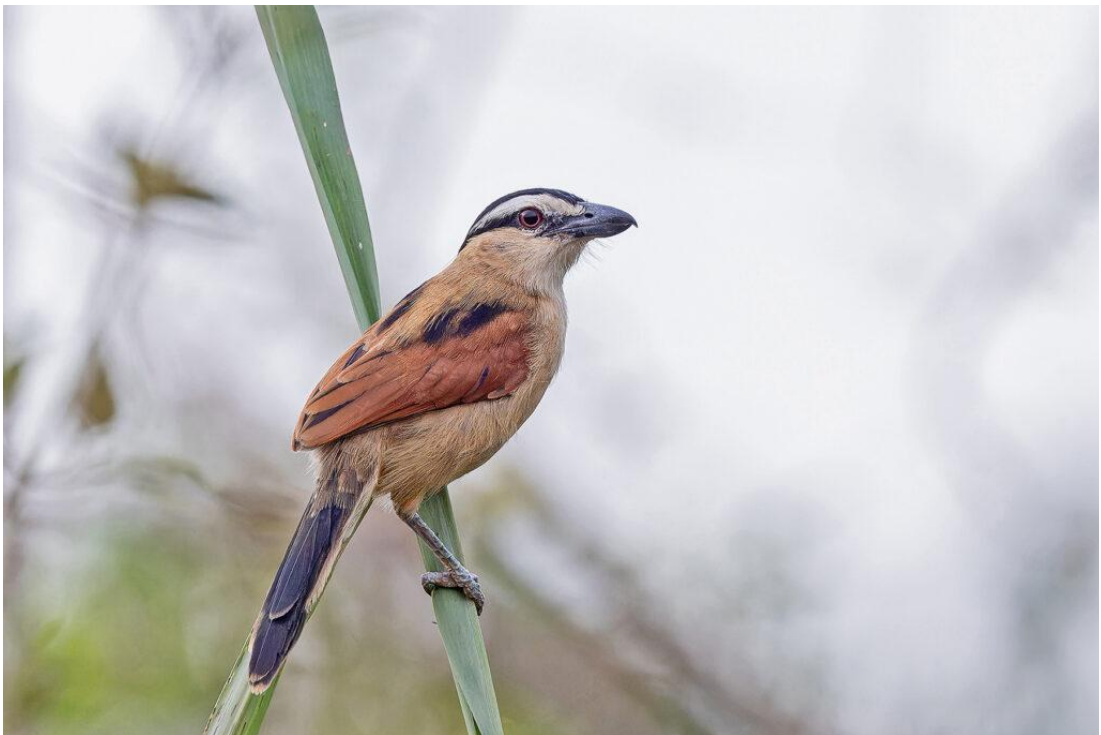
Marsh Tchagra