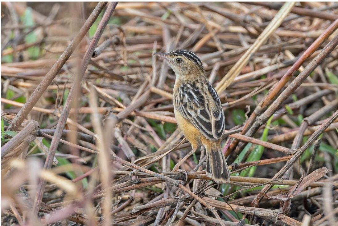
Black-backed Cisticola