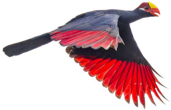
Violet Turaco