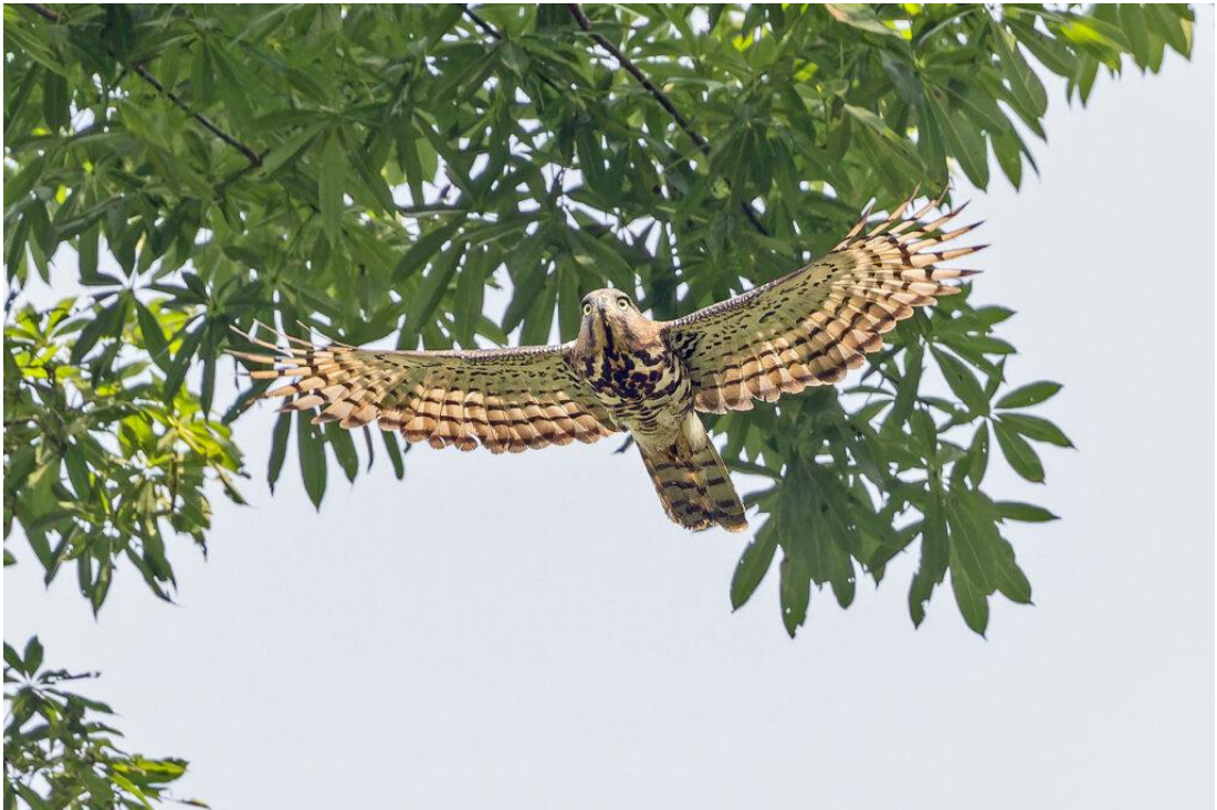
Congo Serpent Eagle