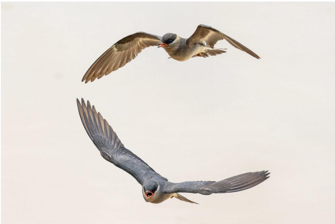
Rock Pratincoles