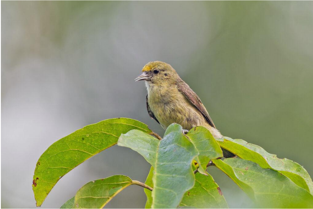
Forest Penduline Tit