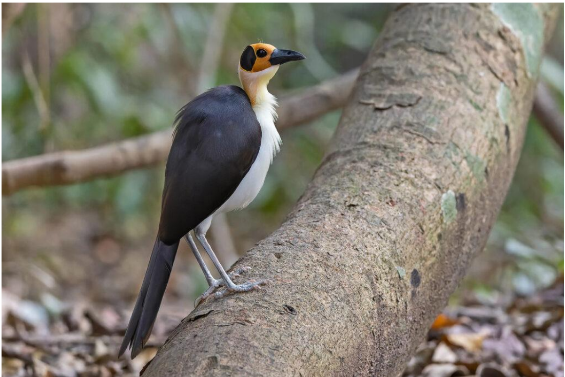
White-necked Rockfowl