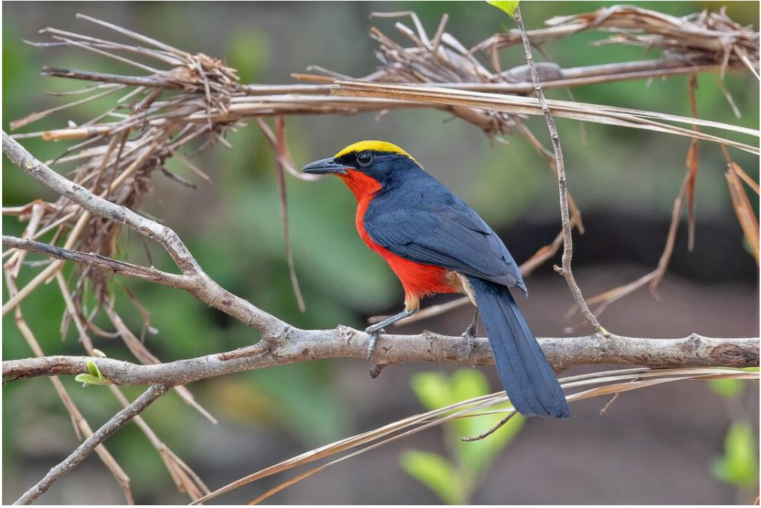
Yellow-crowned Gonolek (image by Pete Morris)