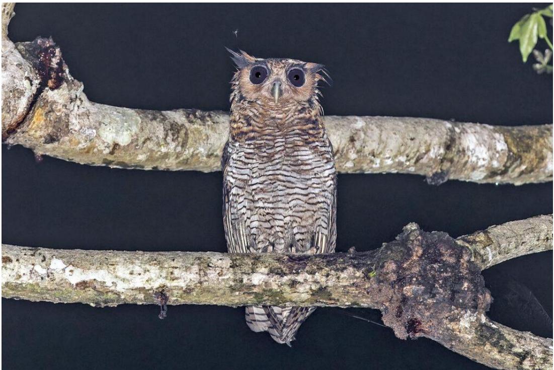
Fraser's Eagle-Owl