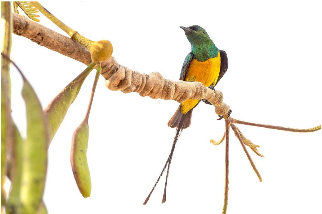
Pygmy Sunbird