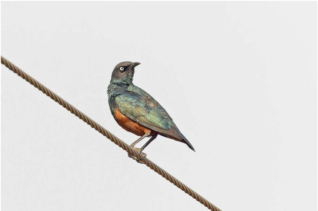
Chestnut-bellied Starling