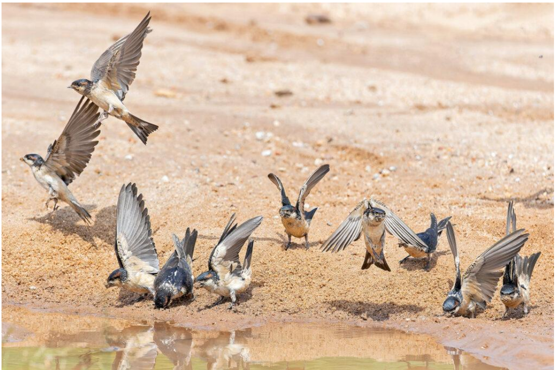
Preuss's Cliff Swallows