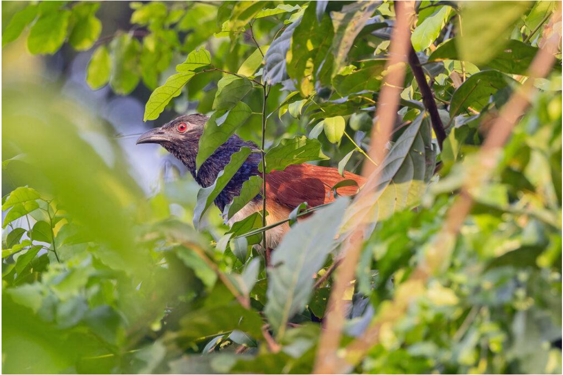
Black-throated Coucal