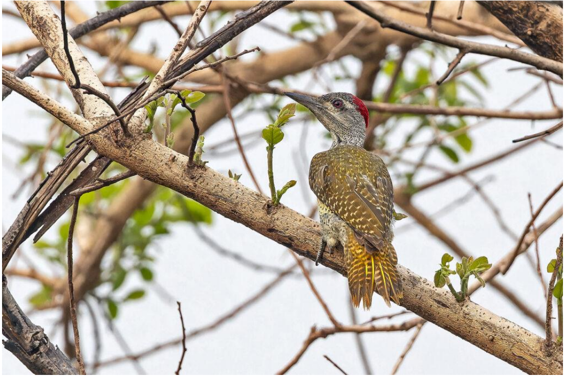
Fine-spotted Woodpecker