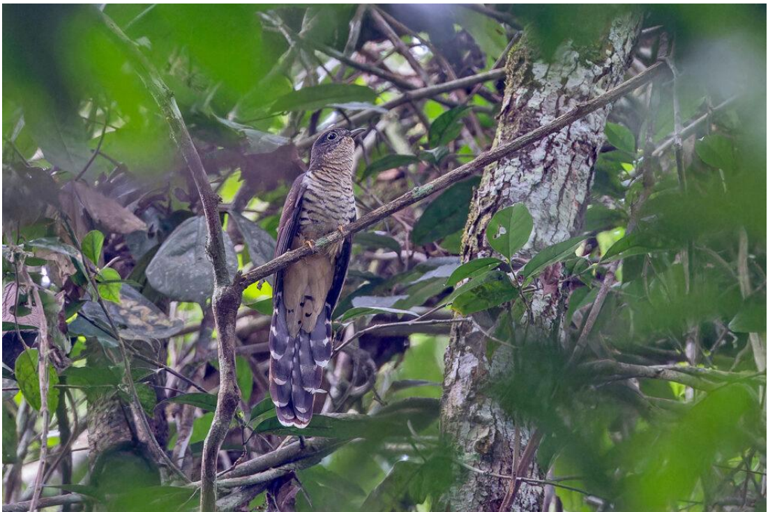
Olive Long-tailed Cuckoo