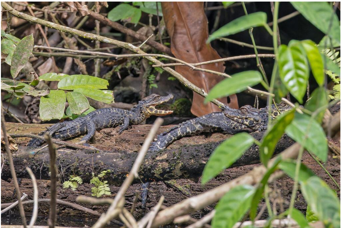
Dwarf Crocodiles