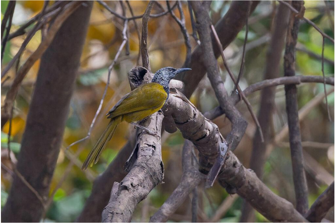
Oriole Warbler