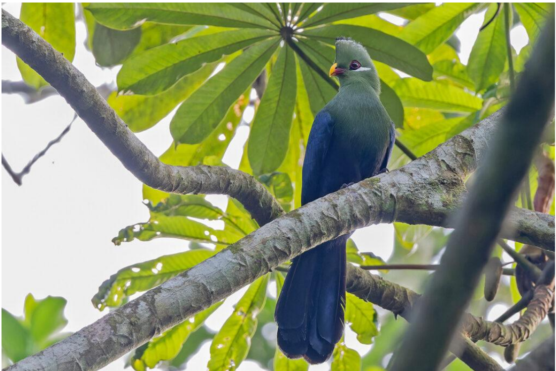
Yellow-billed Turaco