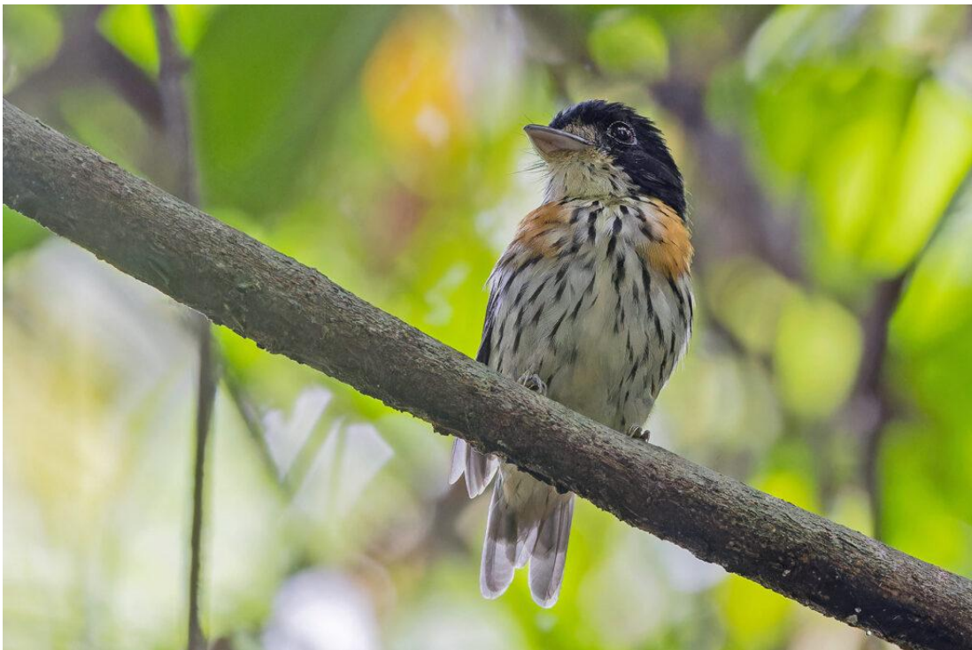
Rufous-sided Broadbill