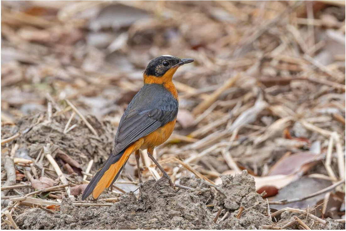
Snowy-crowned Robin-Chat