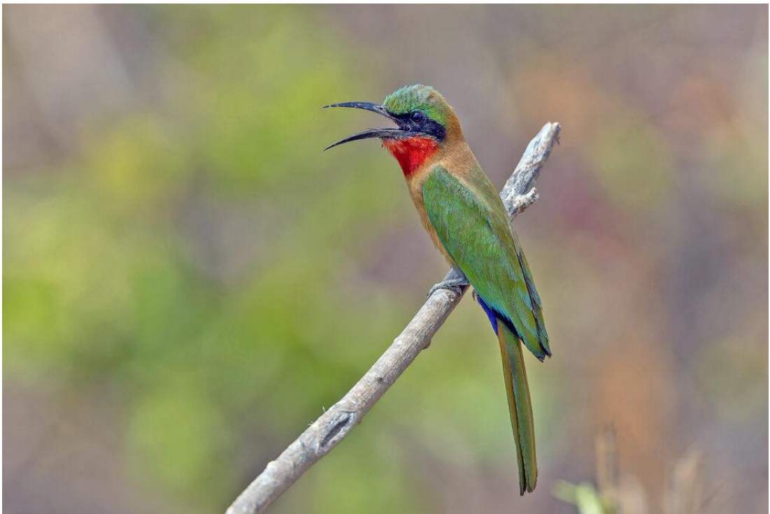
Red-throated Bee-eater