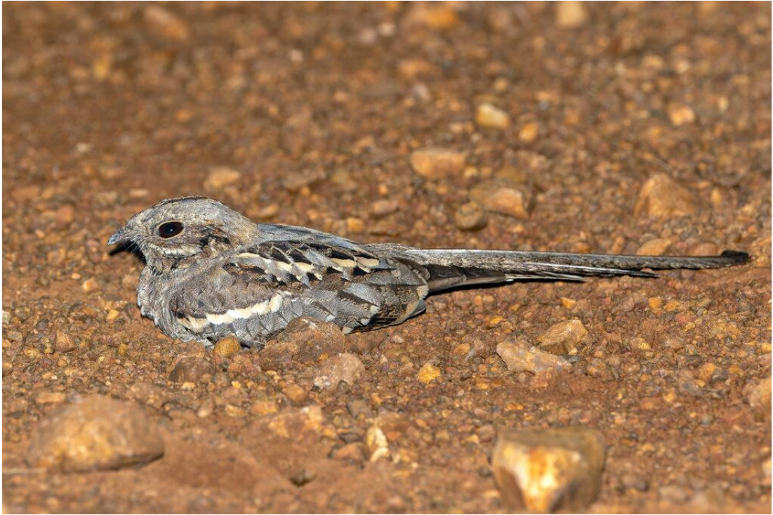
Long-tailed Nightjar