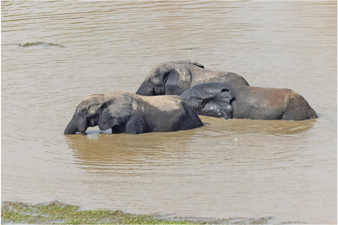
African Elephants