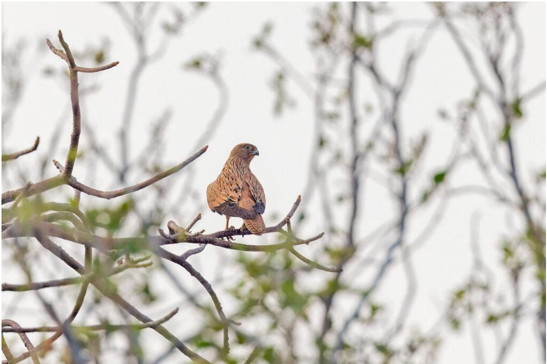
Fox Kestrel