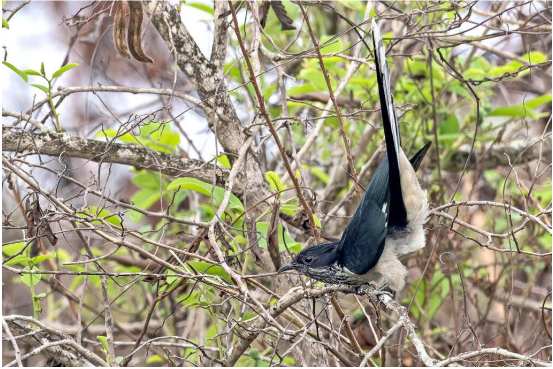
Levaillant's Cuckoo