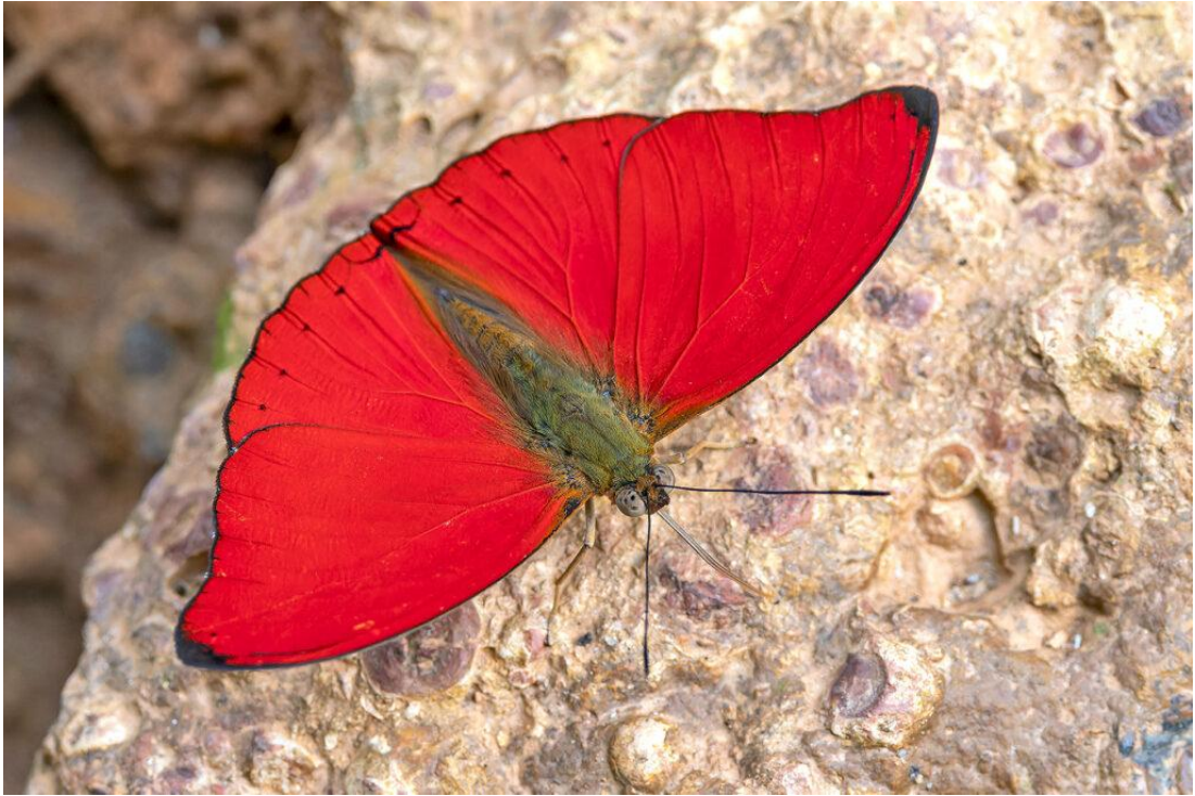
Attewa Butterfly