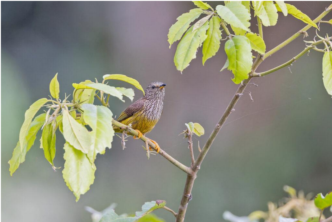
Tit-Hylia