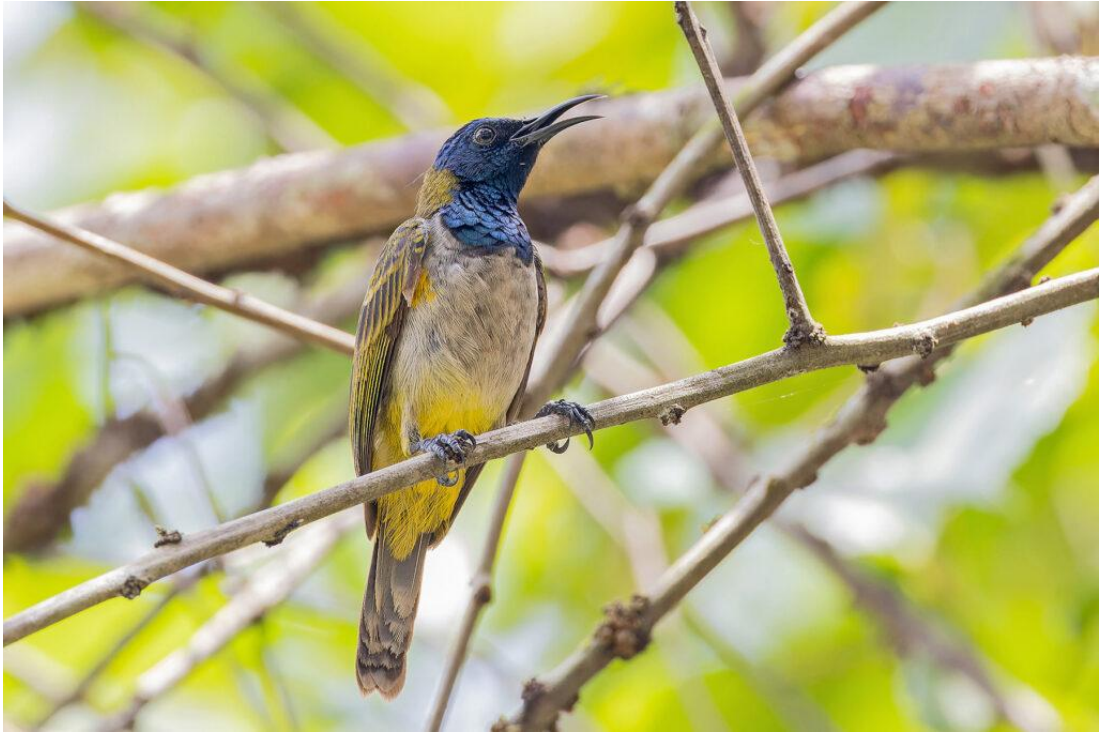
Reichenbach's Sunbird