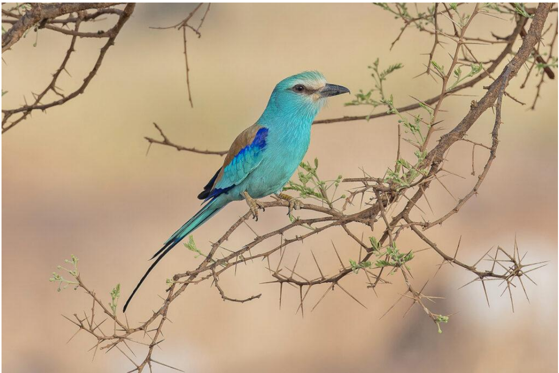
Abyssinian Roller