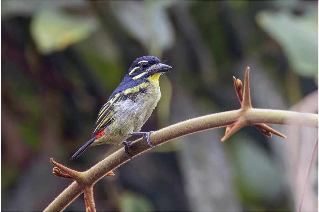
Red-rumped Tinkerbird