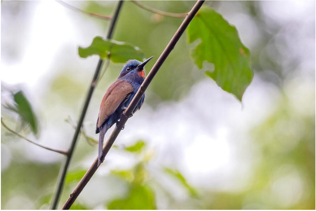
Blue-moustached Bee-Eater