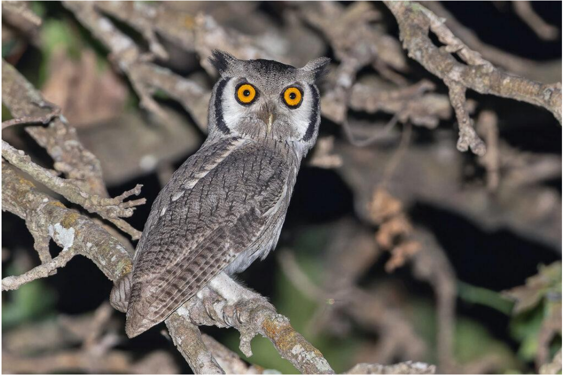
Northern White-faced Owl