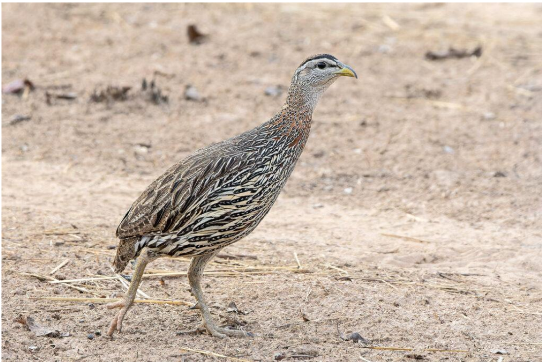
Double-spurred Francolin