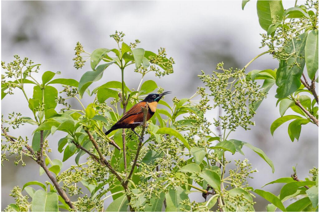
Buff-throated Sunbird