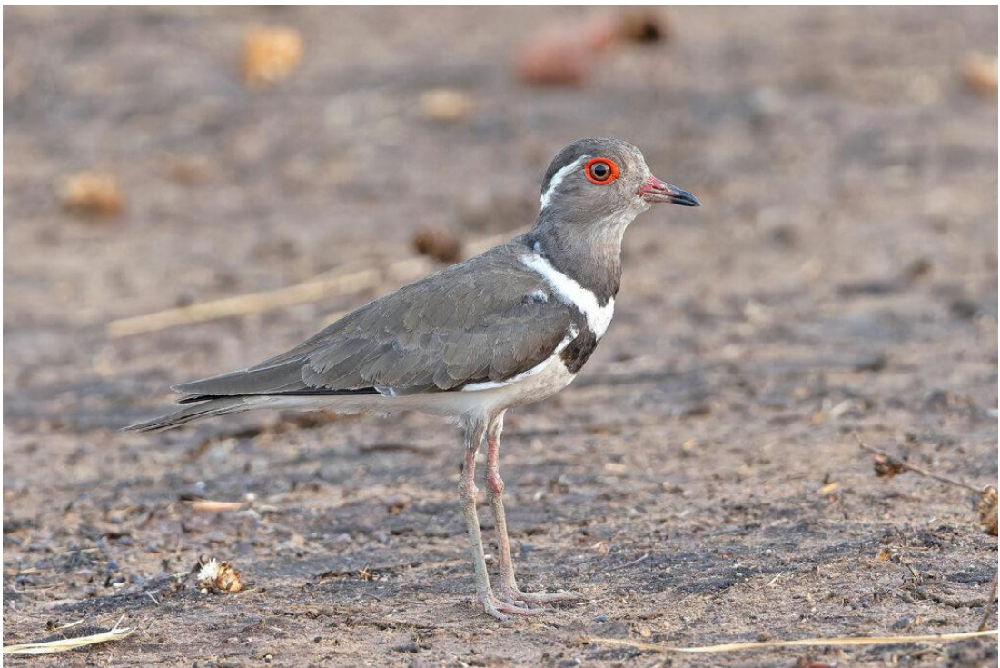
Forbes's Plover