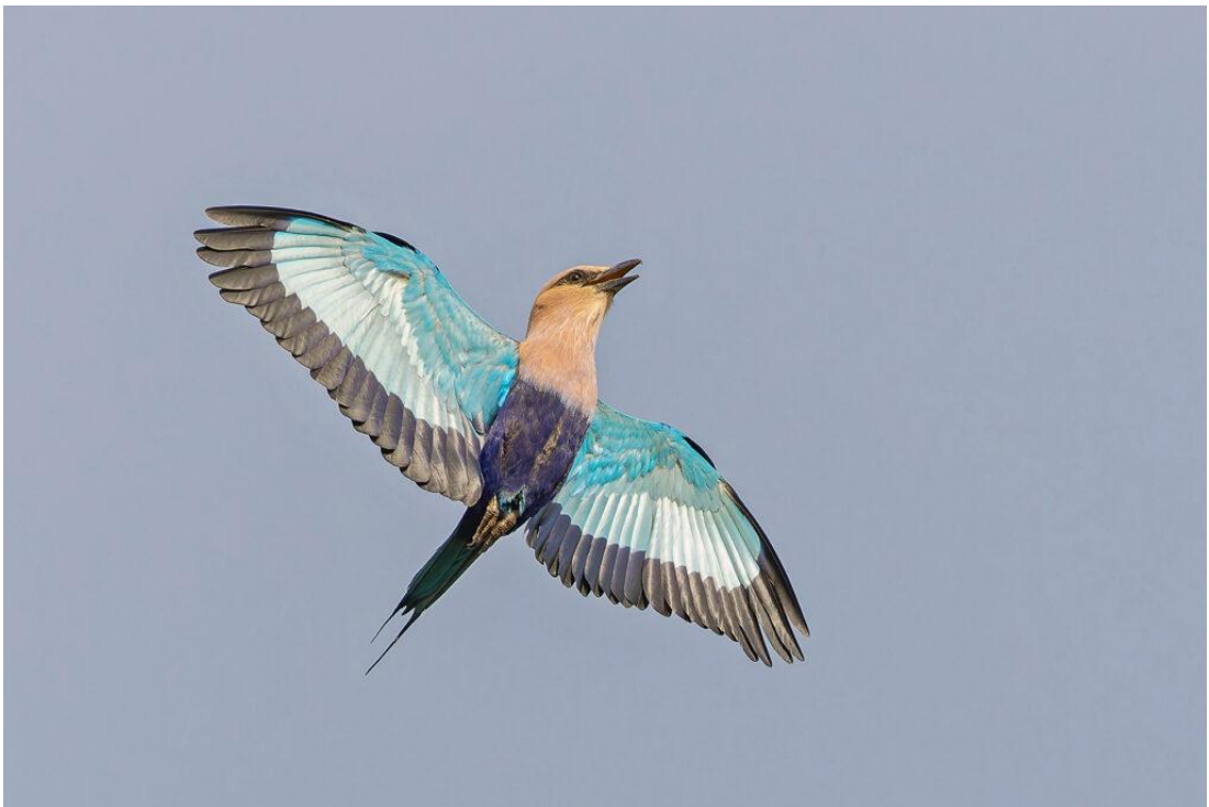
Blue-bellied Roller