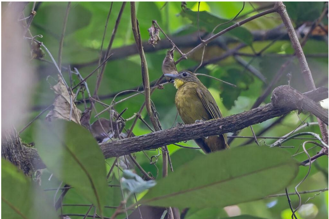
Yellow-bearded Greenbul