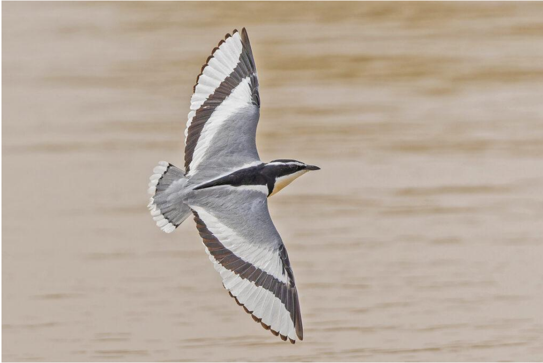
Egyptian Plover