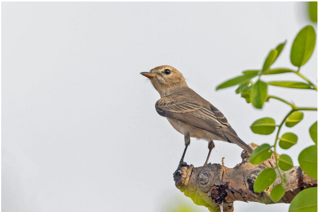
Gambaga Flycatcher