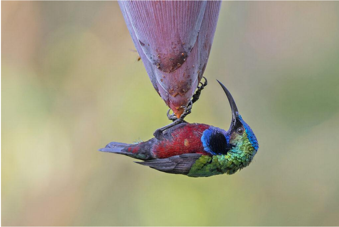
Superb Sunbird