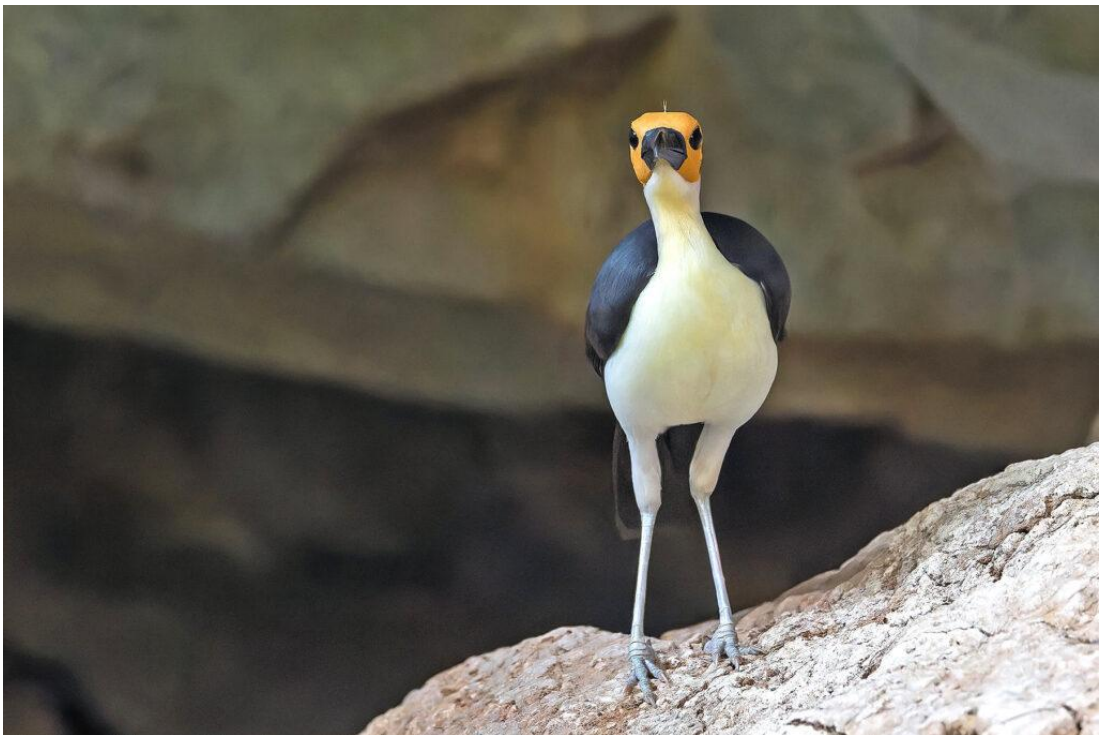
White-necked Rockfowl