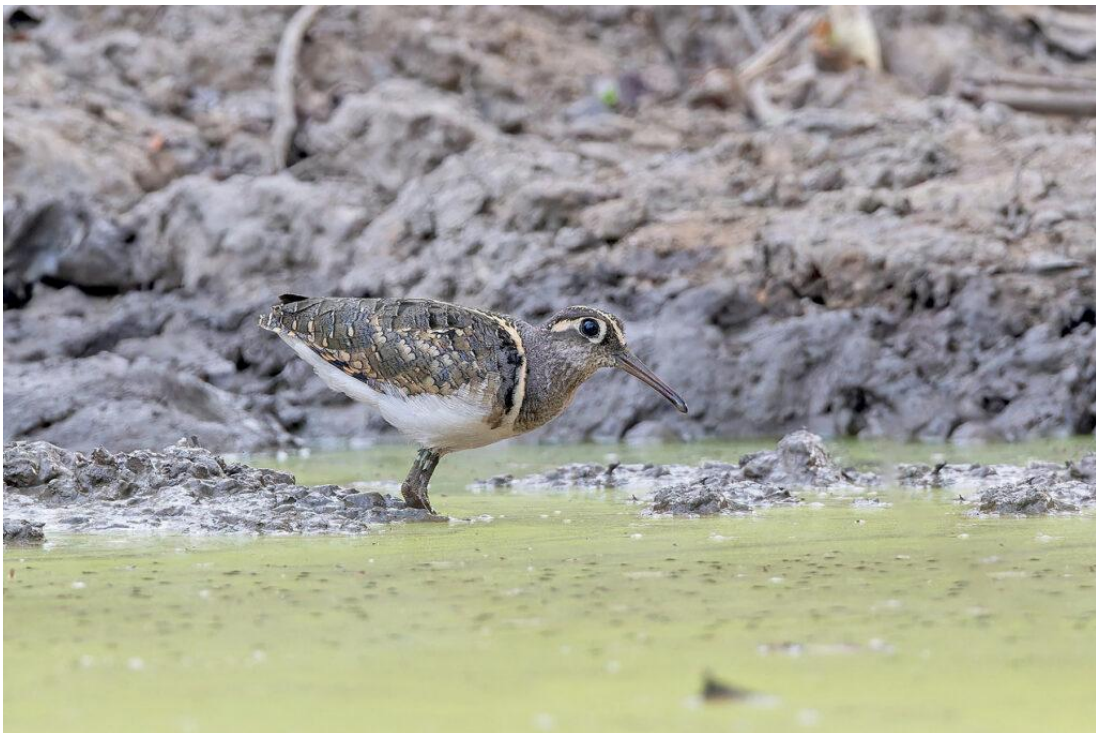
Greater Painted-snipe