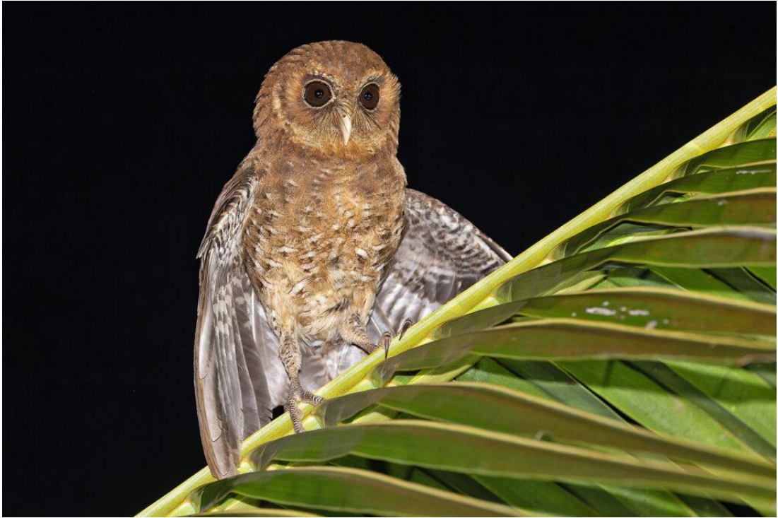
Palau Owl