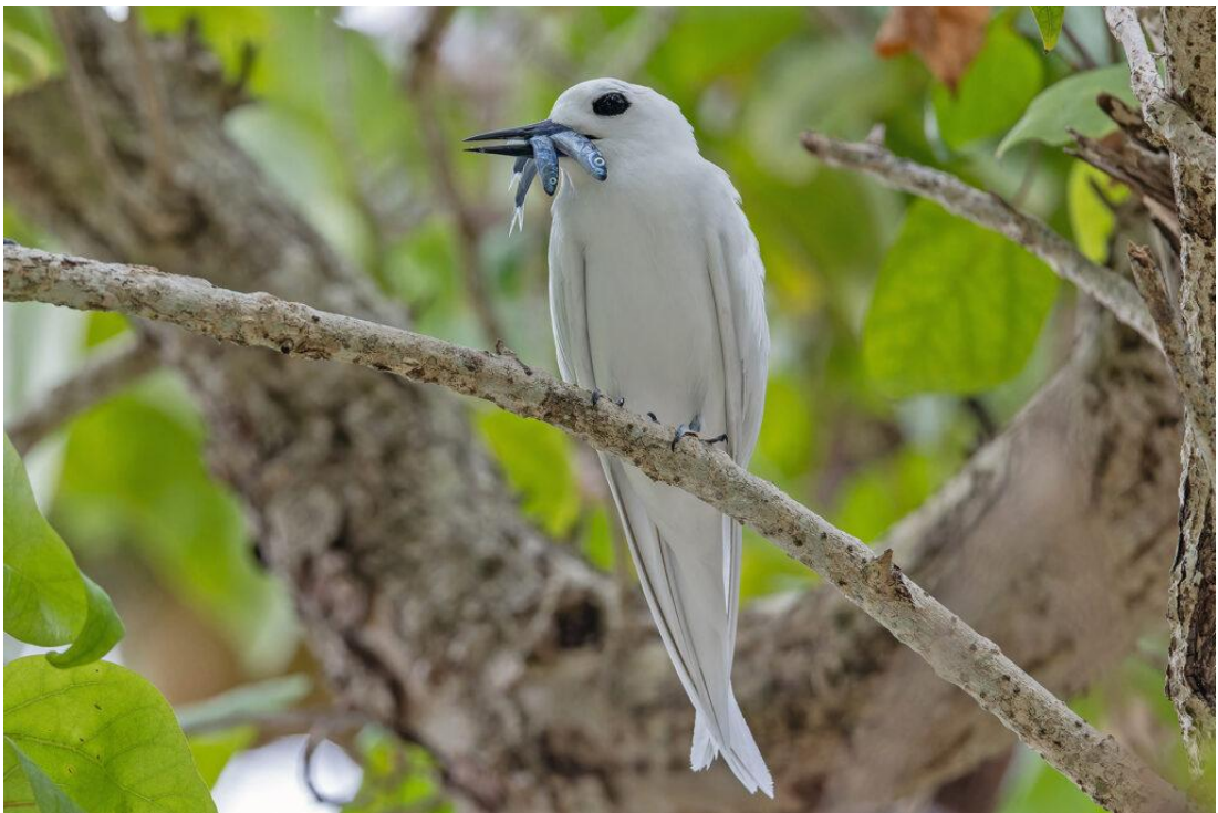
Common White Tern