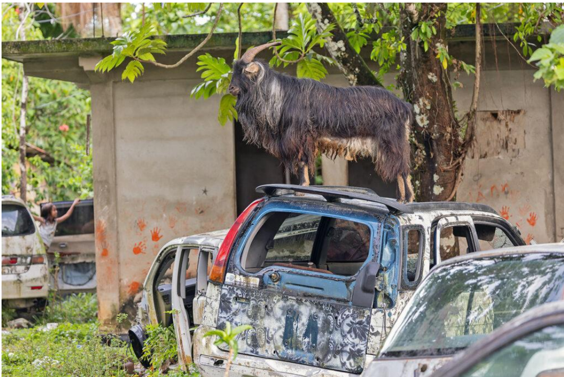
Goat overlooking its scrapyard on Chuuk