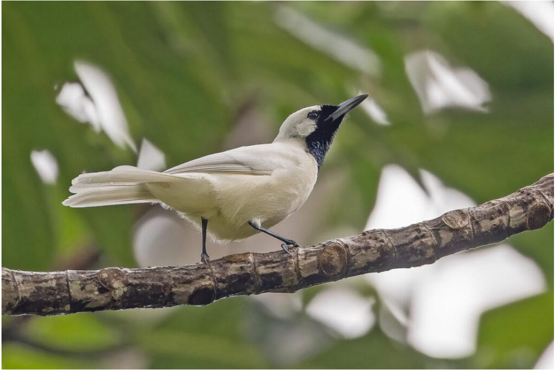
Chuuk Monarch