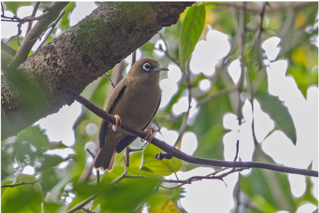
Olive-colored White-eye