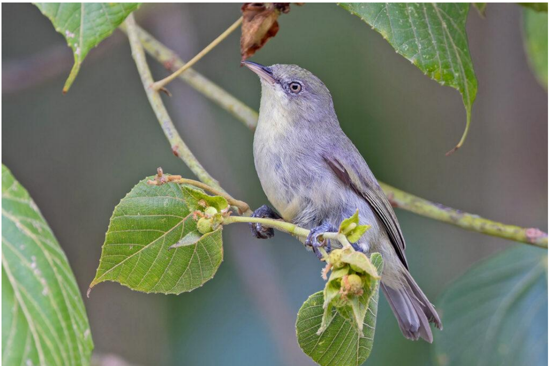
Plain White-eye