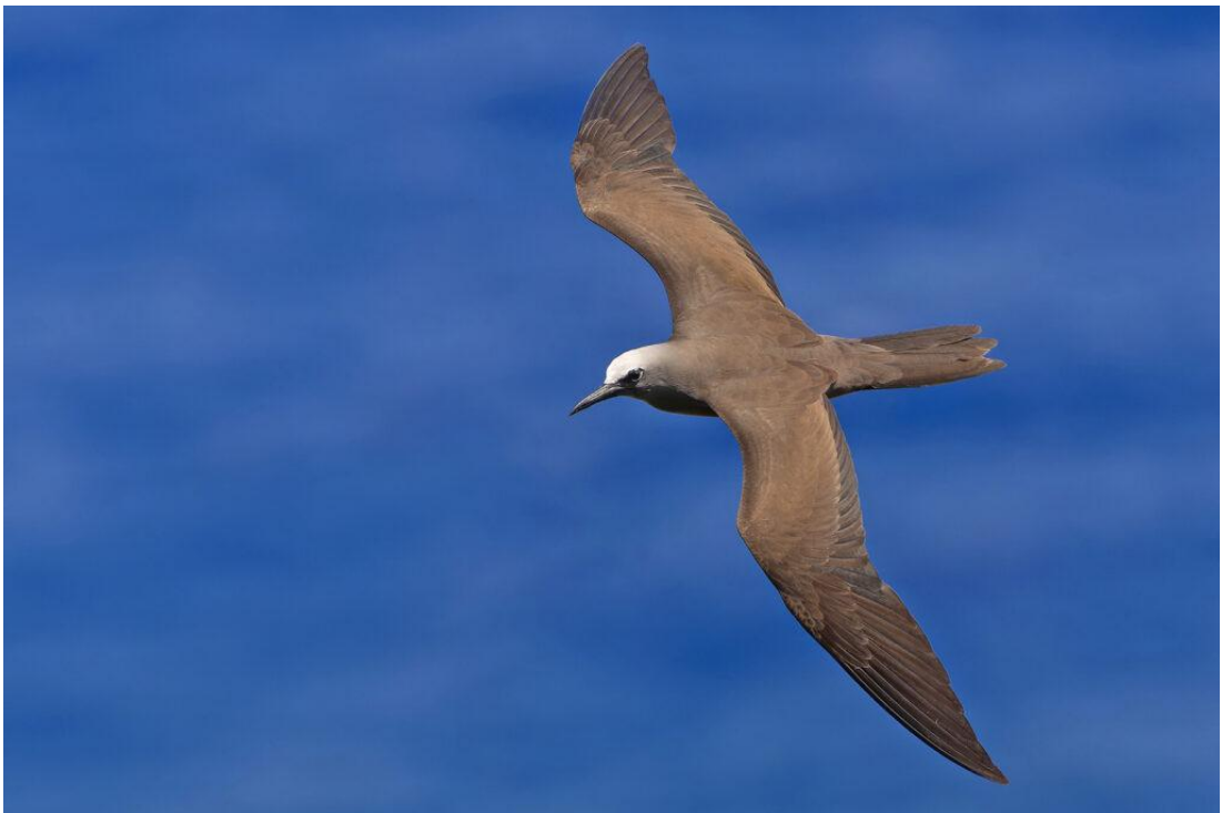
Brown Noddy