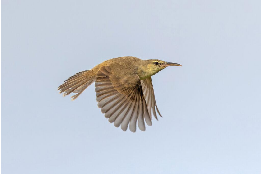
Saipan Reed Warbler