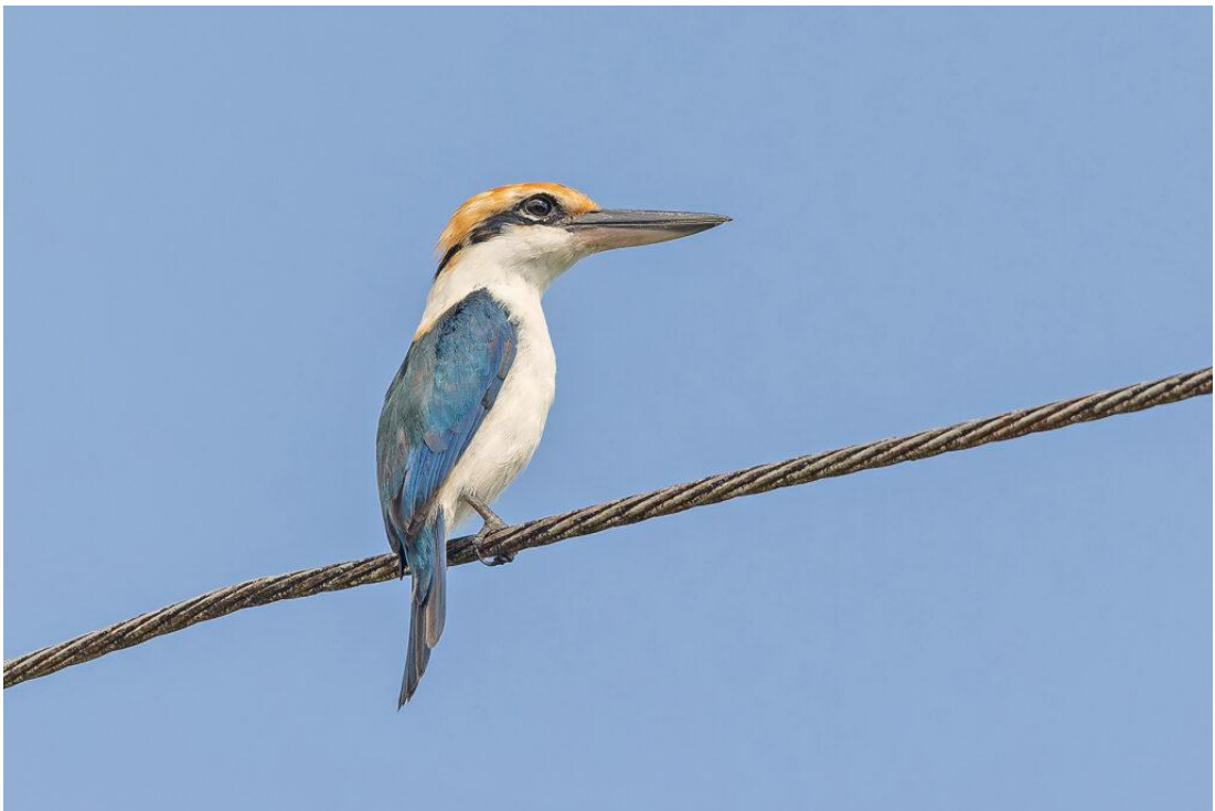
Rusty-capped Kingfisher