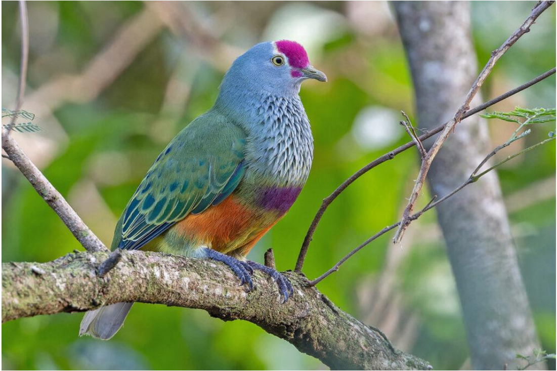
Mariana Fruit Dove