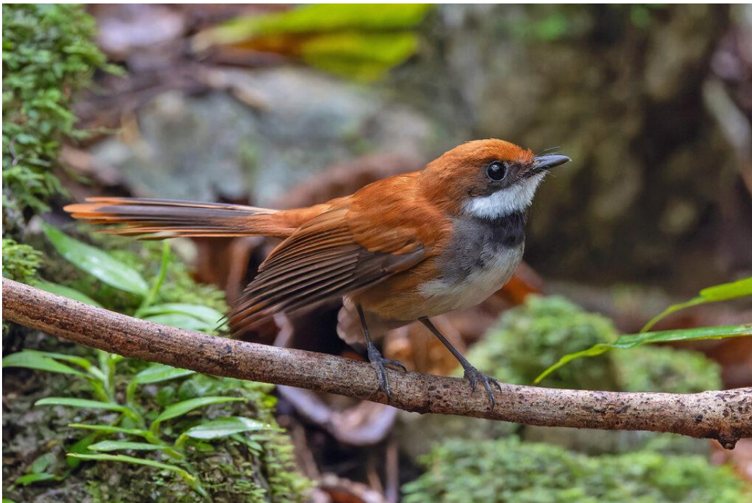
Palau Fantail