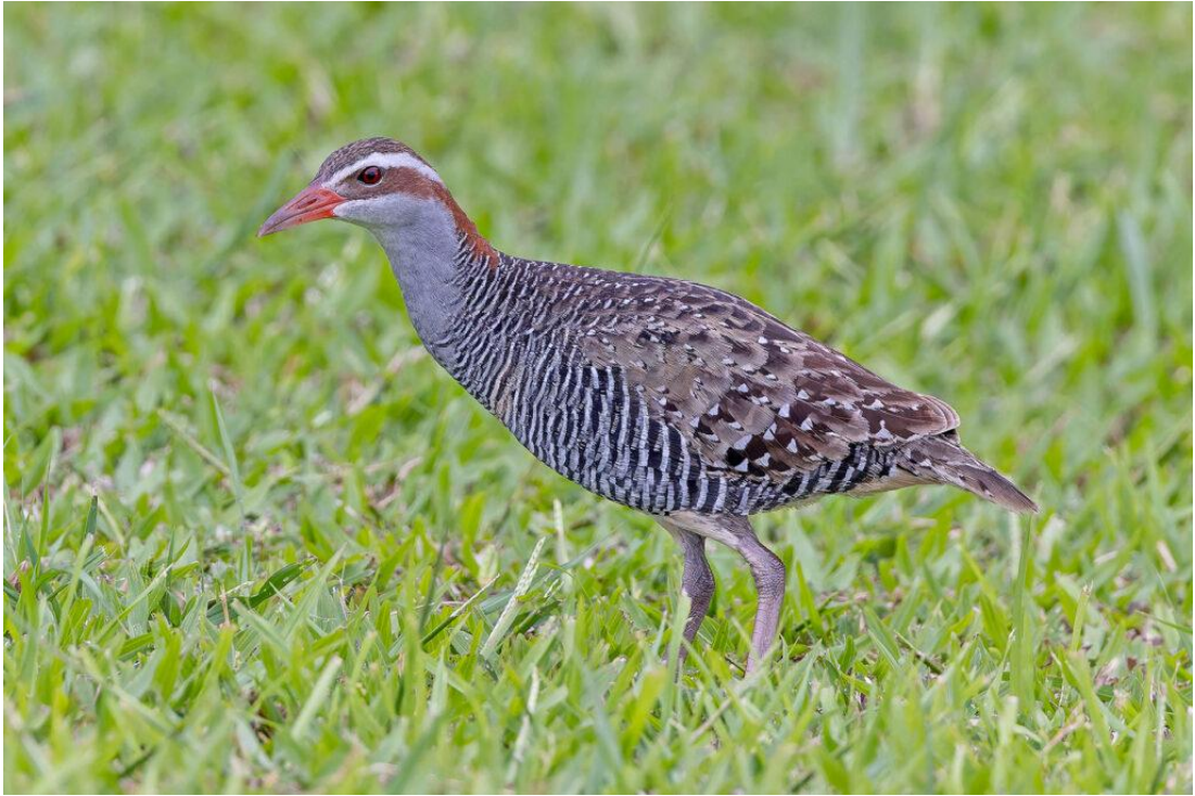
Buff-banded Rail