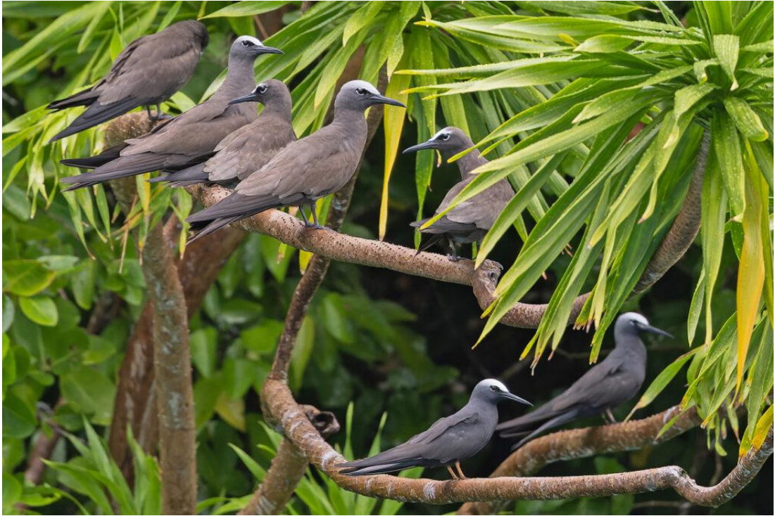
Brown and Black Noddies