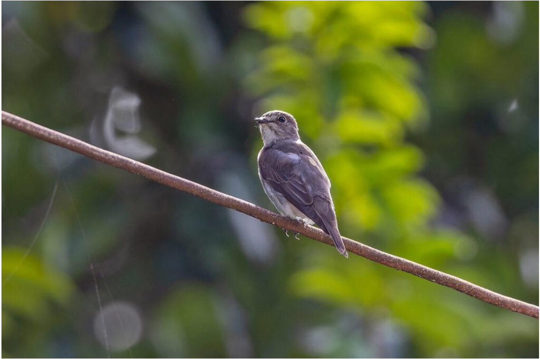
Grey-streaked Flycatcher