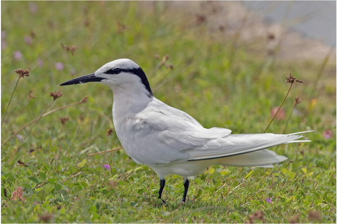
Black-naped Tern