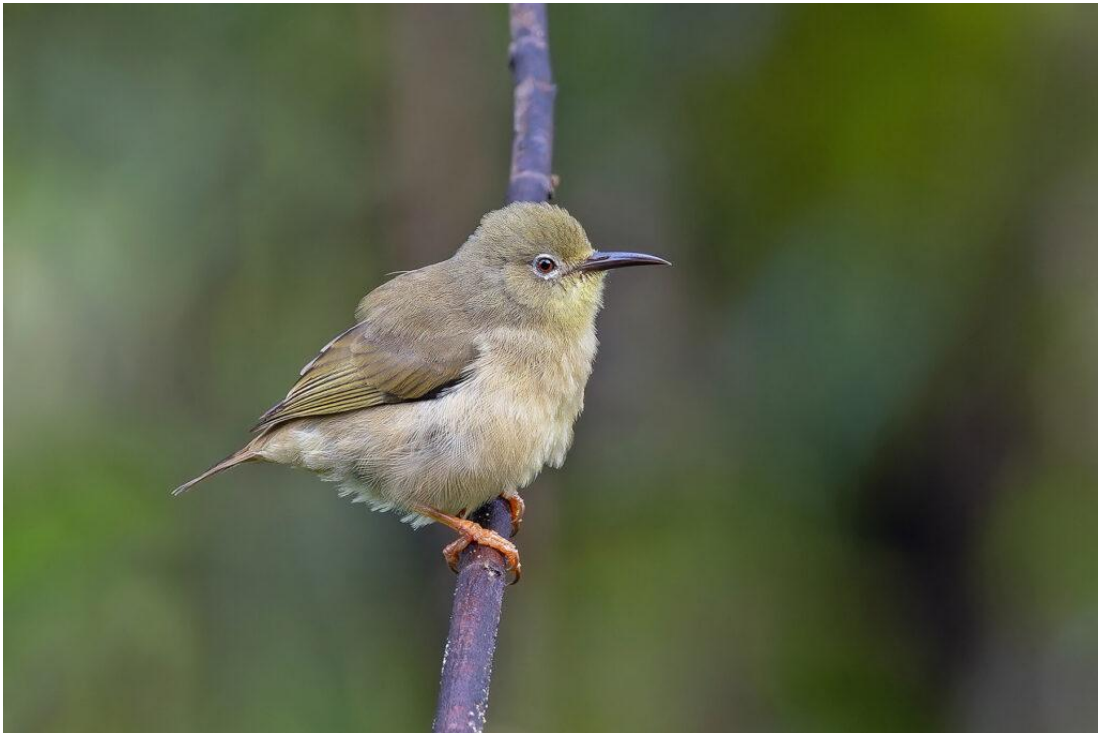
Long-billed White-eye