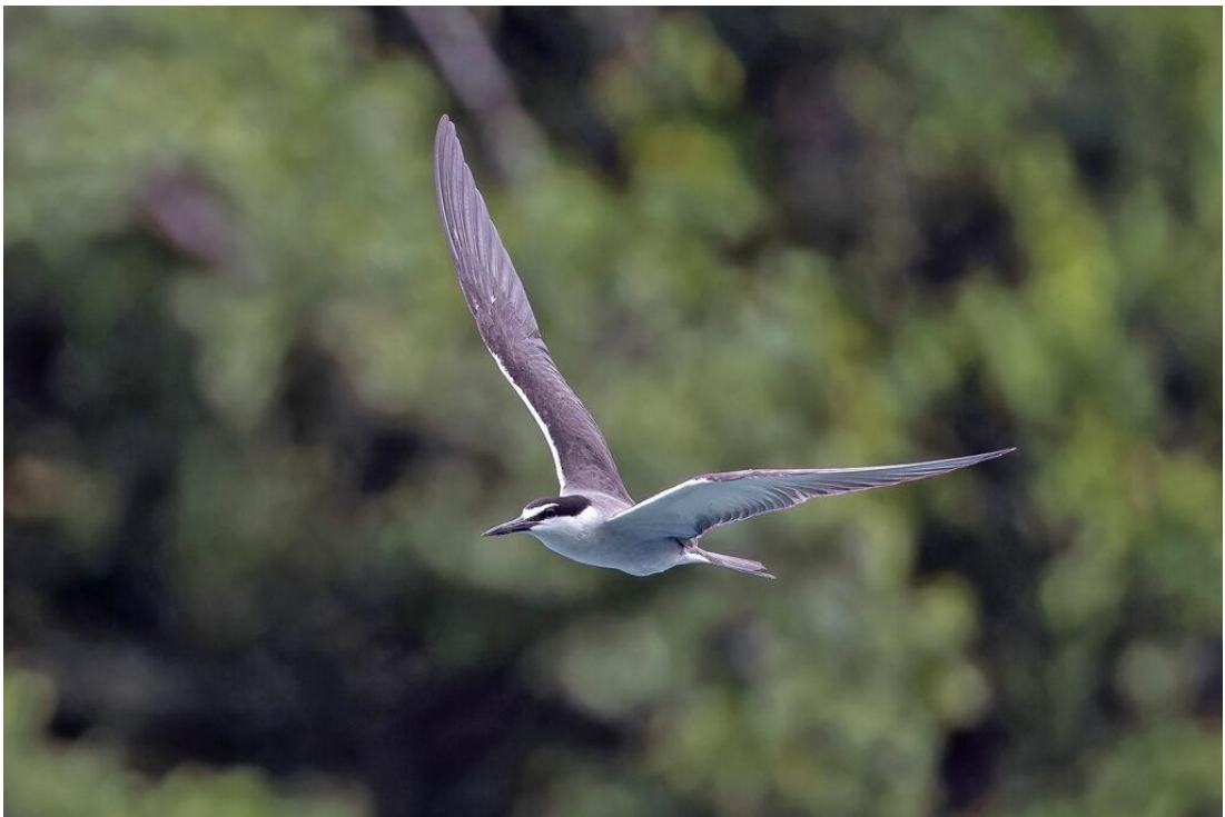
Bridled Tern