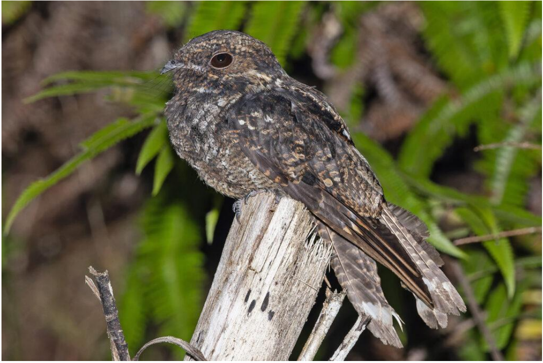
Palau Nightjar