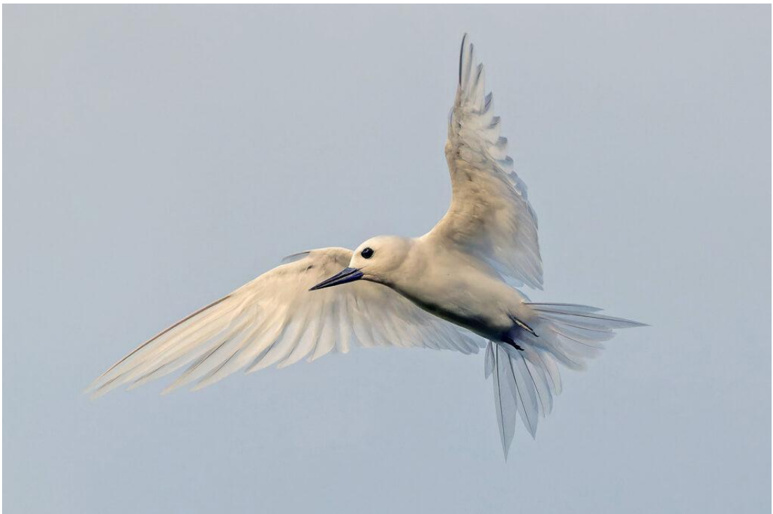
Common White Tern