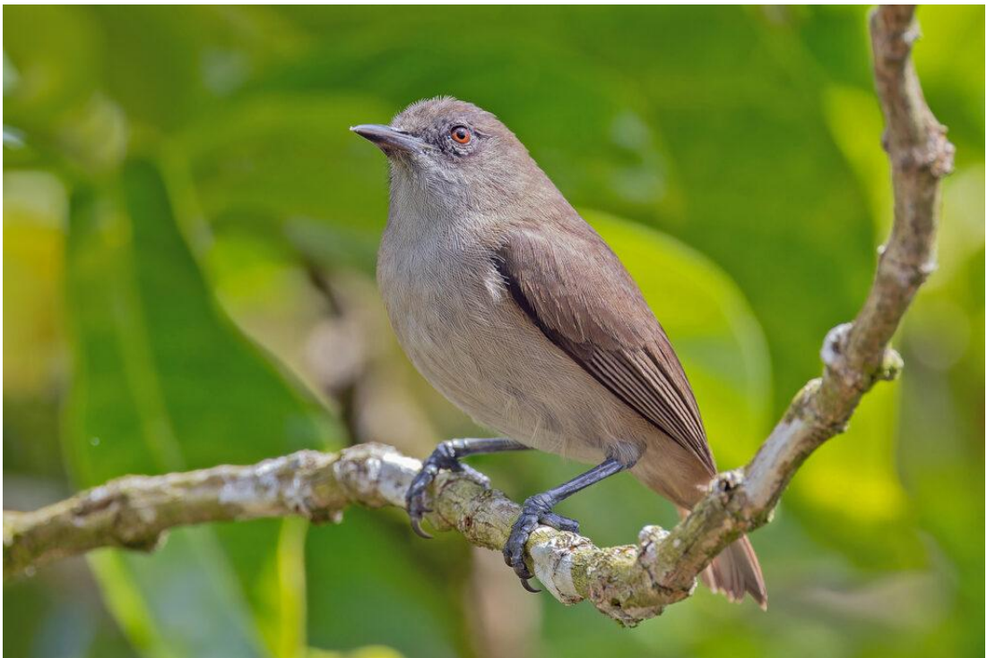
Dusky-brown White-eye