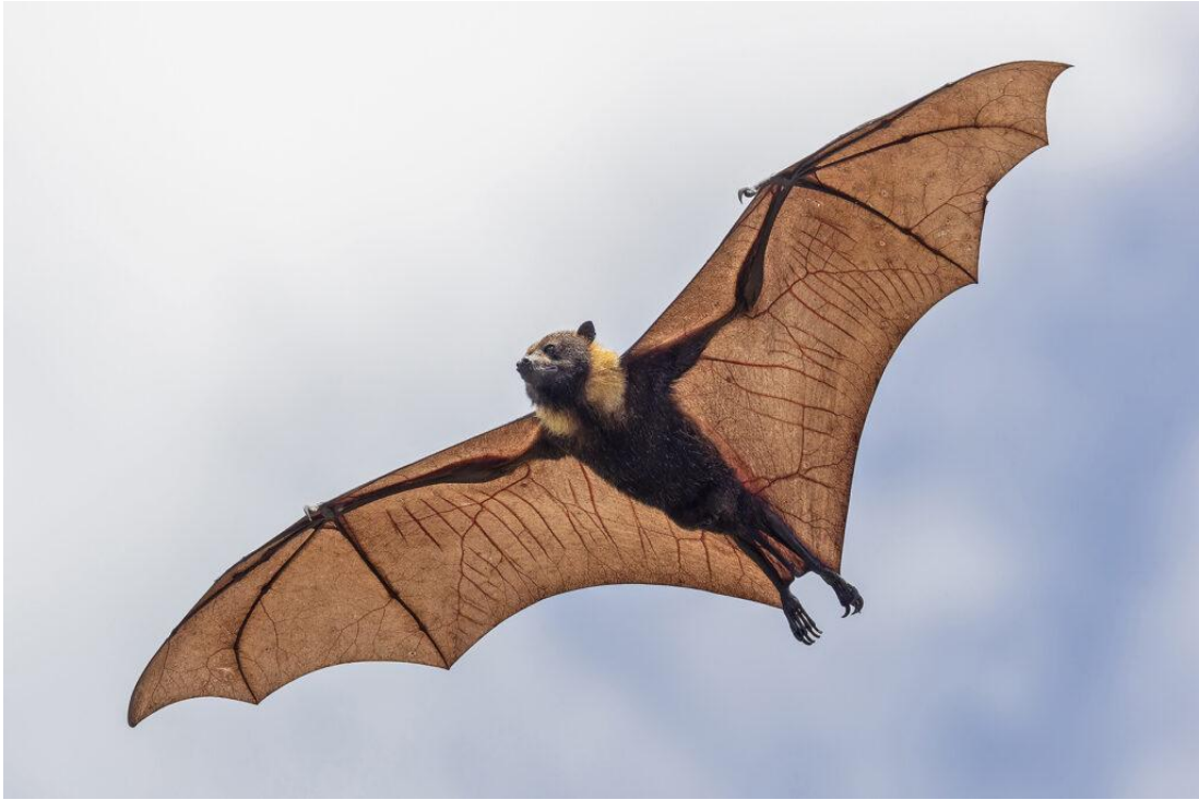
Mariana Flying Fox