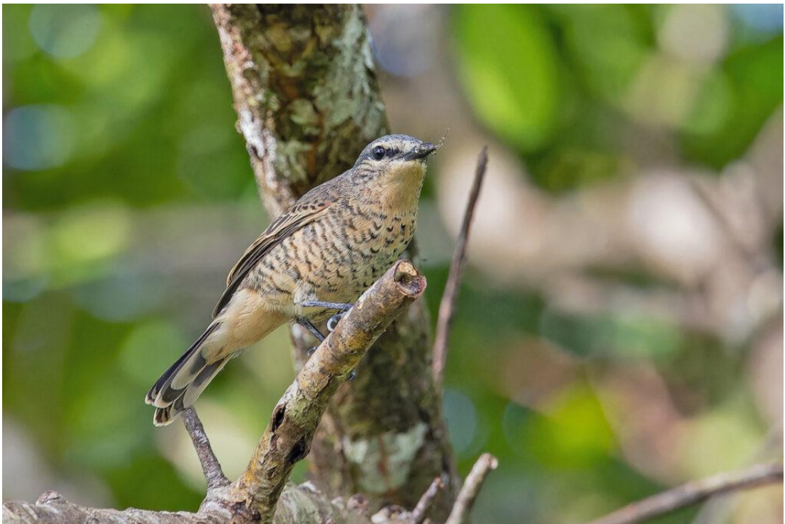
Palau Cicadabird