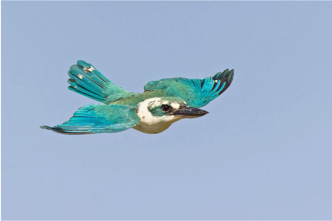
Rota form of Mariana Kingfisher