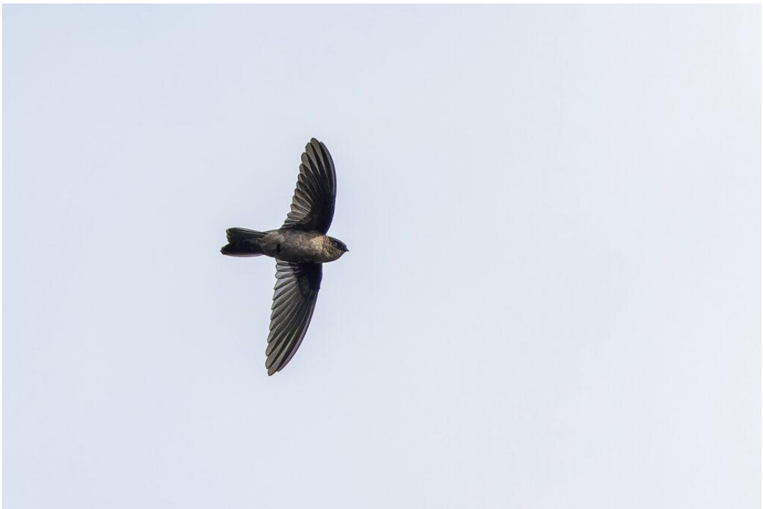
Mariana Swiftlet