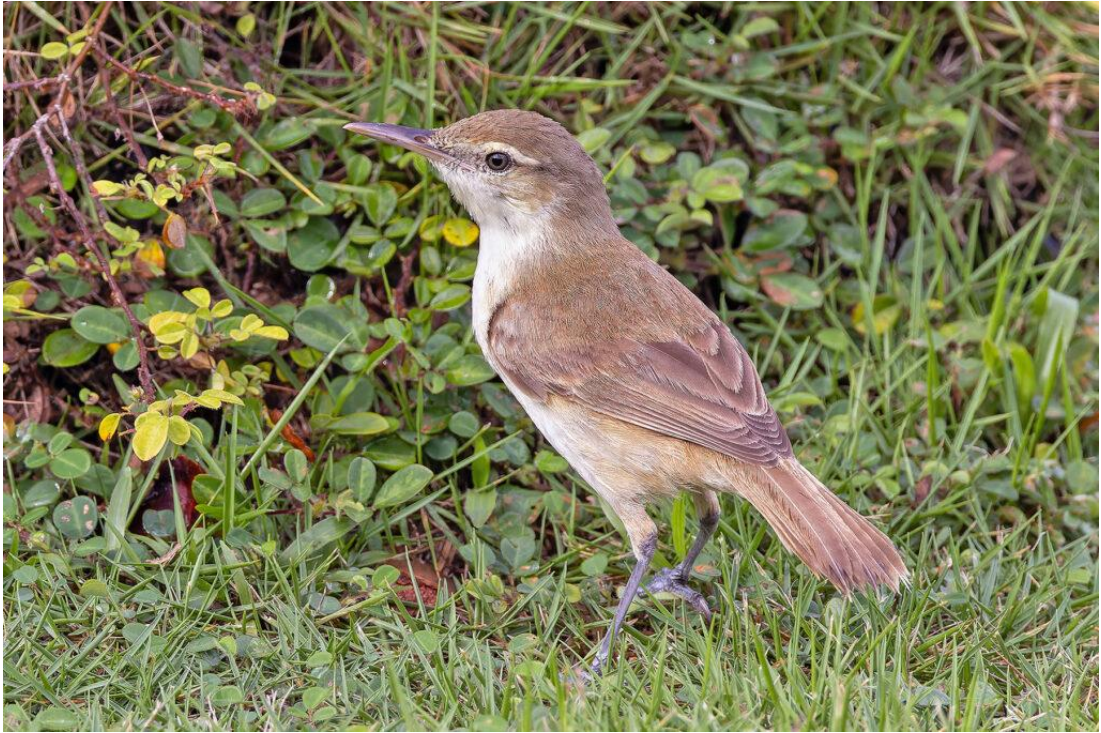
Caroline Reed Warbler