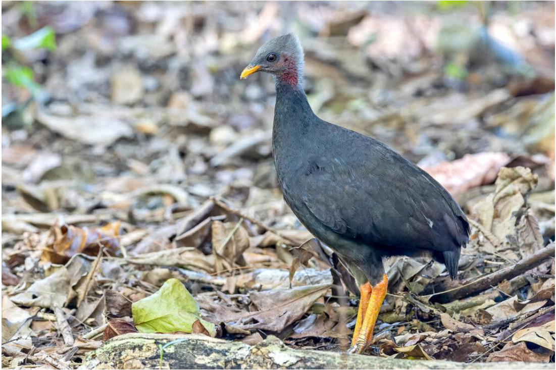
Palau form of Micronesian Megapode