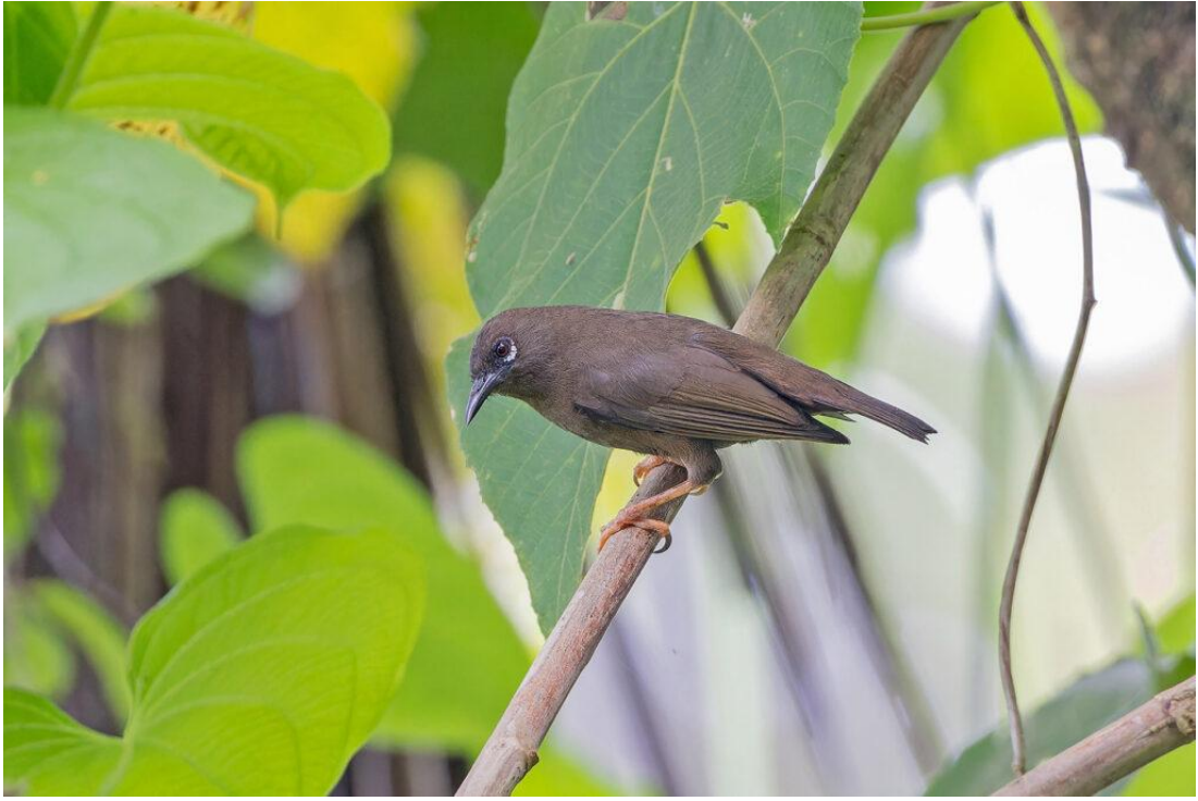
Teardrop White-eye