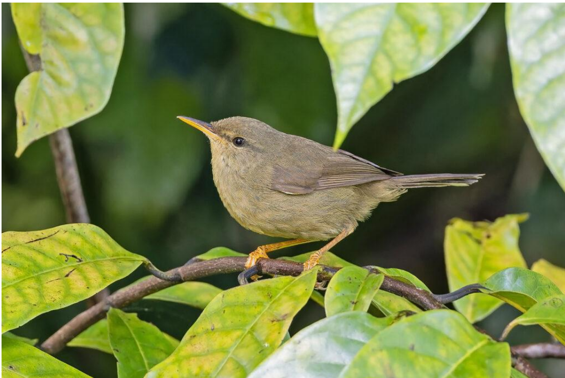
Palau Bush Warbler