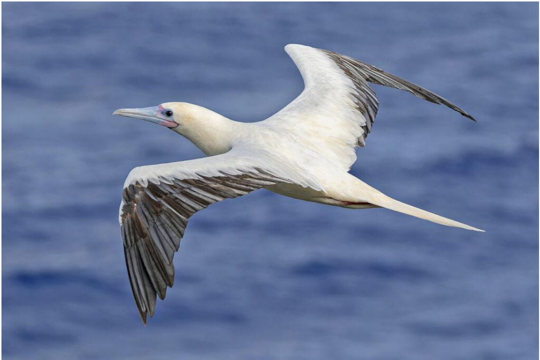
Red-footed Booby