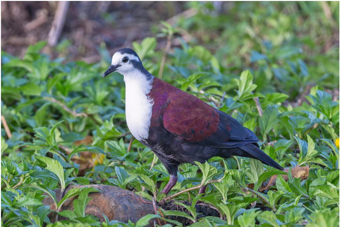
White-fronted Ground Dove