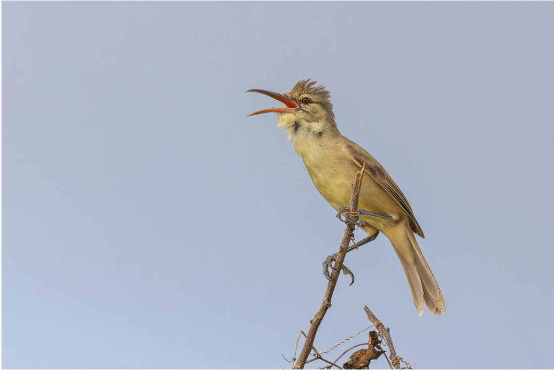
Saipan Reed Warbler