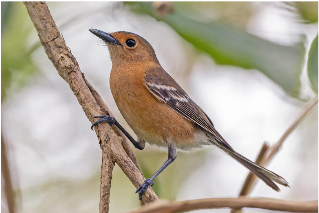
Trinian Monarch