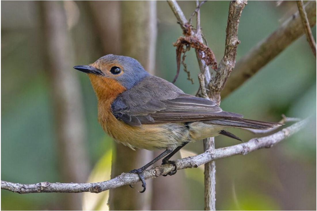
Palau Flycatcher