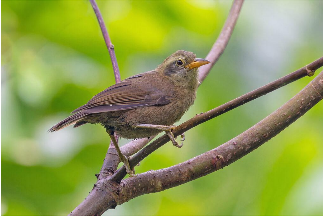
Giant White-eye