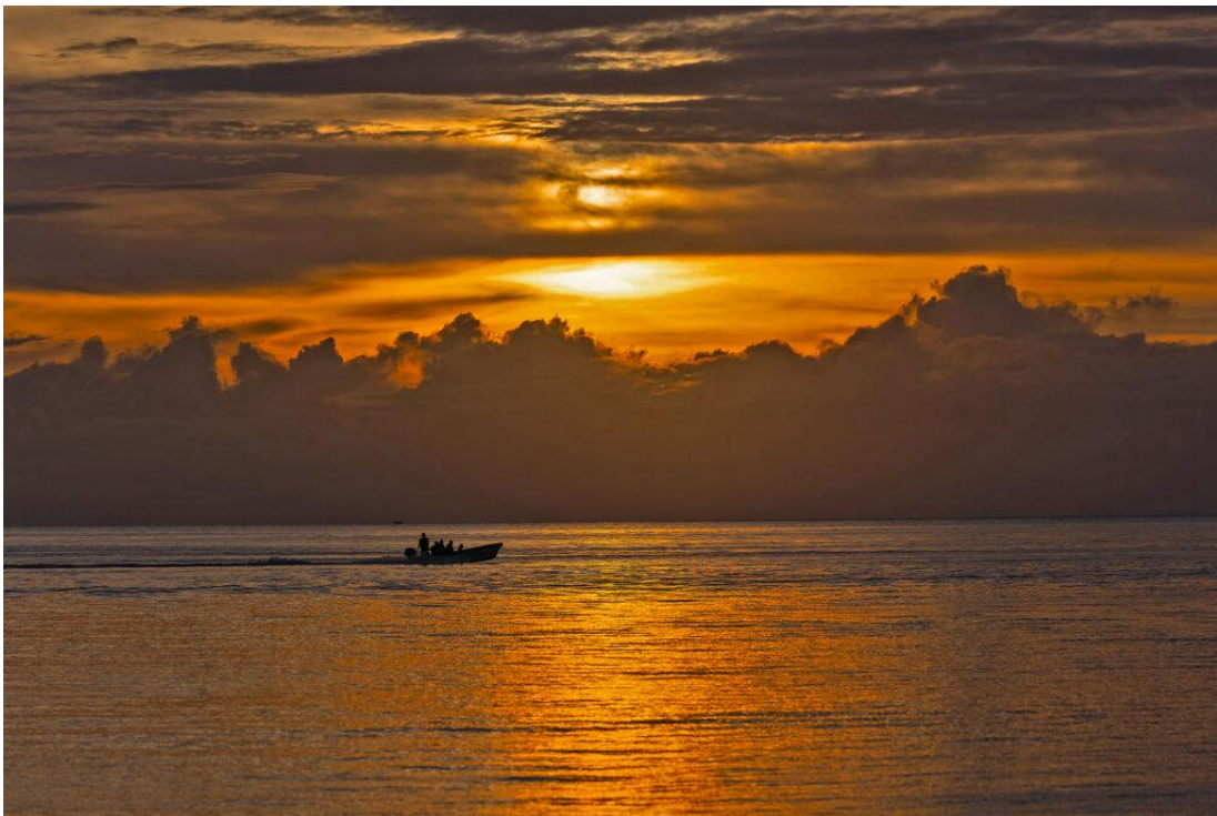
Sunset on Chuuk