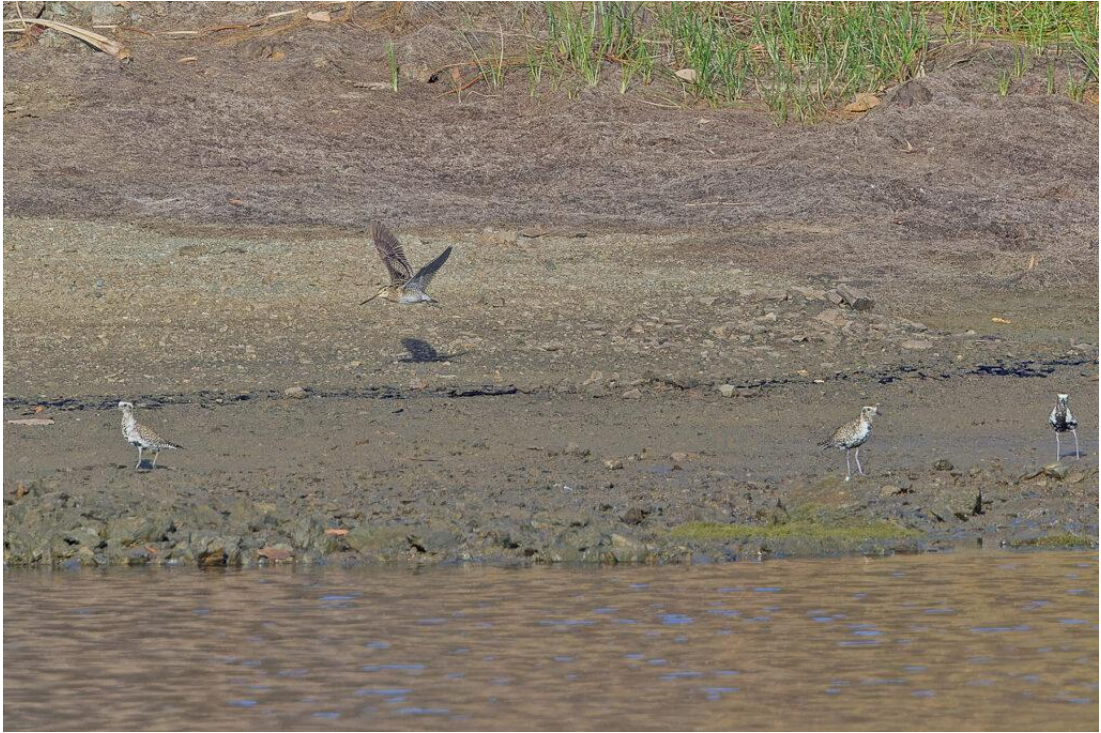
Swinhoe's Snipe