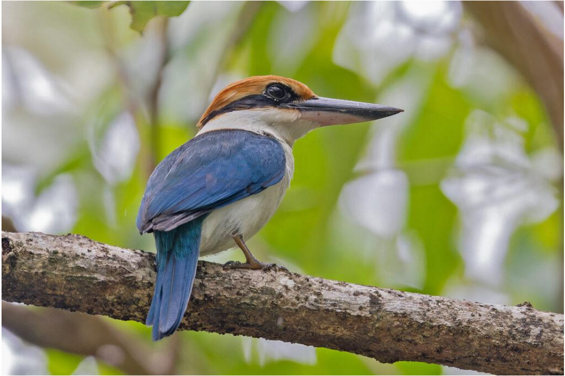
Pohnpei Kingfisher