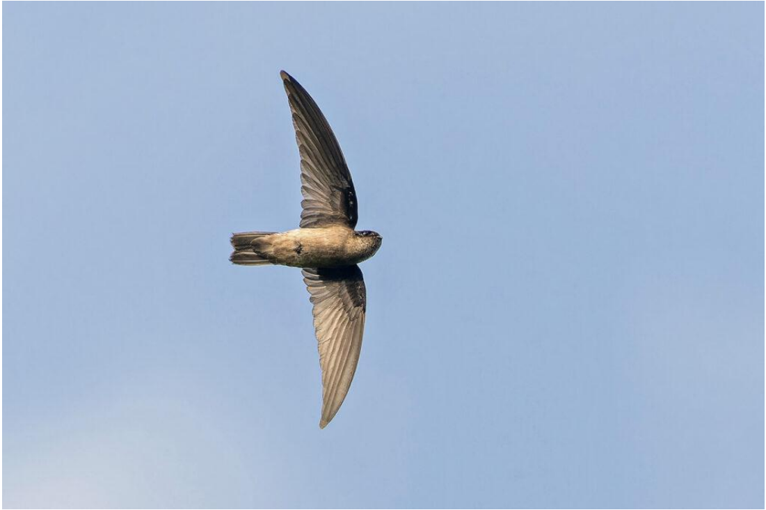
Palau Swiftlet