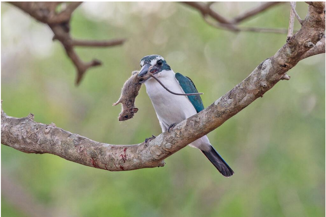
Rota form of Mariana Kingfisher