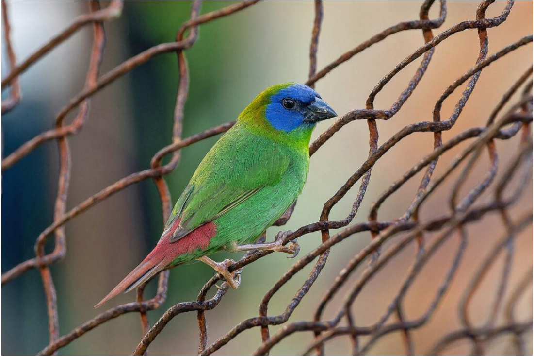
Blue-faced Parrotfinch