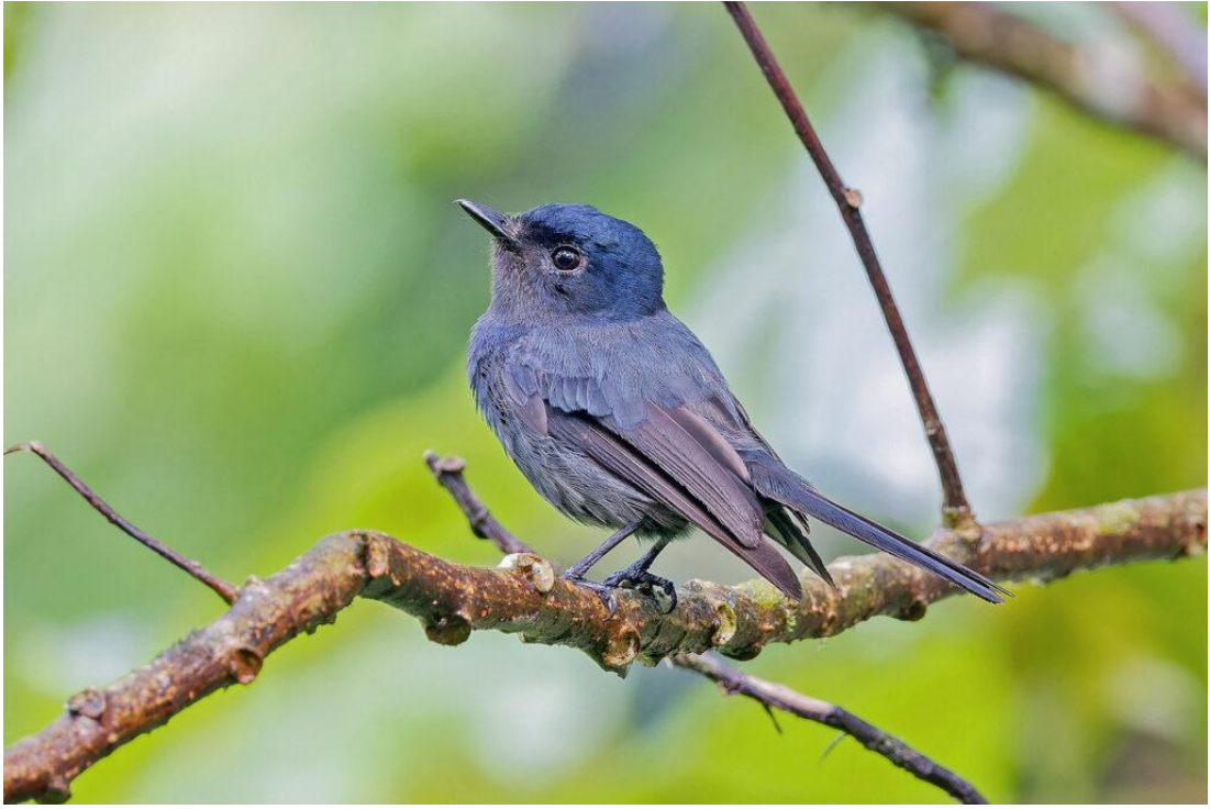
Pohnpei Flycatcher