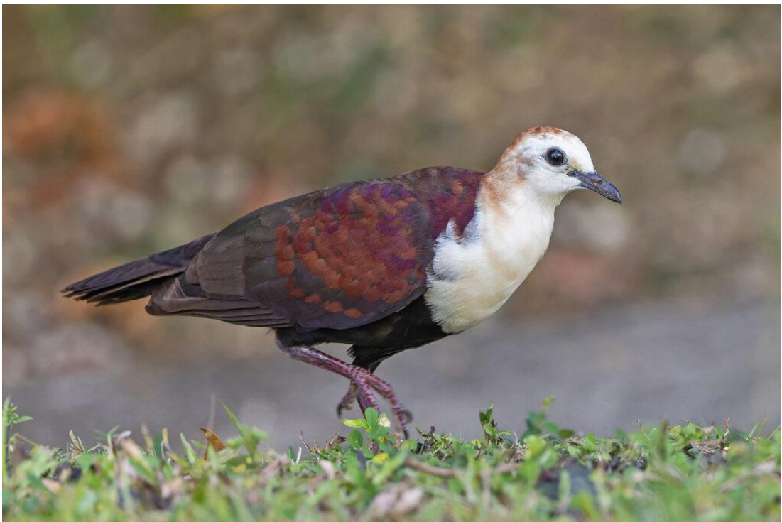
White-throated Ground Dove