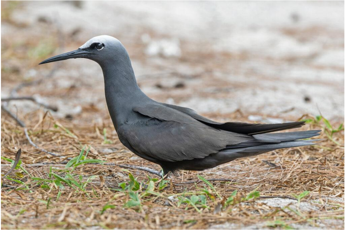
Black Noddy