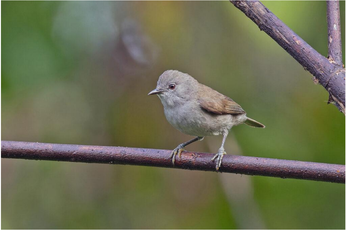
Grey-brown White-eye