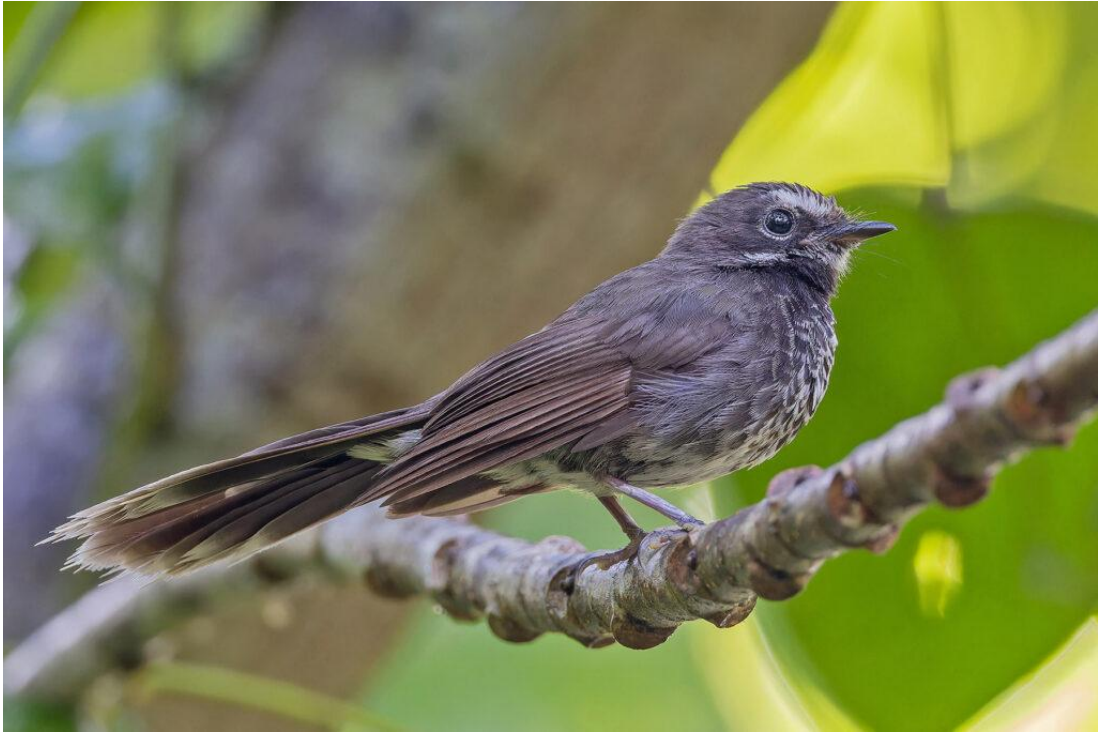
Pohnpei Fantail