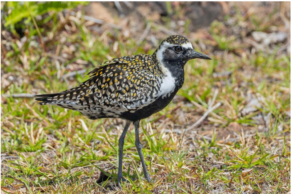
Pacific Golden Plover