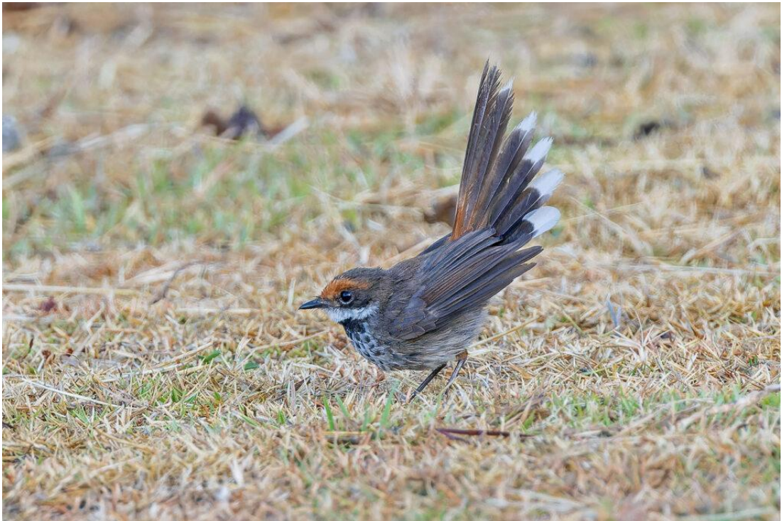
Micronesian Rufous Fantail