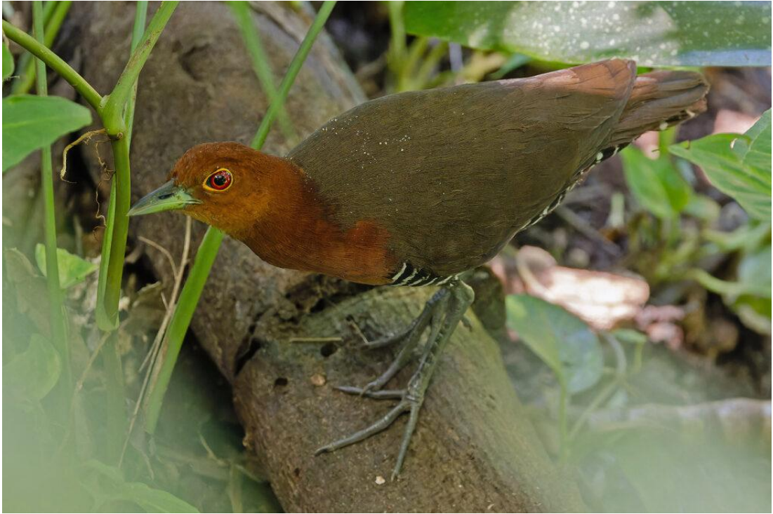
Slaty-legged Crake