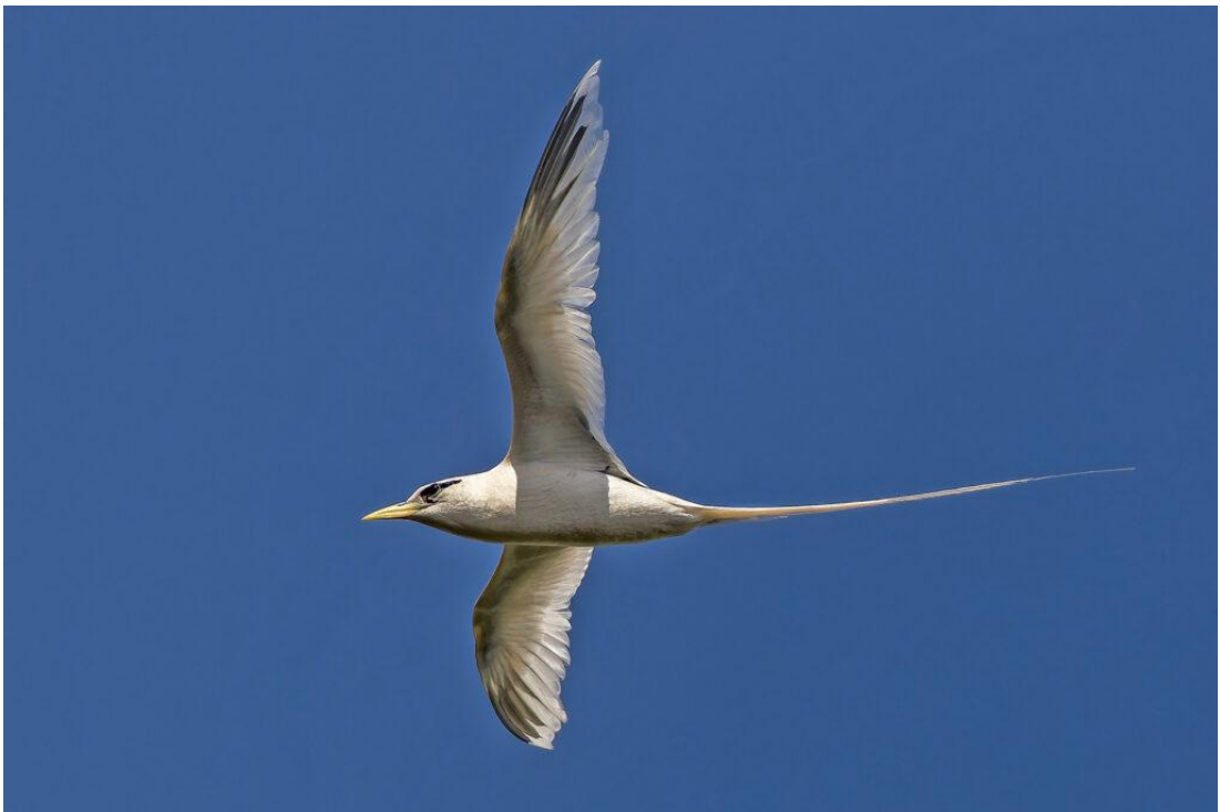
White-tailed Tropicbird