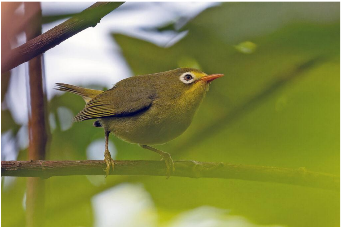
Rota White-eye