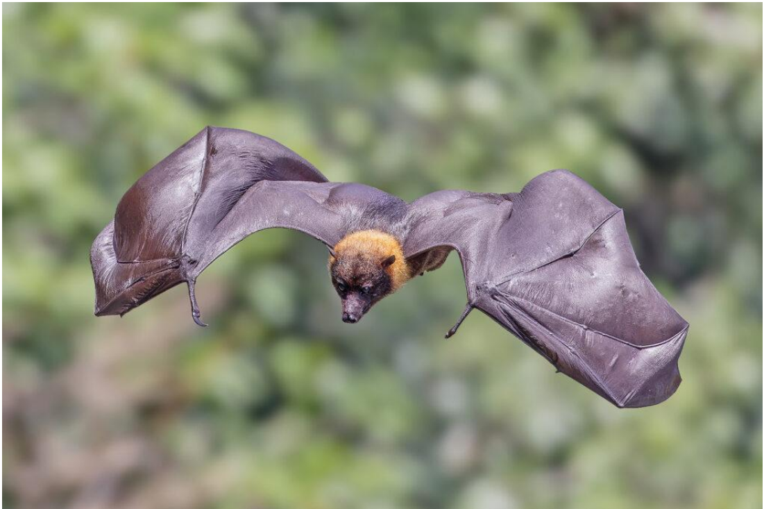
Mariana Flying Fox