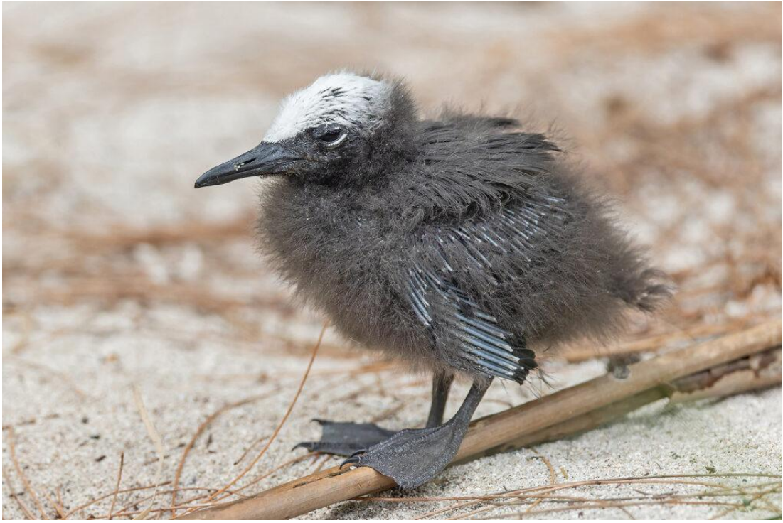
juvenile Black Noddy