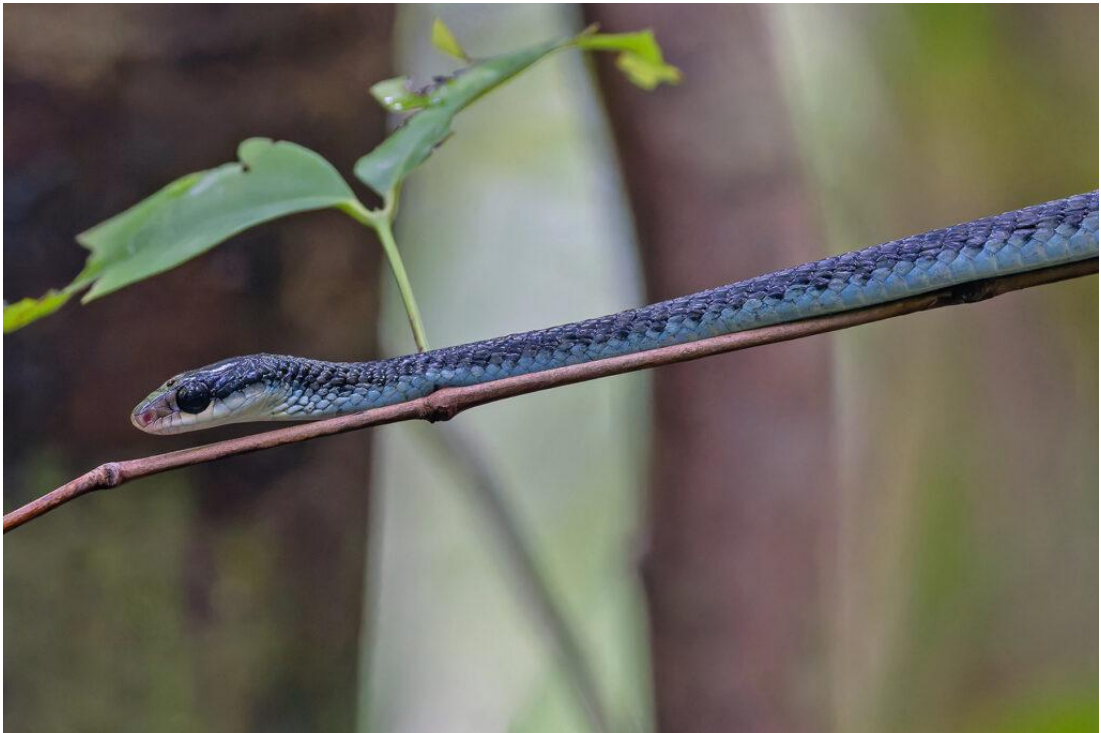
Palau Tree Snake