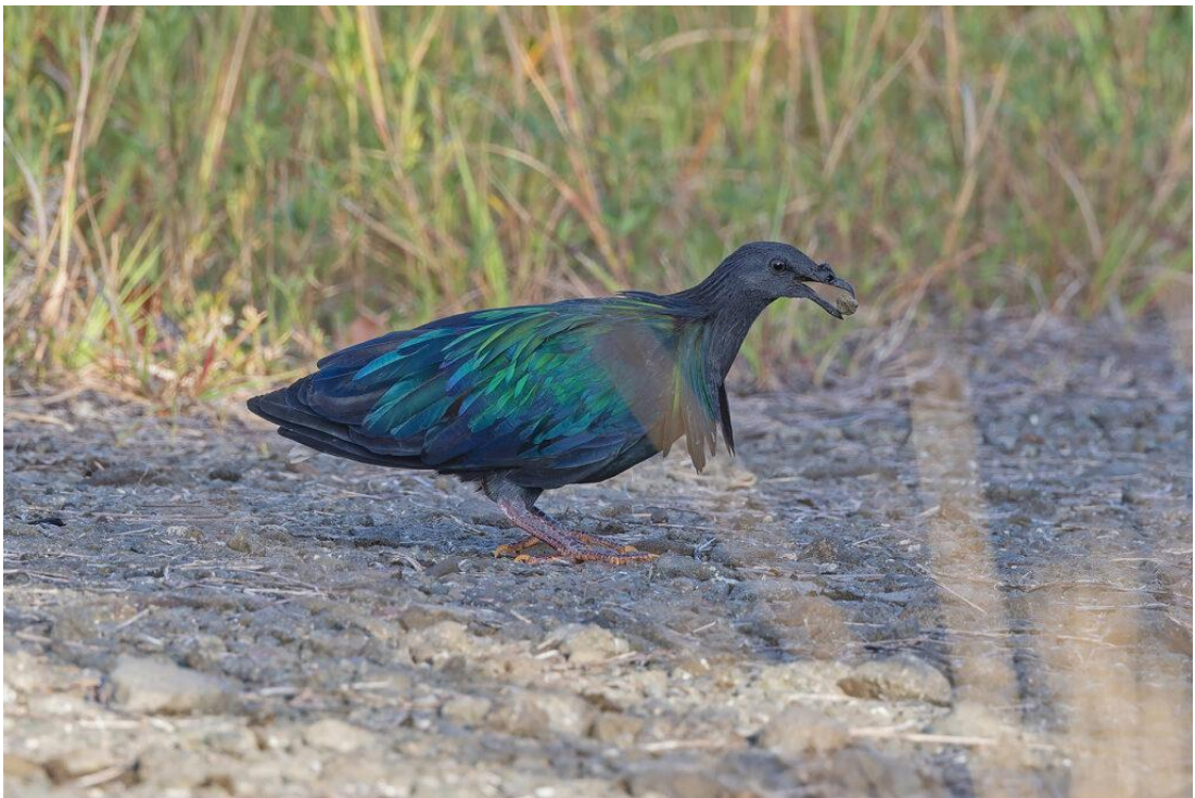
Nicobar Pigeon