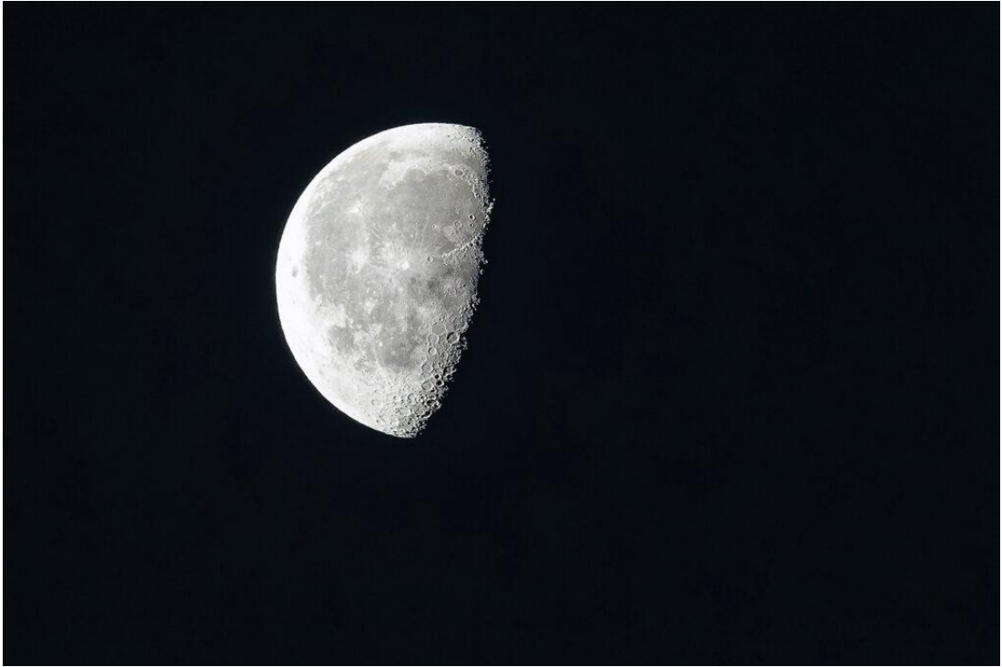
The moon in Micronesia