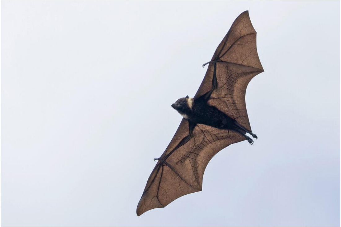
Kosrae Flying Fox