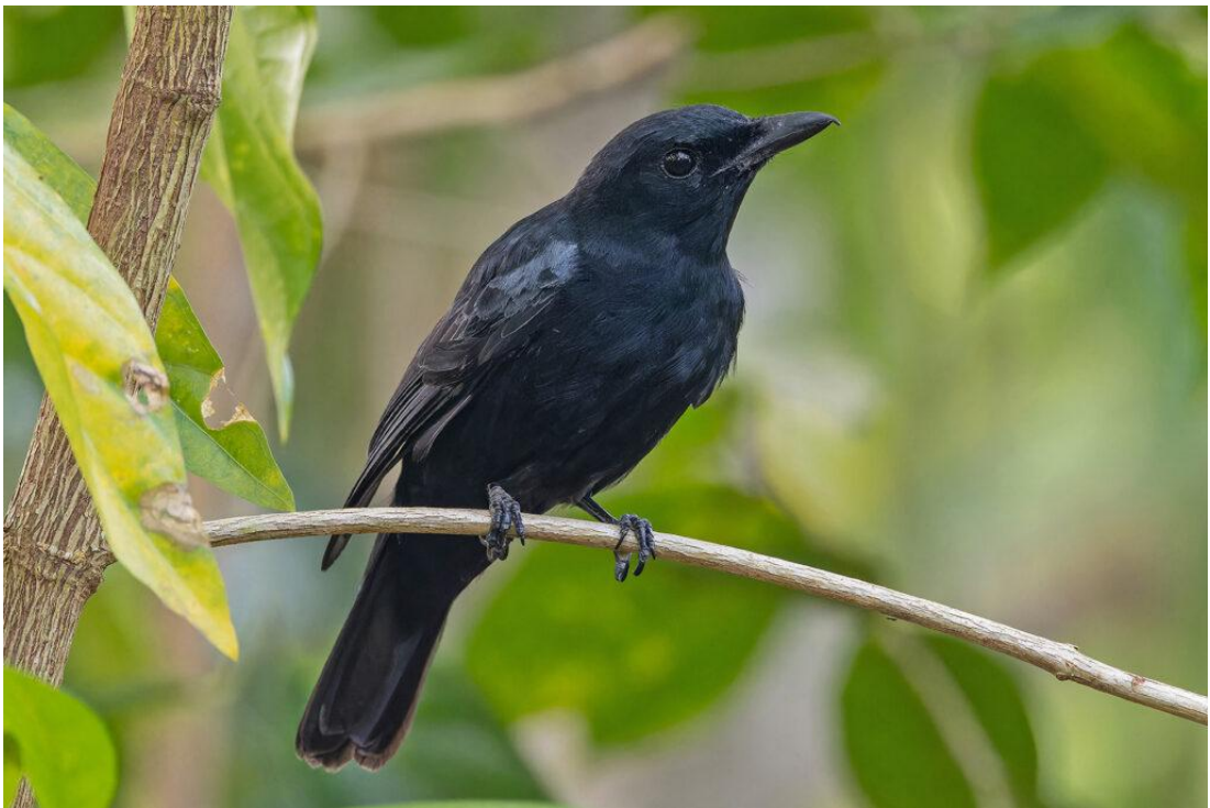
Yap Cicadabird