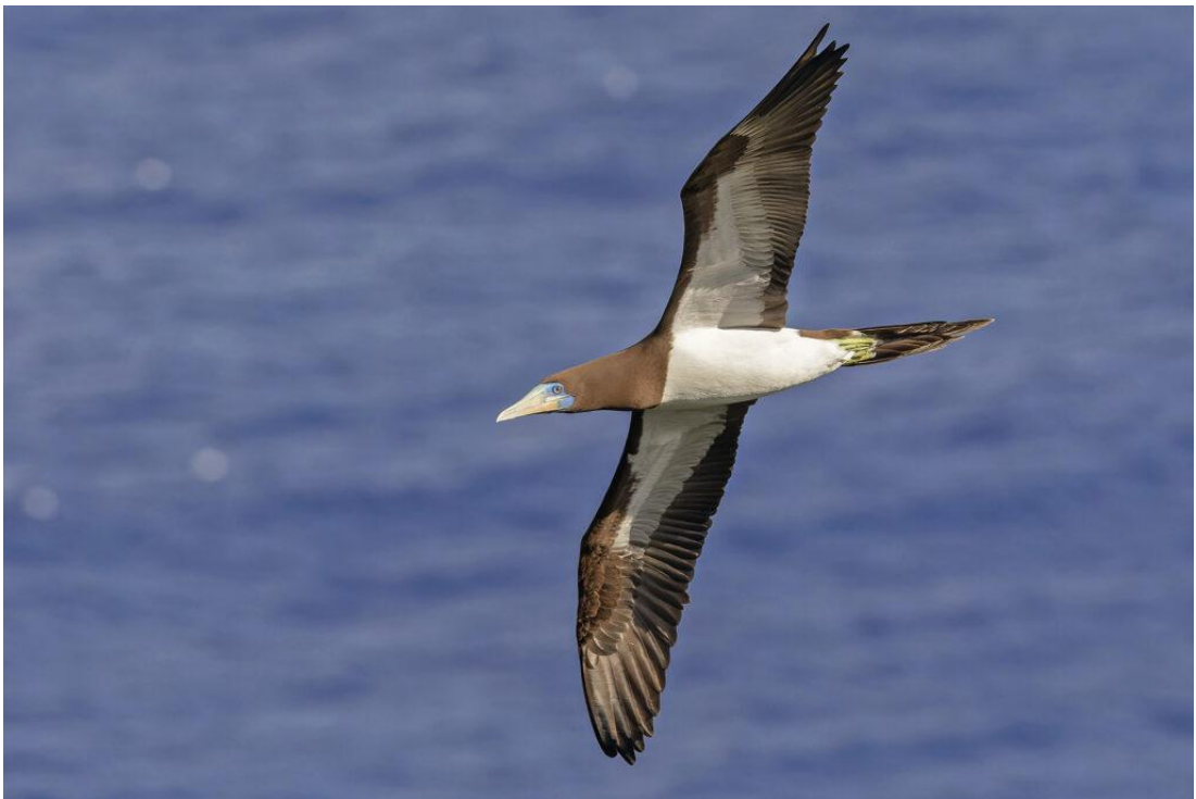
Brown Booby