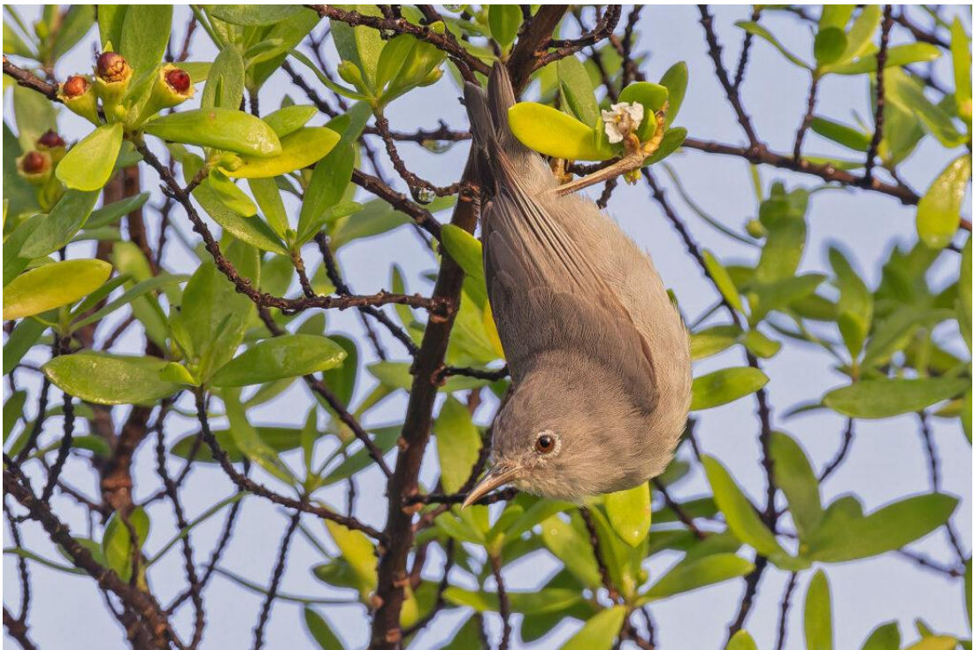
Kosrae White-eye