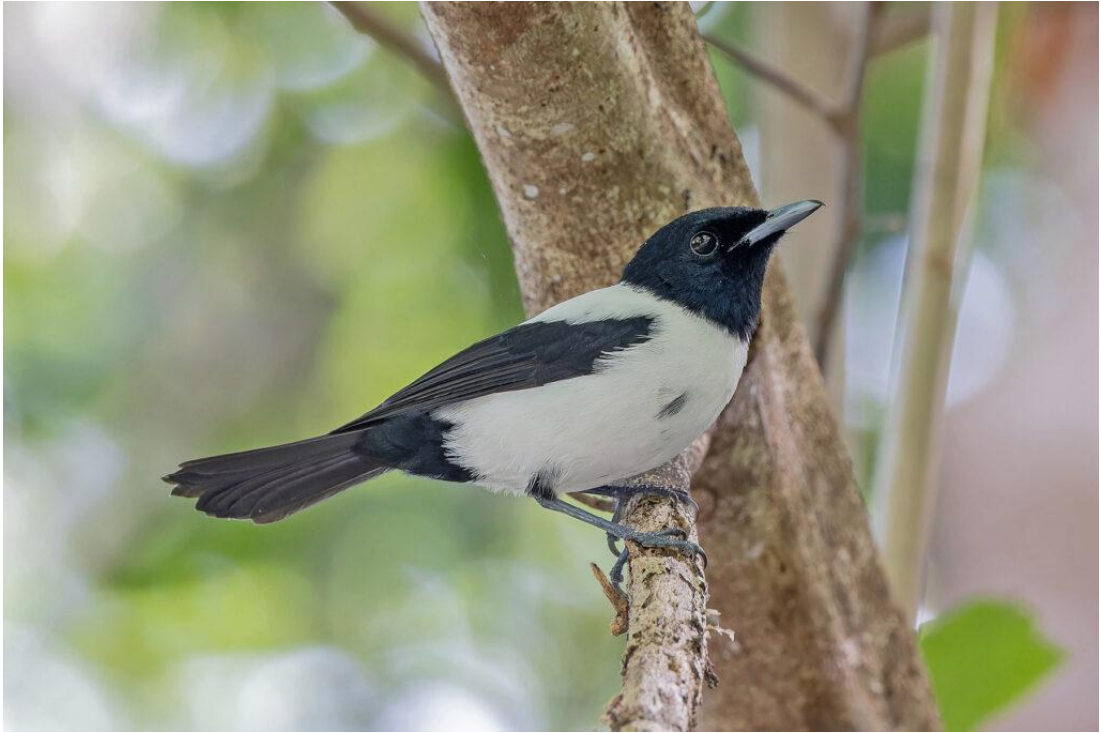
Yap Monarch