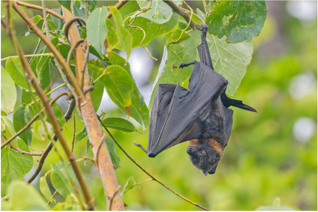
Ruck Flying Fox