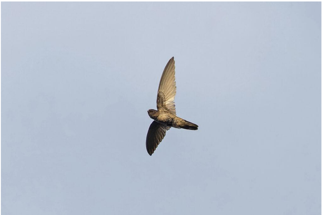
Island Swiftlet