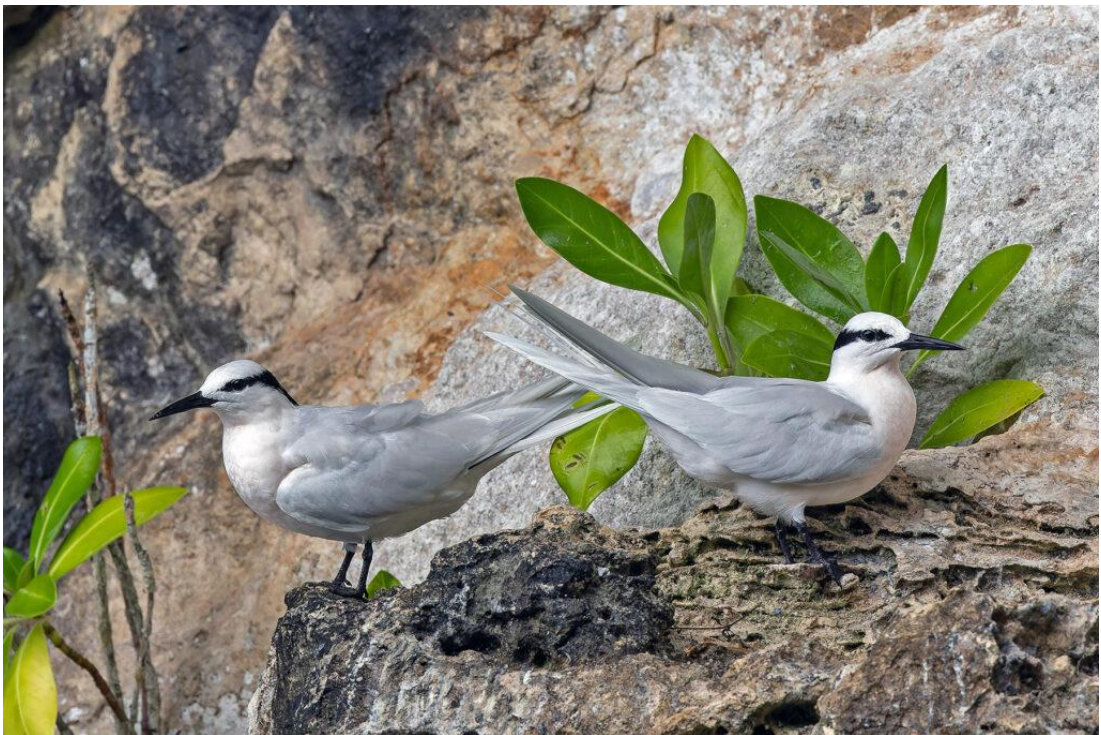
Black-naped Terns