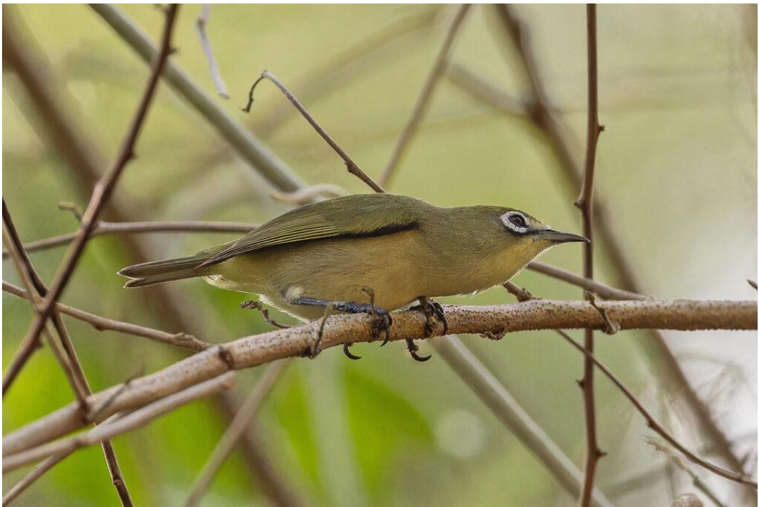
Bridled White-eye