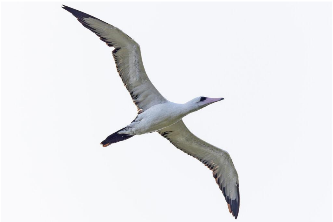
Abbott's Booby