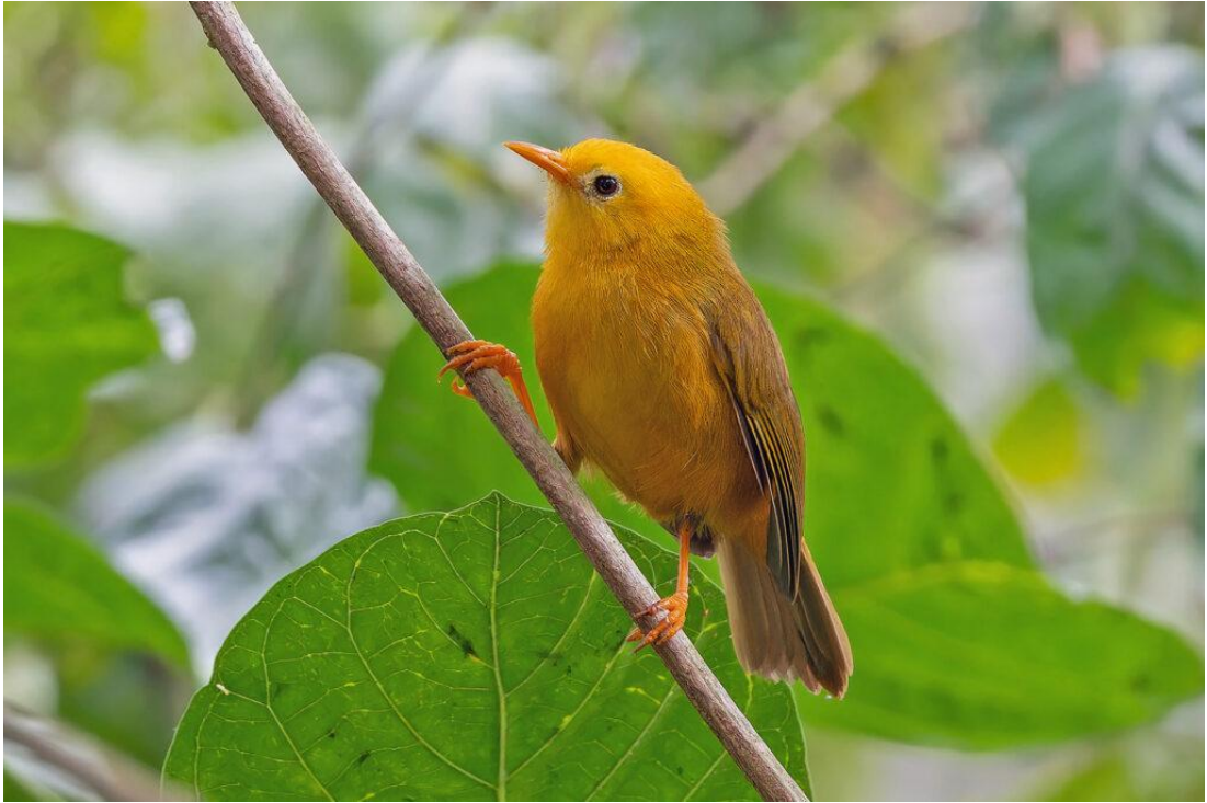
Golden White-eye