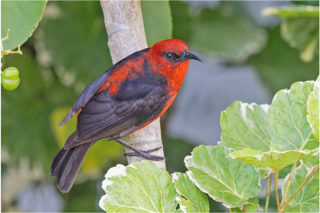
Micronesian Myzomela