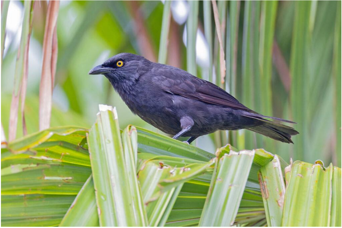
Micronesian Starling