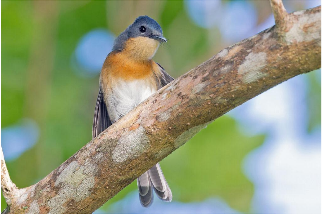
Oceanic Flycatcher