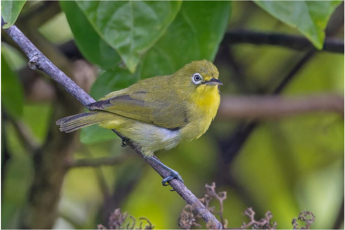
Citrine White-eye