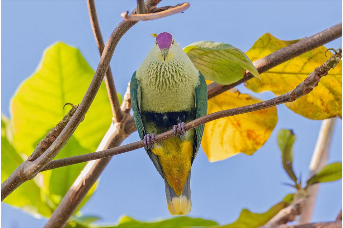
Purple-capped Fruit Dove