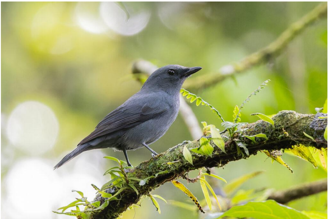
male Pohnpei Cicadabird