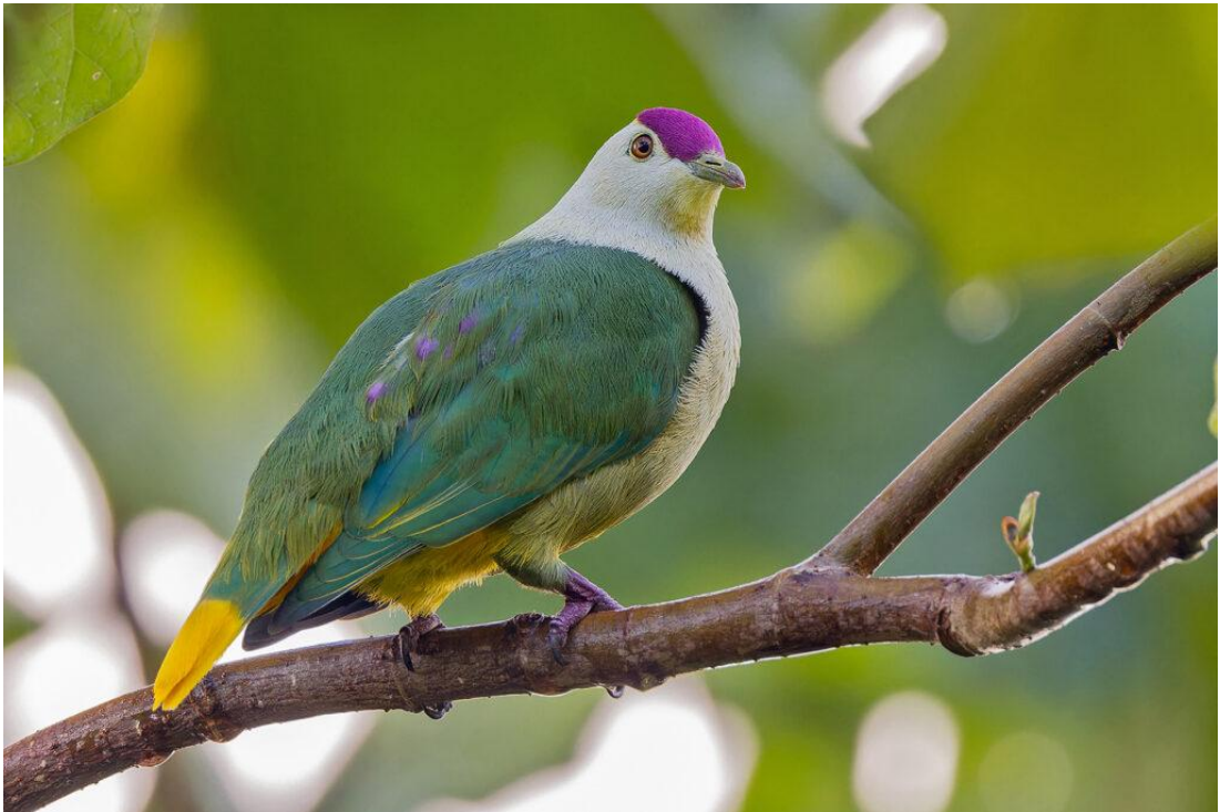
Kosrae Fruit Dove