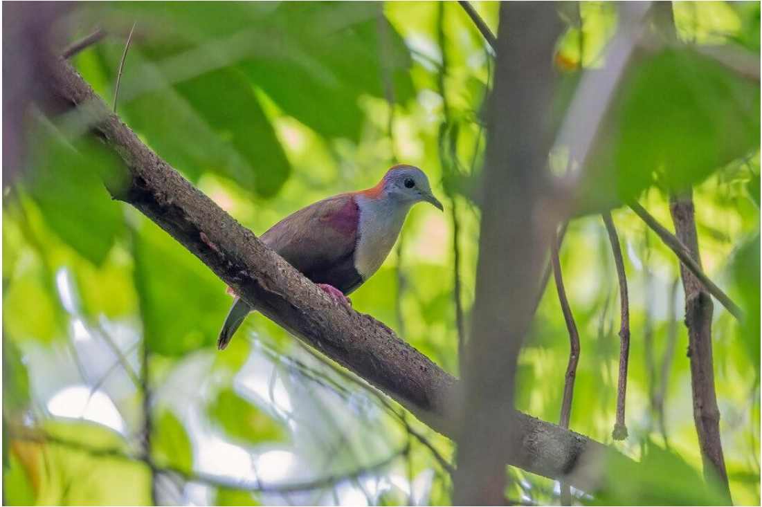
Palau Ground Dove