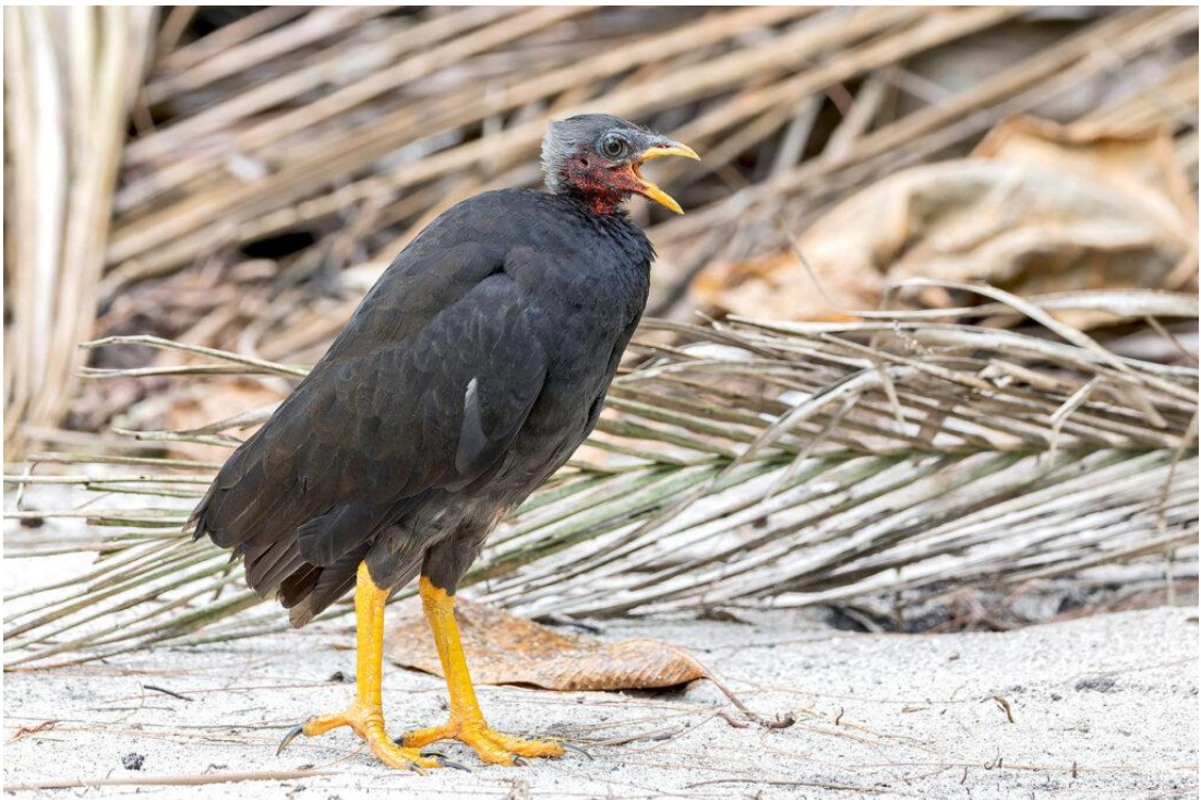
Saipan form of Micronesian Megapode