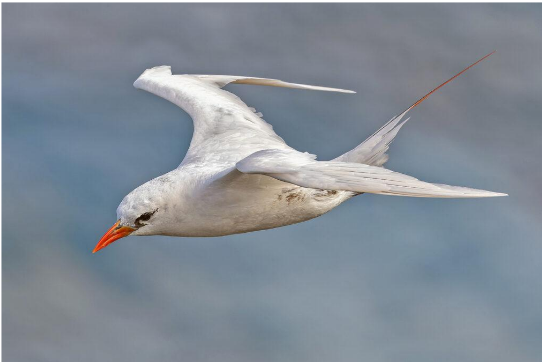
Red-tailed Tropicbird