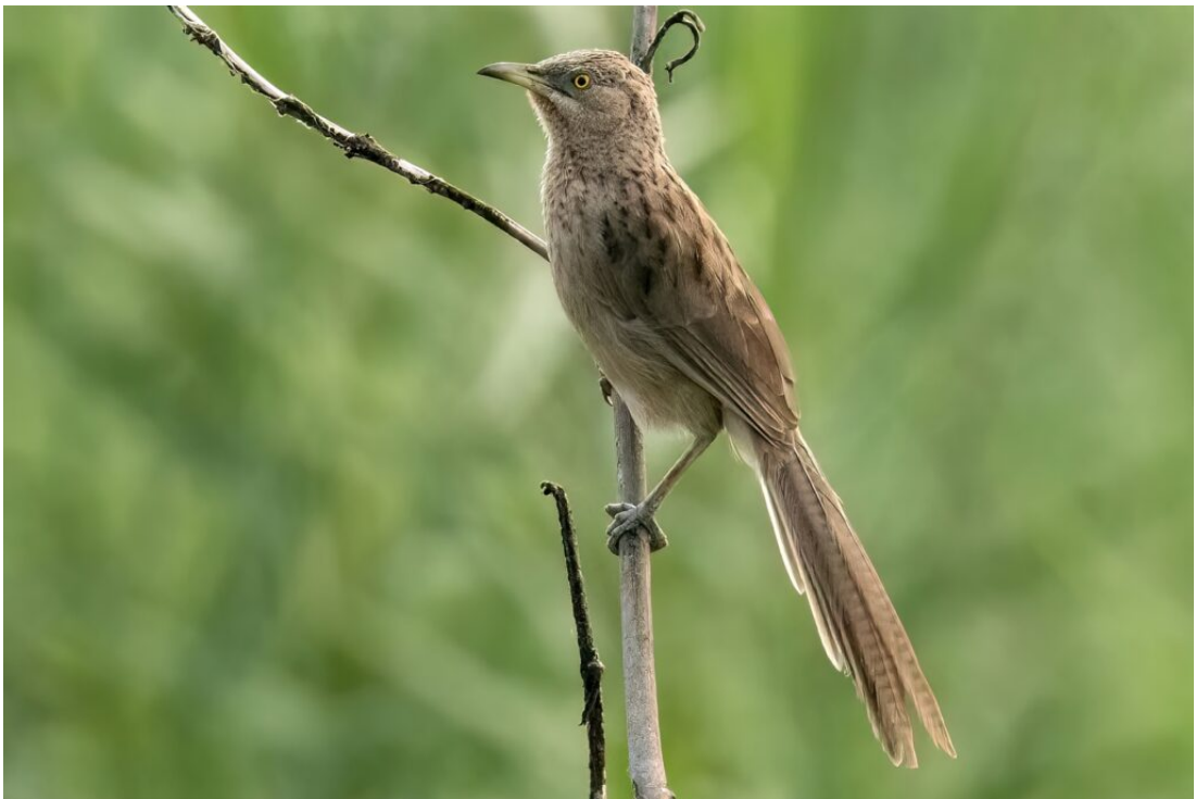
Striated Babbler