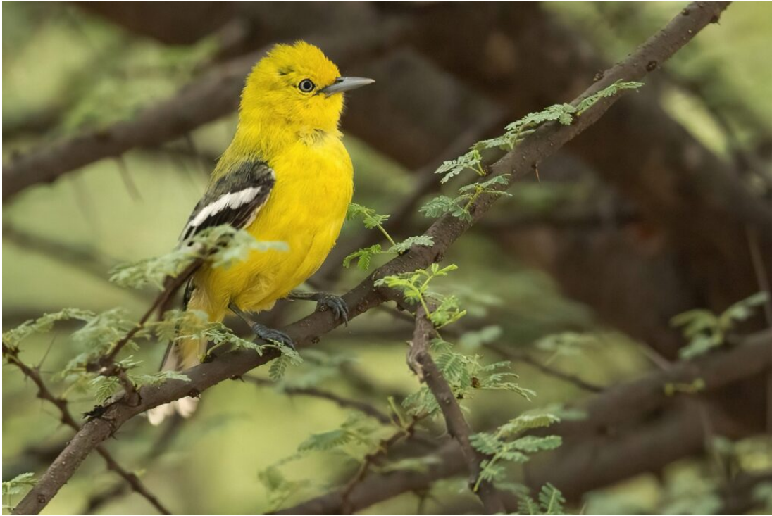
female Marshall's lora