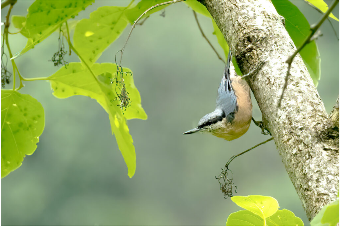
Chestnut-bellied Nuthatch