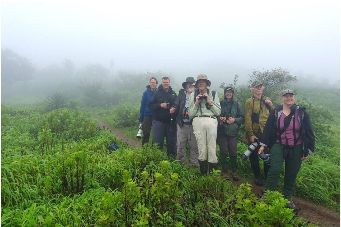
Broad-tailed Grassbird in the bag!