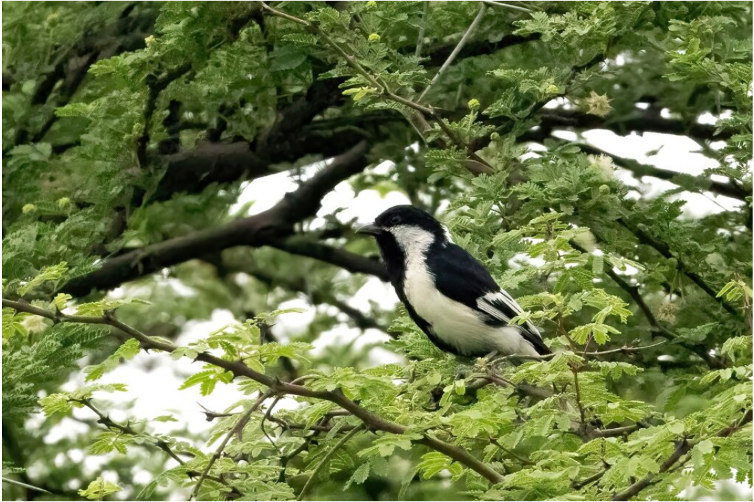
White-naped Tit