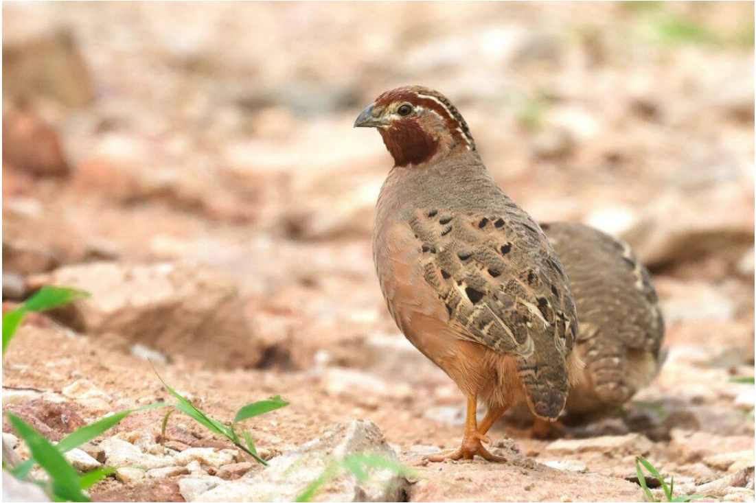
female Jungle Bush Quail