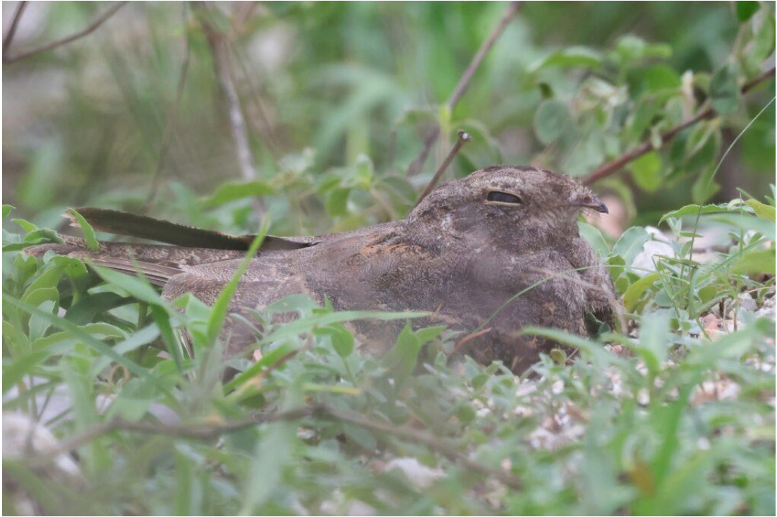
Savanna Nightjar