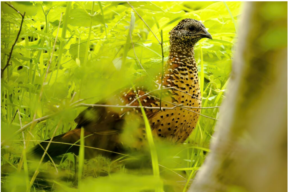
Painted Spurfowl