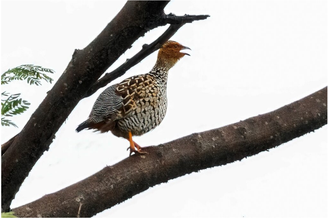
Painted Francolin