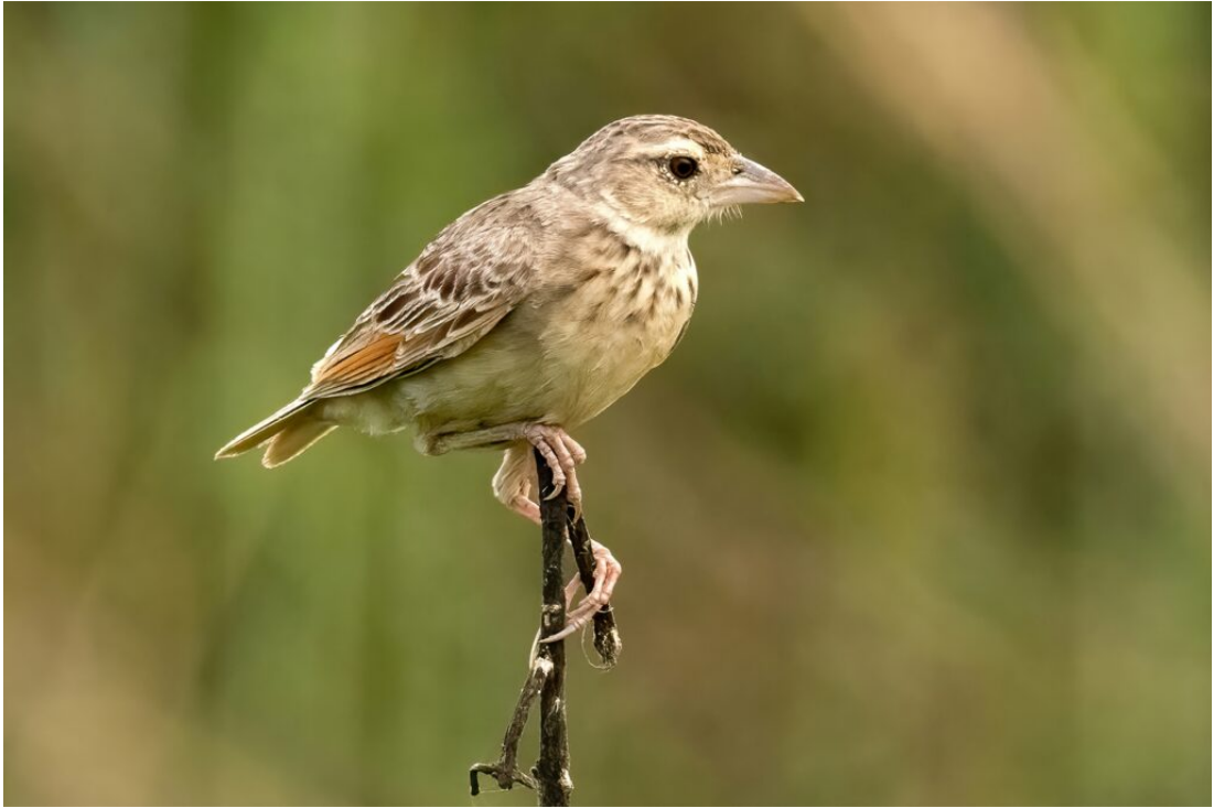
Bengal Bush Lark