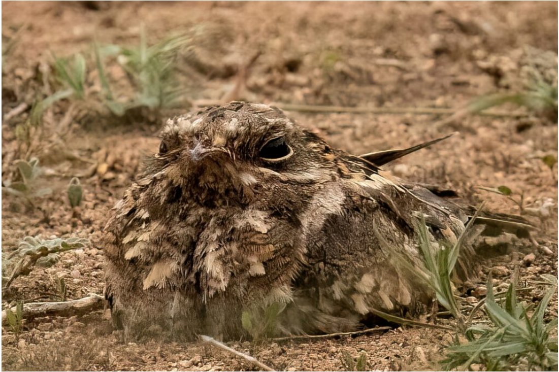
Indian Nightjar