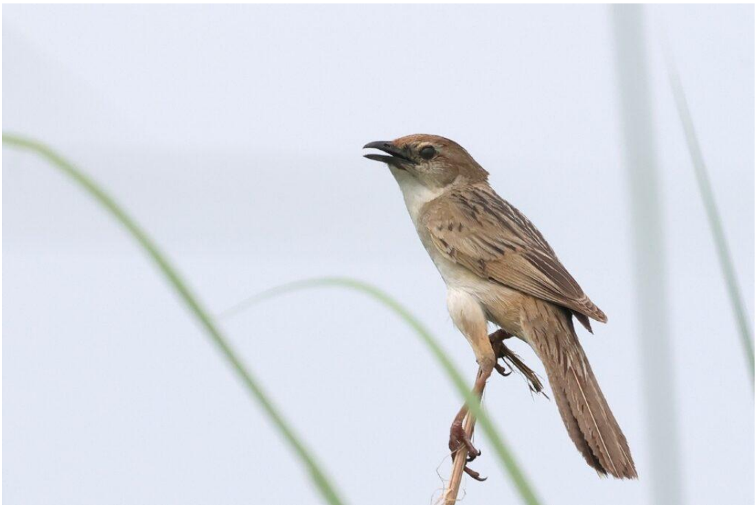
Bristled Grassbird