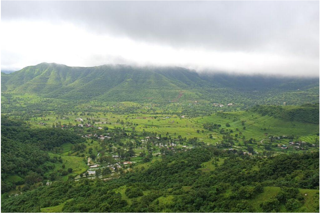
The monsoon landscape in Pune