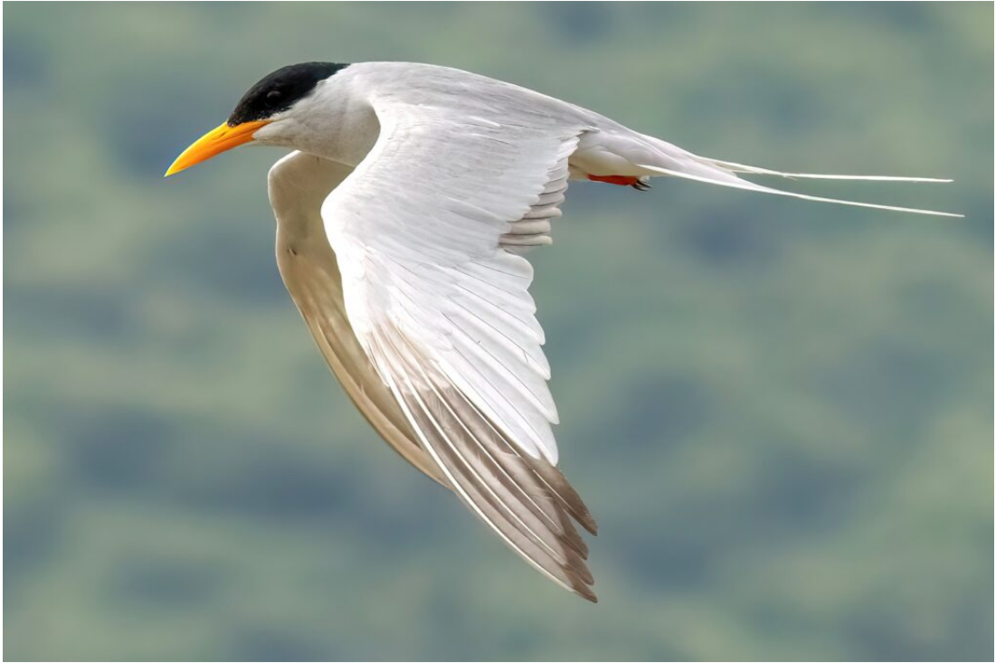
River Tern