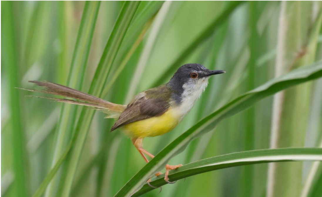
Yellow-bellied Prinia

Black-headed Royal Snake Spalerosophis atriceps