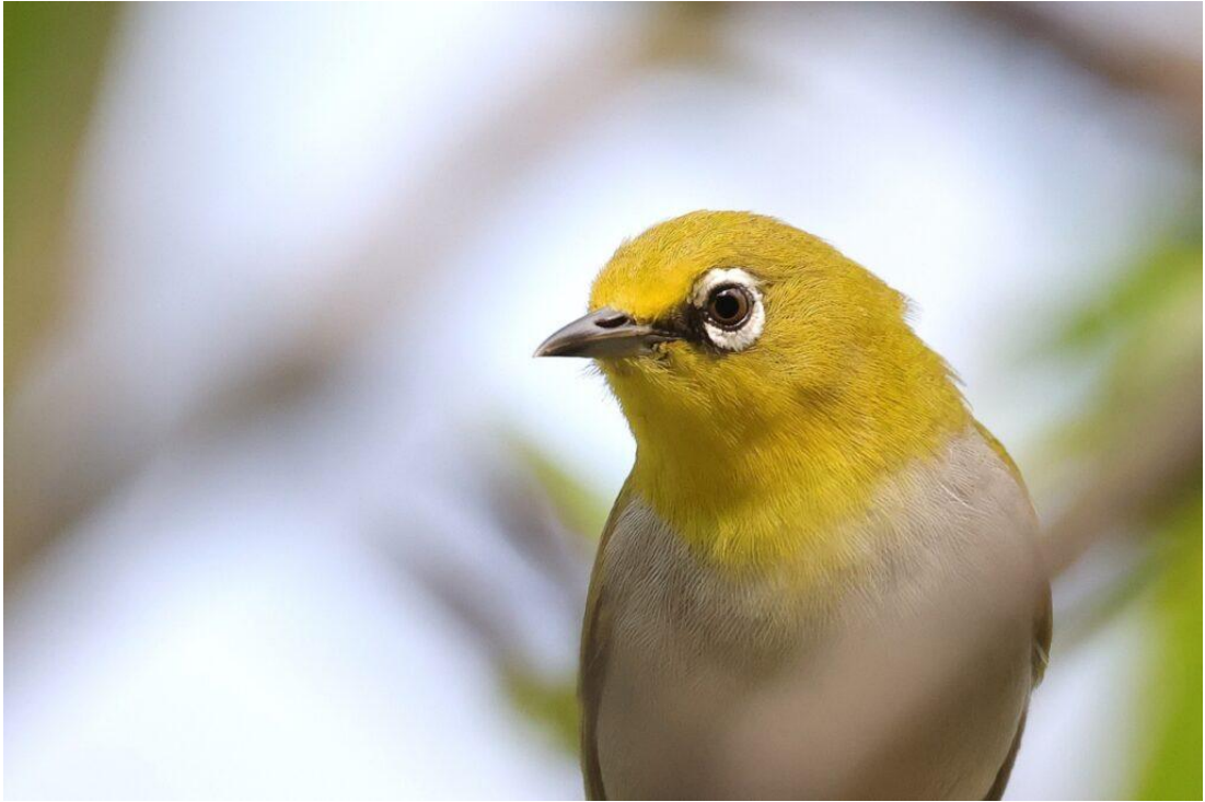
Indian White-eye