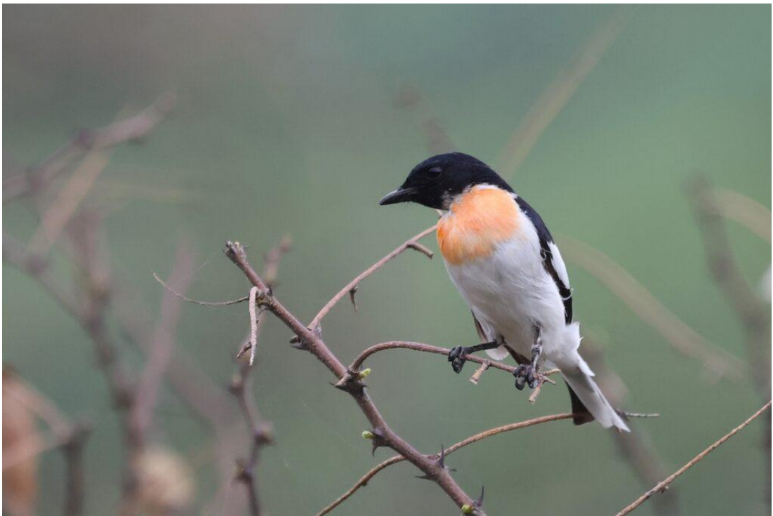
male White-bellied Minivet