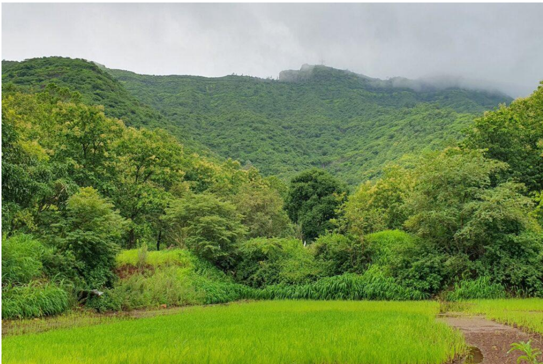
The monsoon landscape in Pune (image by Hannu Jännes)