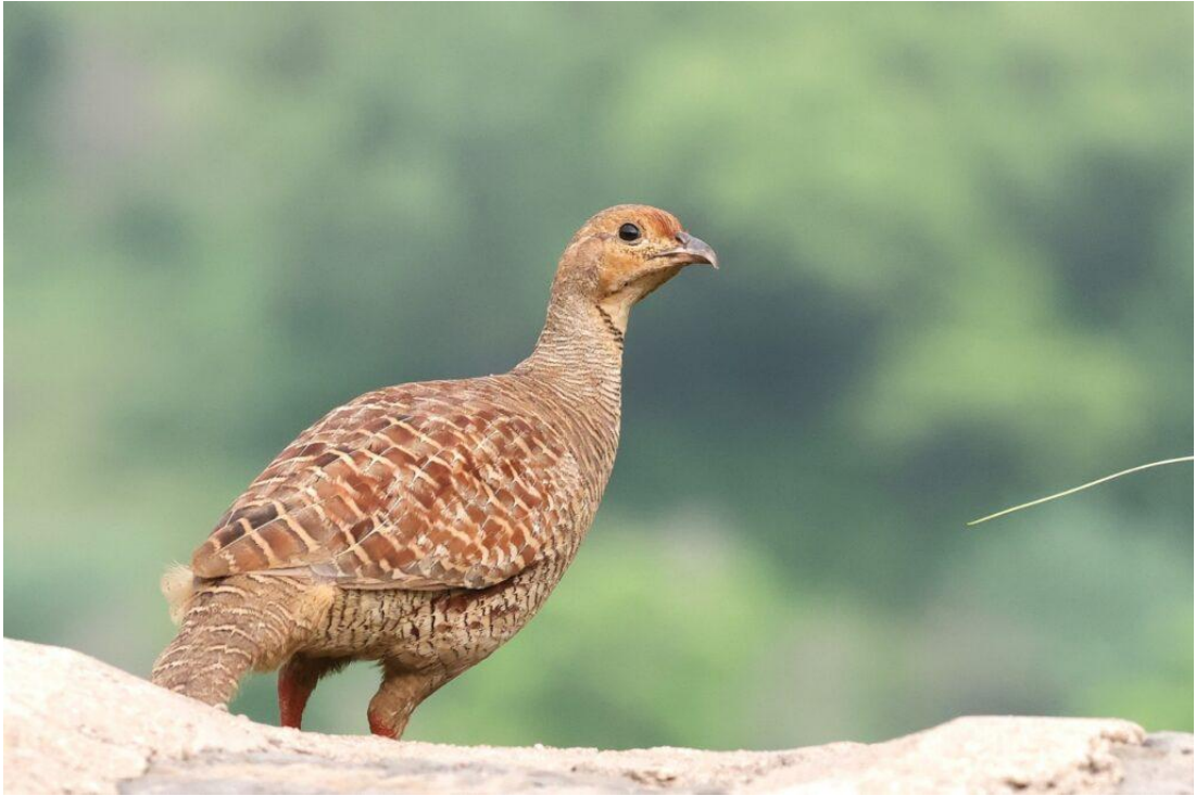
Grey Francolin