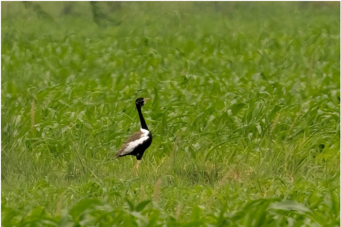
Lesser Florican (image by Urban Olsson)