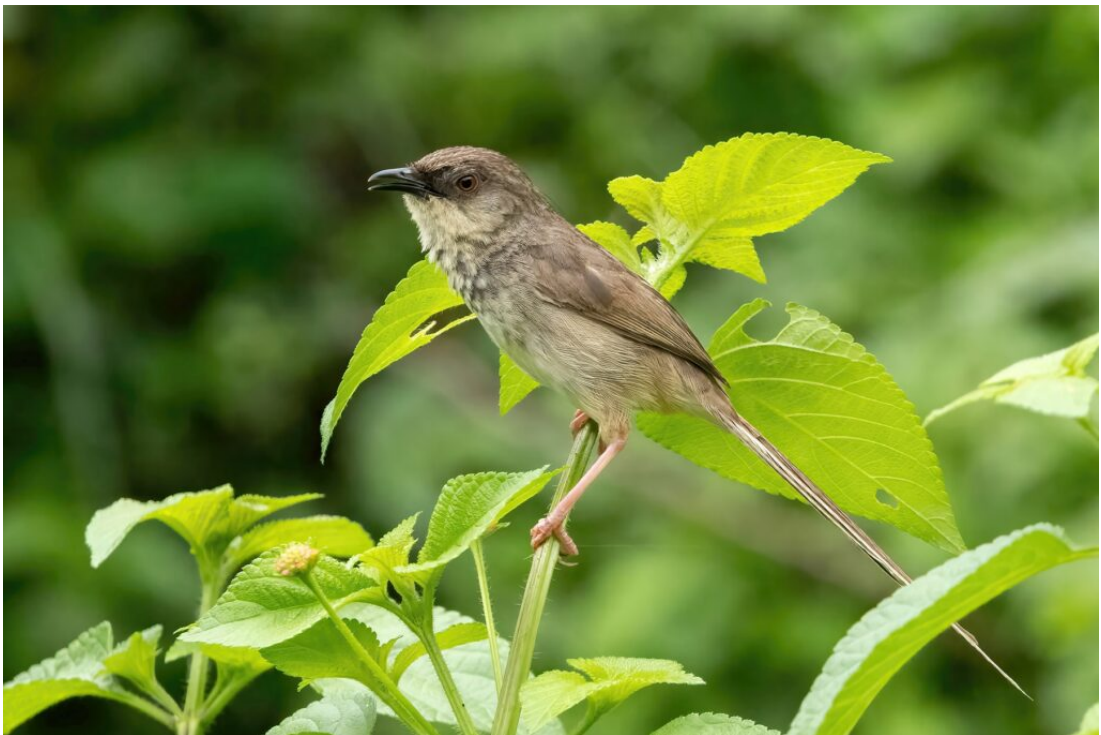
Himalayan Prinia