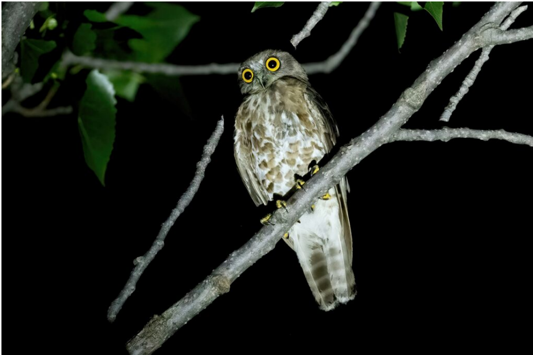
Brown Boobook