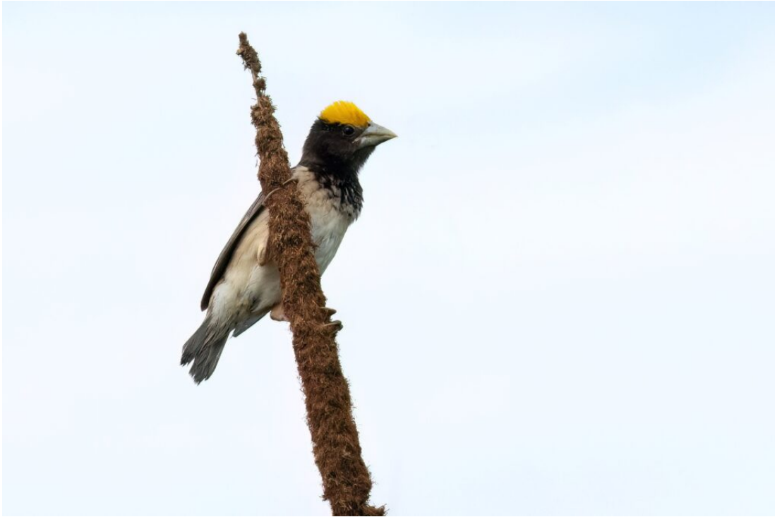
Black-breasted Weaver