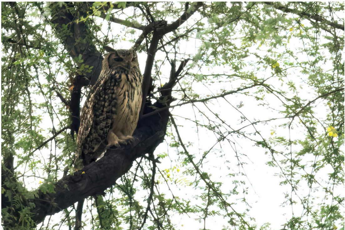
Indian Eagle-Owl