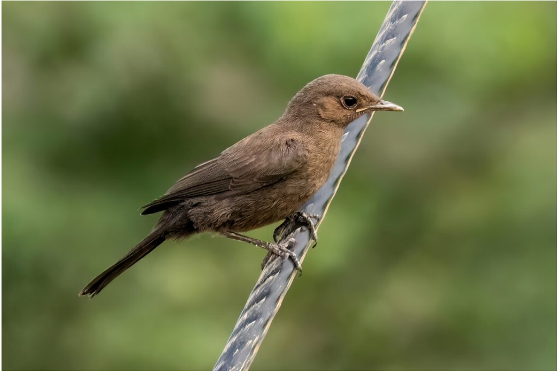
Brown Rockchat