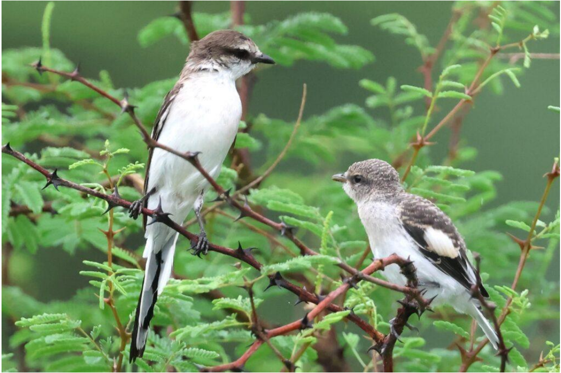
juvenile and female White-bellied Minivets