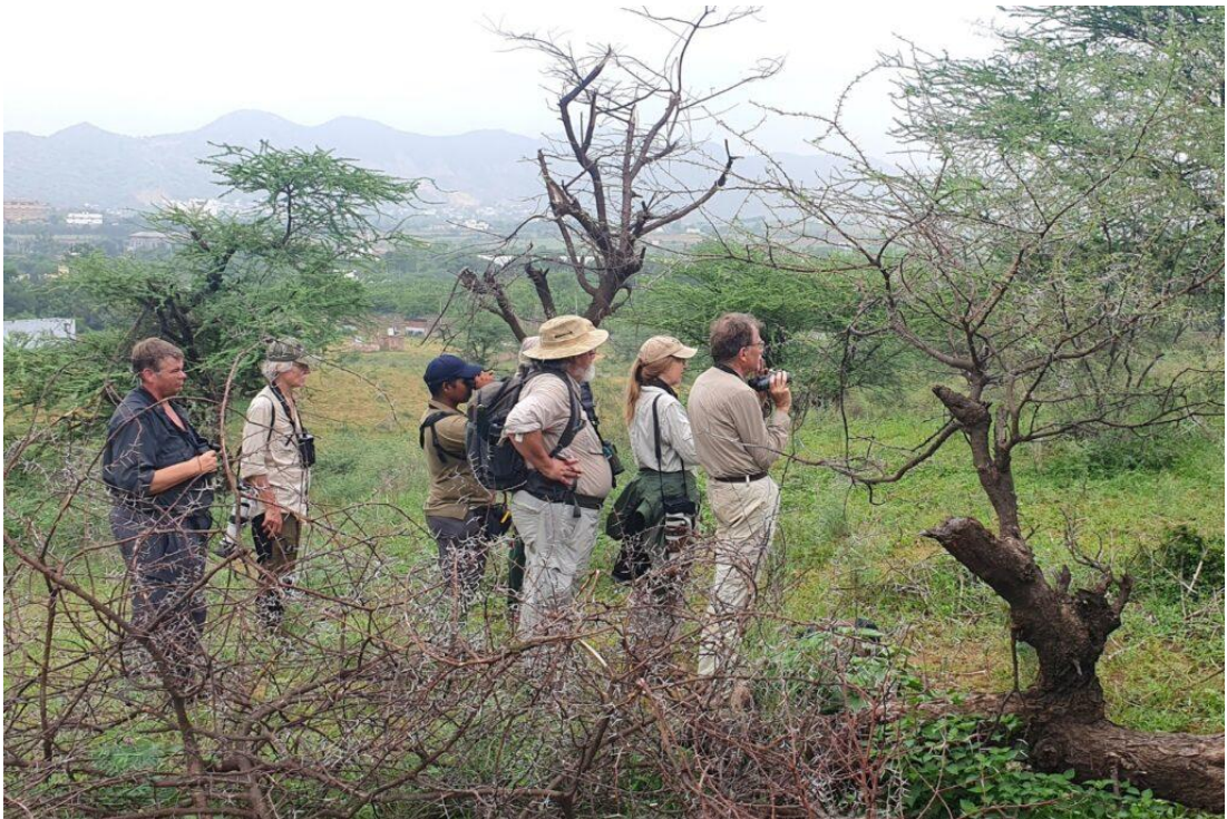
Birding near Pushkar