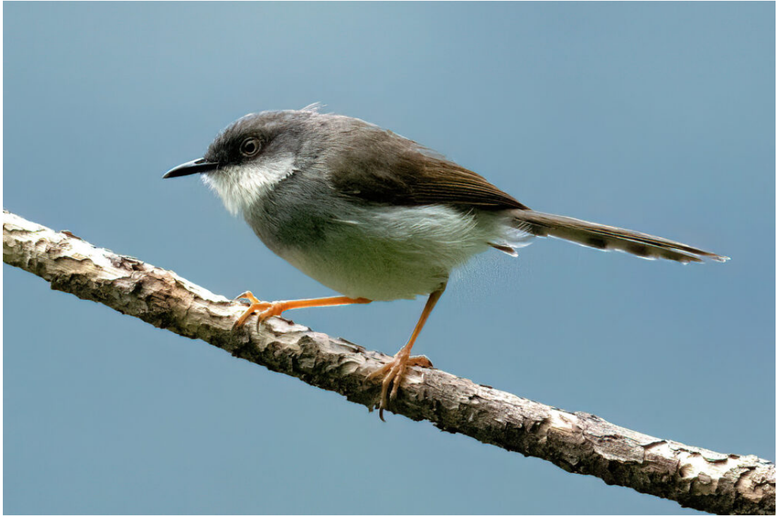
Grey-breasted Prinia