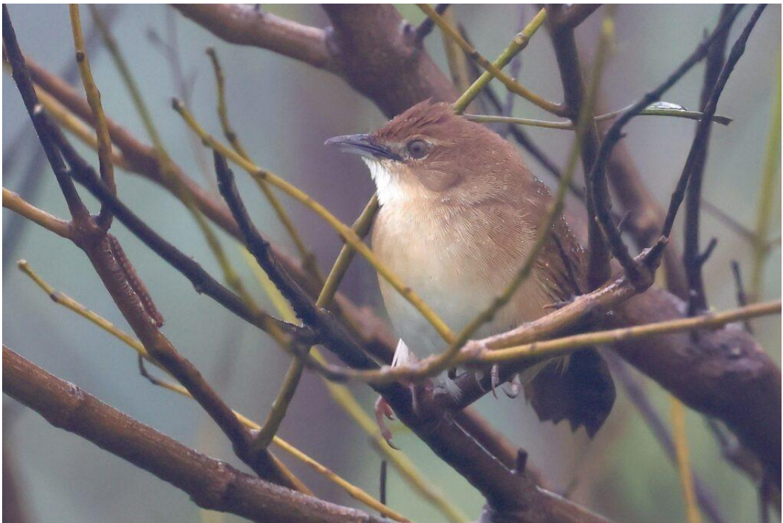
Broad-tailed Grassbird