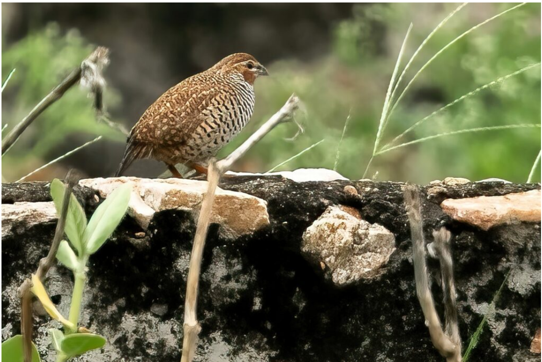
Rock Bush Quail