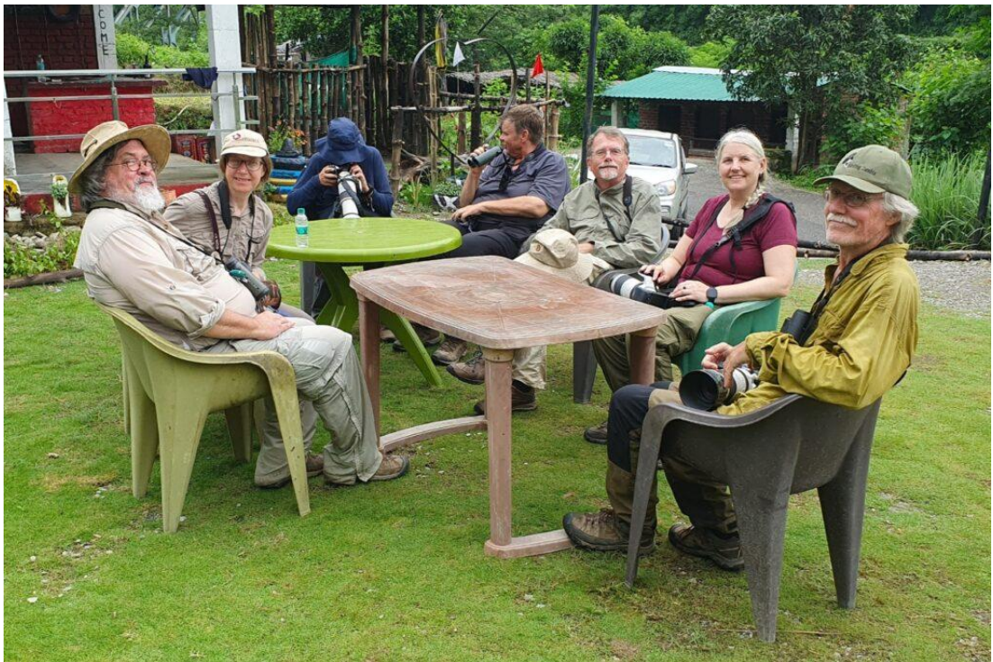
Lunch break in the foothills