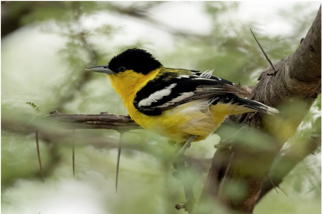
male Marshall's Iora