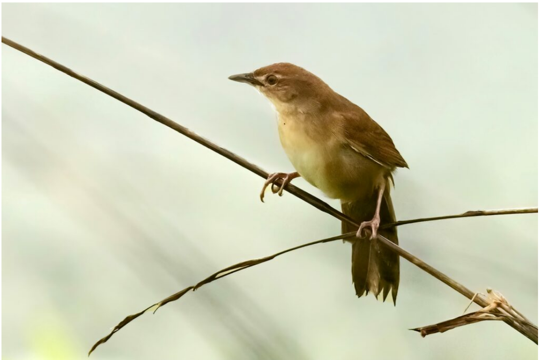
Broad-tailed Grassbird