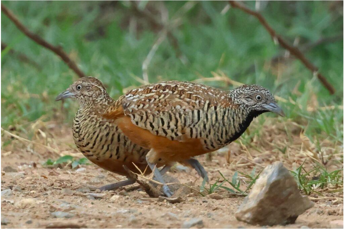
Barred Buttonquails