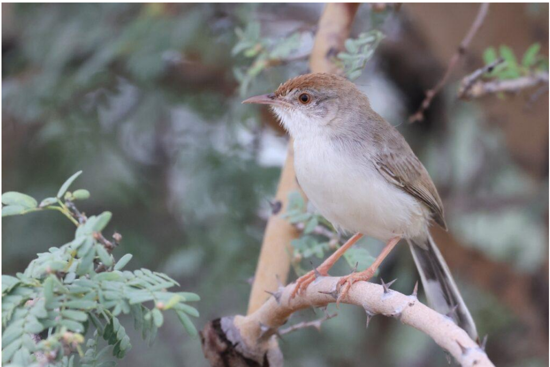
Rufous-fronted Prinia