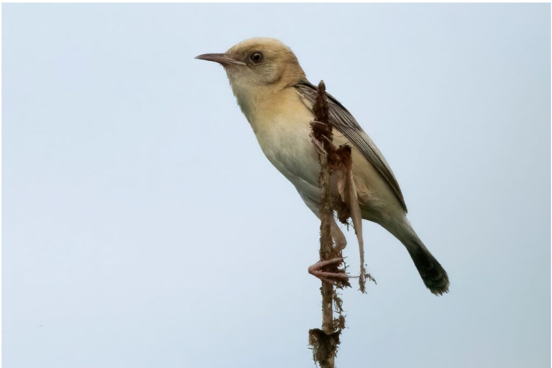
Golden-headed Cisticola