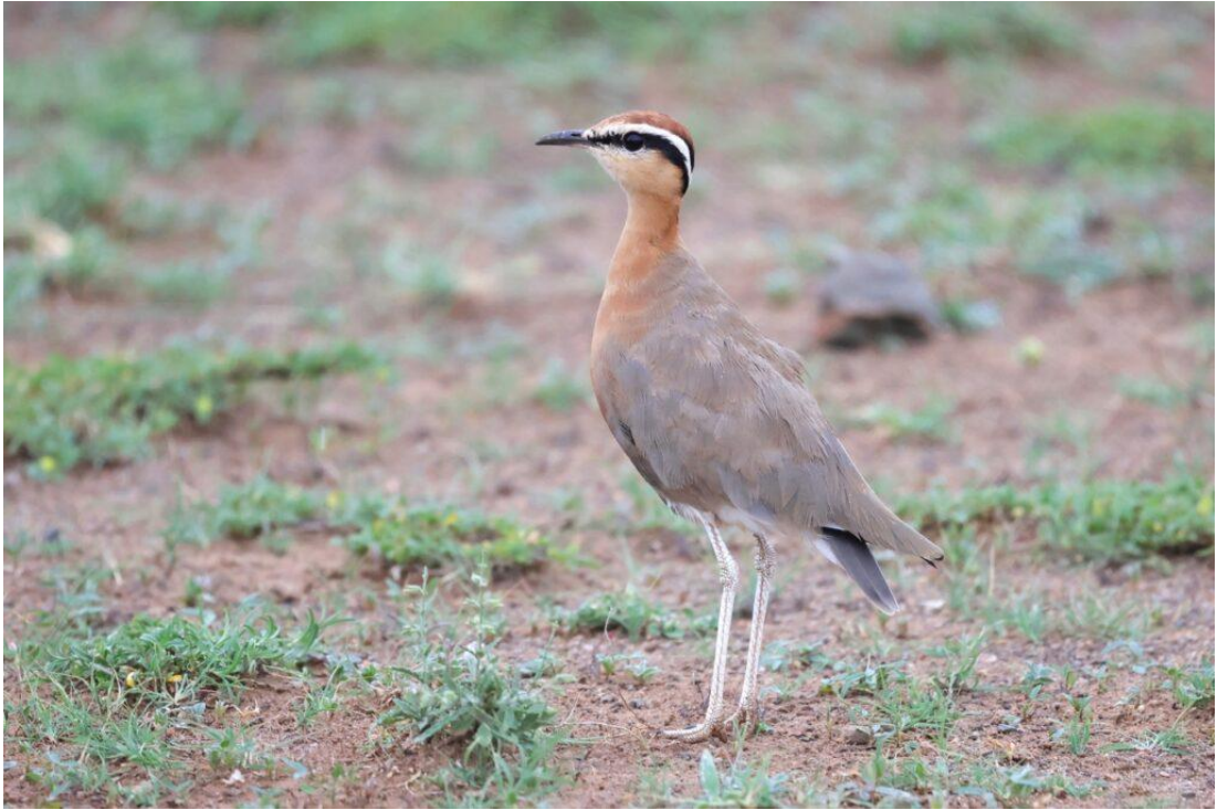
Indian Courser (image by Hannu Jännes)