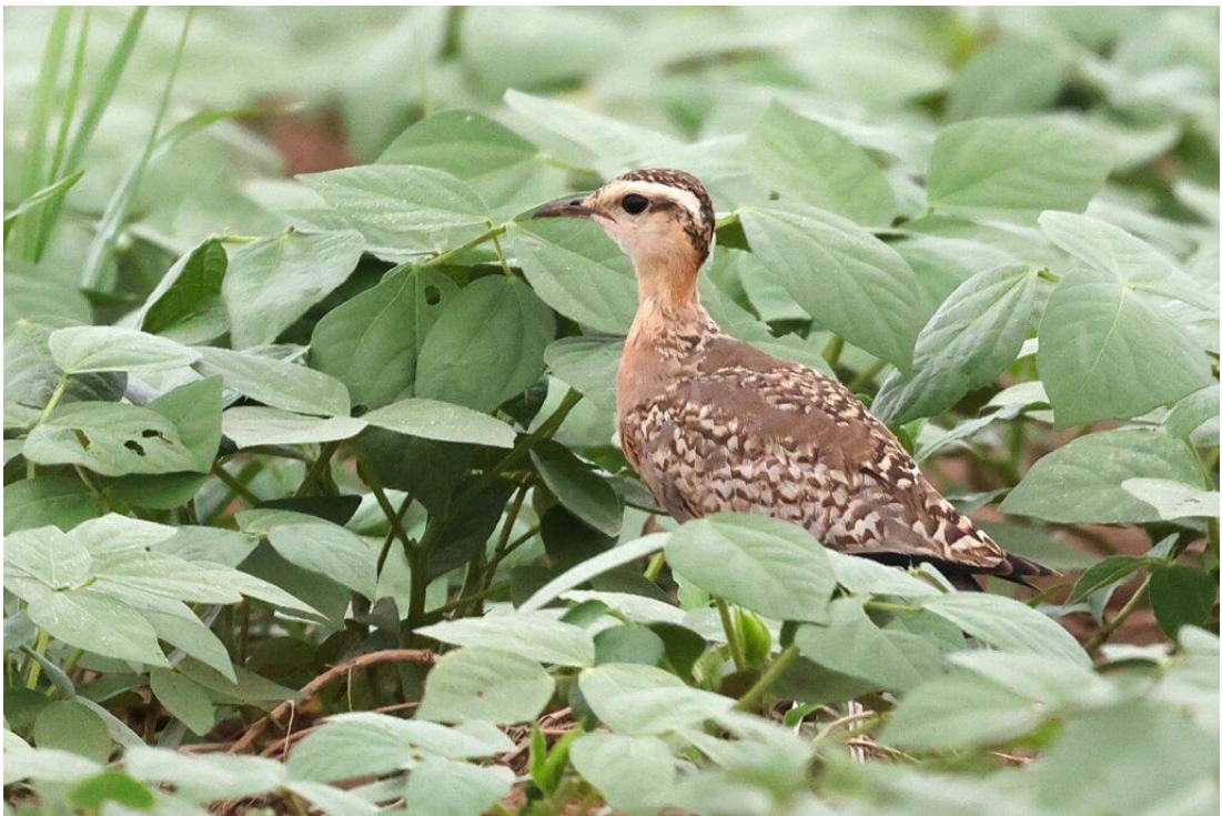
juvenile Indian Courser