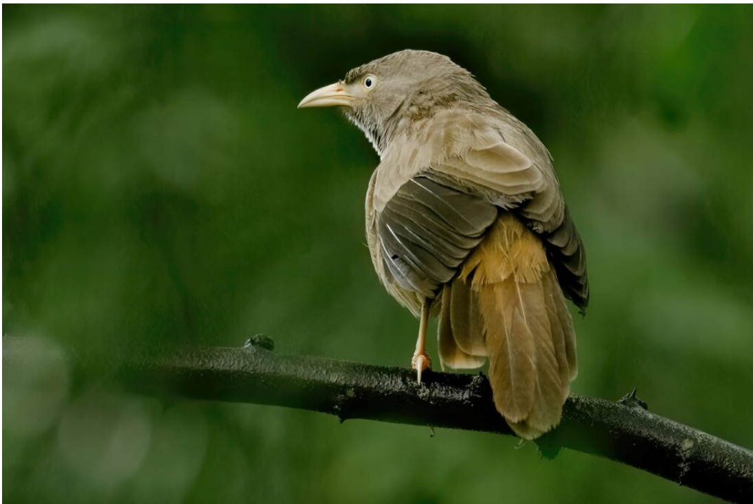
Jungle Babbler ssp somervillei