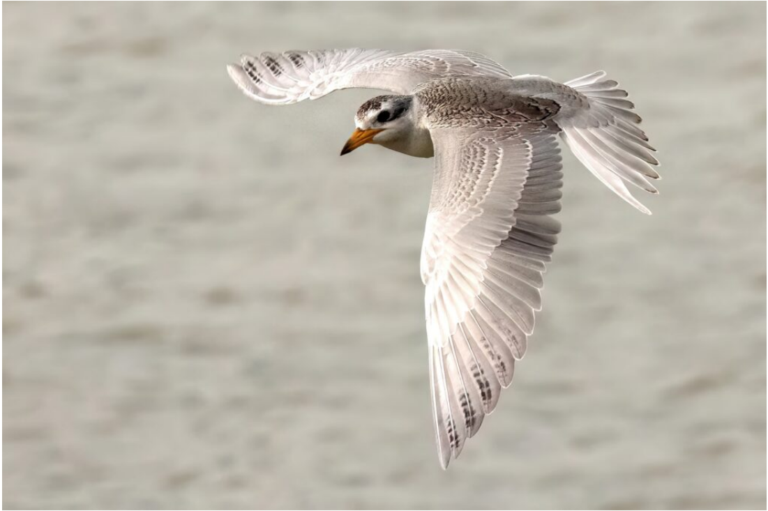
juvenile River Tern