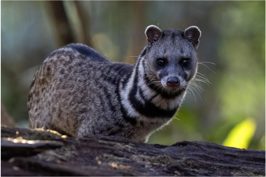
Malayan Civet