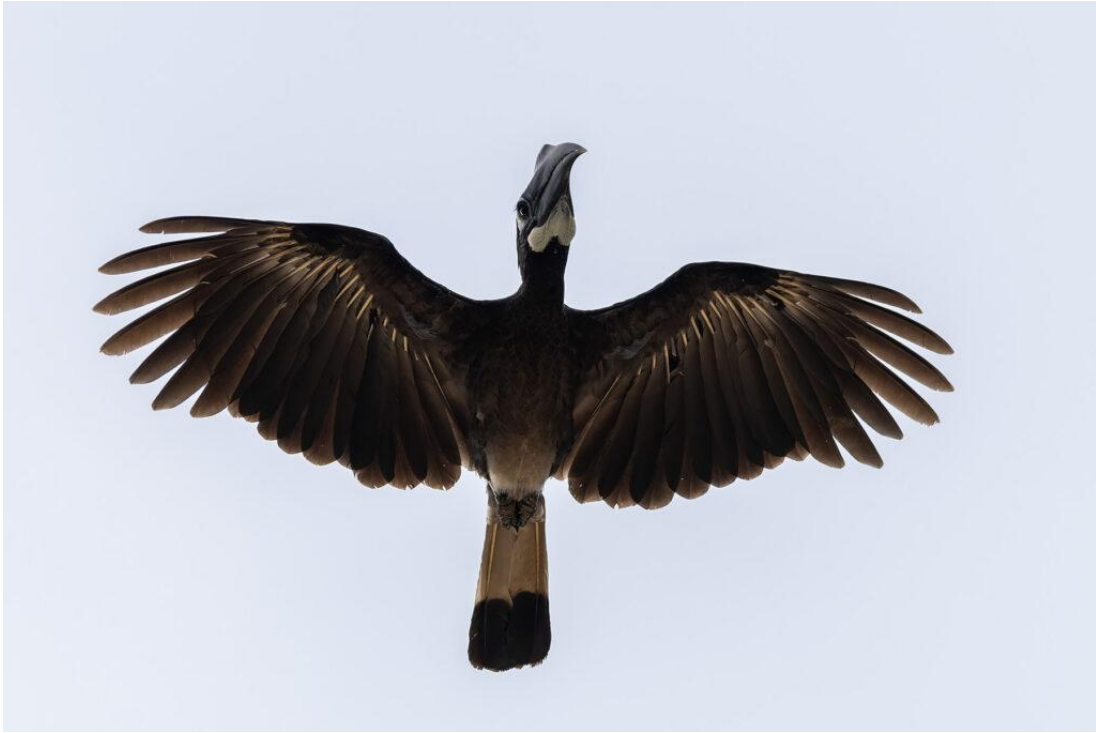
Bushy-crested Hornbill