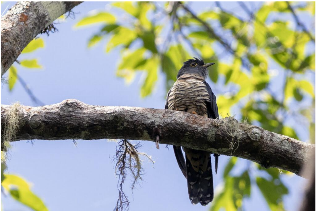
Sunda Cuckoo