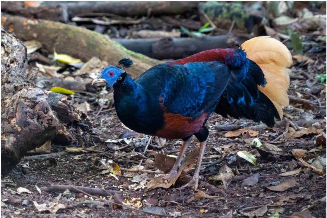
Bornean Fireback