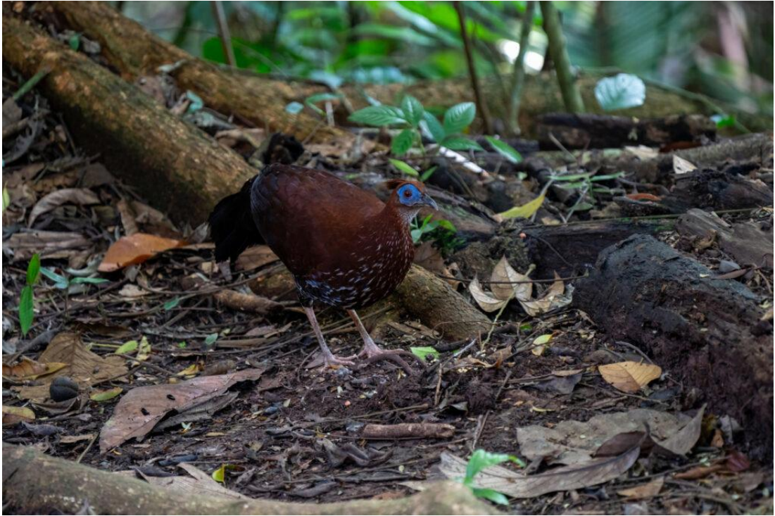
Bornean Fireback