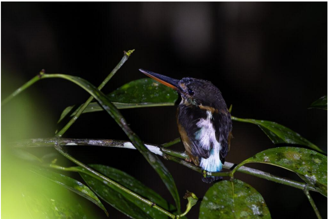
Malaysian Blue-banded Kingfisher