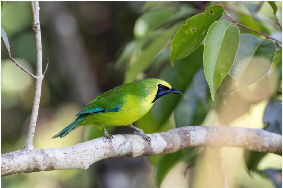
Bornean Leafbird