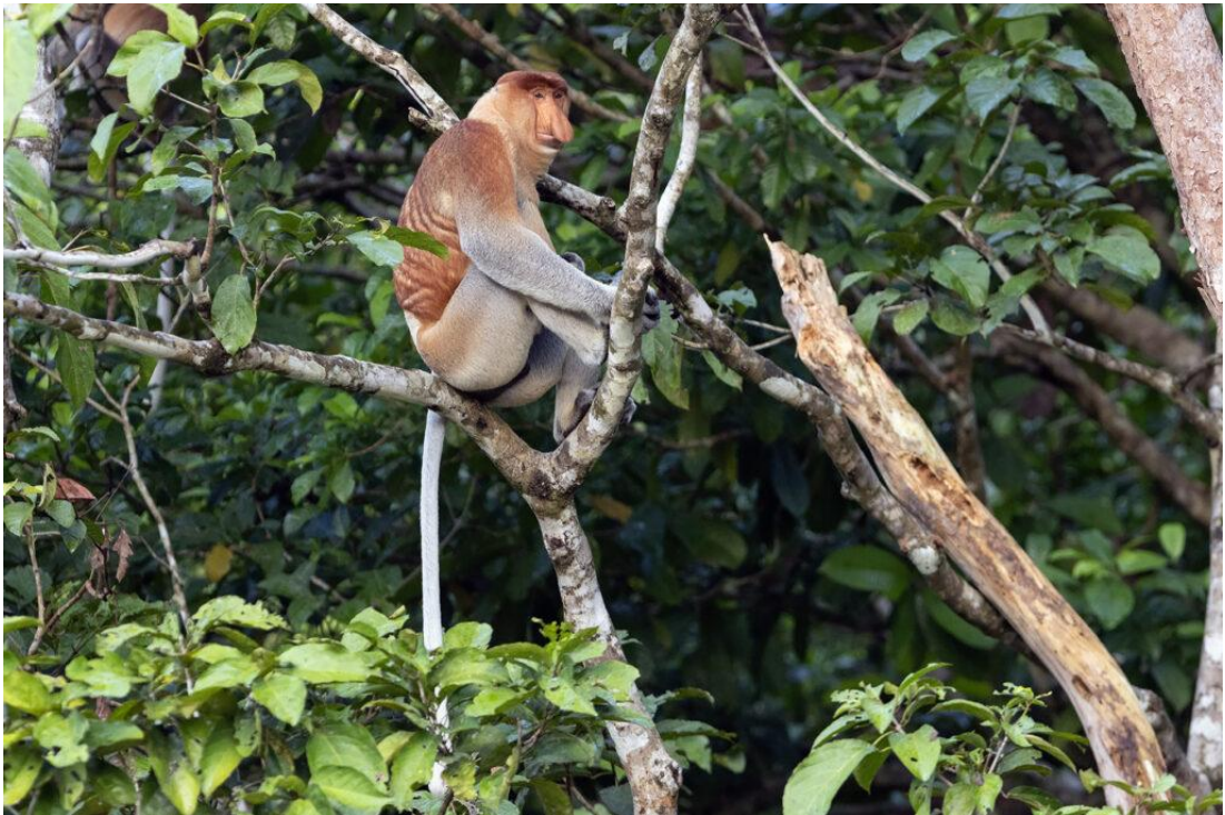
Proboscis Monkey