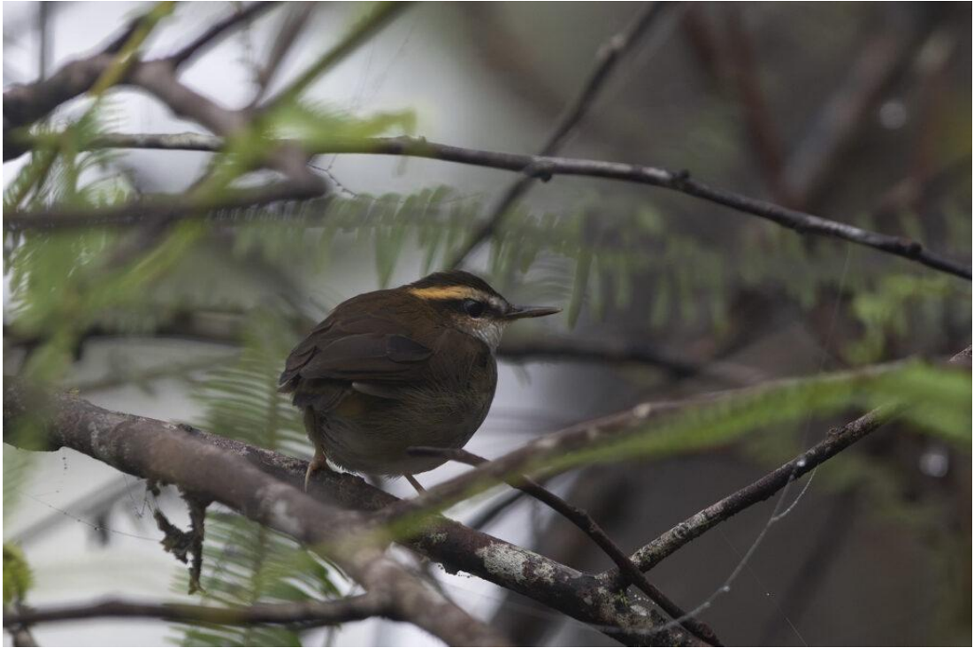
Bornean Stubtail