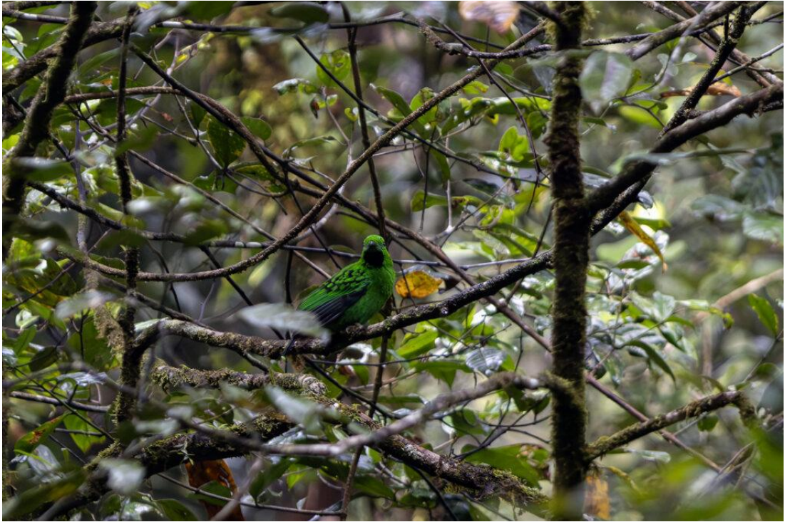
Whitehead's Broadbill