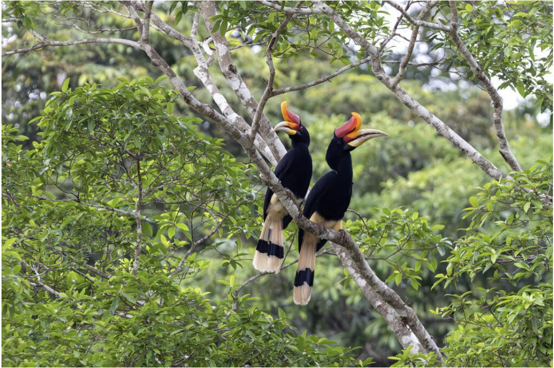
Rhinoceros Hornbill