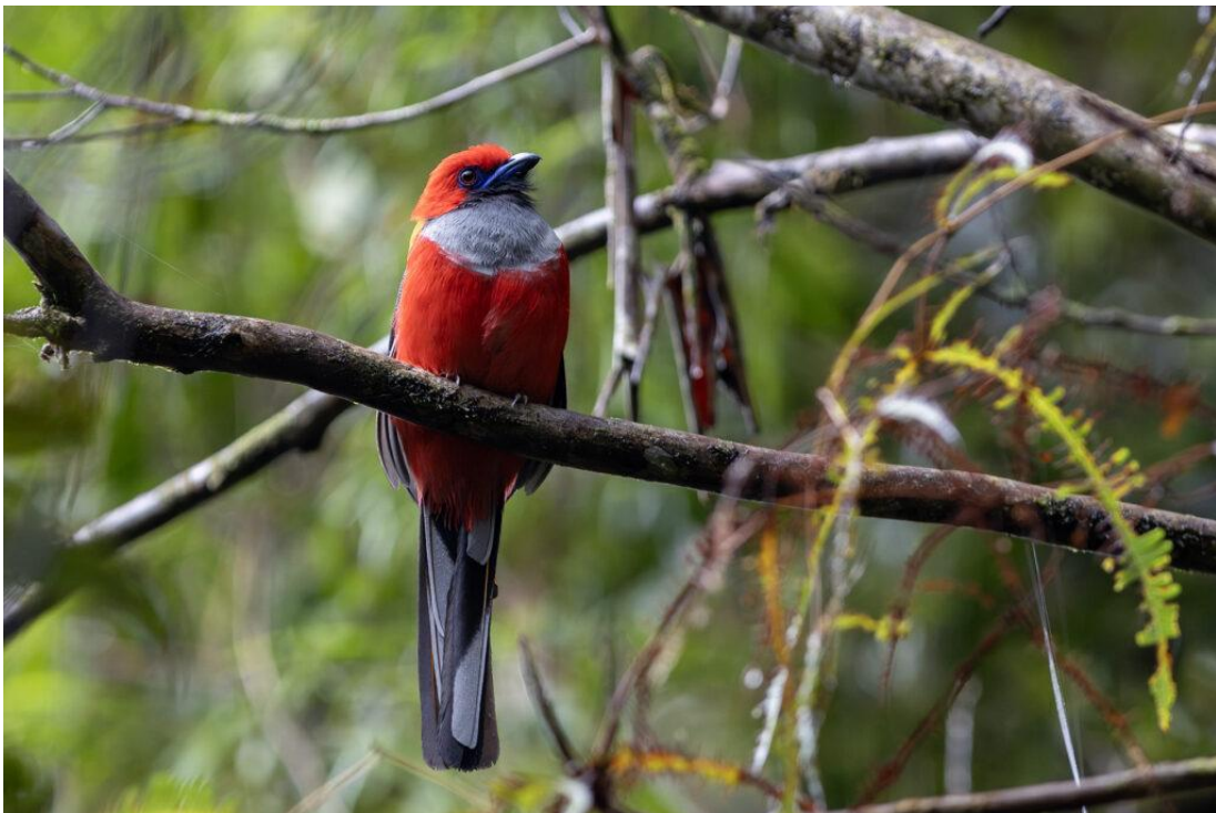
male Whitehead's Trogon