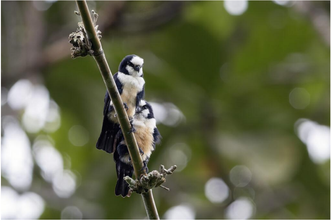
White-fronted Falconet