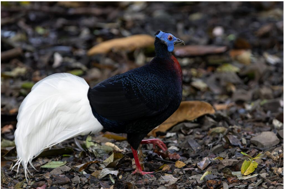
Bulwer's Pheasant (image by Dáni Balla)