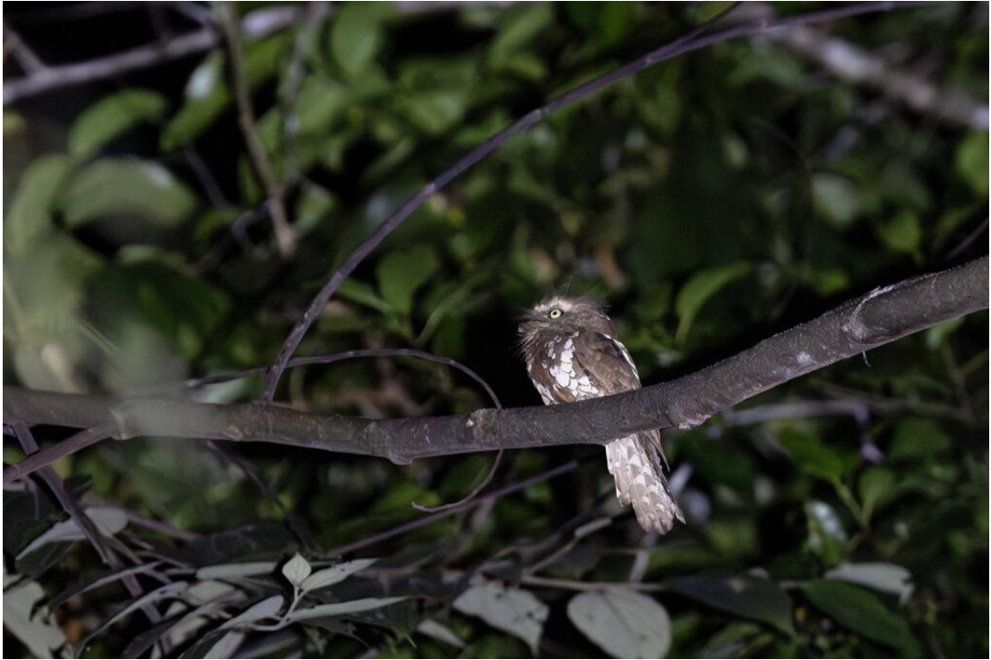
Bornean Frogmouth