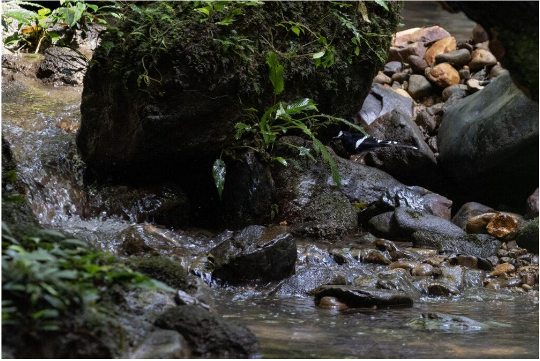
Bornean Forktail