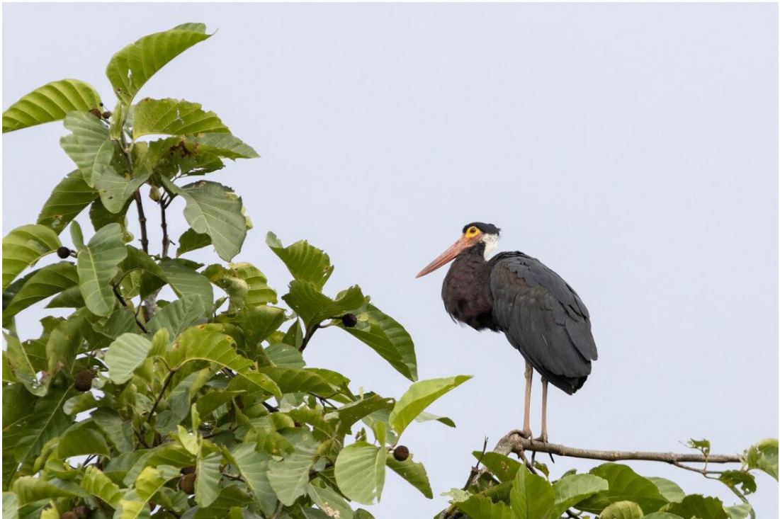
Storm's Stork (image by Dáni Balla)