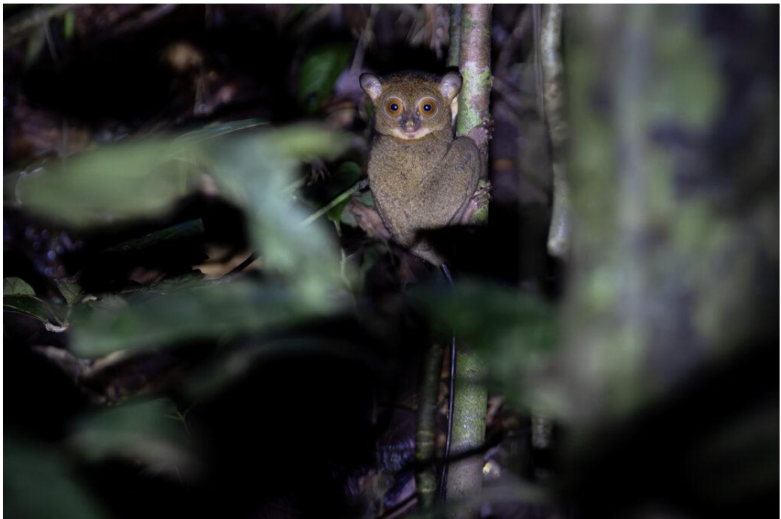
Horsfield's Tarsier