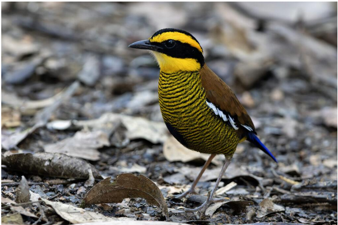
Male Bornean Banded Pitta – another gem from the forest floor