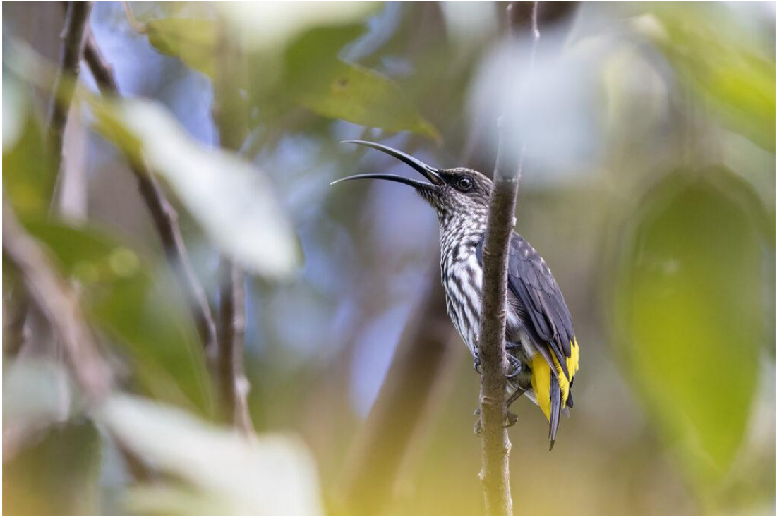
Whitehead's Spiderhunter