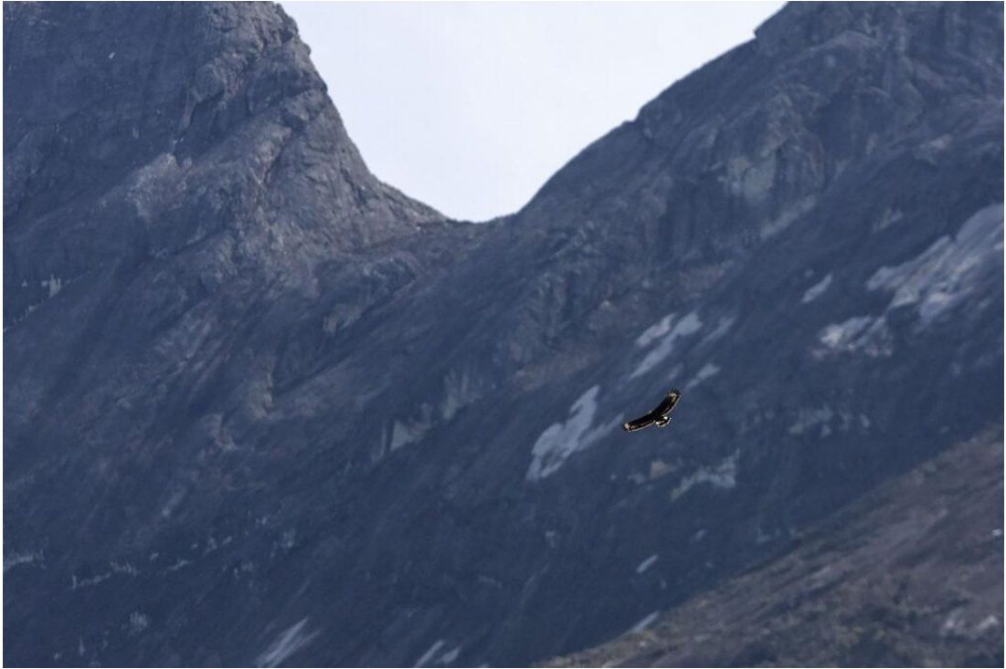
Mountain Serpent Eagle, also known as Kinabalu Serpent Eagle, soaring in front of Mt. Kinabalu