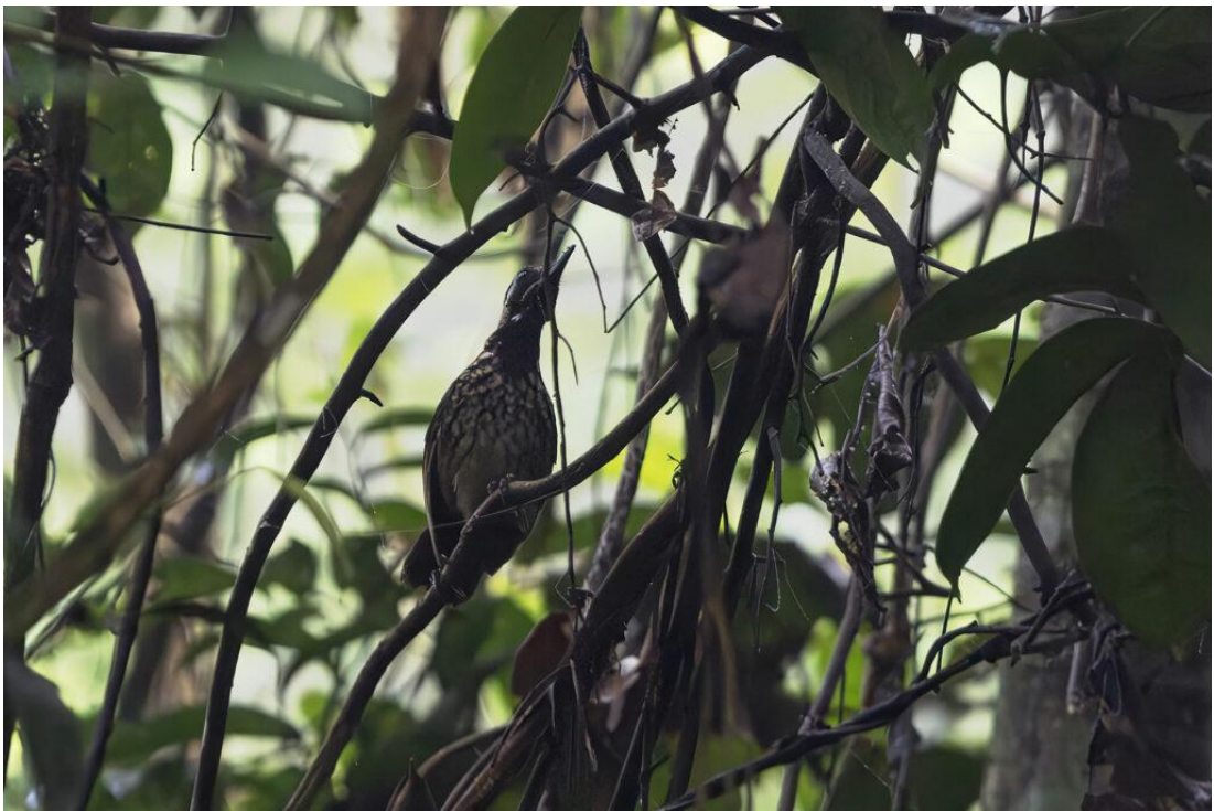
Black-throated Wren-Babbler