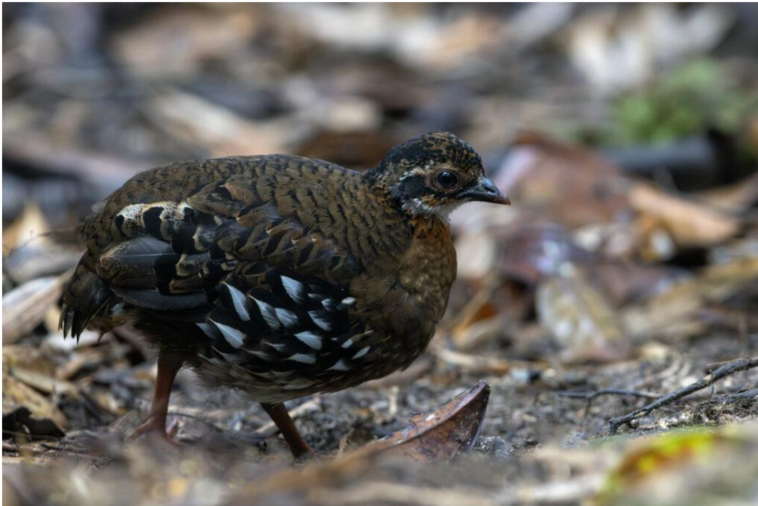
Red-breasted Partridge