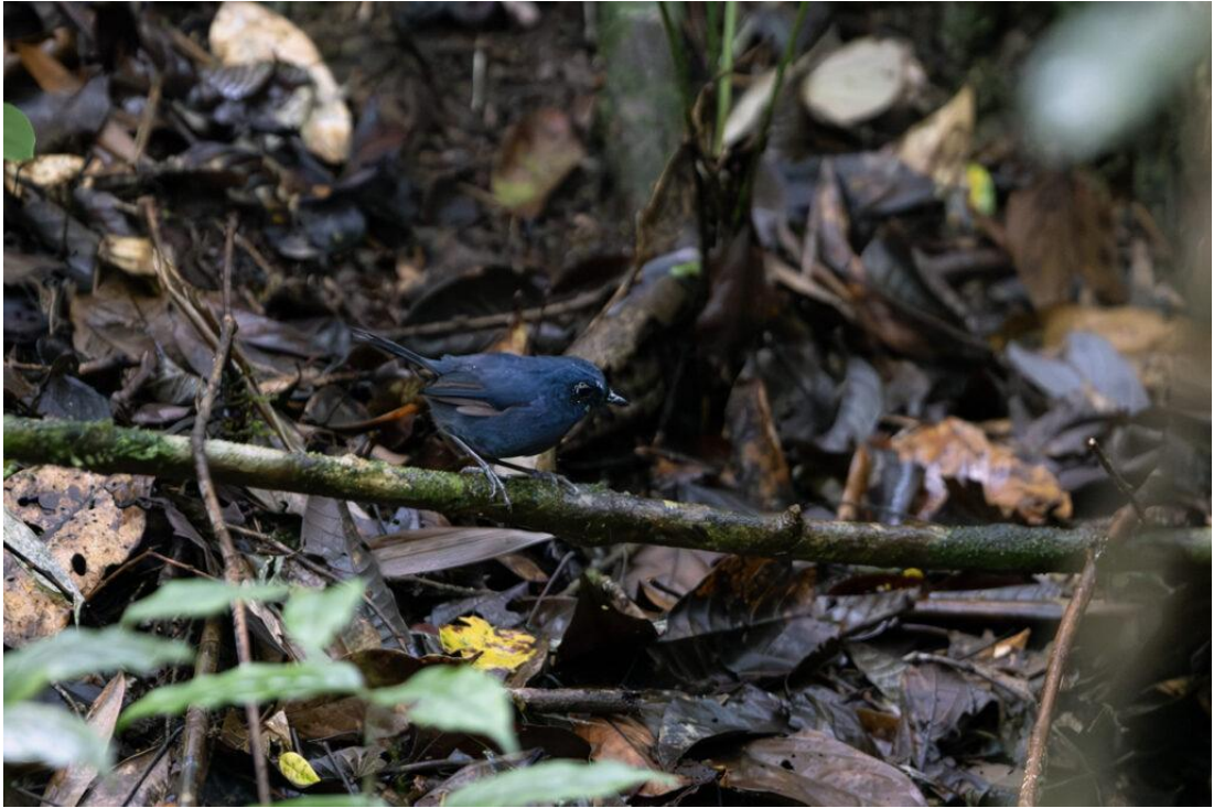
Bornean Shortwing