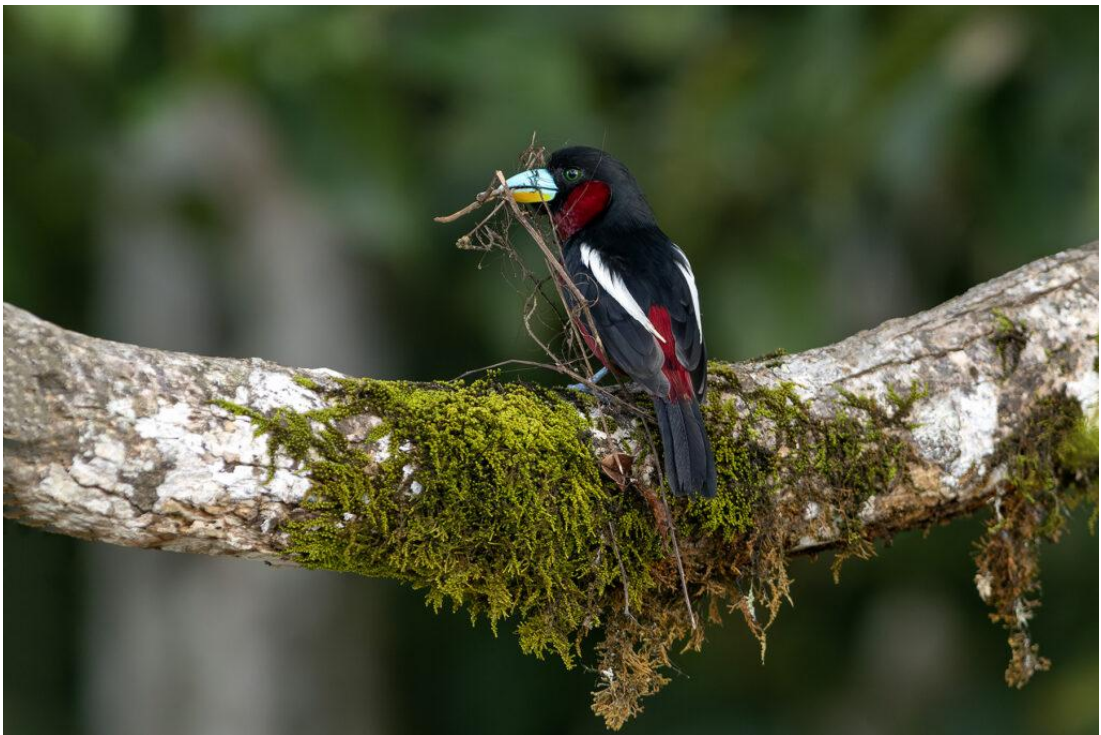
Black-and-red Broadbill