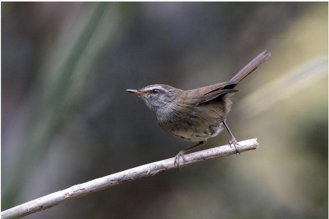
Sunda Bush Warbler was recently lumped back into Aberrant Bush Warbler (image by Dáni Balla)