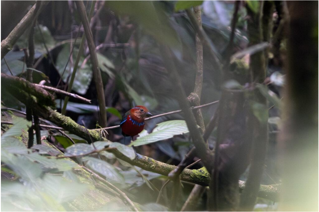
Blue-banded Pitta