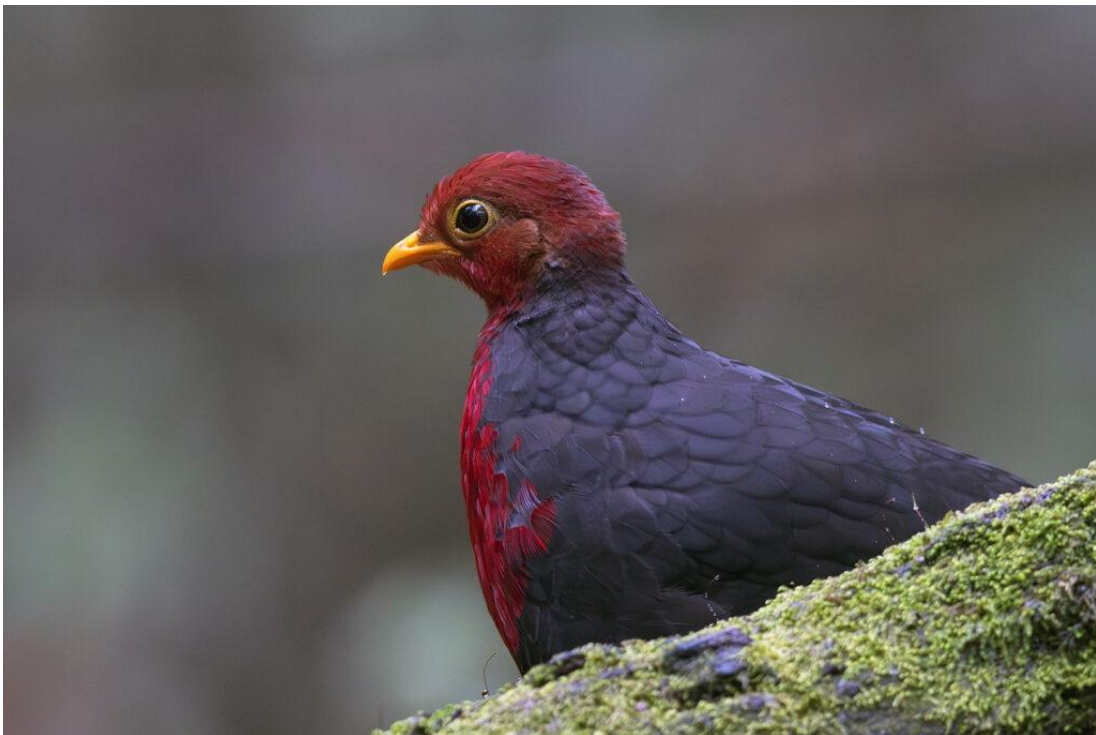
male Crimson-headed Partridge a.k.a. Bloodhead