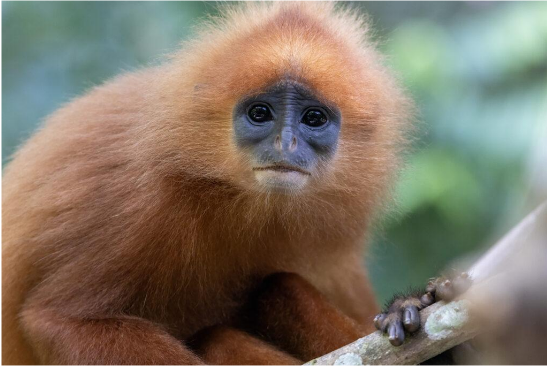
Maroon Leaf Monkey