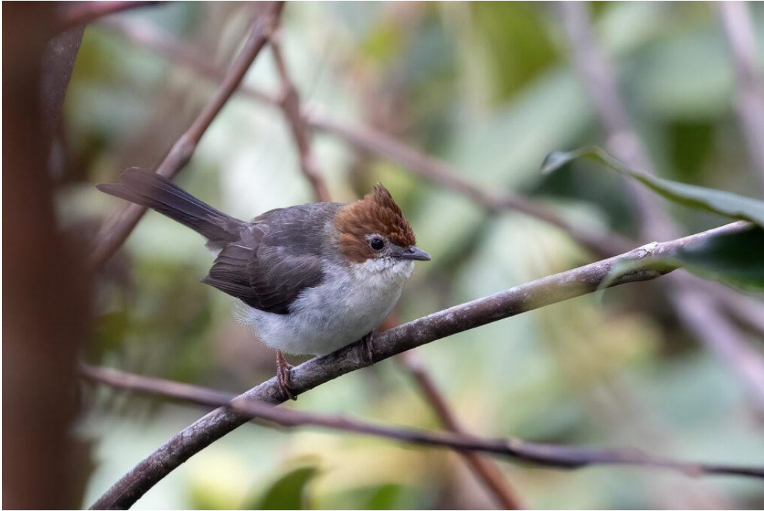
Chestnut-crested Yuhina