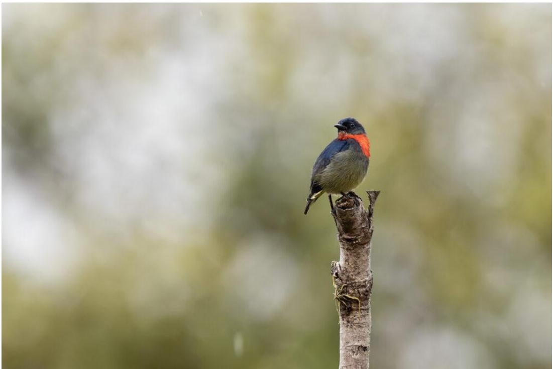
Black-sided Flowerpecker