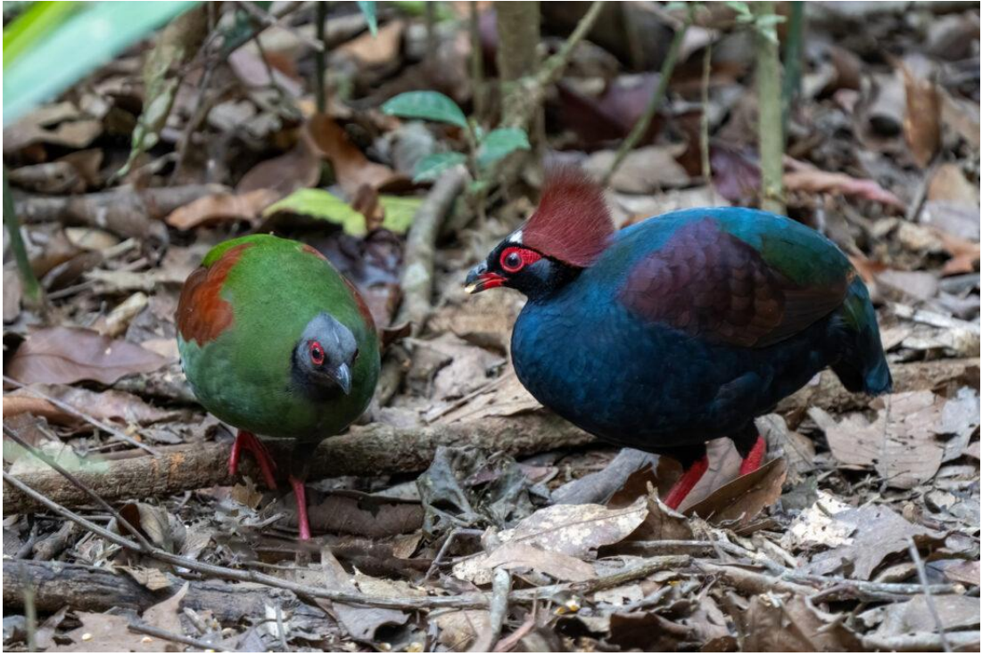
Crested Partridges