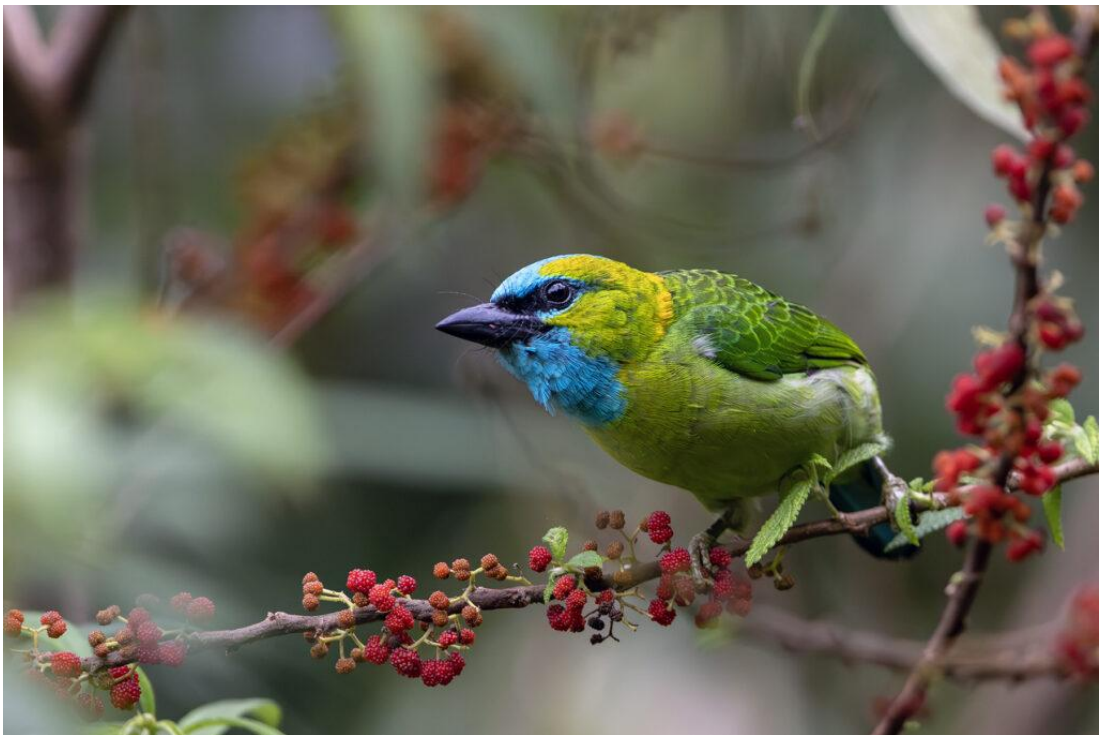
Golden-naped Barbet