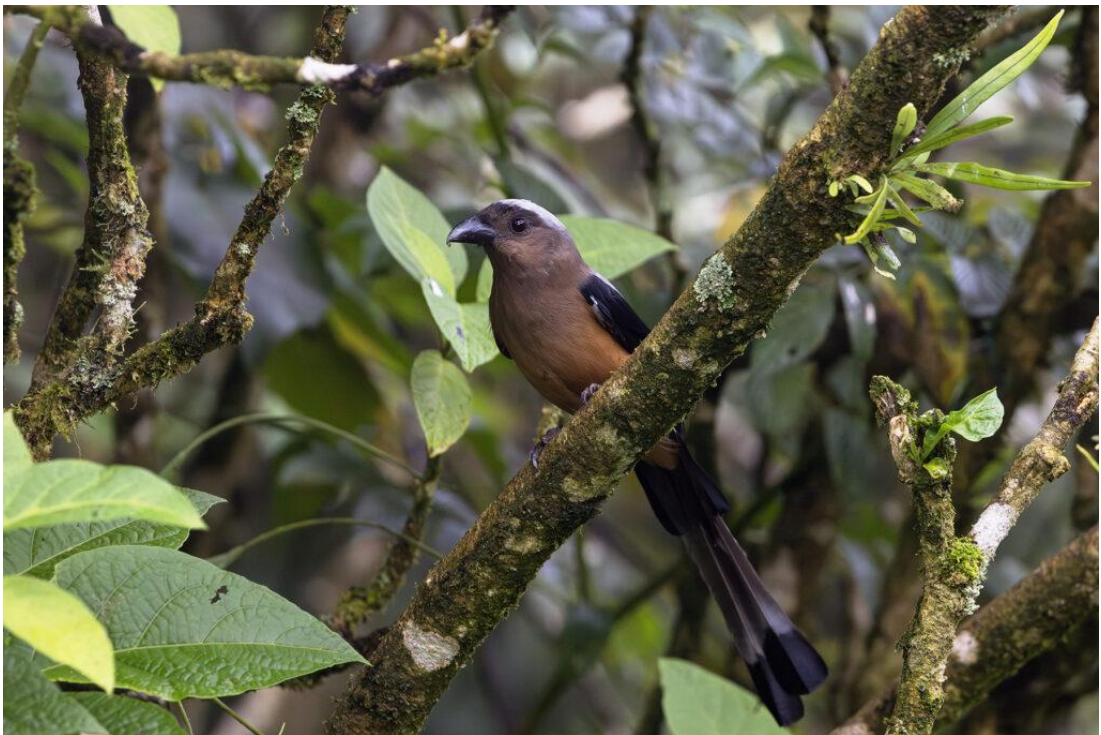
Bornean Treepie