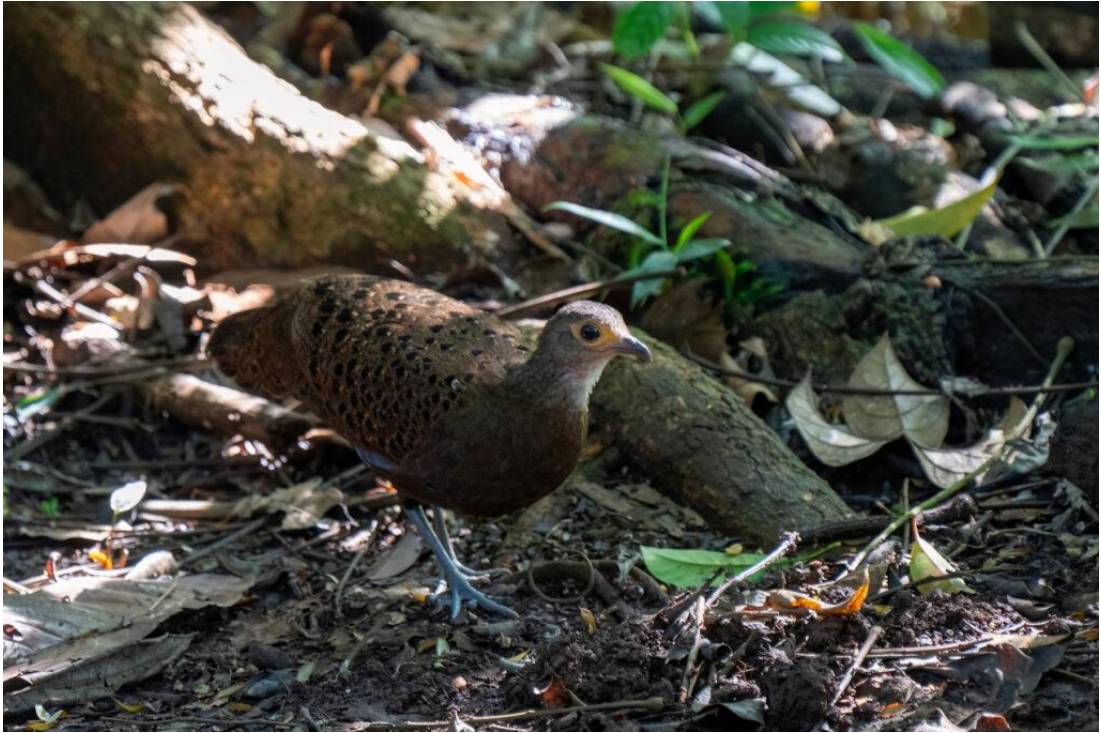
Bornean Peacock-Pheasant