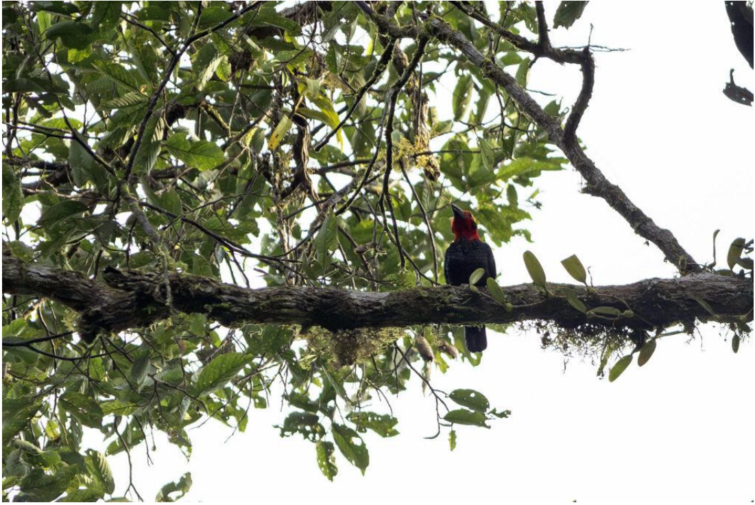
Bornean Bristlehead