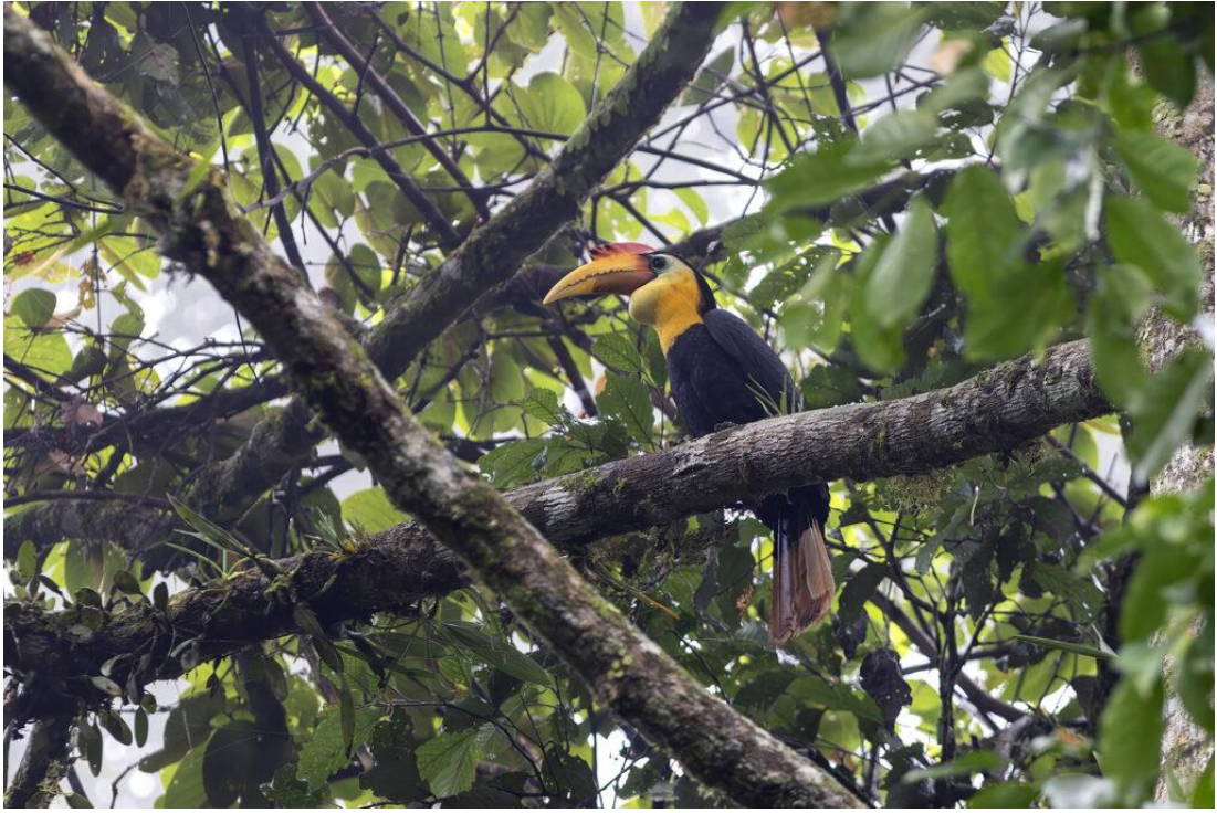
Wrinkled Hornbill