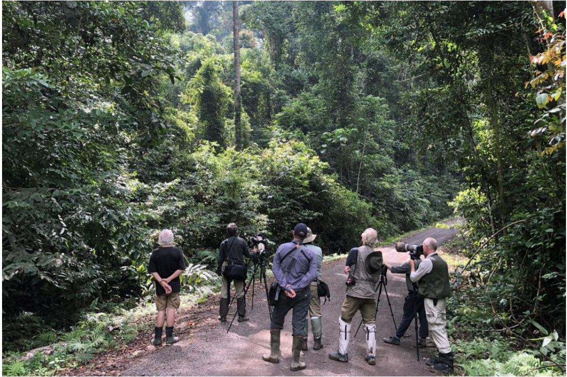
Birding in Danum Valley