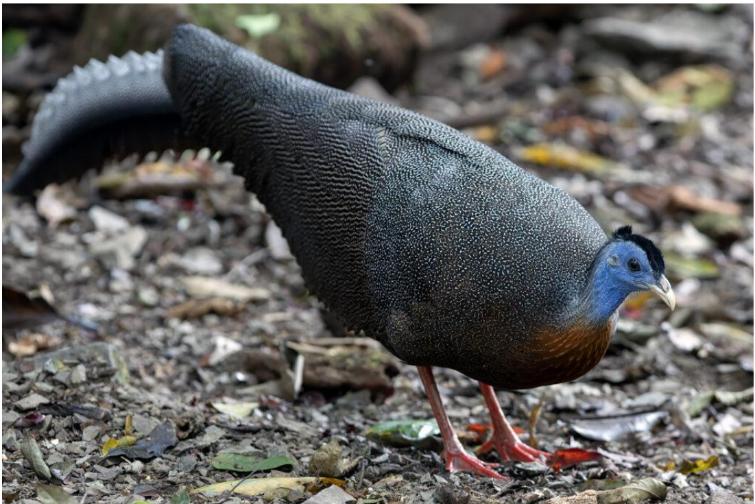
Great Argus