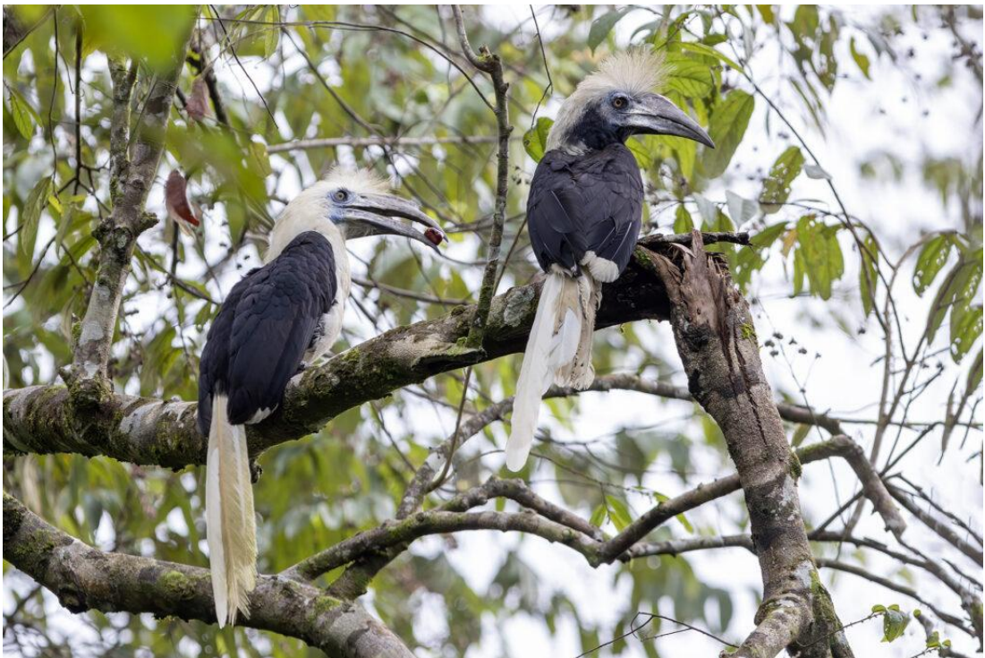
A pair of the ancient looking White-crowned Hornbill