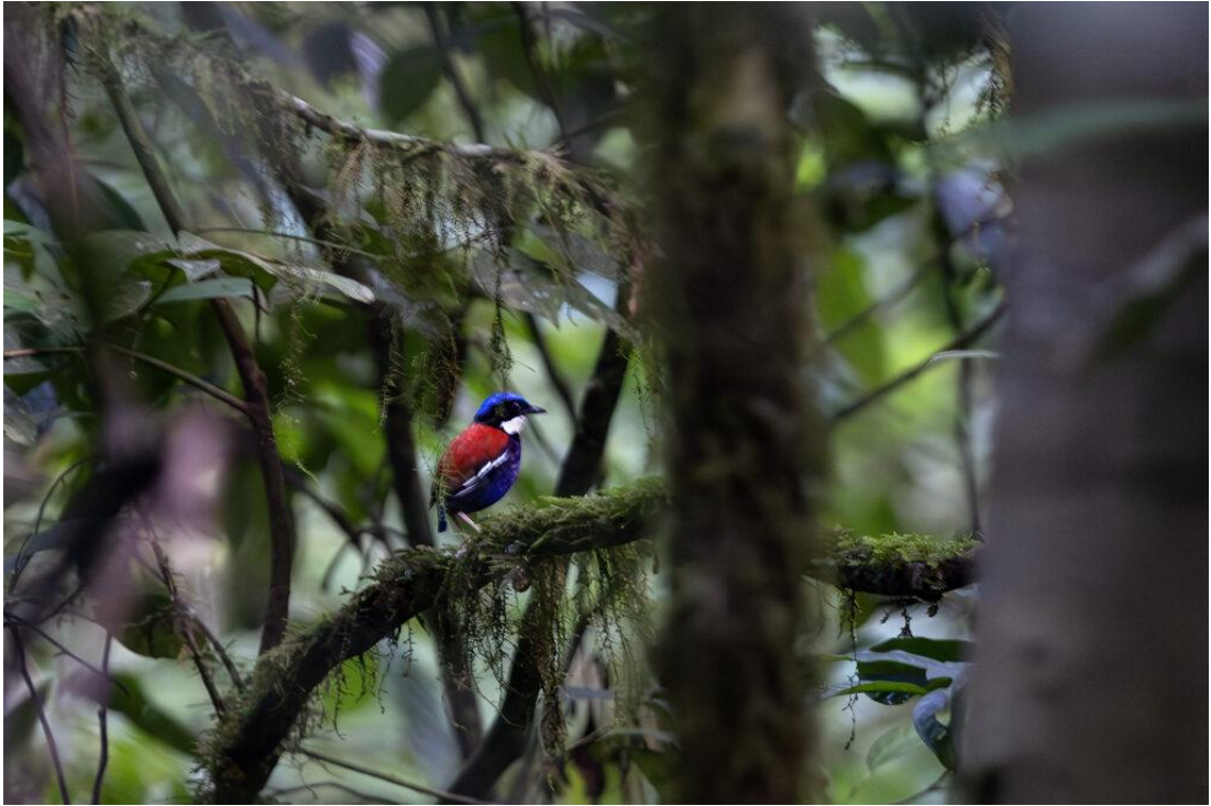
The stunning male of the Blue-headed Pitta is a real jewel of the forest floor