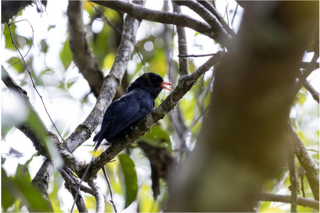
Singing male of the very localised Black Oriole