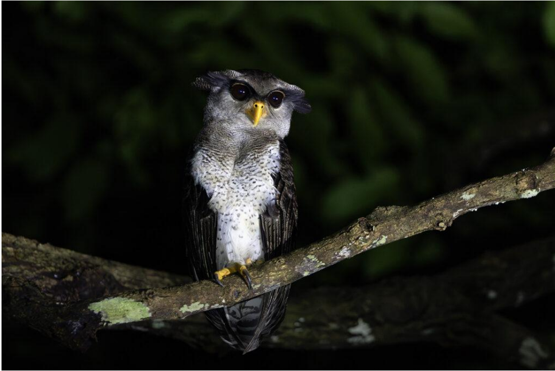
Barred Eagle Owl