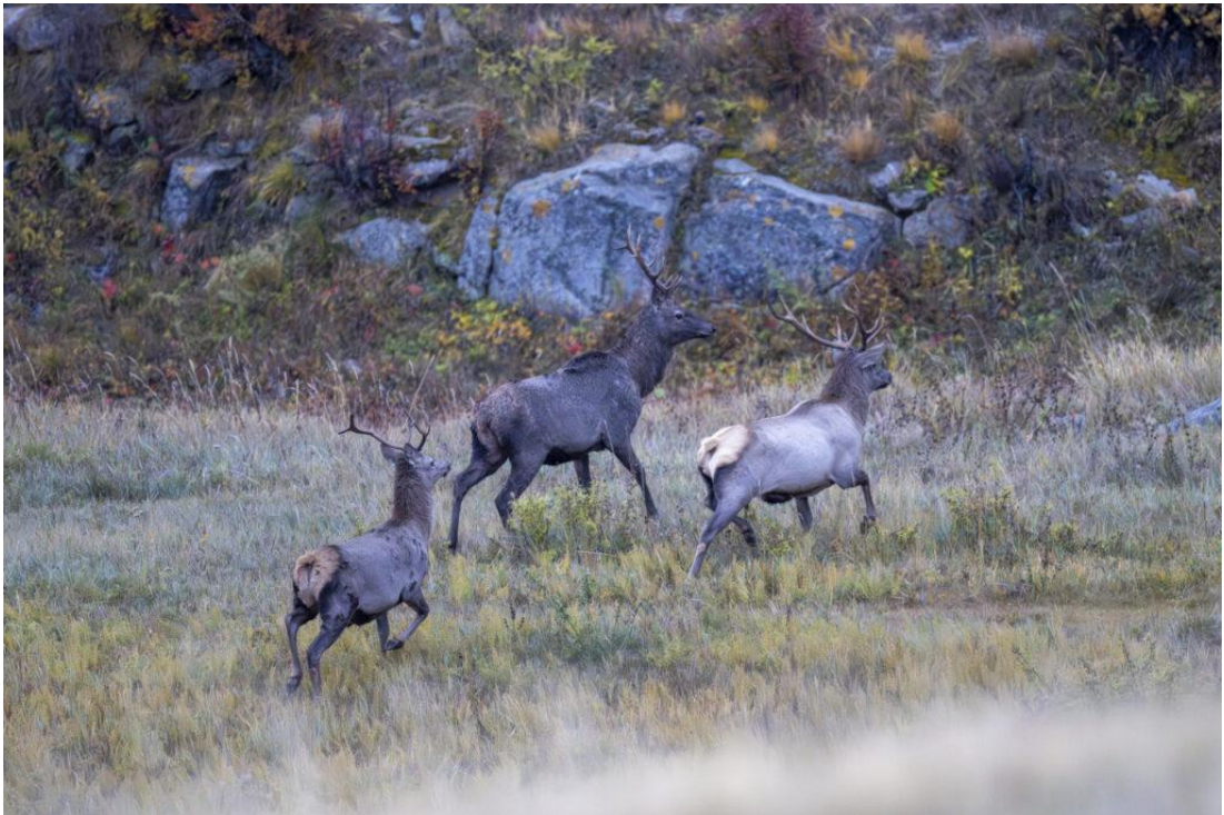
'Siberian' Elk