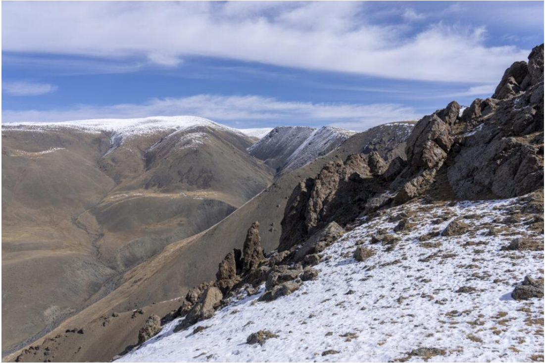
The Jargalant range