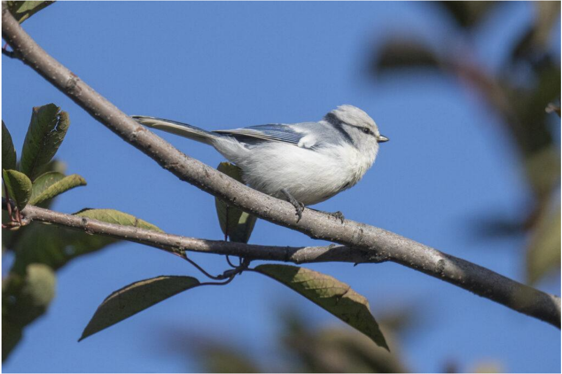
Azure Tit