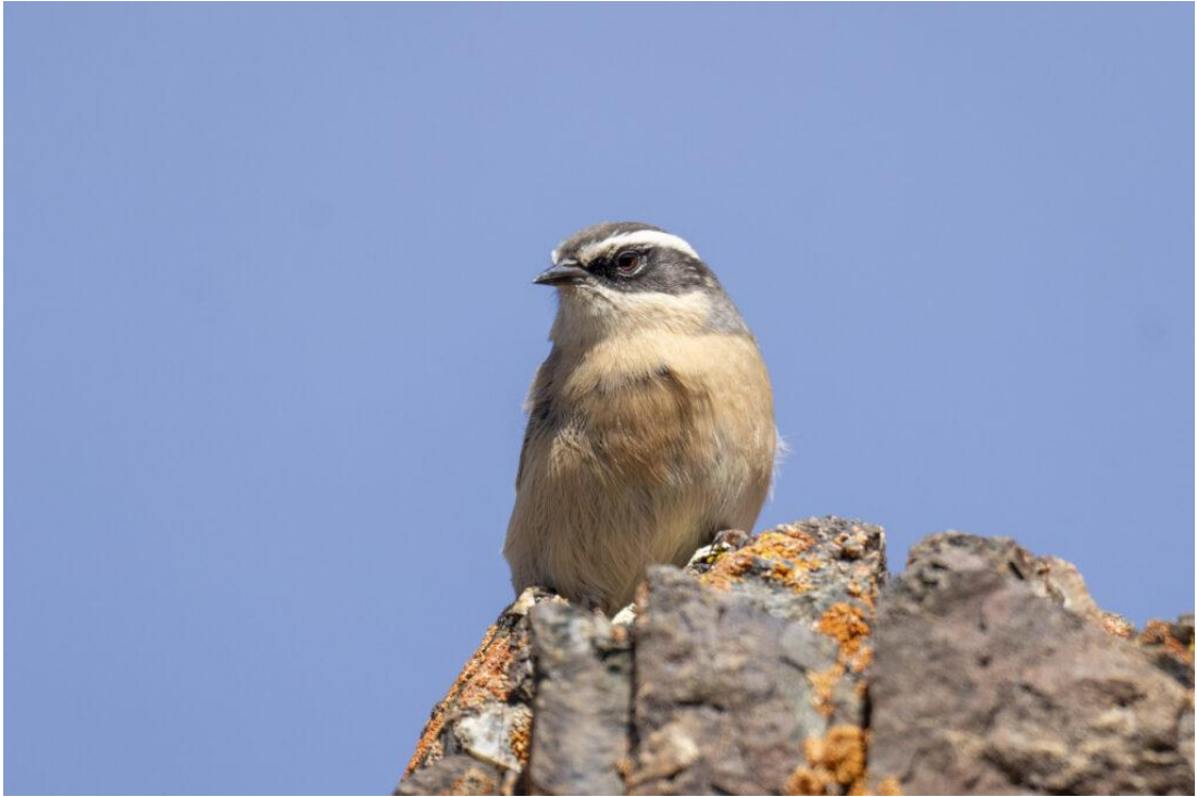
Brown Accentor