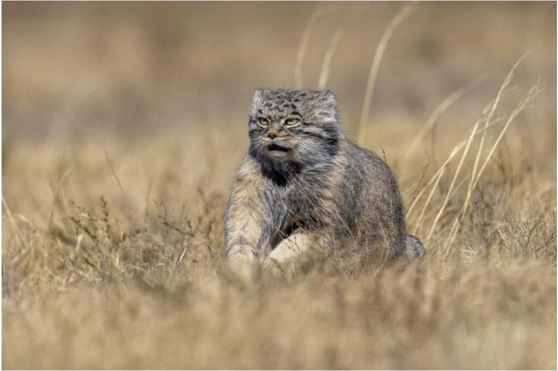
Pallas's Cat