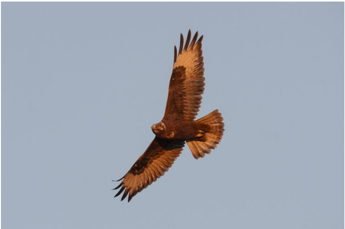
Upland Buzzard dark morph