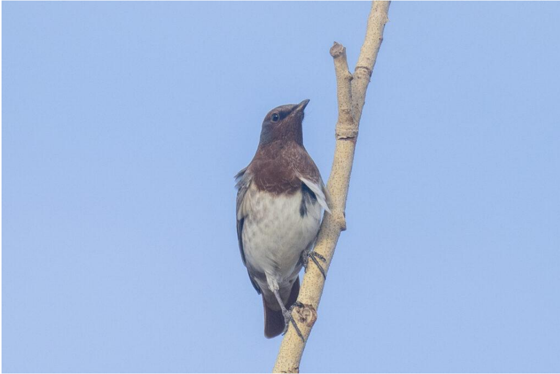
Red-throated Thrush