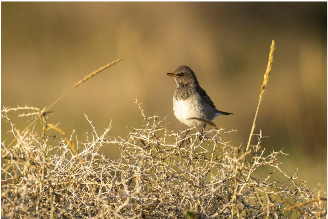
Black-throated Thrush