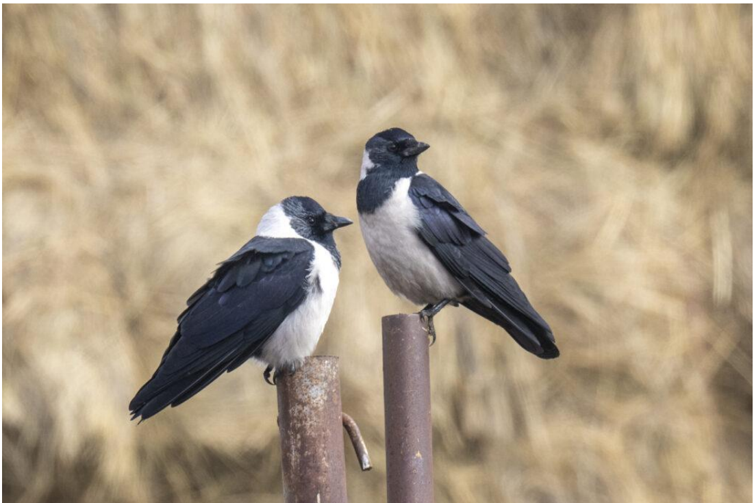
Daurian Jackdaws