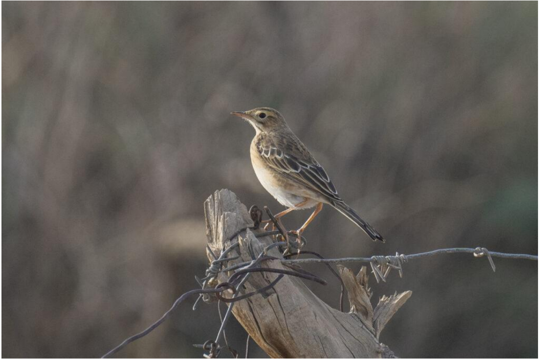
Blyth's Pipit