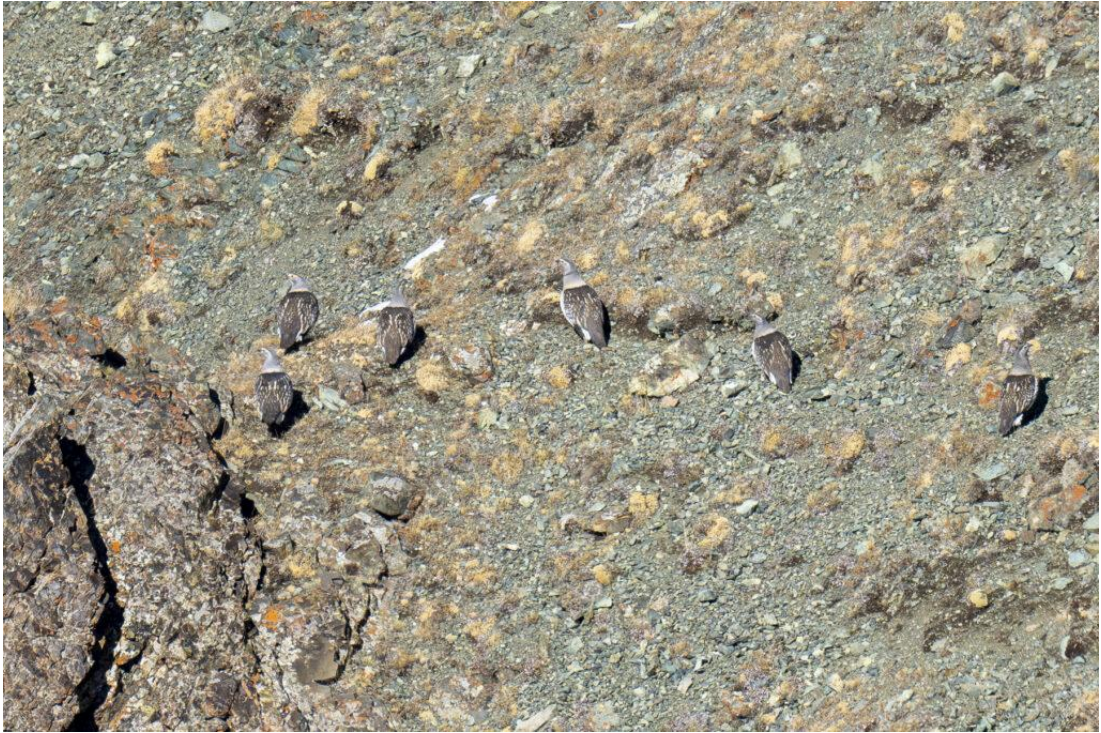
Altai Snowcocks