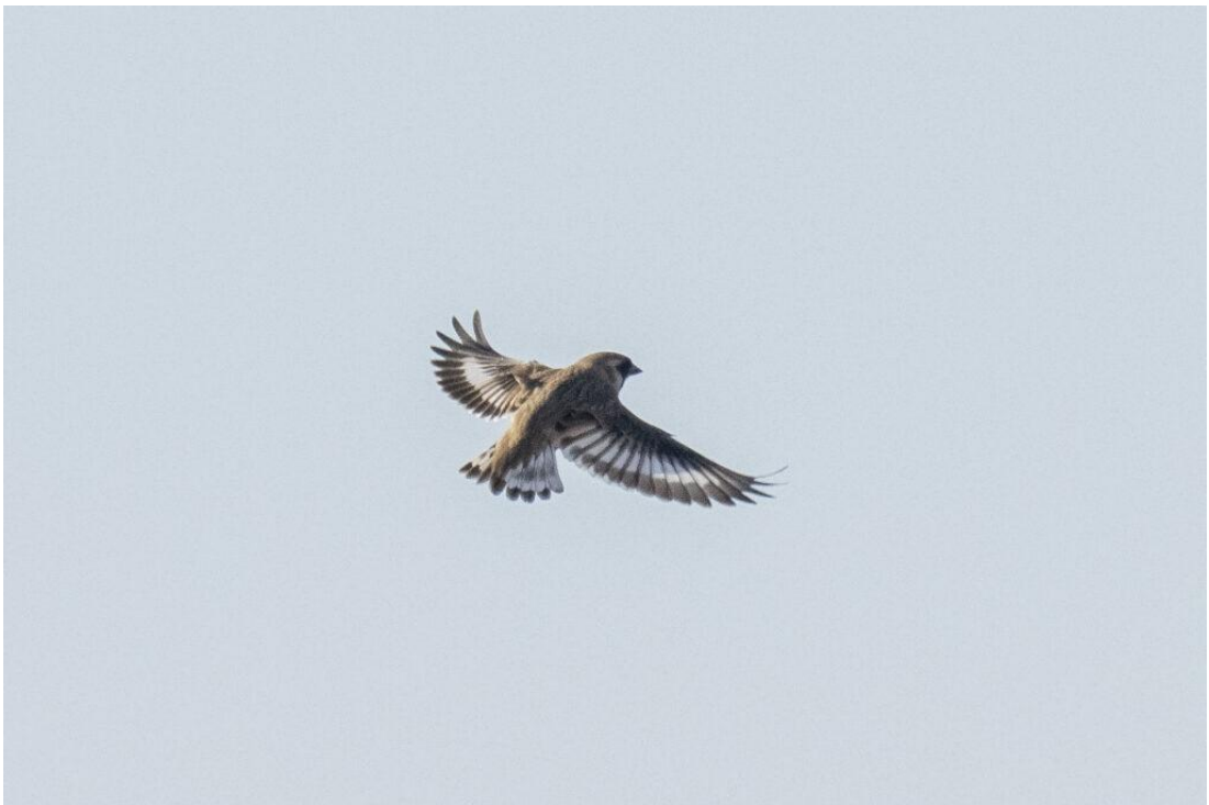
Pere David's Snowfinch