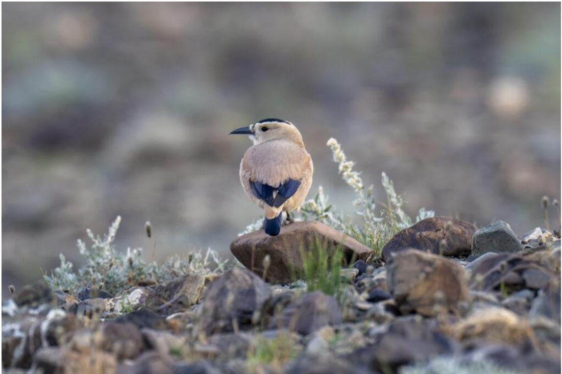
Mongolian or Henderson's Ground Jay