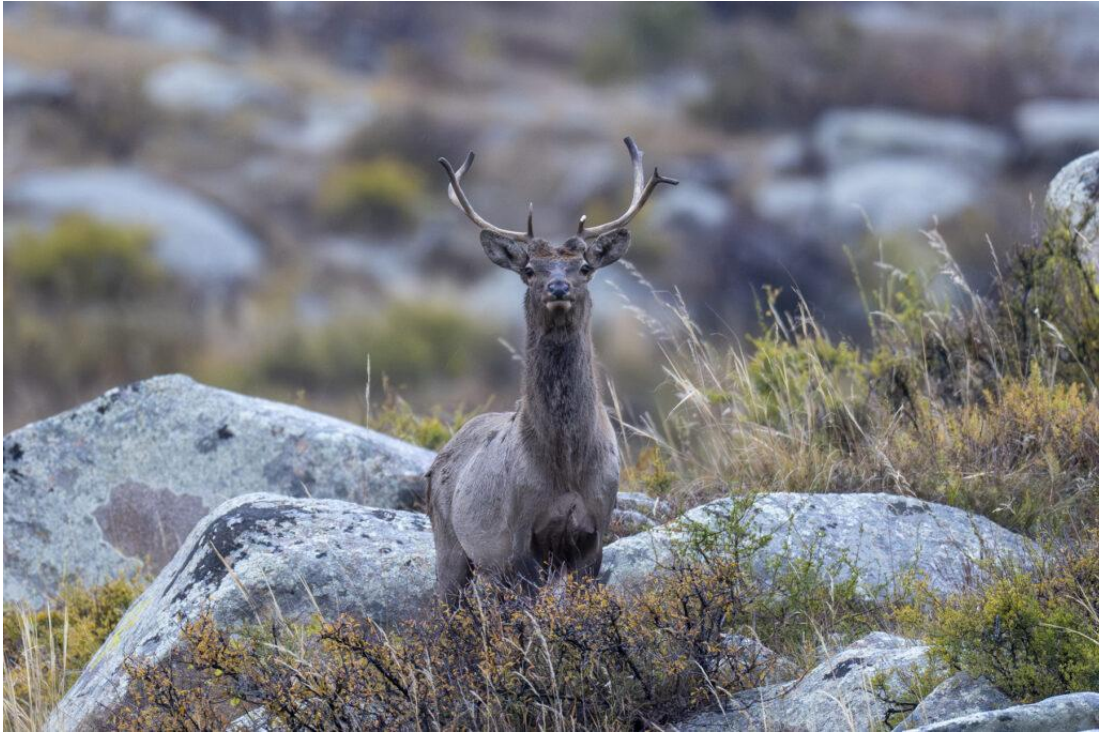
'Siberian' Elk