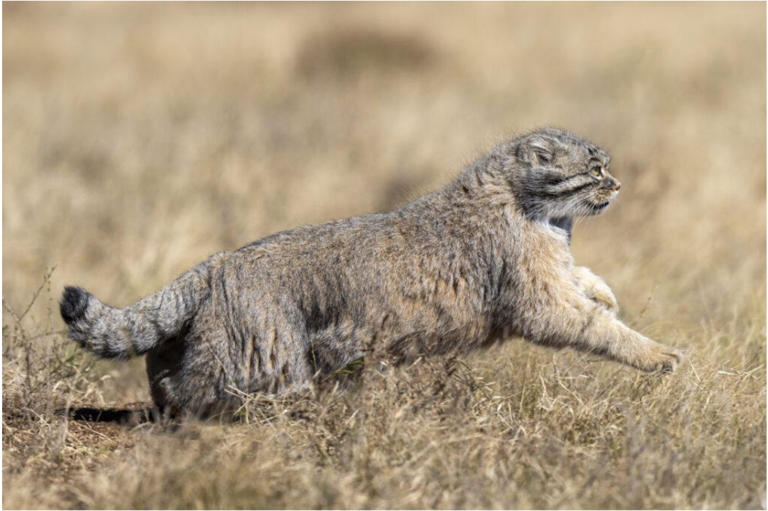
Pallas's Cat