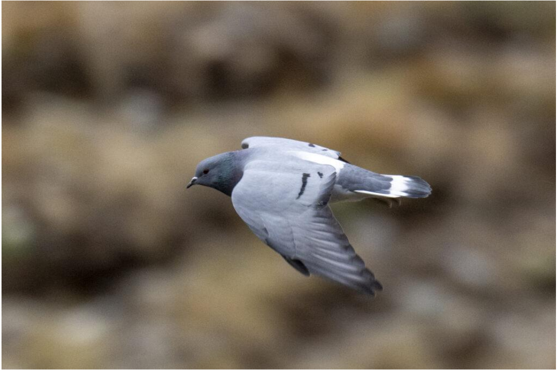
Hill Pigeon