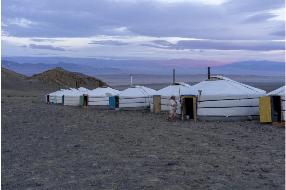
Our Jargalant camp at dawn