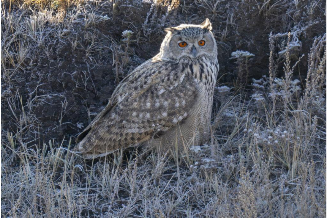
Eurasian Eagle-Owl