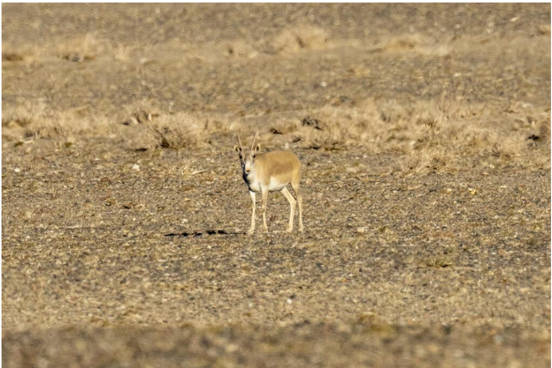
Saiga