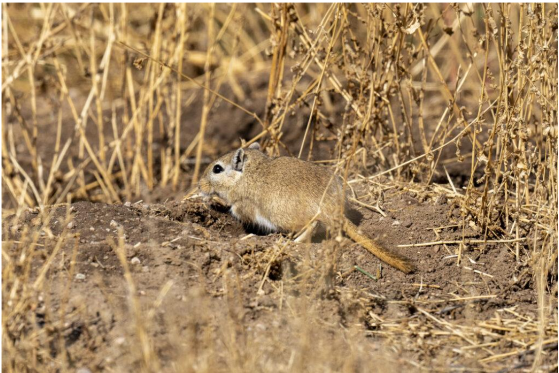
Mongolian Jerbil