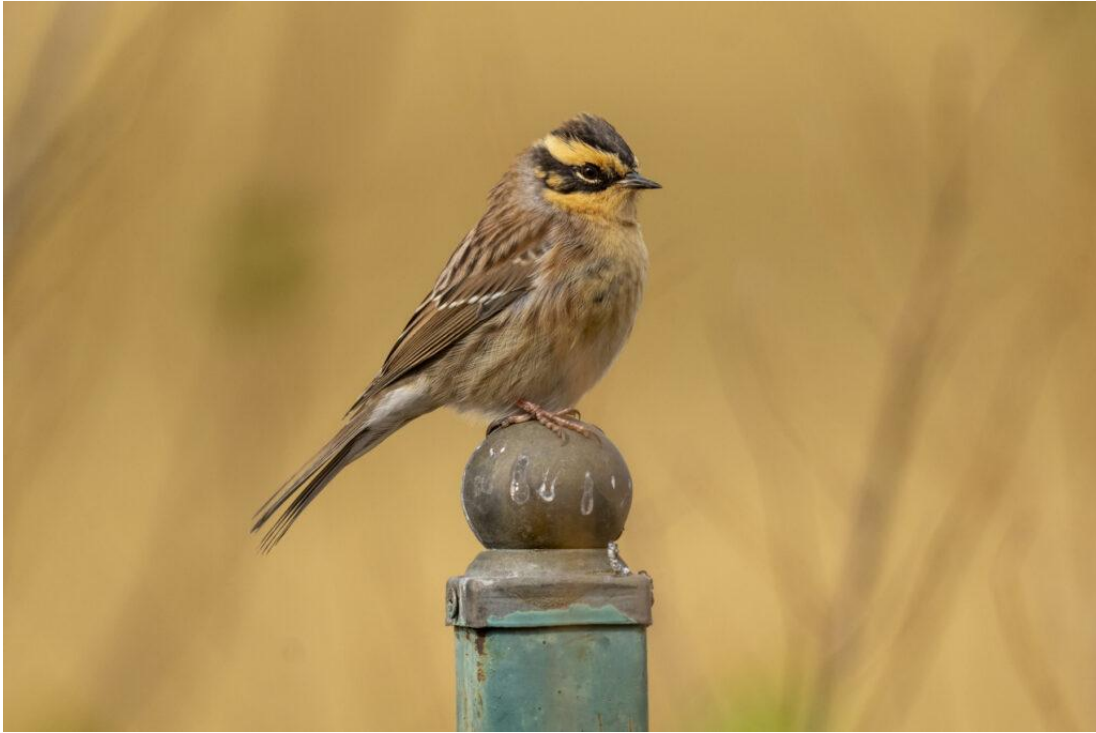
Siberian Accentor