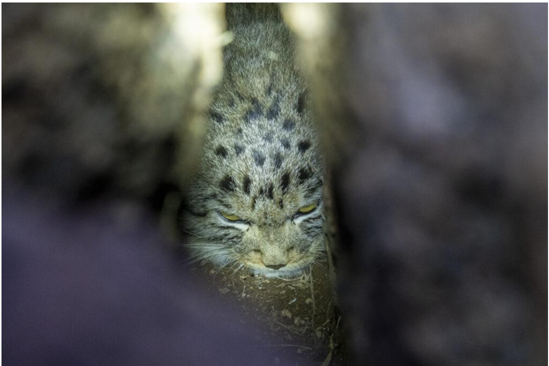
Pallas's Cat in its den