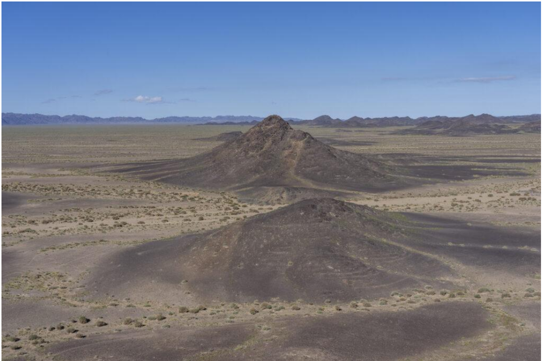
Great Gobi National Park