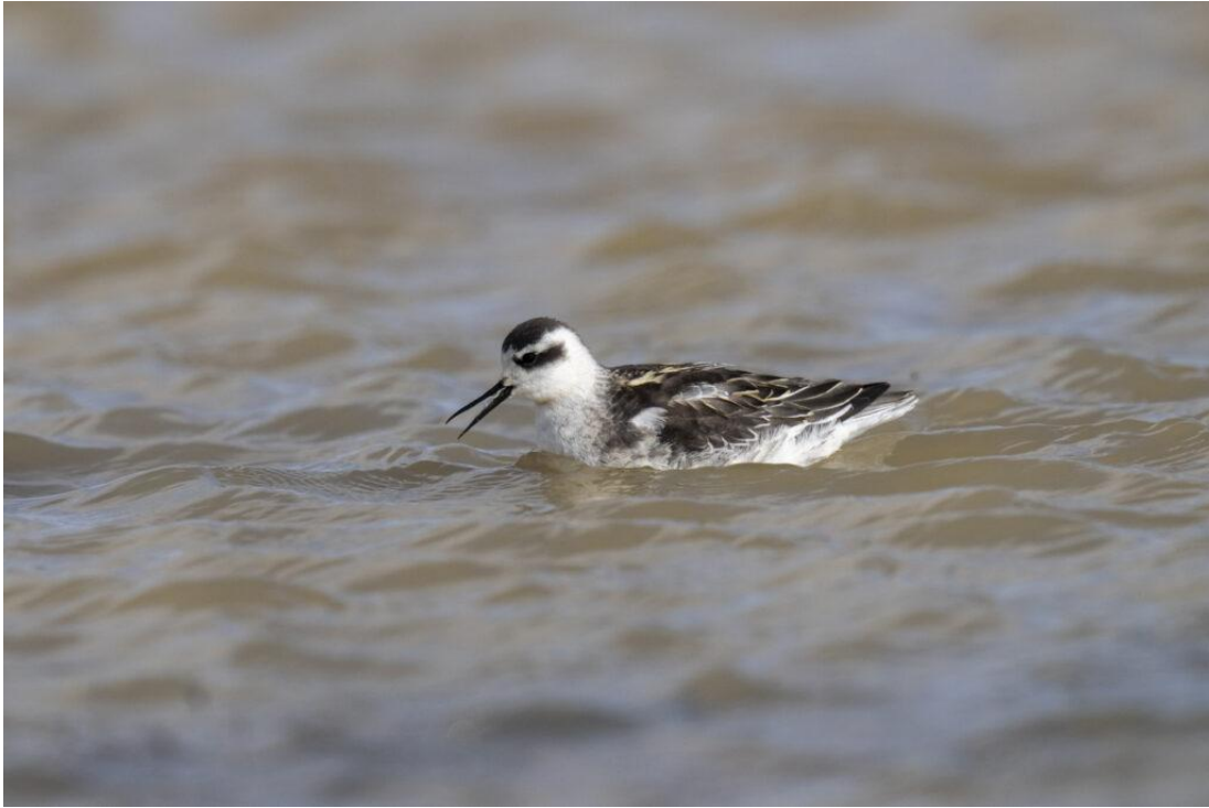
Red-necked Phalarope