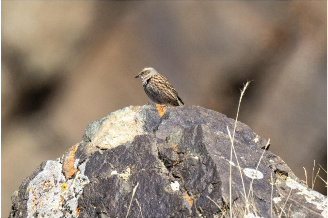
Altai Accentor