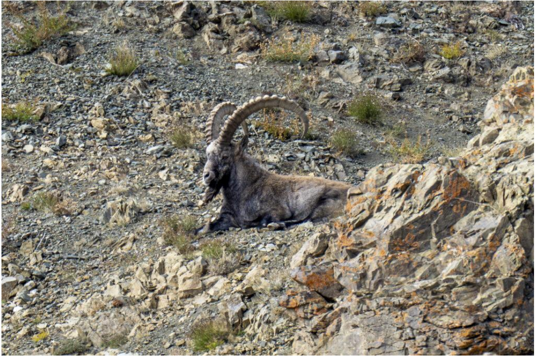
Siberian Ibex