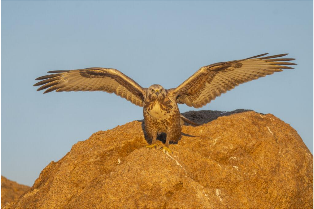
Upland Buzzard