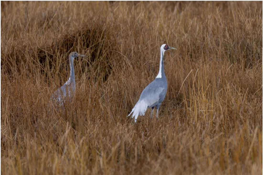
White-naped Cranes