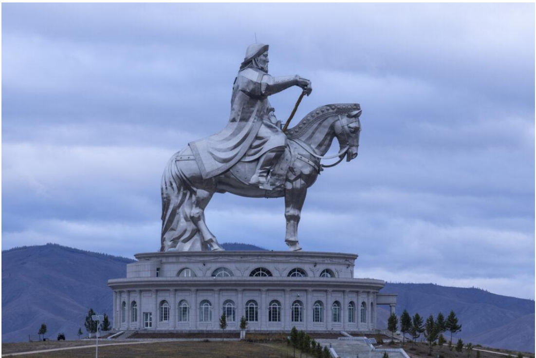
The Genghis Khan (Chinggis Khaan) statue east of Ulaanbaatar