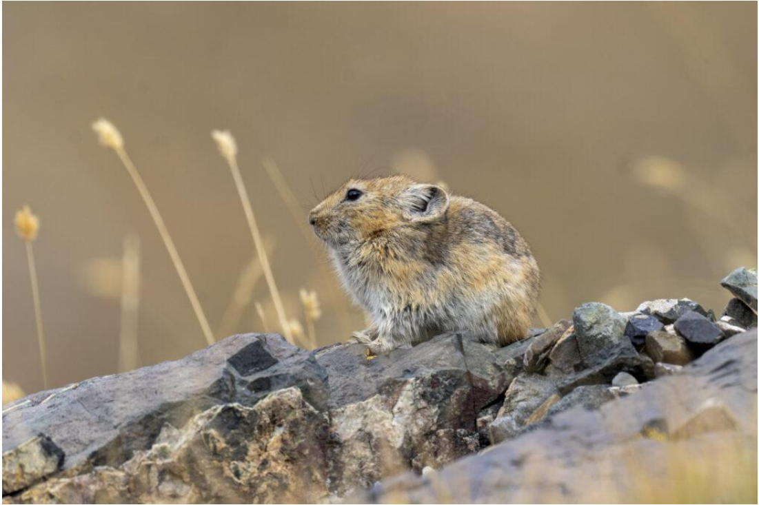
Pallas's Pika