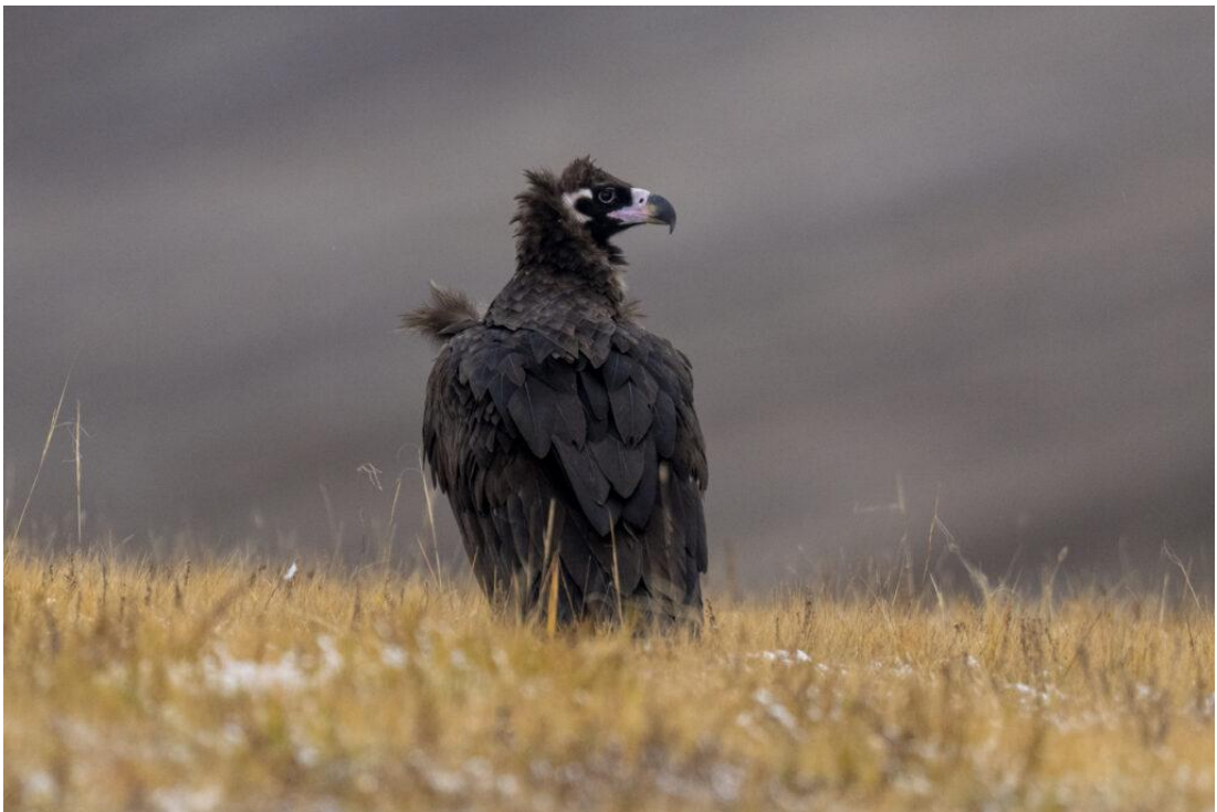
Cinereous Vulture