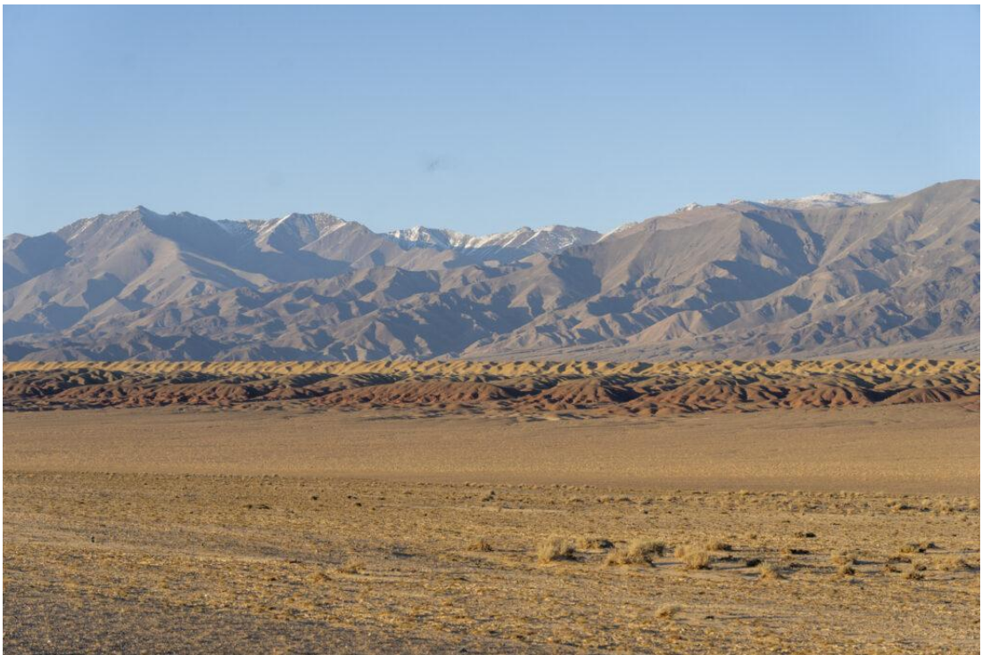
Steppe and badlands near the Jargalant range