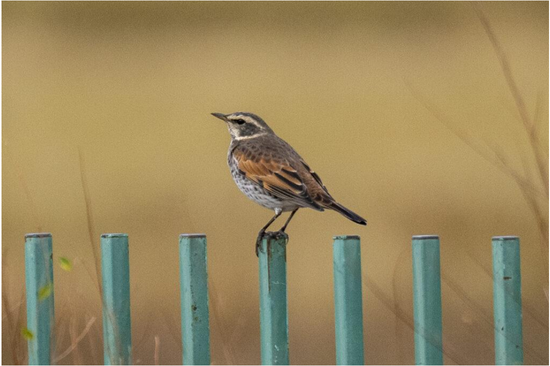
Dusky Thrush