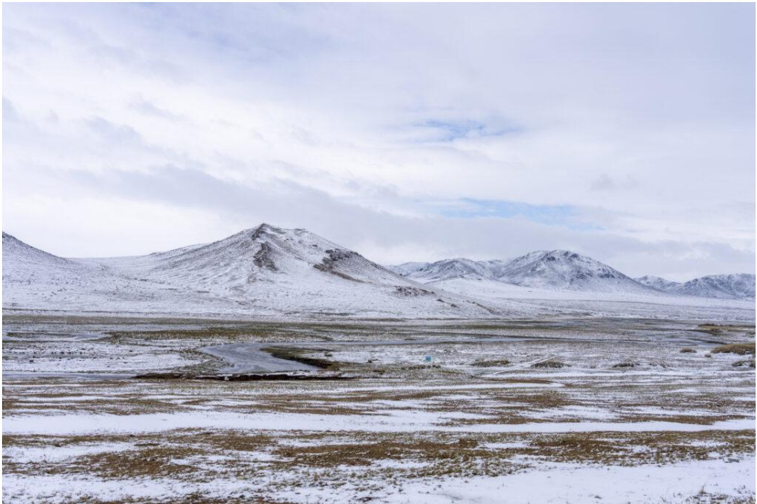
Early snow in Eastern Mongolia