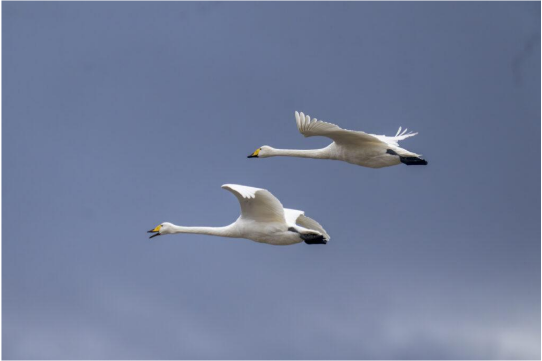
Whooper Swans