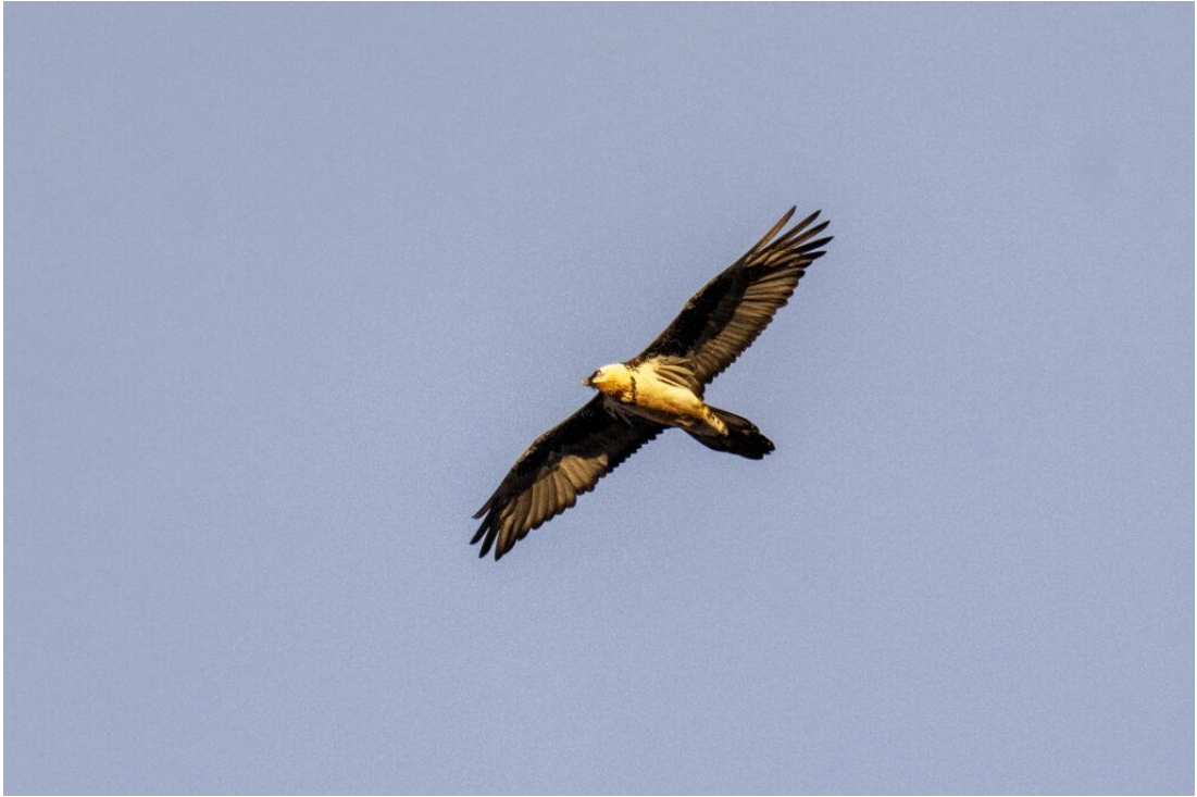
Bearded Vulture