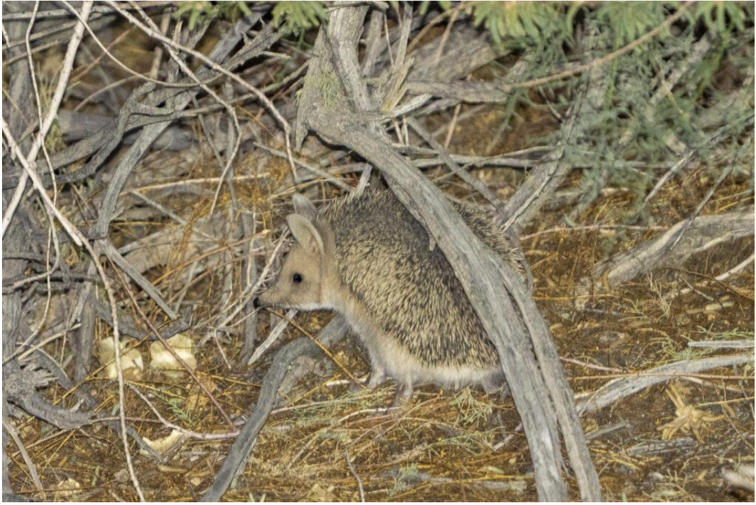
Long-eared Hedgehog