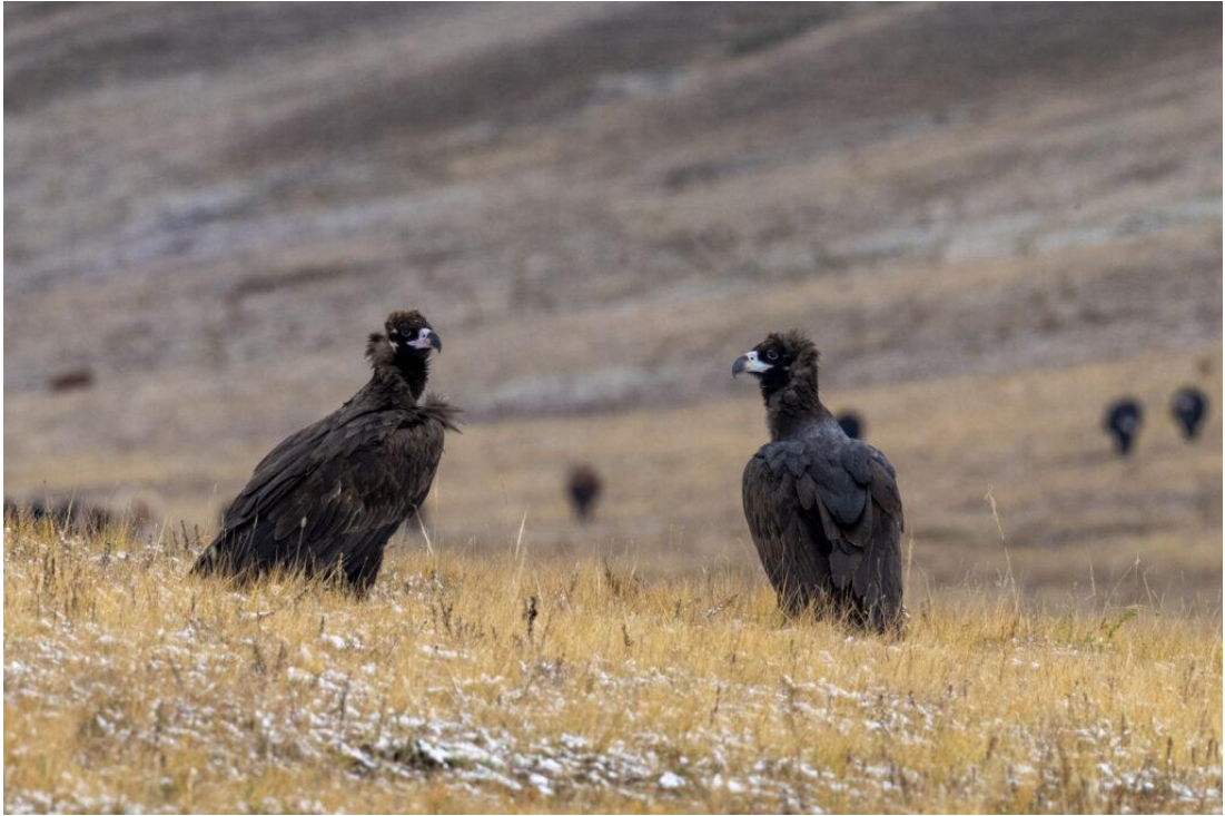
Cinereous Vultures