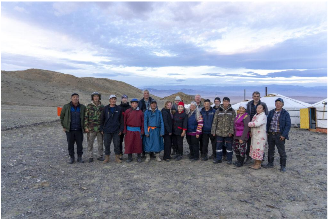
Our 2024 group and our fantastic Jargalant team