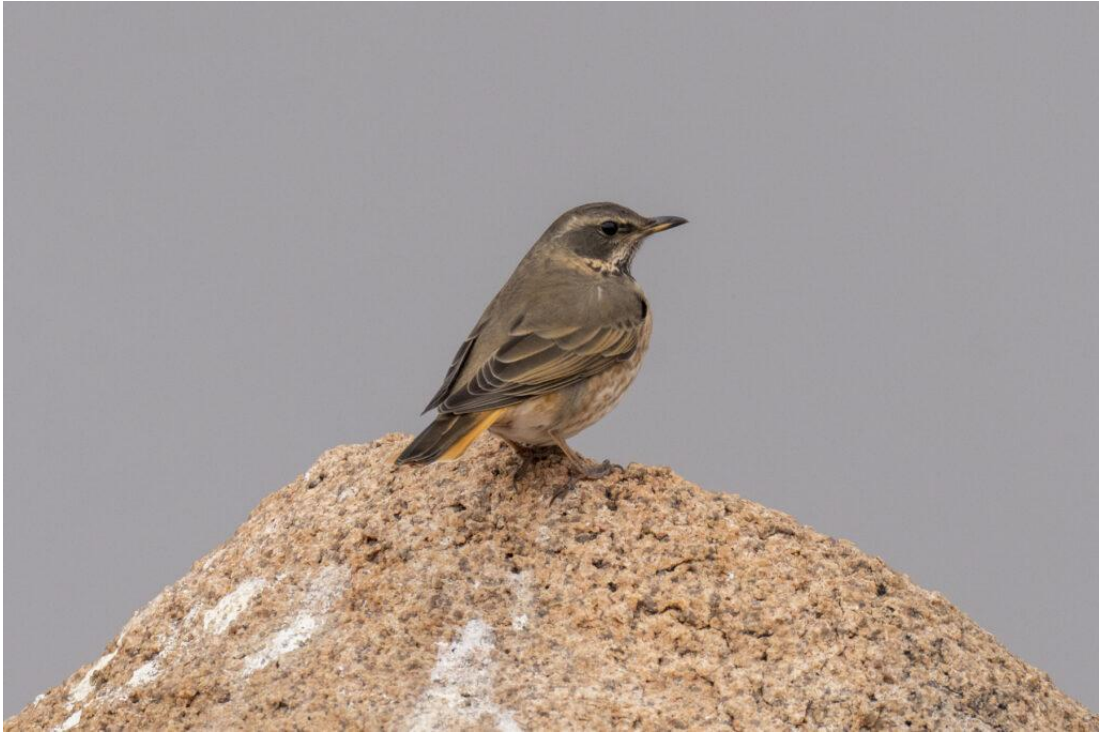
Naumann's Thrush