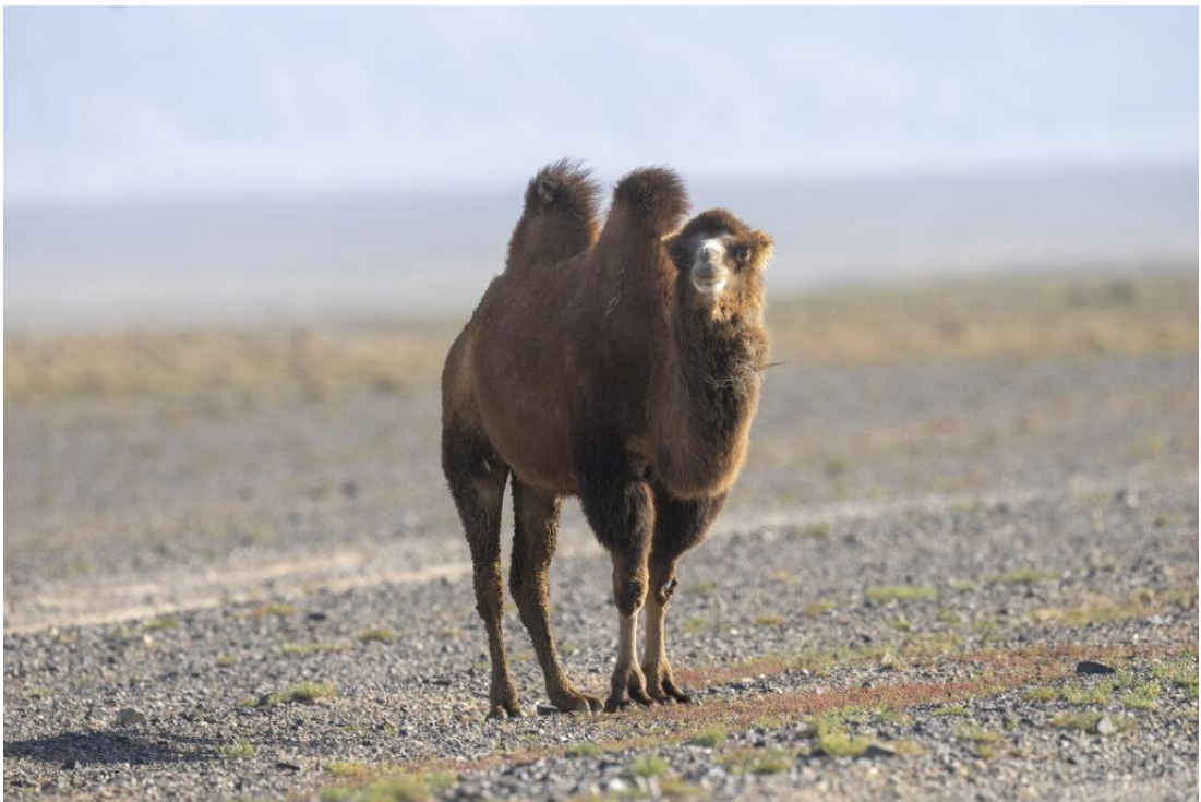
Bactrian Camel