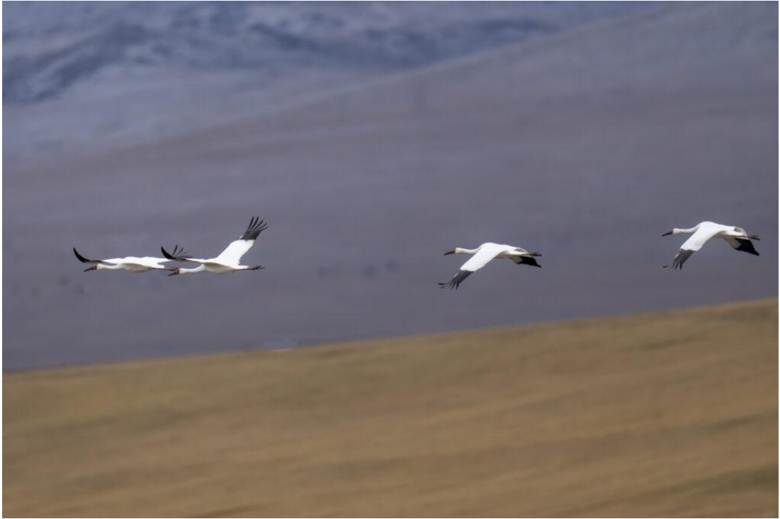
Siberian Cranes