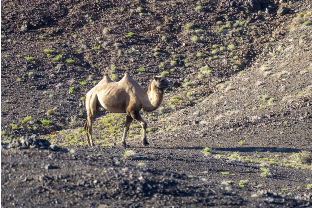
Wild Camel in Great Gobi

Wild Camel Camelus ferus A total of 20 in Great Gobi.