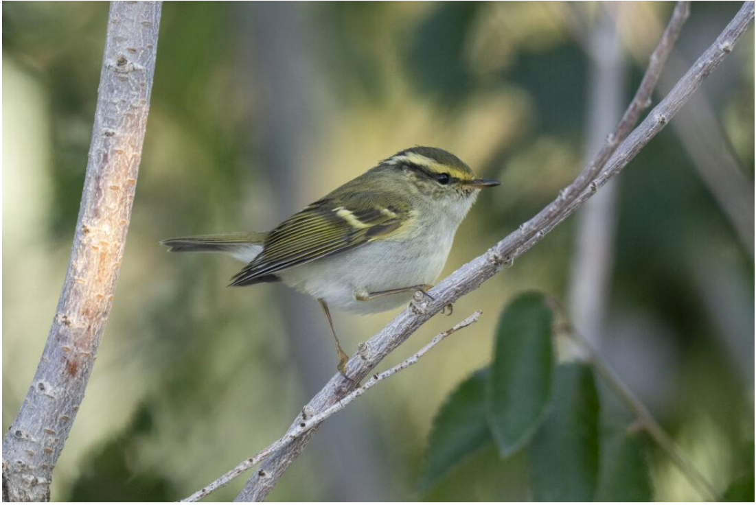
Pallas's Leaf Warbler