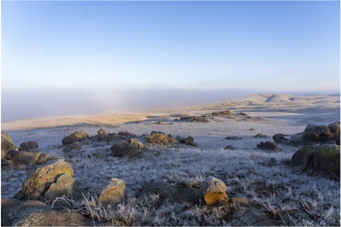
The Khalzan steppe on a frosty morning