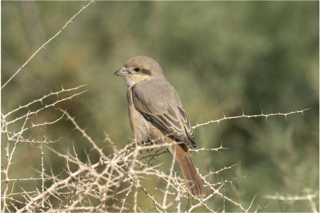
Isabelline Shrike