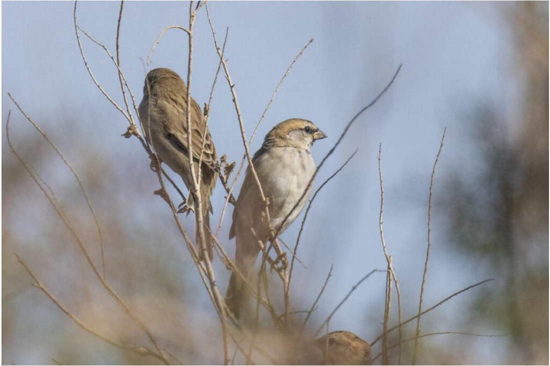
Saxaul Sparrows