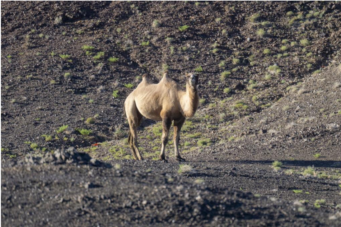
Wild Camel in Great Gobi