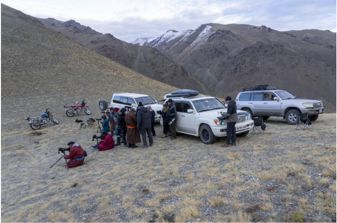
Watching for Snow Leopards in the Jargalant range