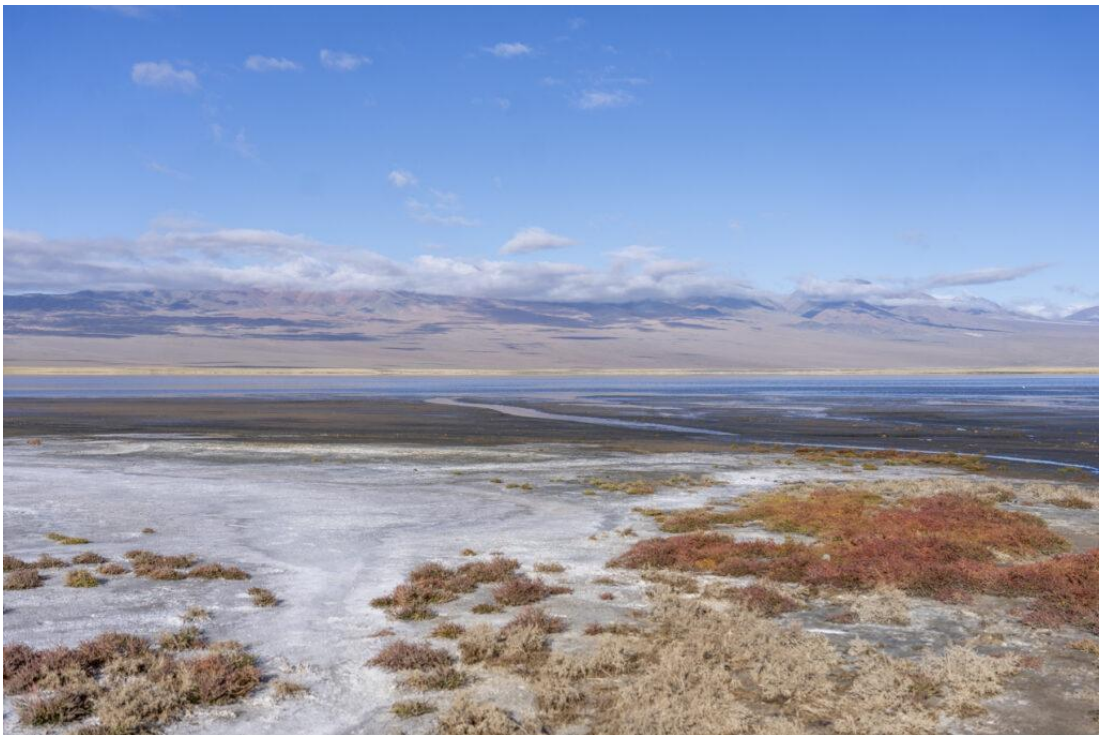
Ikh Nuur