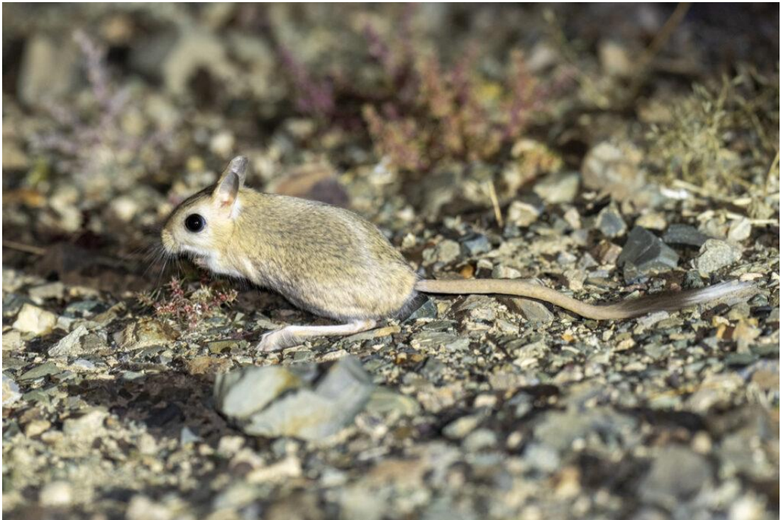
Hairy-footed or Northern Three-toed Jerboa