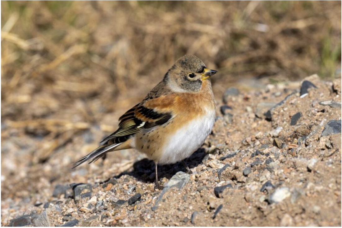
Brambling