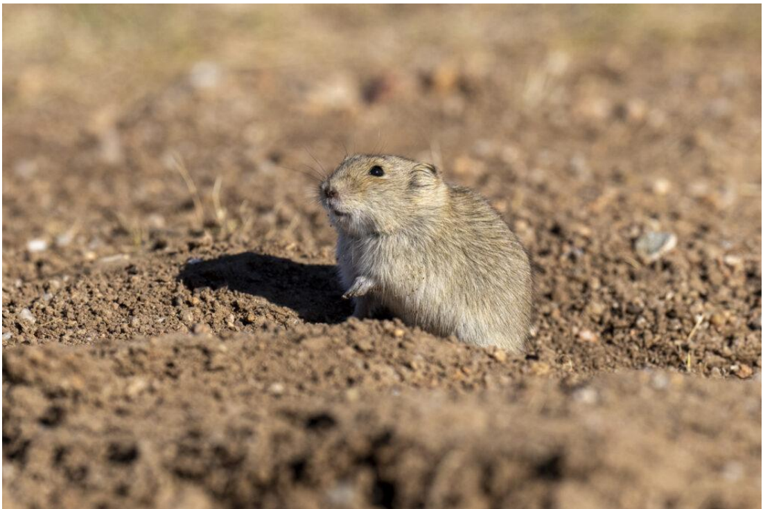
Brandt's Vole