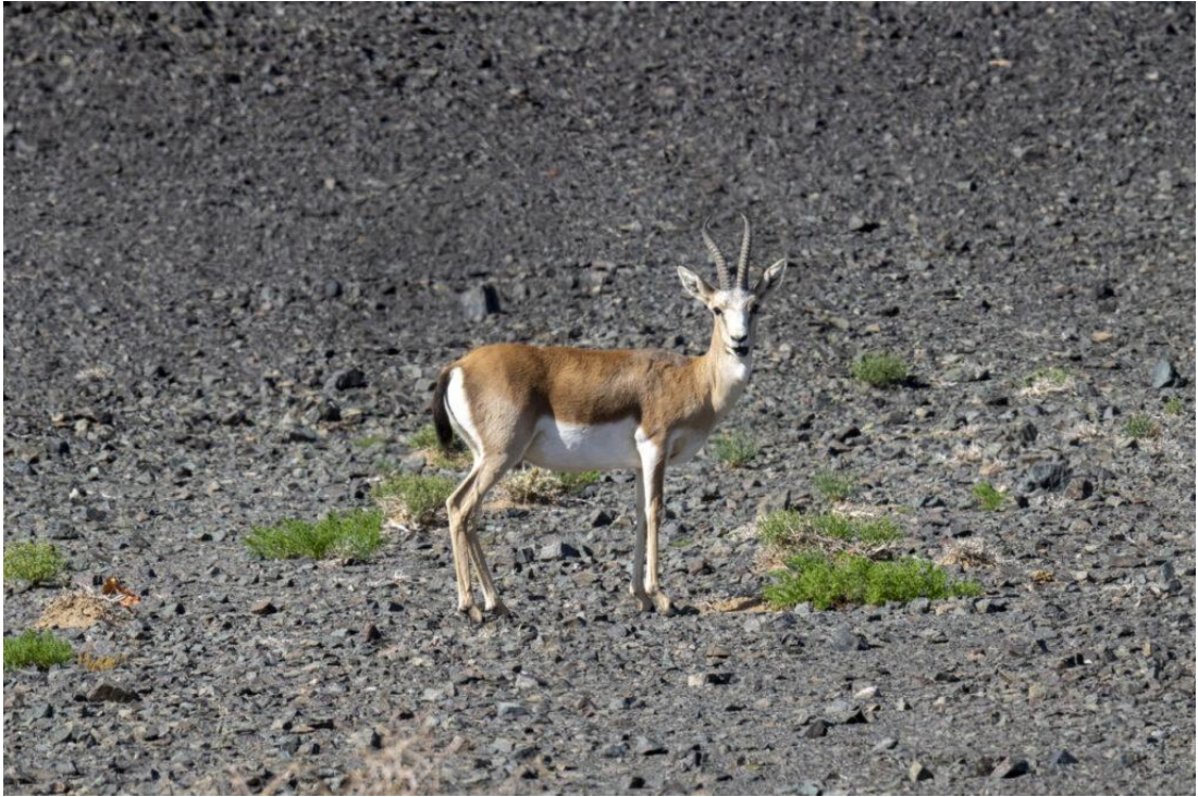
Goitred Gazelle