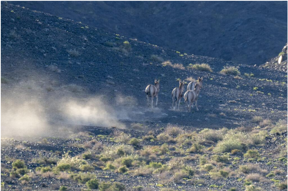
Kulans or Asiatic Wild Asses