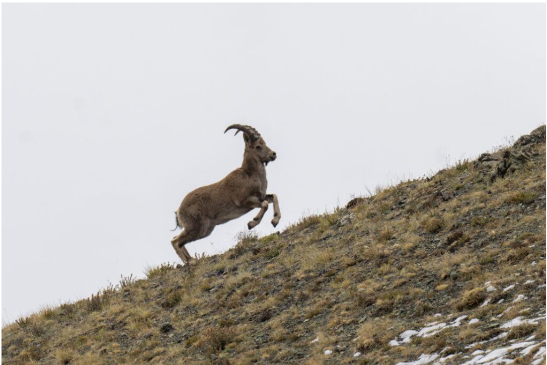
Siberian Ibex