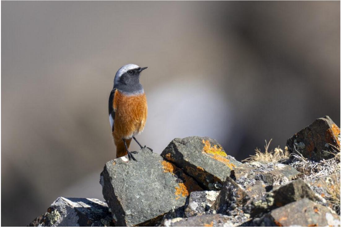
Guldenstadt's or White-winged Redstart