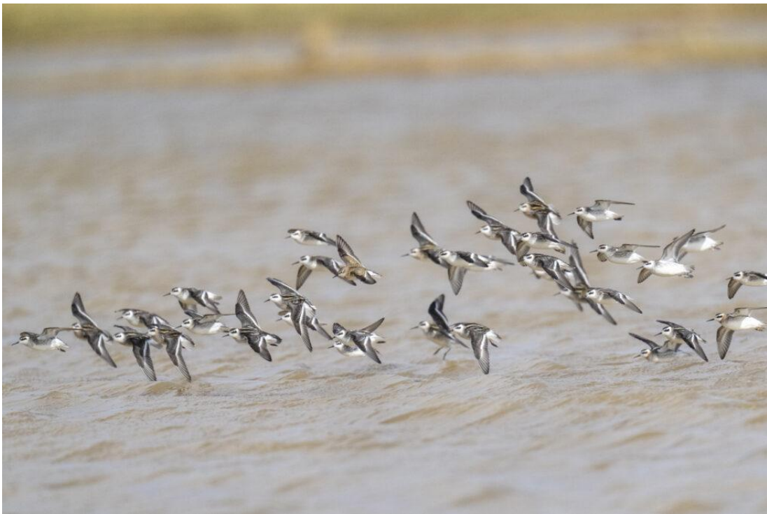
Red-necked Phalaropes and a Little Stint