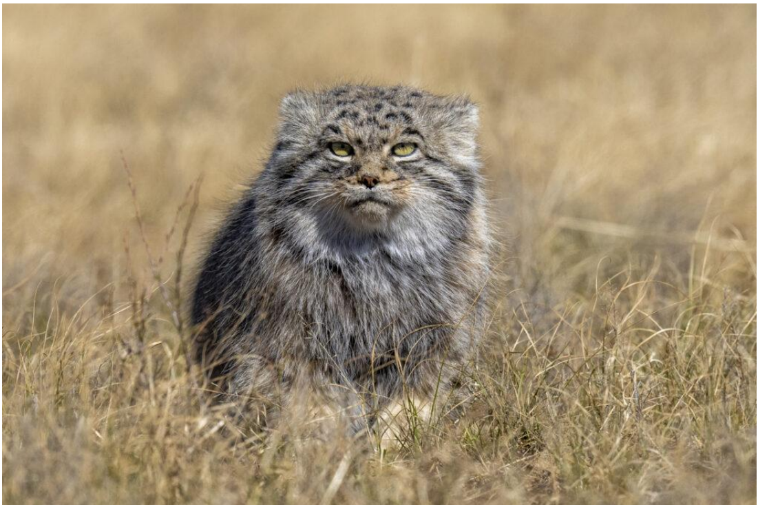
Pallas's Cat