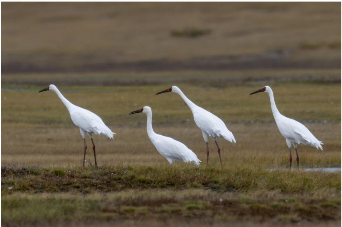
Siberian Cranes