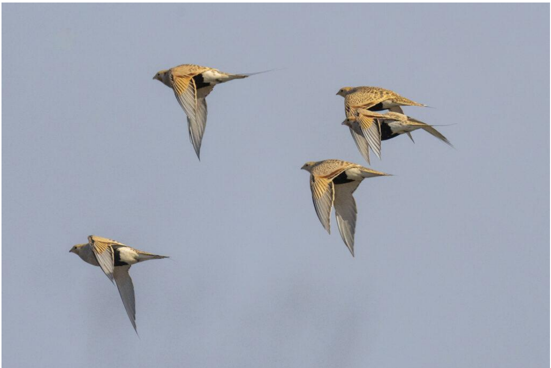
Pallas's Sandgrouse