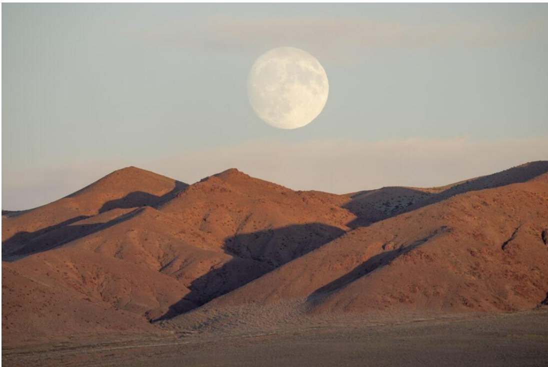
Sharga reserve at dusk