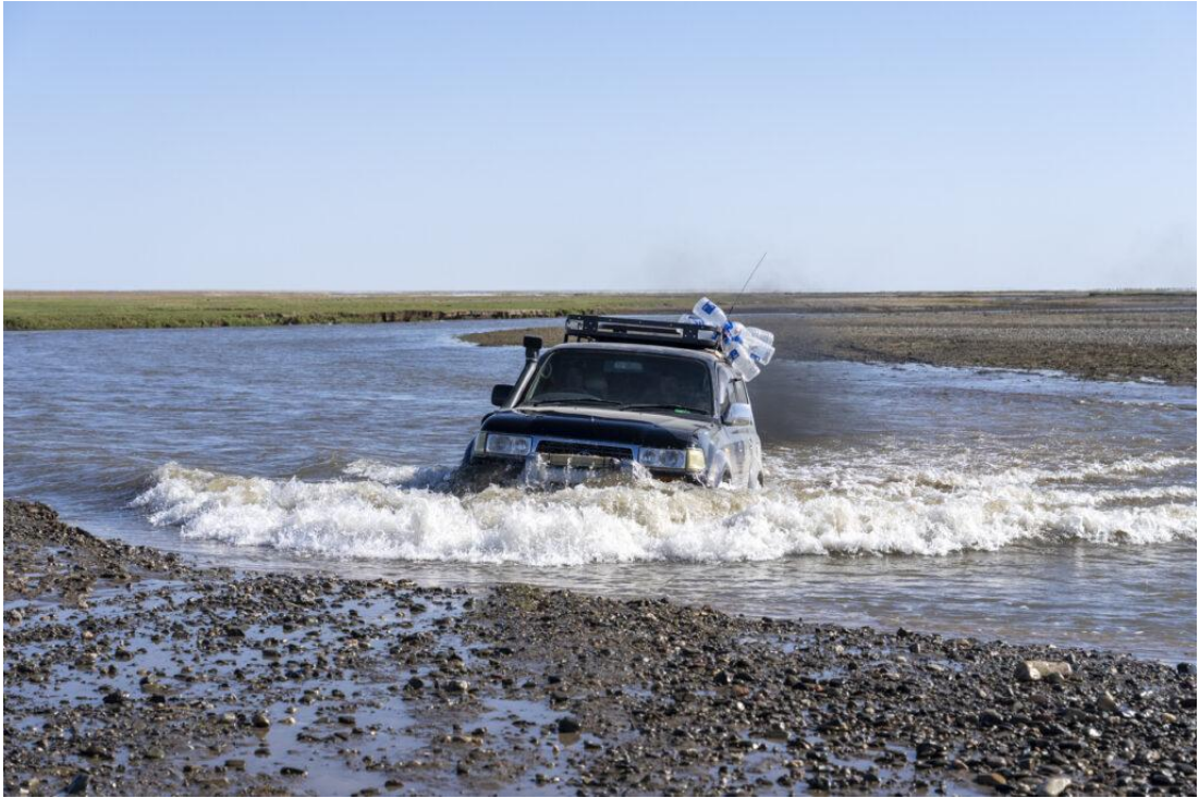
Travel in Mongolia can be an adventure!