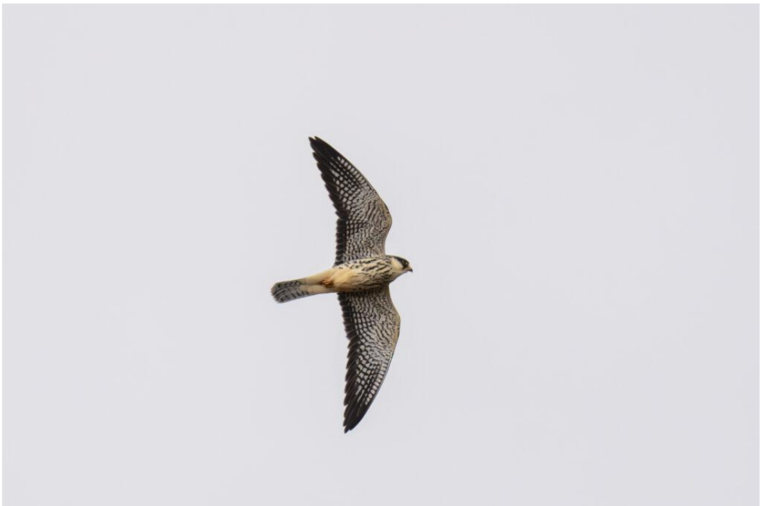
Amur Falcon