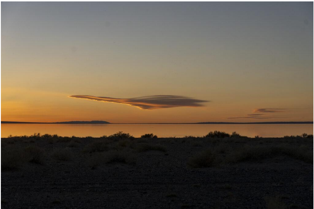
Boon Tsagaan Nuur at sunset