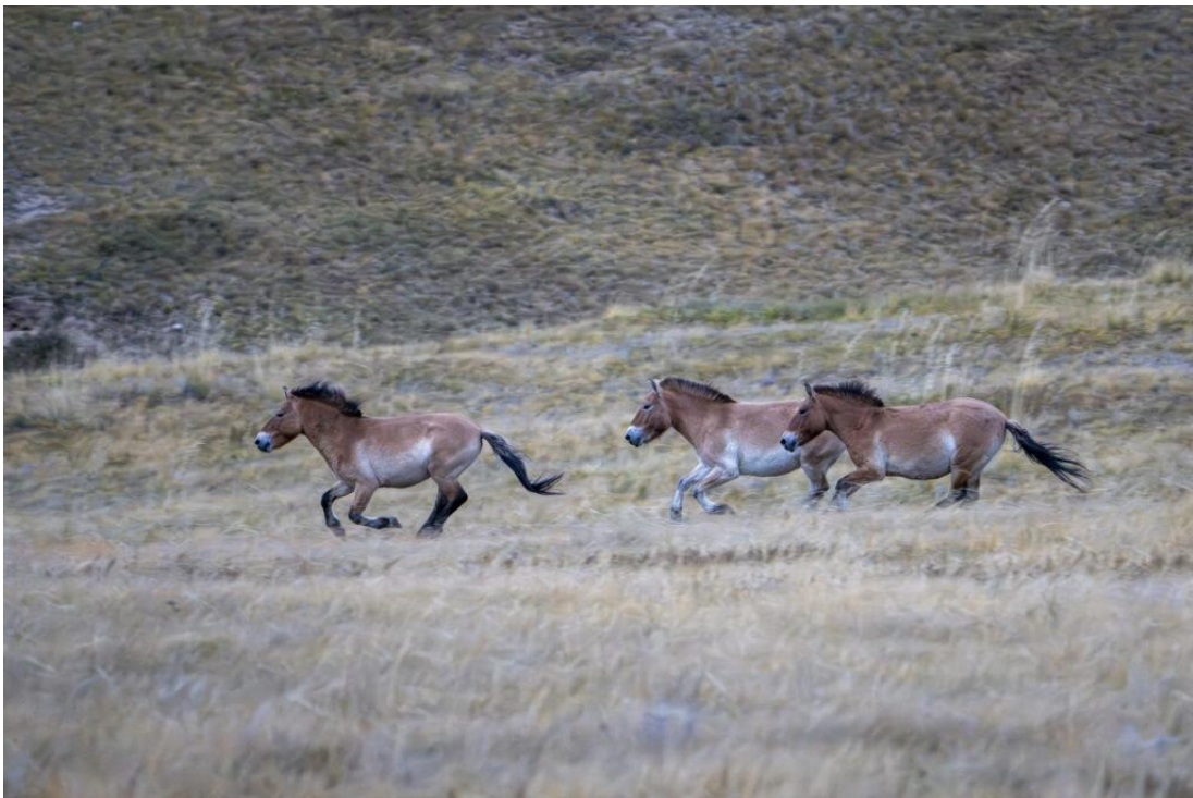
Przewalski's Horses