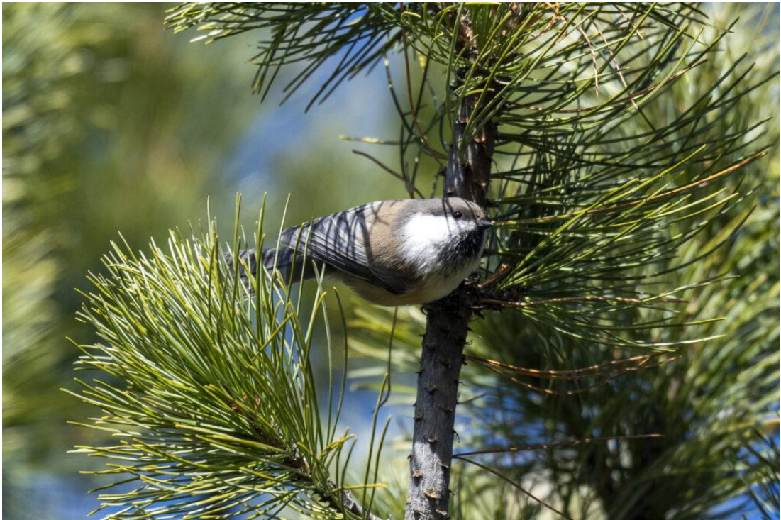
Siberian Tit or Grey-headed Chickadee