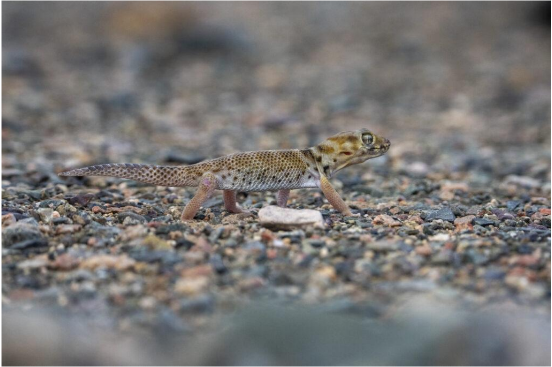
Plate-tailed Gecko