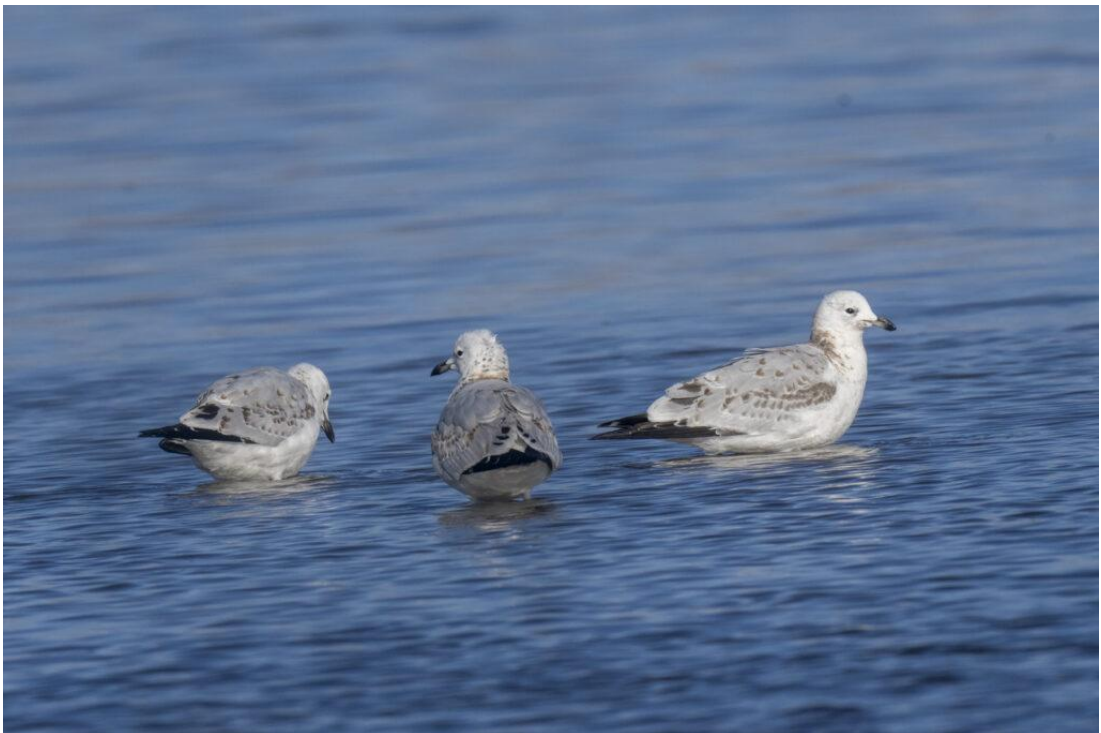
Relict Gulls