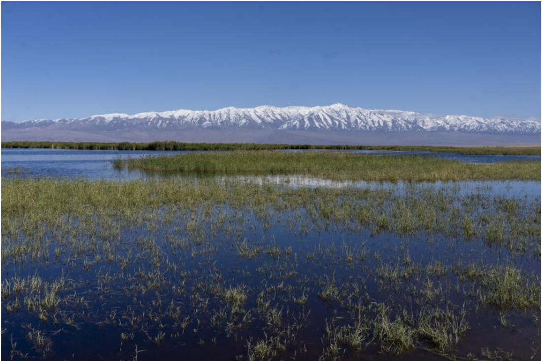
The Jargalant range from Khar Us Nuur