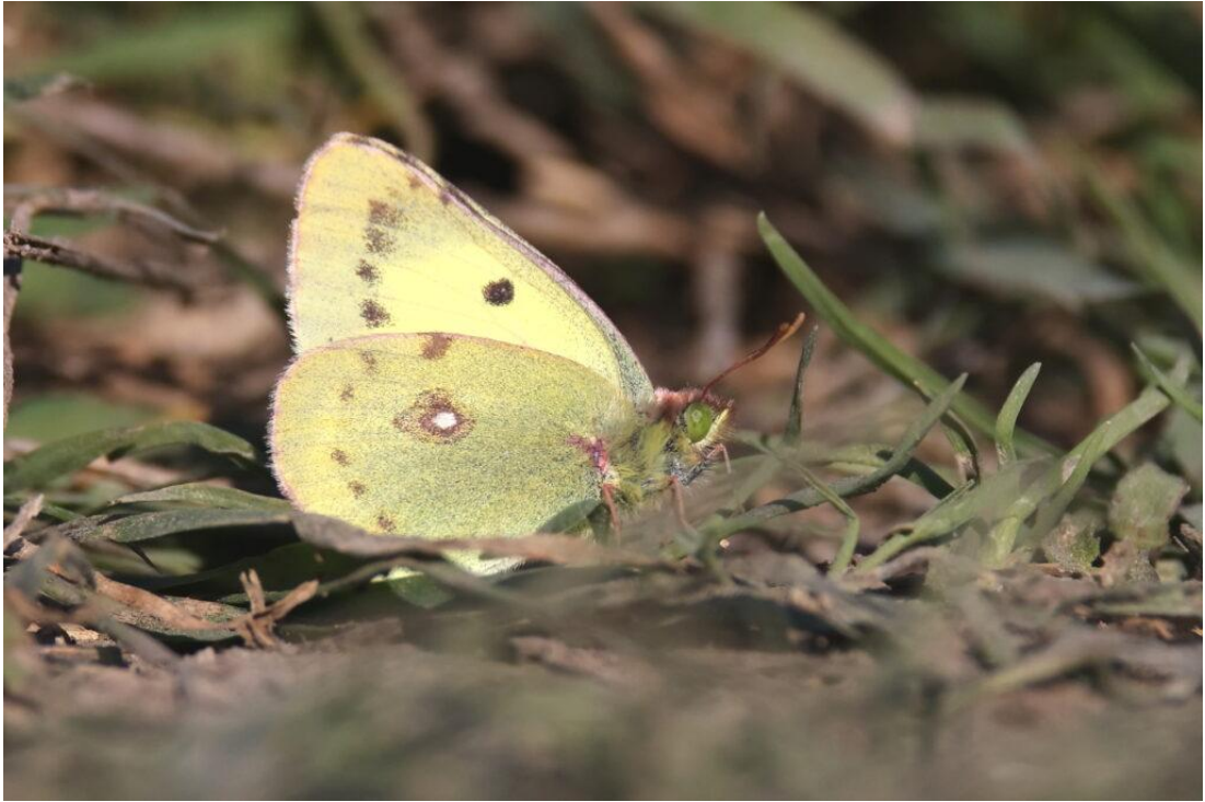
Eastern Pale Clouded Yellow