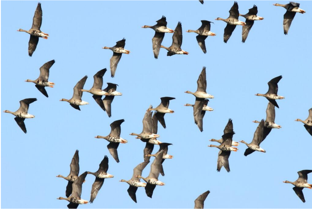
Greater White-fronted Geese