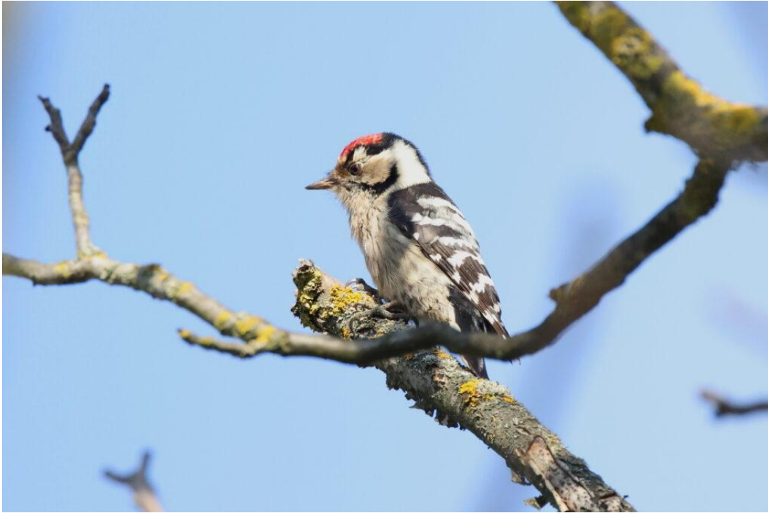
male Lesser Spotted Woodpecker