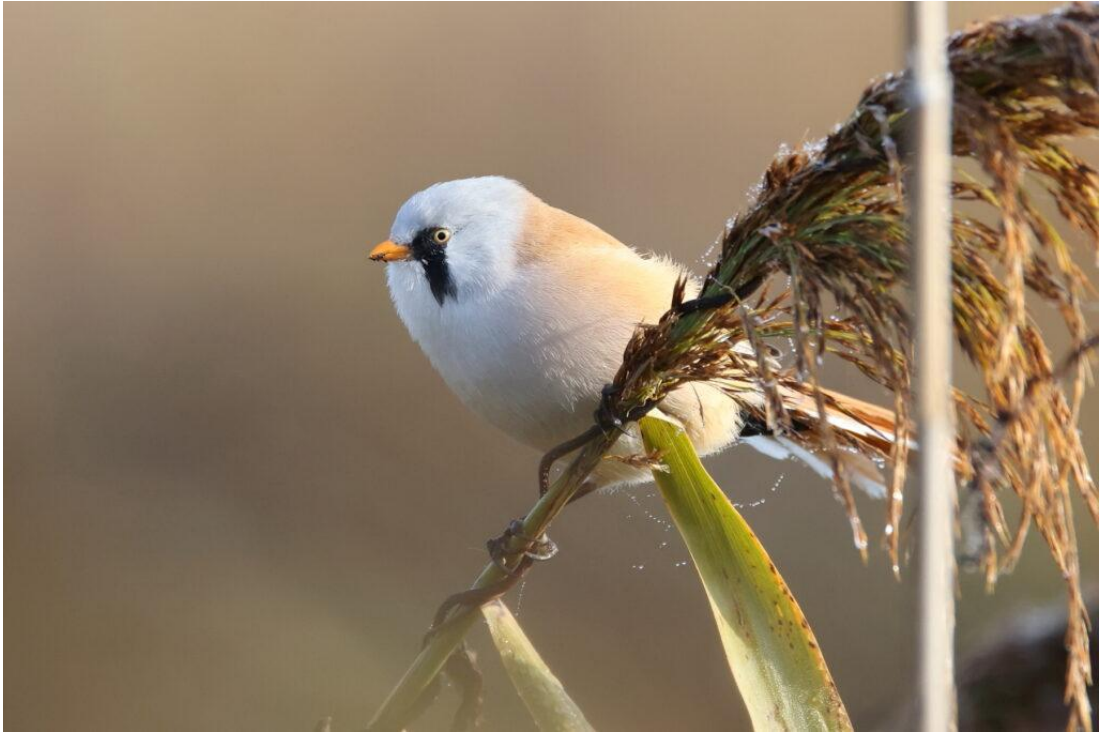
Bearded Tit