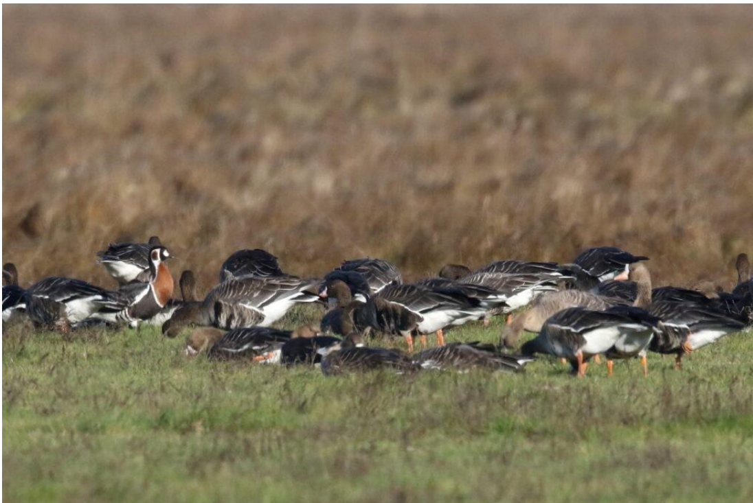
Red-breasted Goose amongst the other species