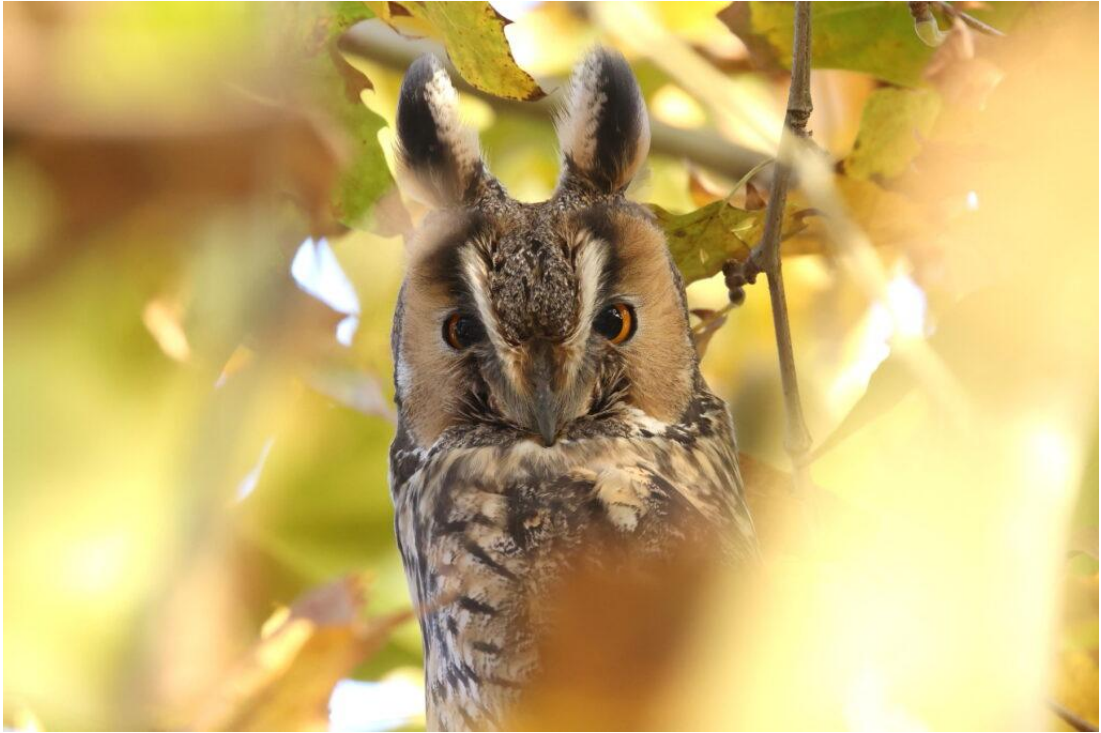
Long-eared Owl