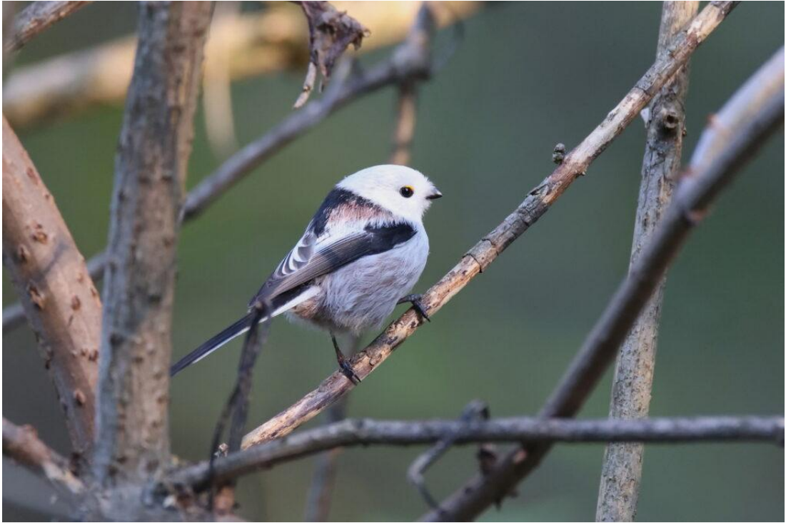
"White-headed" Long-tailed Tit