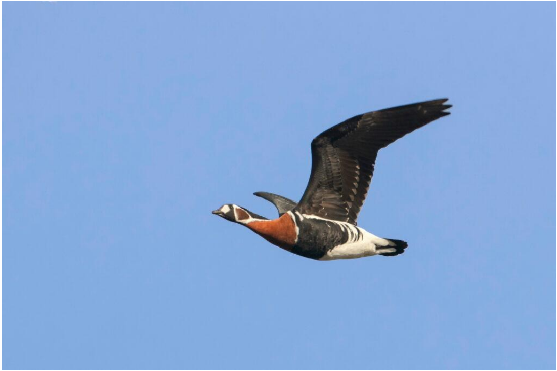
Red-breasted Goose