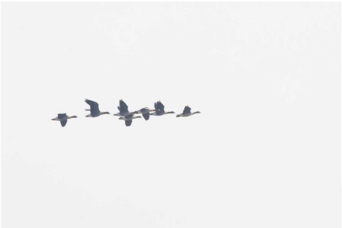
Lesser White-fronted Geese