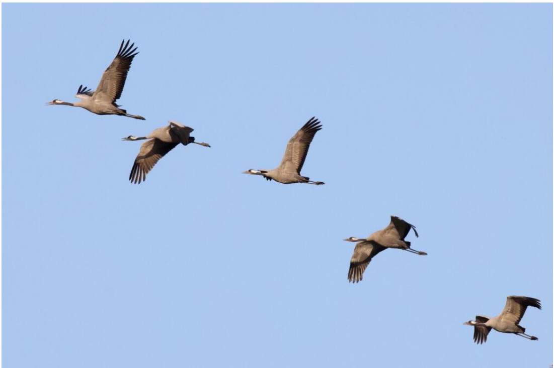
Common Cranes