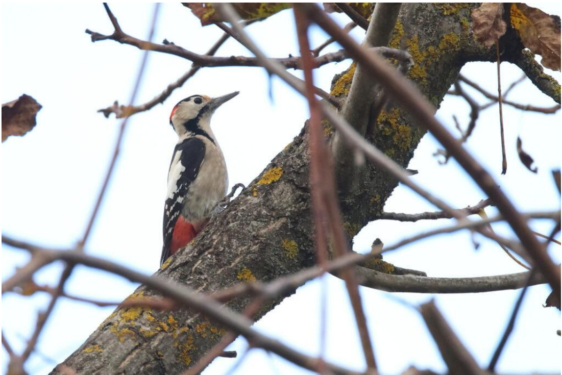
male Syrian Woodpecker