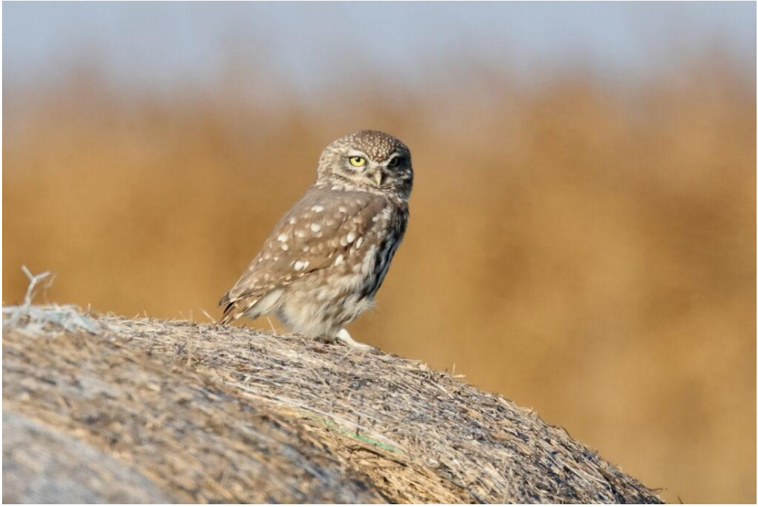
Little Owl