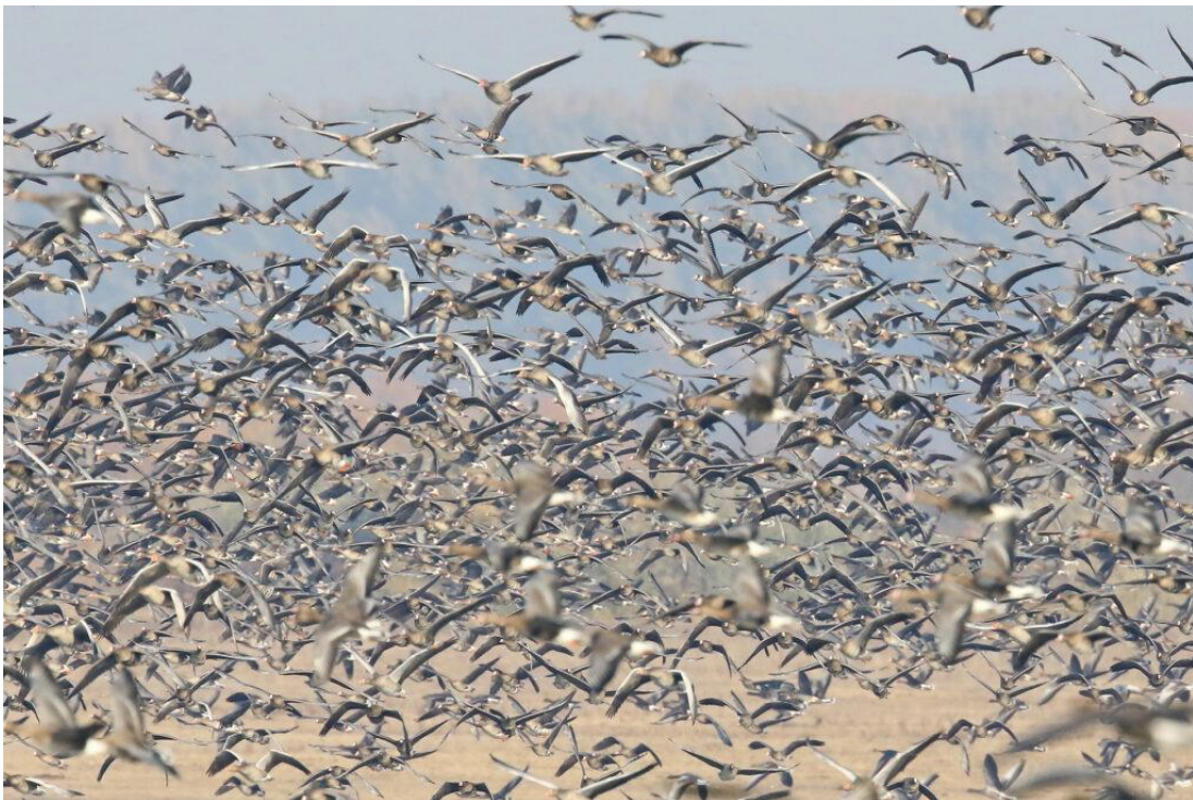
A typical flock of geese, with Greylag and Greater White-fronted Geese. See if you can spot the Red-breasted!