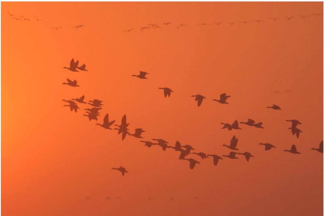
A typical sunset for this tour