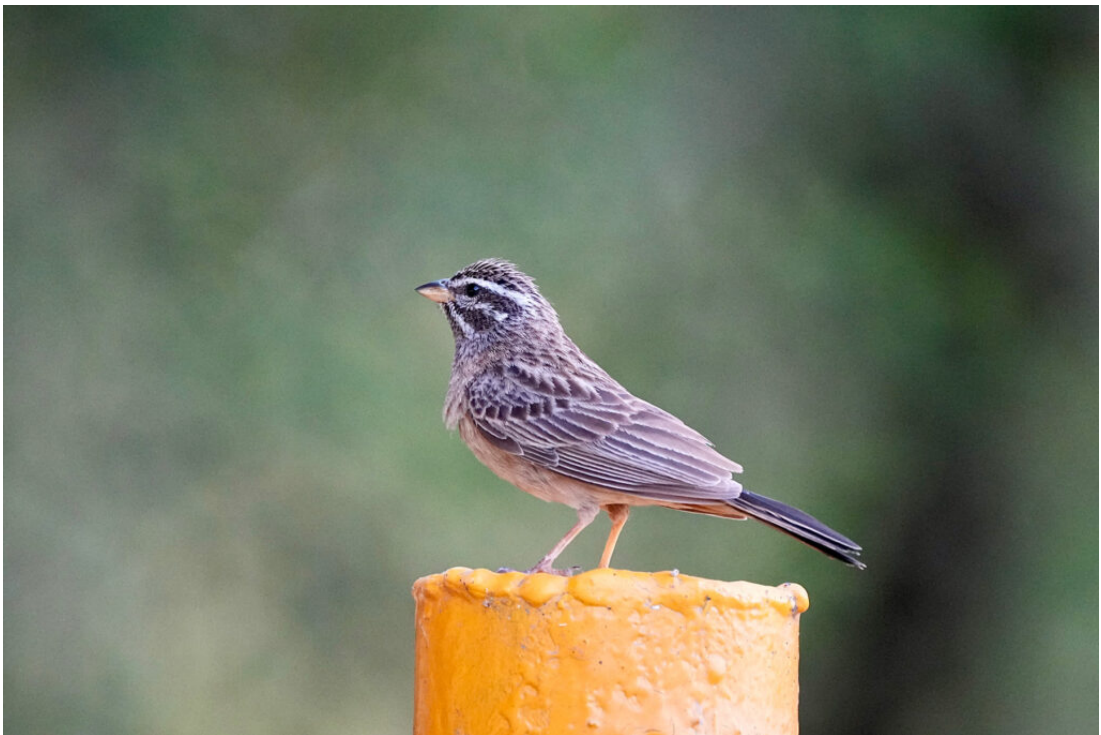
Cinnamon-breasted Bunting