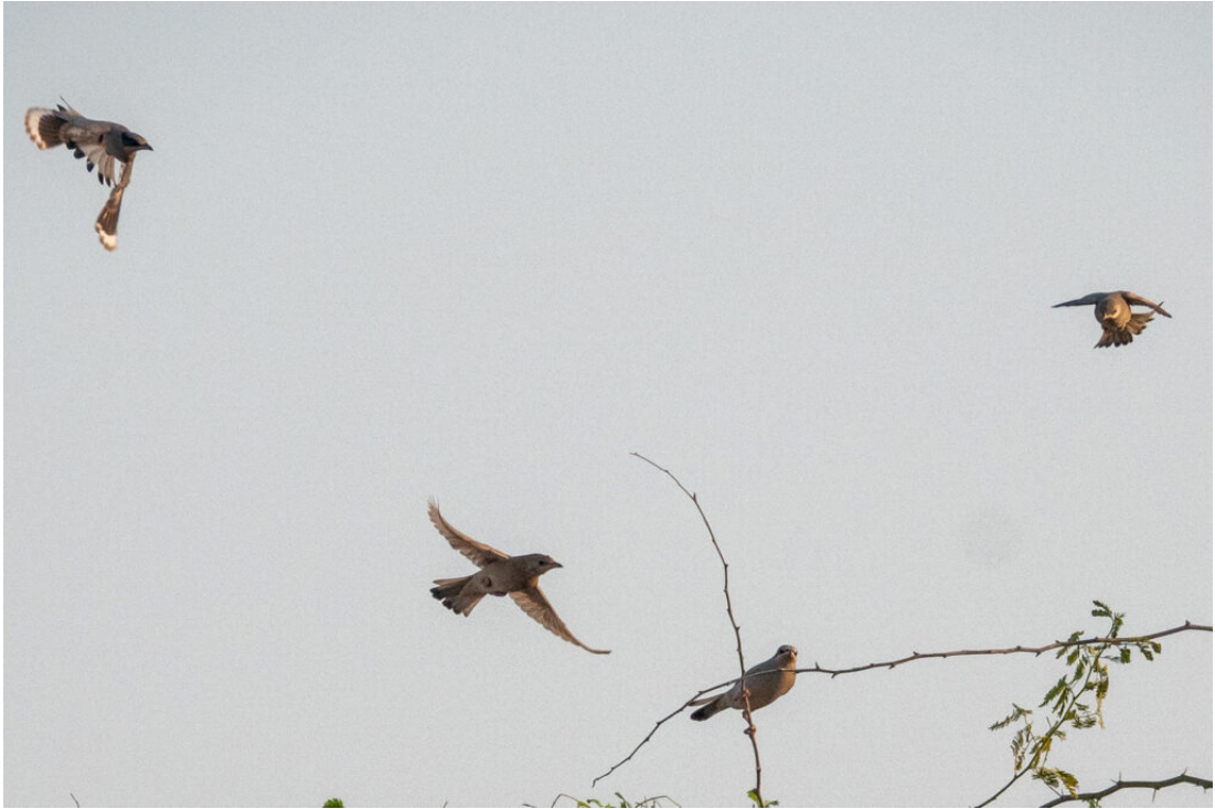
Hypocoliuses pre-roosting