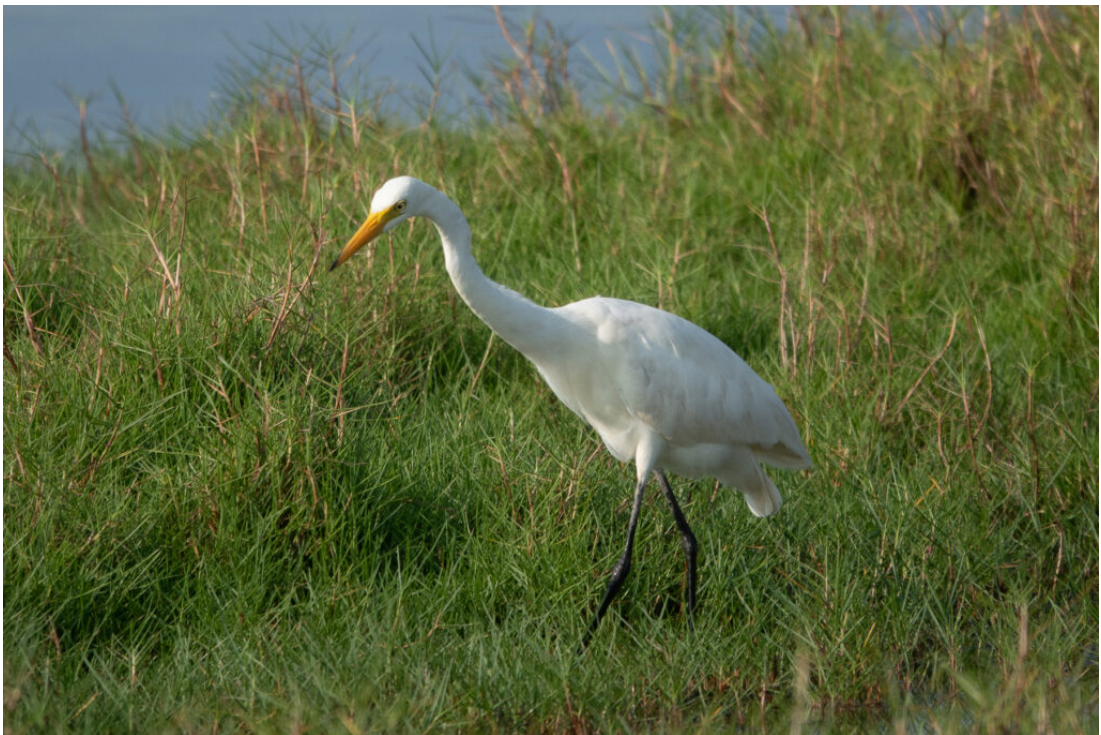
Medium Egret