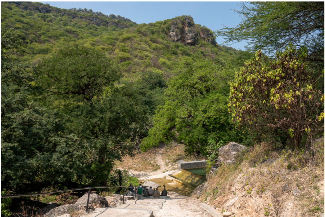
Dhofar Mountains