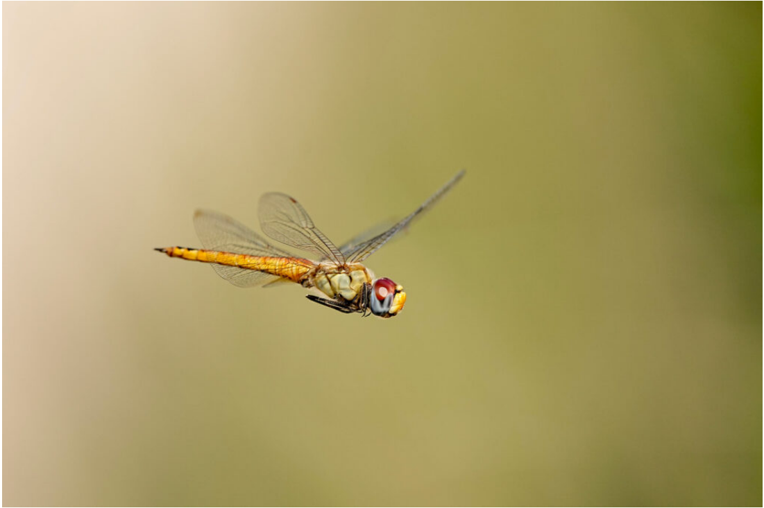
Globe Wanderer