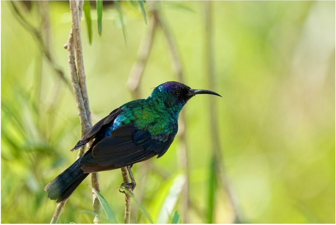
Palestine Sunbird