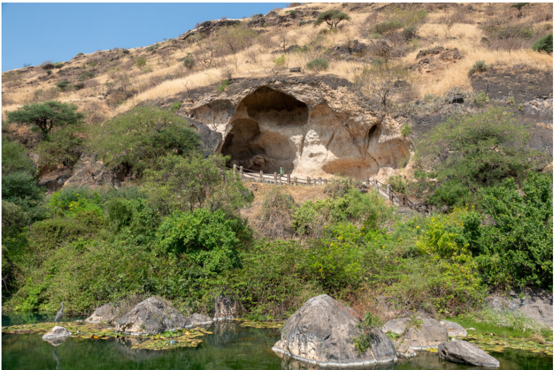
Cave at Ayn Razat