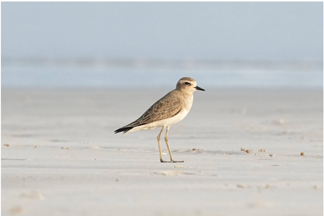
Caspian Plover