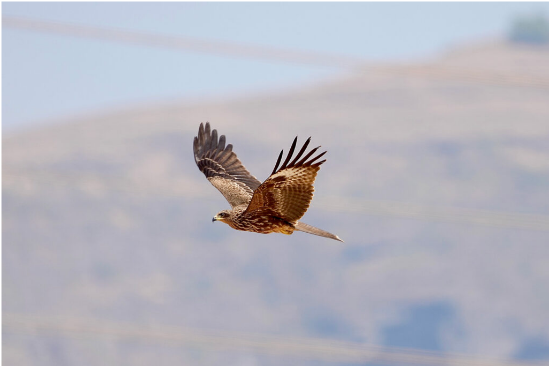
Black Kite