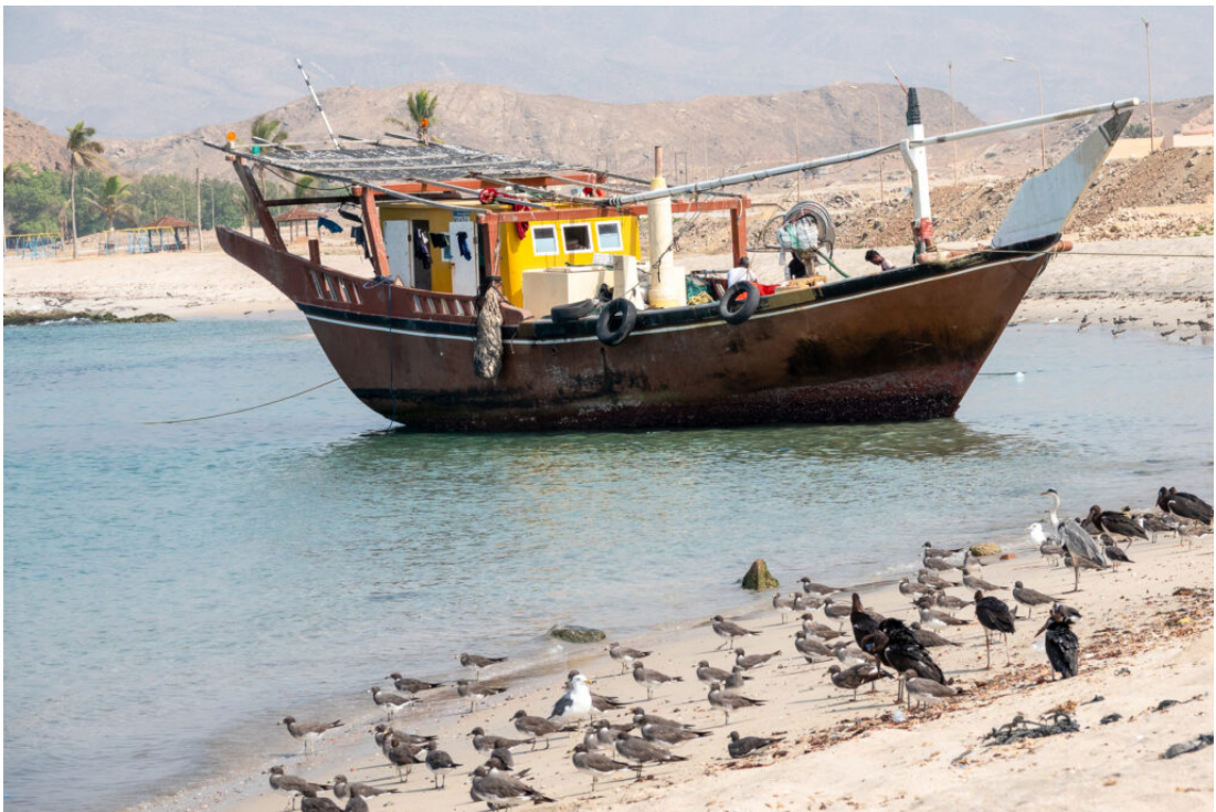
Mirbat beach