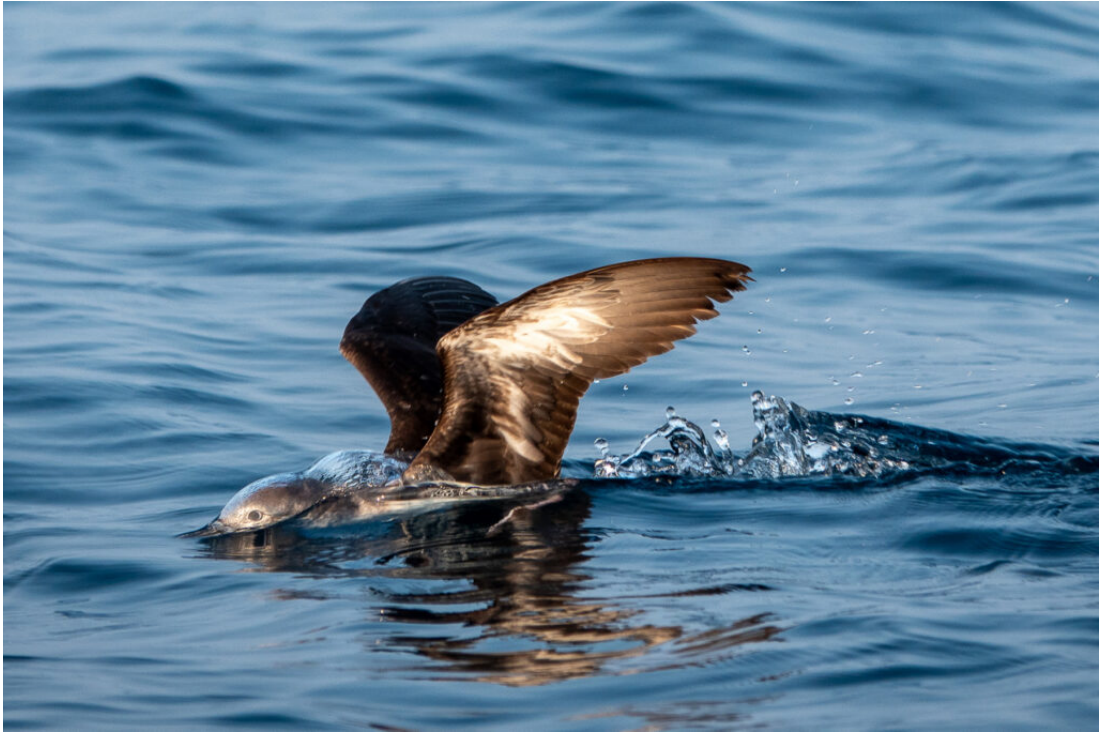
Persian Shearwater