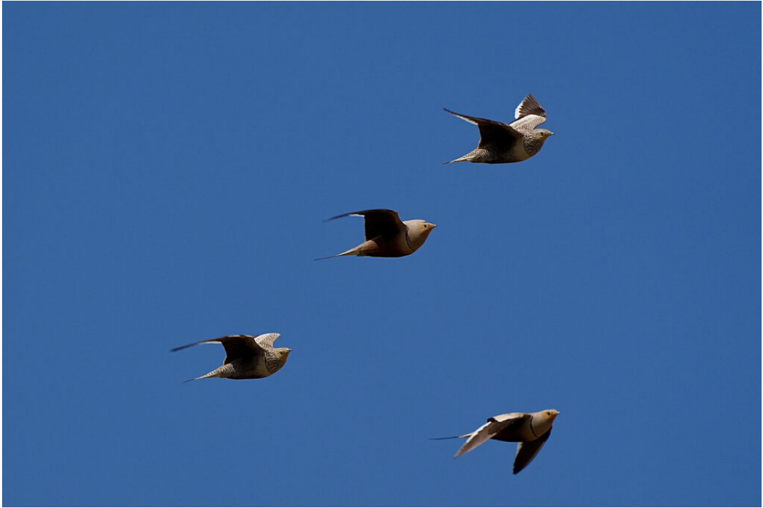
Chestnut-bellied Sandgrouse