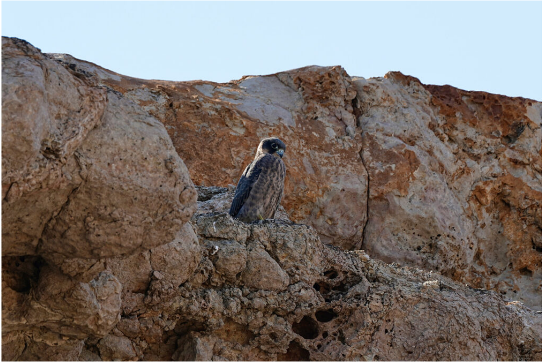
Sooty Falcon