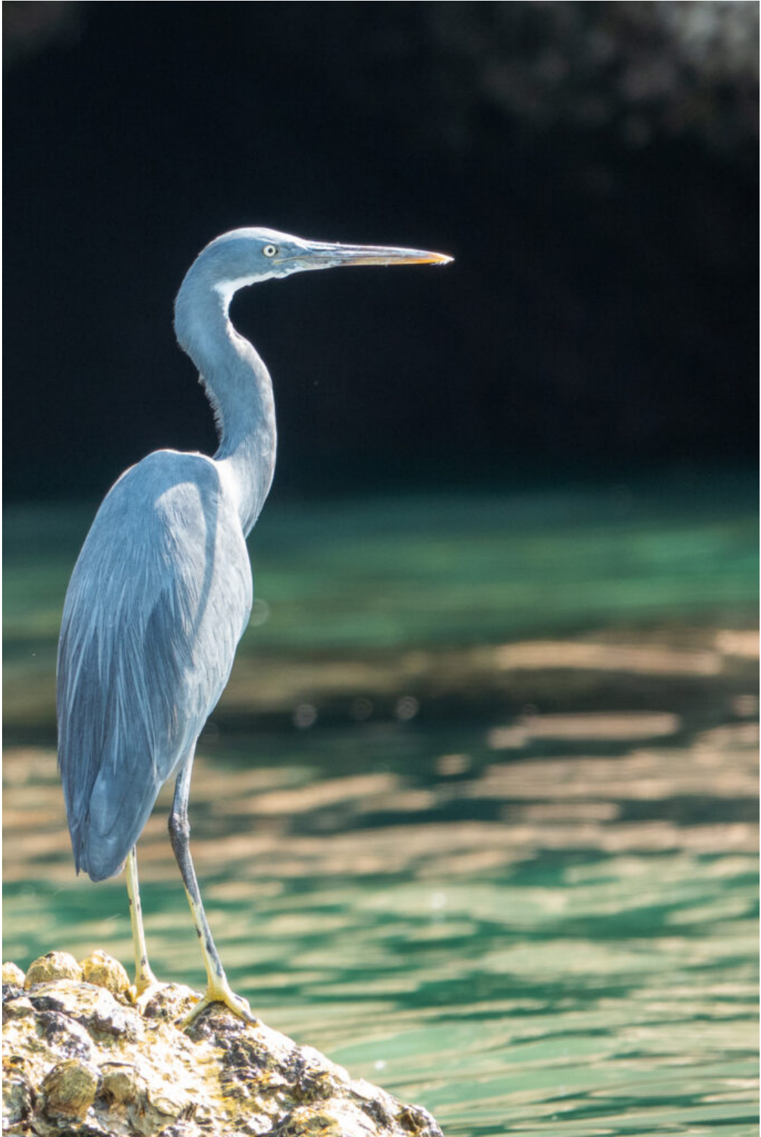
Western Reef Heron