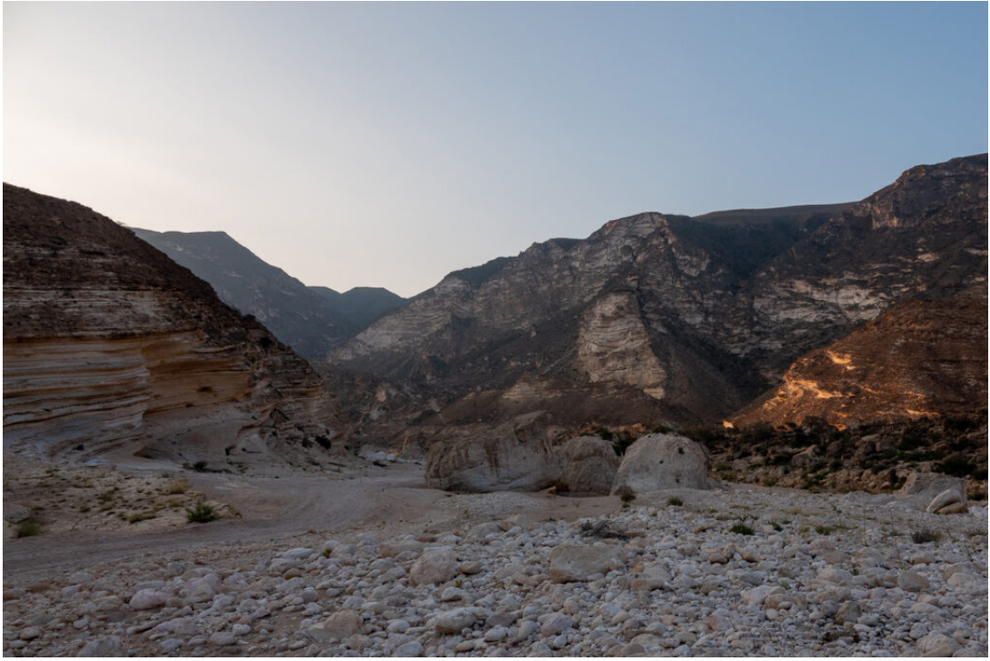
Wadi Ashwaq