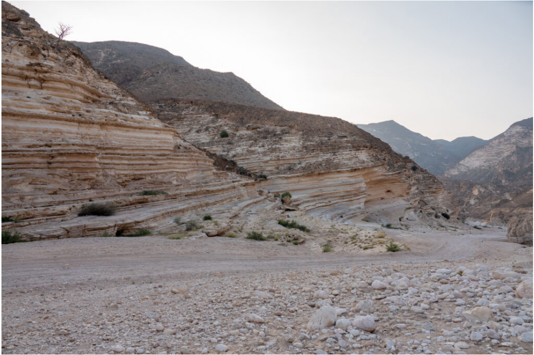
Wadi Ashwaqh