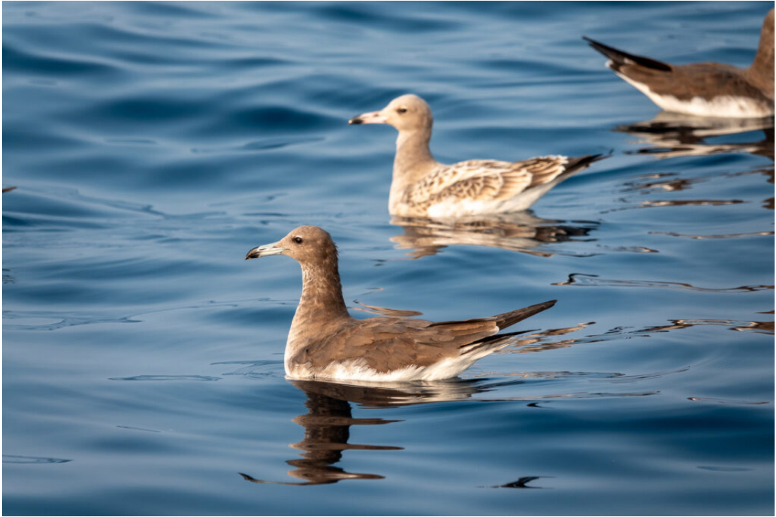
Sooty Gulls