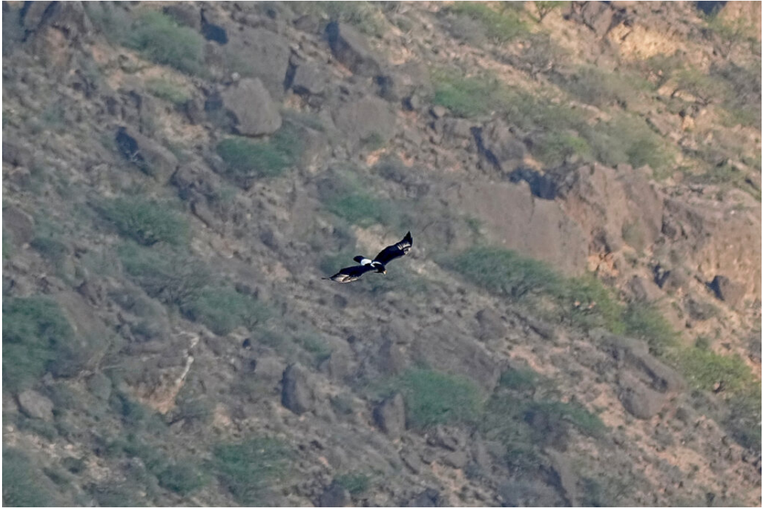
Verreaux's Eagle