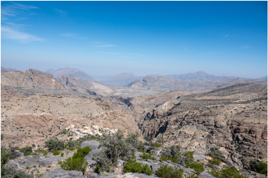
Sayq Plateau