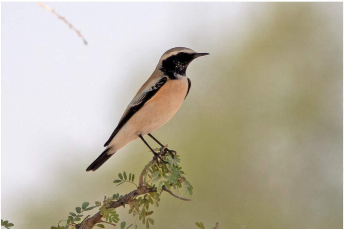
Desert Wheatear