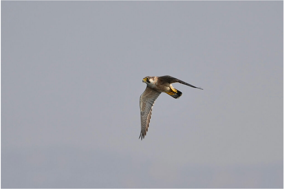
Peregrine Falcon ssp pelegrinoides