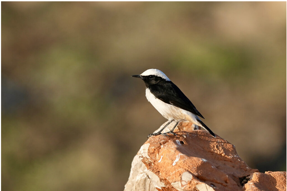
Arabian Wheatear