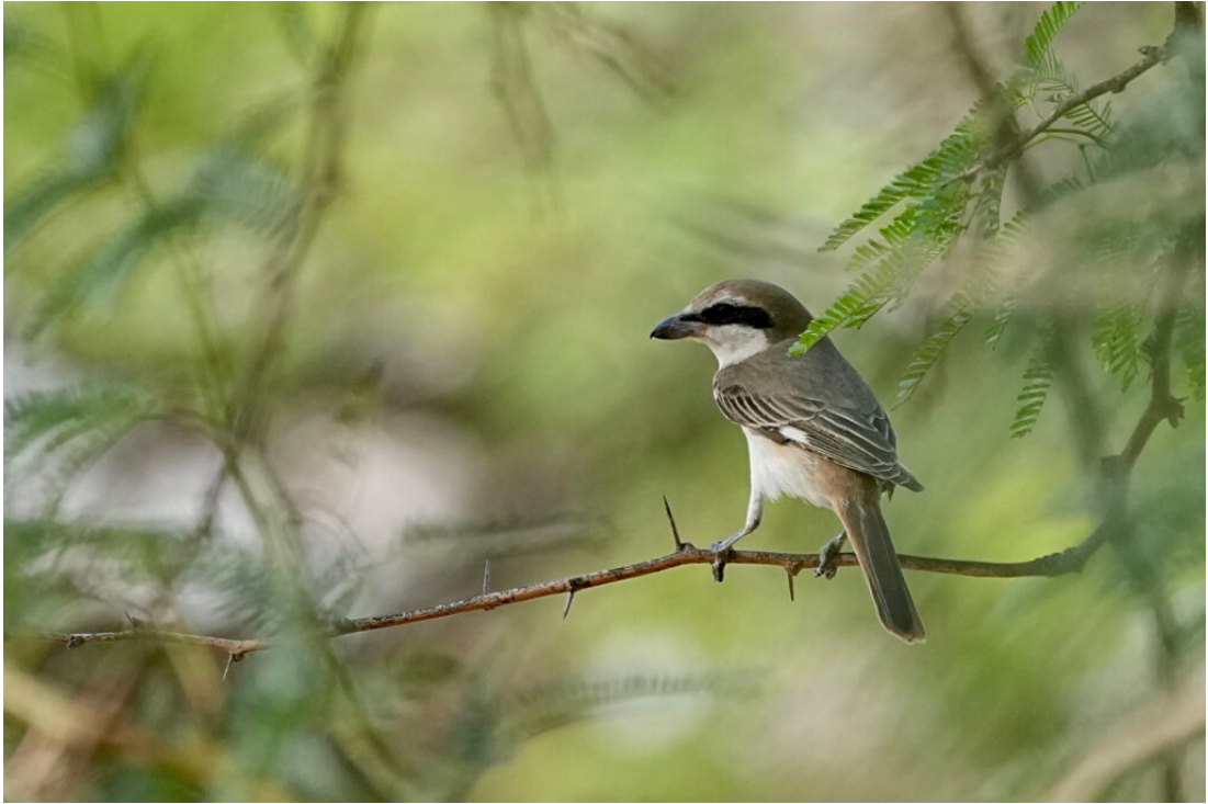
Red-tailed Shrike