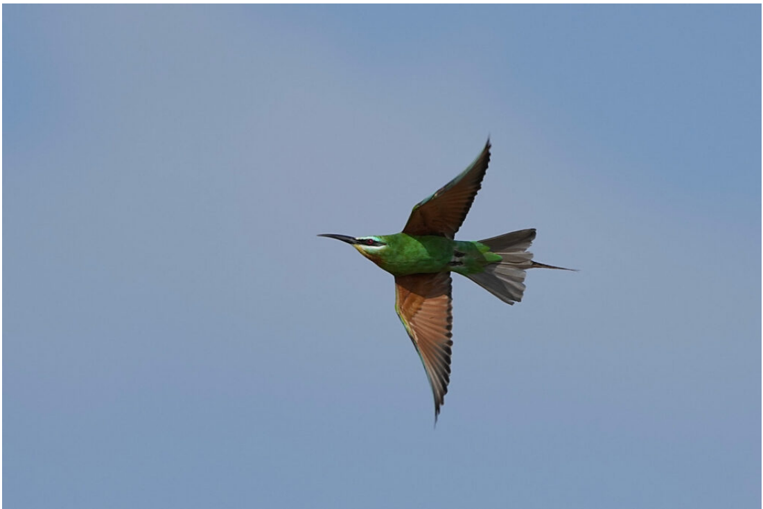
Blue-cheeked Bee-eater