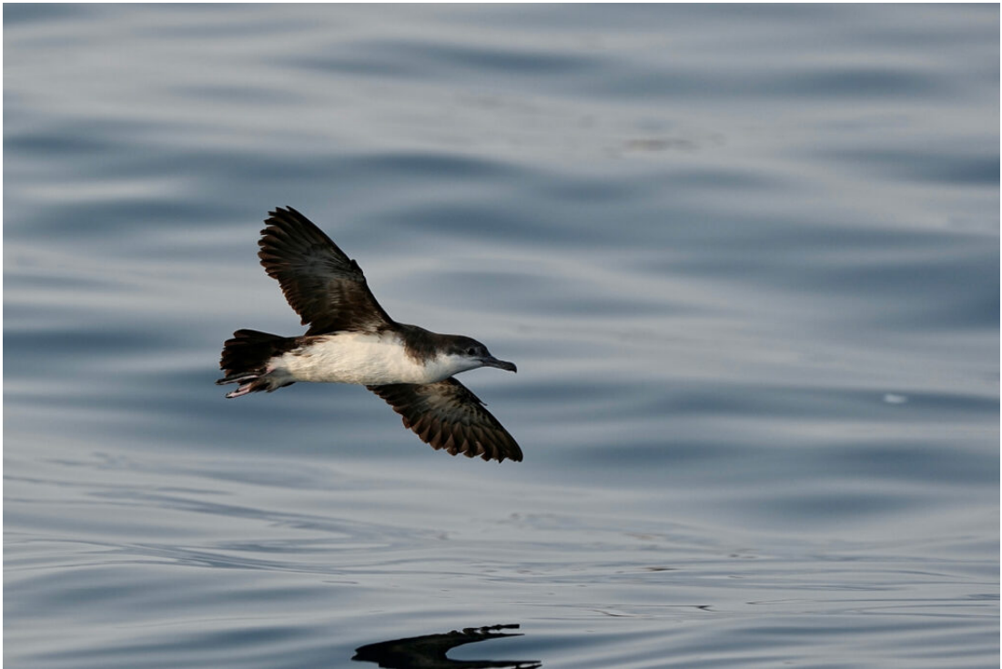
Persian Shearwater