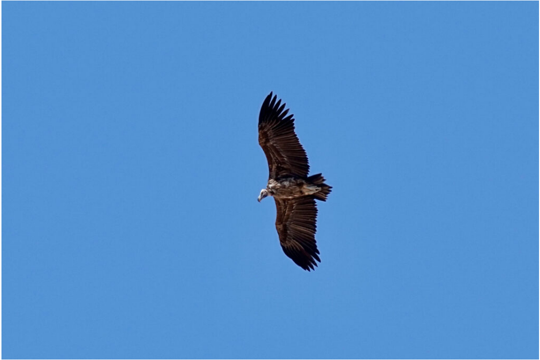
Lappet-faced Vulture