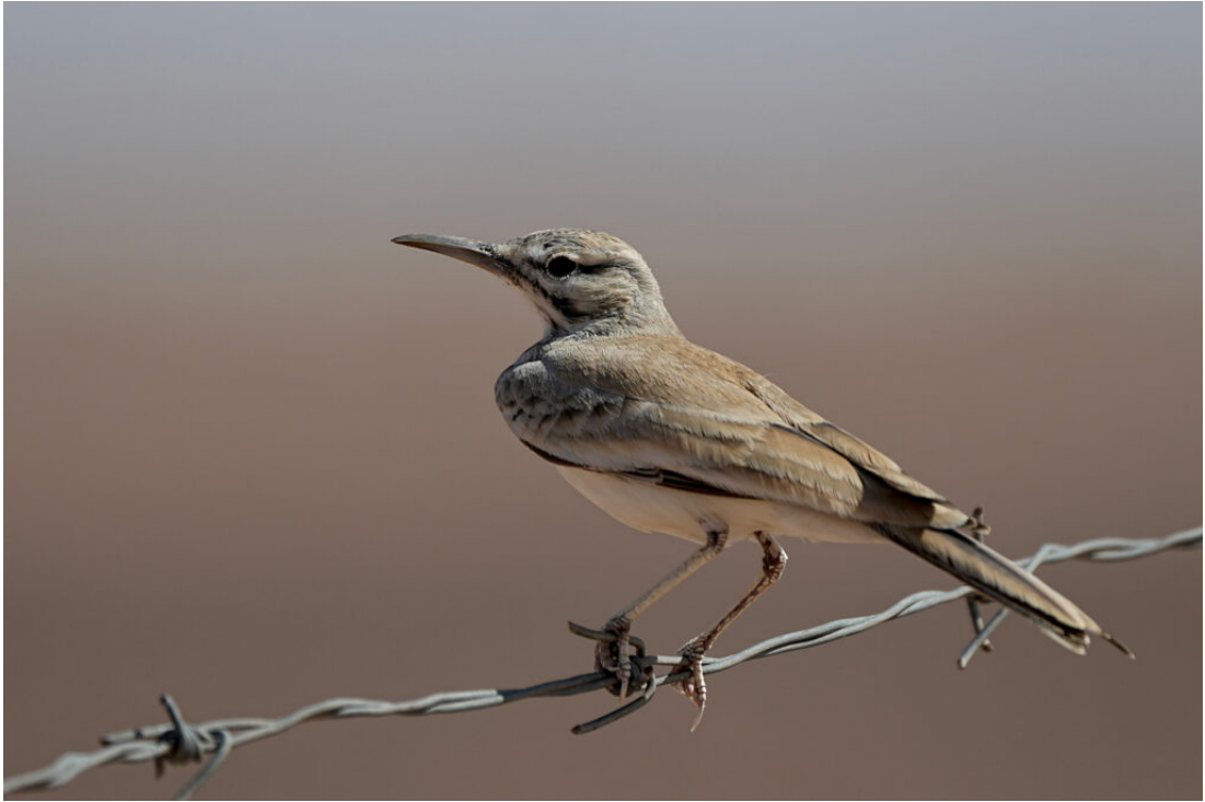
Greater Hoopoe-Lark