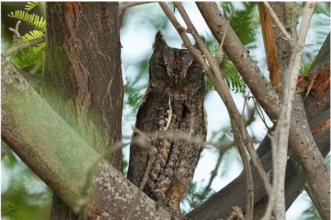
Eurasian Scops Owl