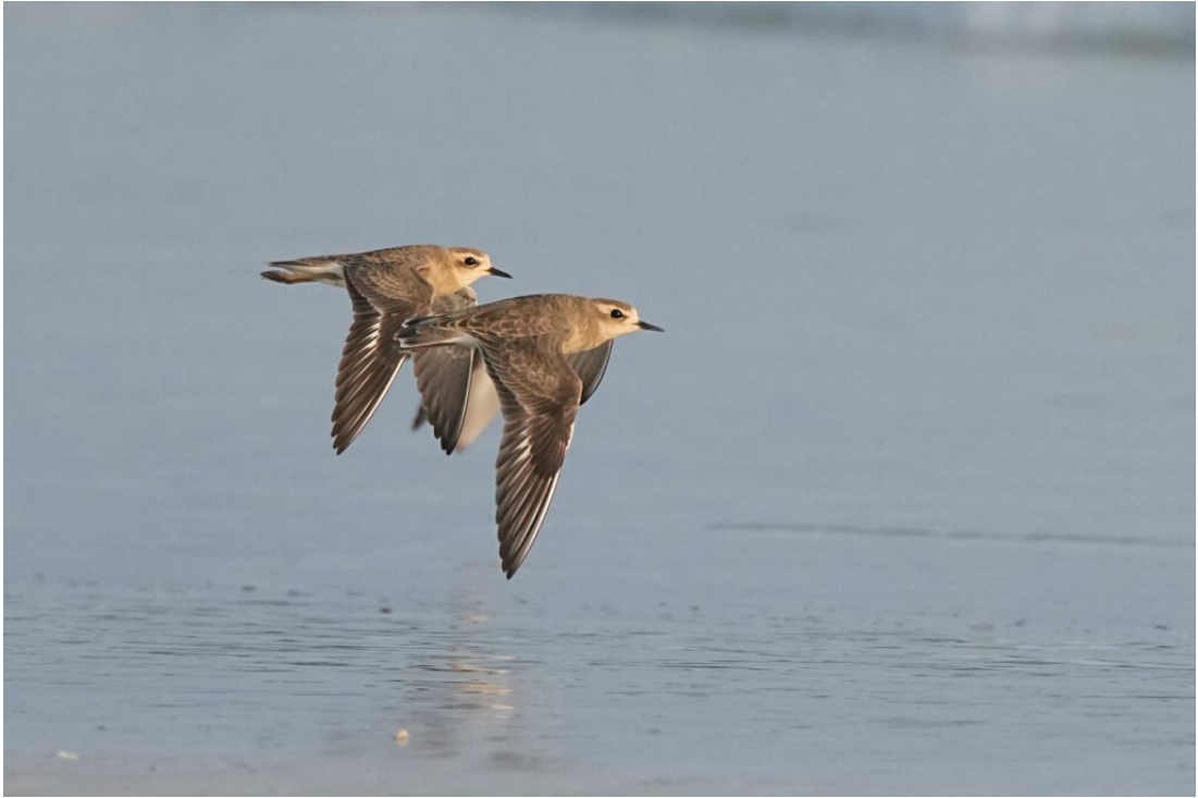
Caspian Plovers