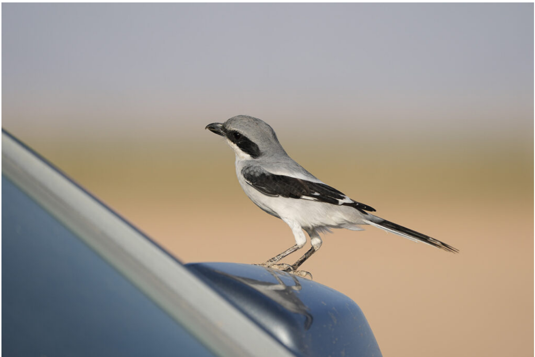
Great Grey Shrike