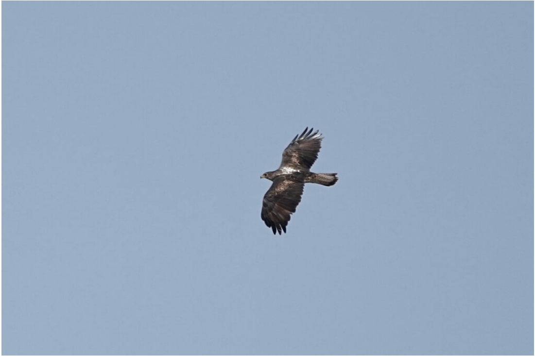
Bonelli's Eagle