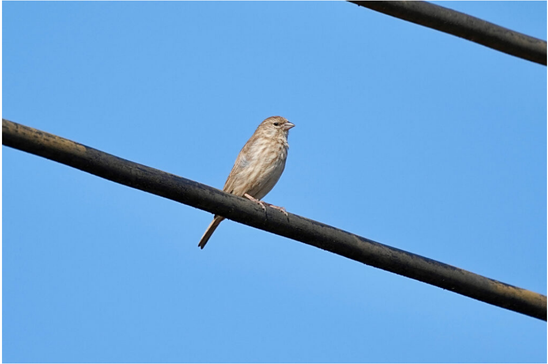
Yemen Serin