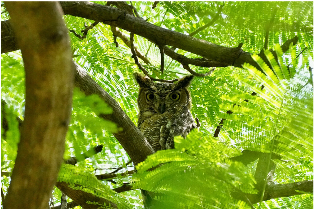
Arabian Eagle-Owl