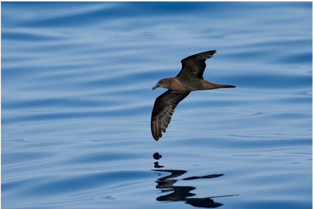
Jouanin's Petrel