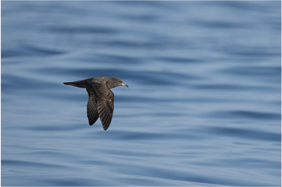
Flesh-footed Shearwater