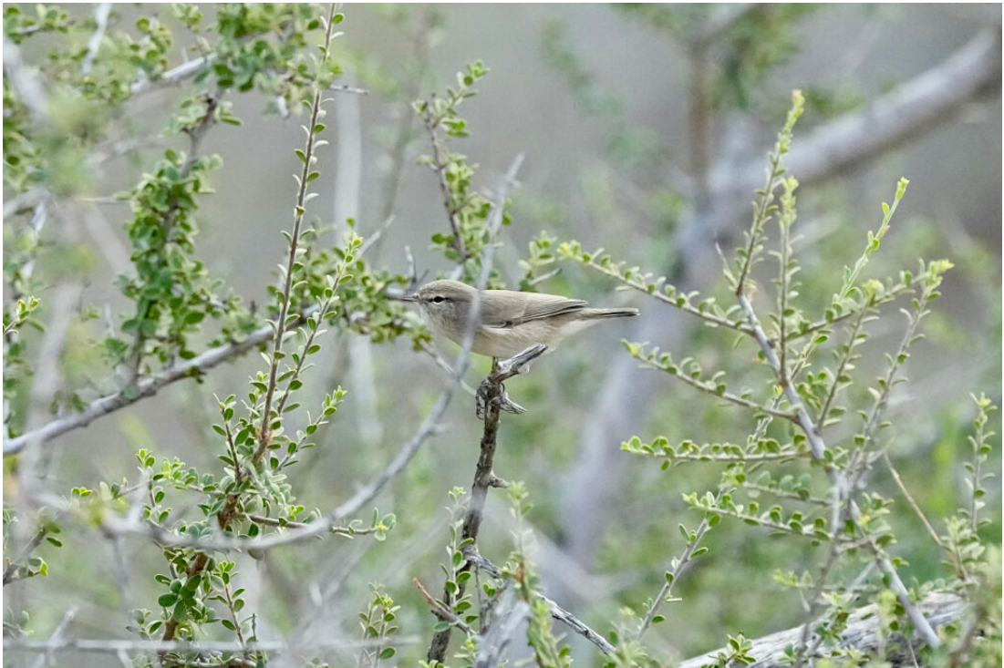
Plain Leaf Warbler