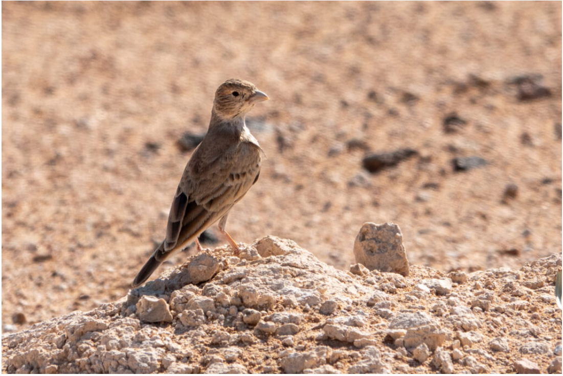
Black-crowned Sparrow-Lark