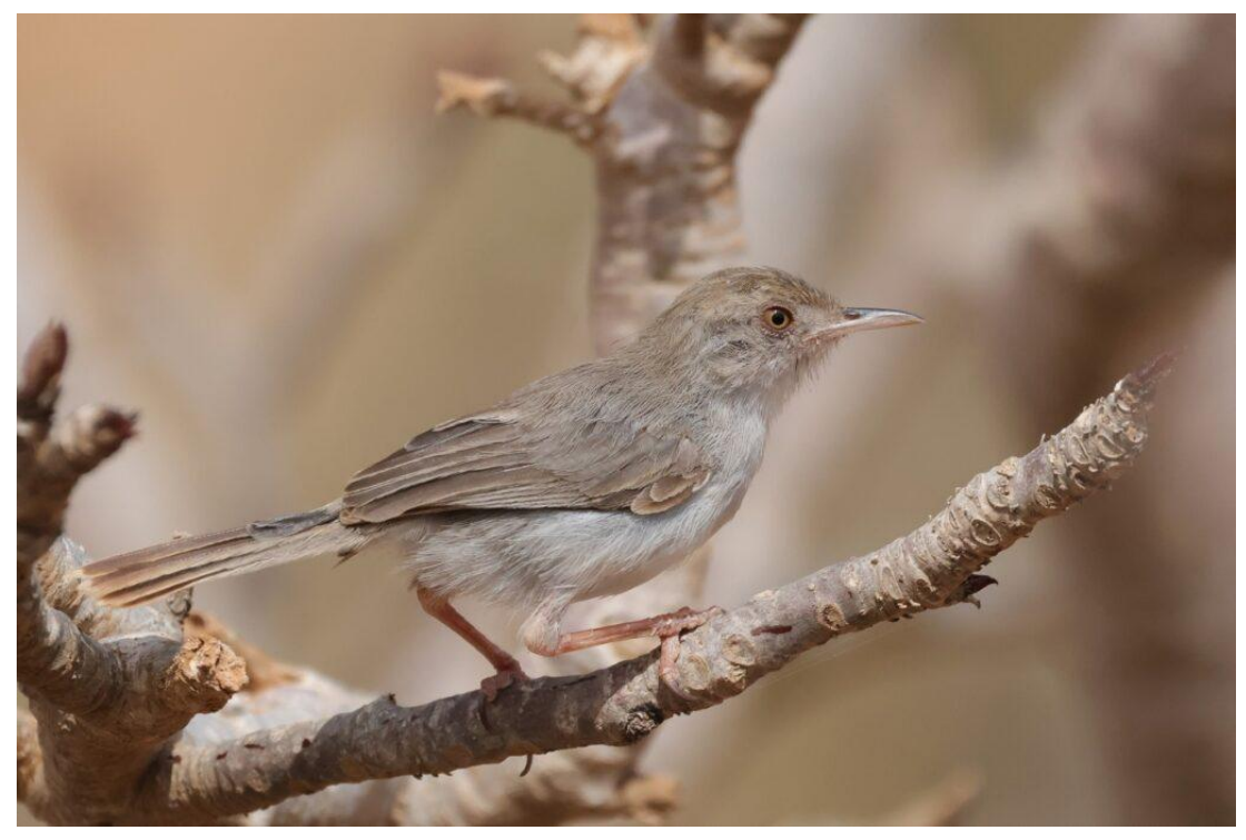
Socotra Warbler