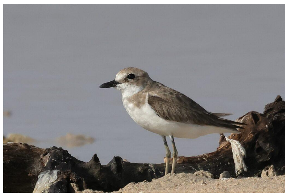
Greater Sand Plover