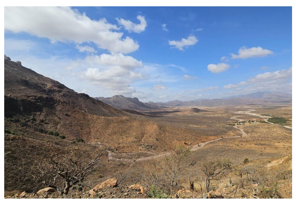
Socotra's mountains