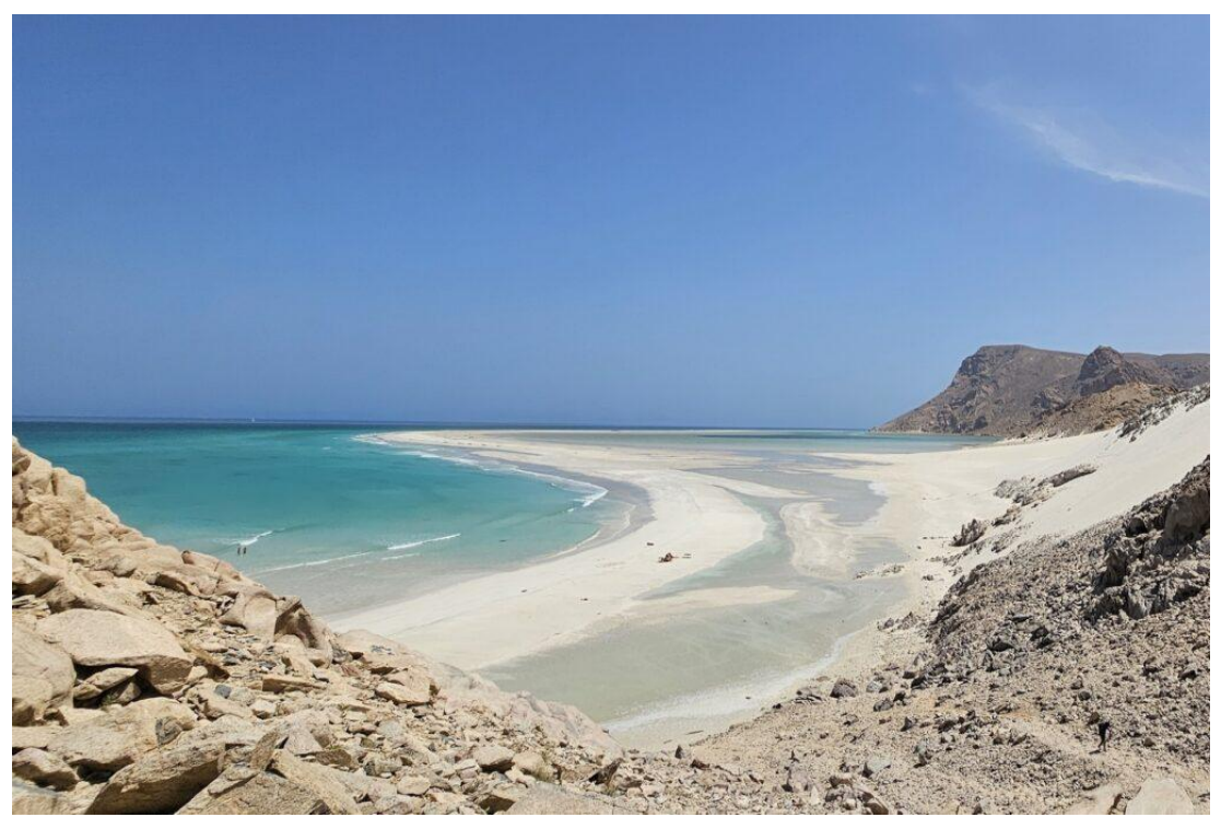
Detwah Lagoon