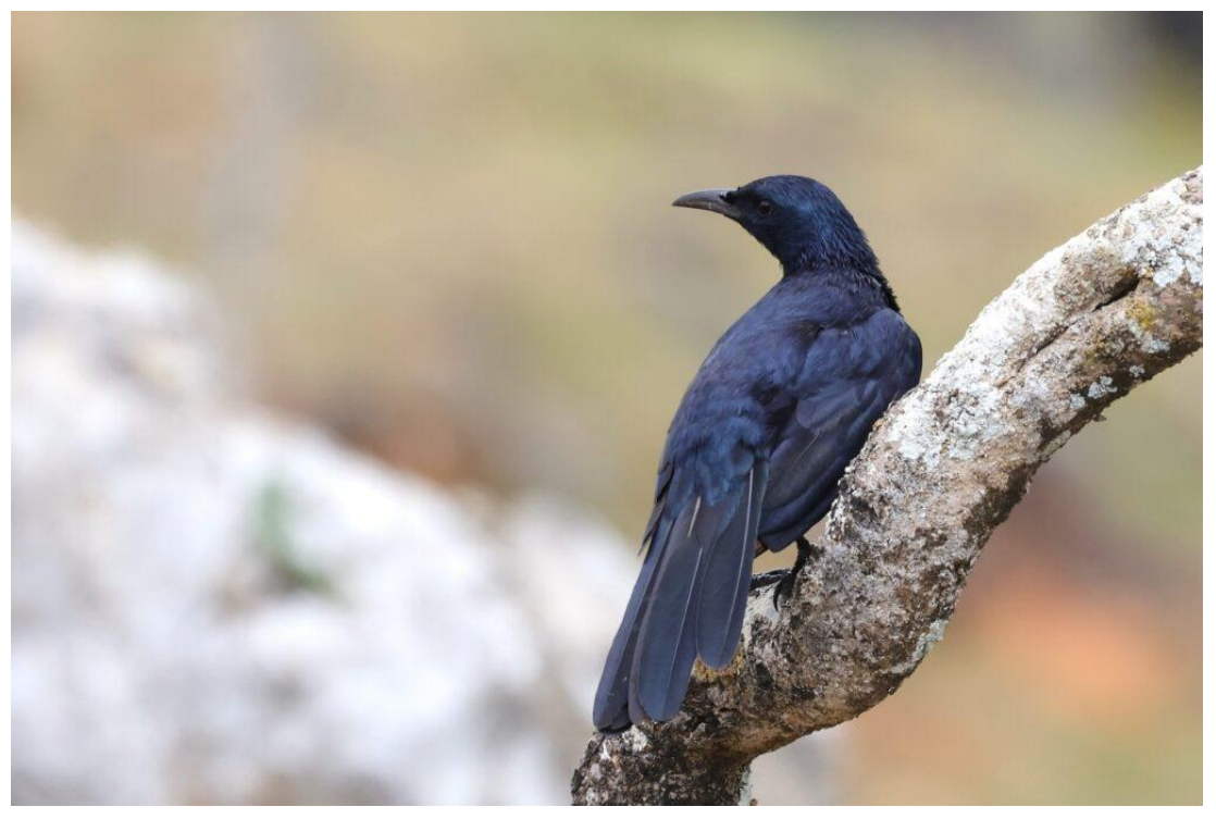
Socotra Starling