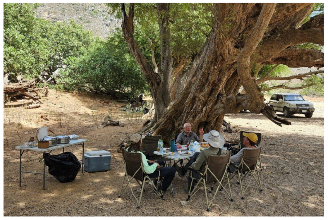
Lunchbreak in Socotra