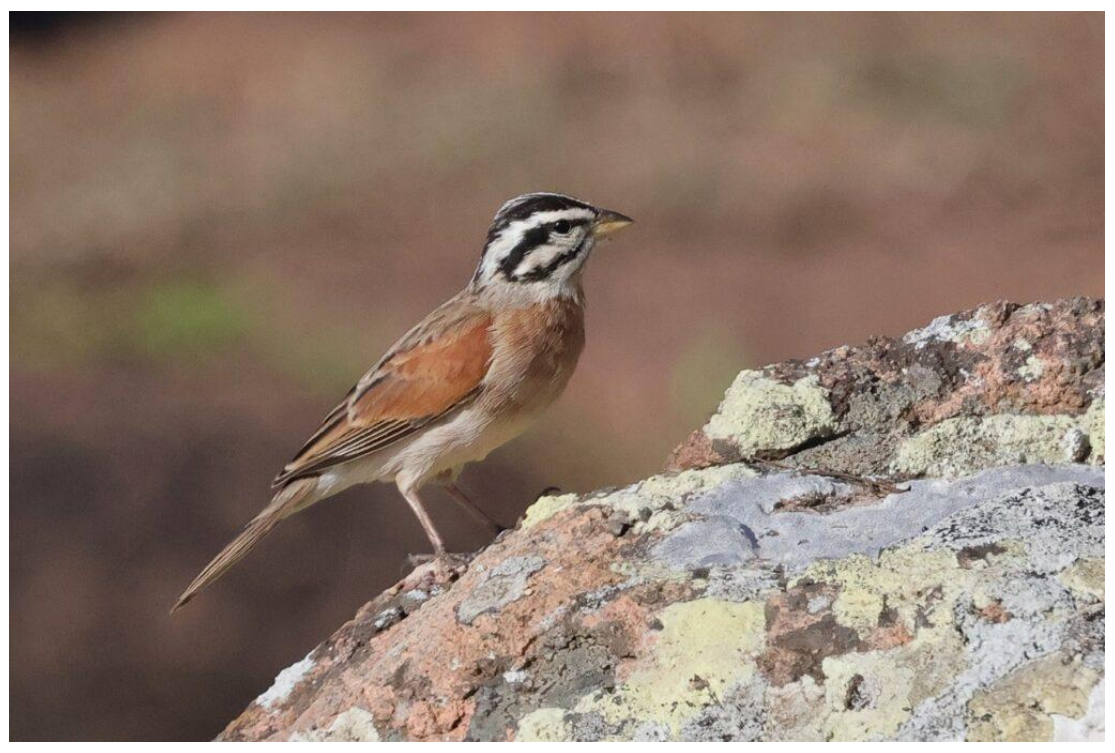
Socotra Bunting