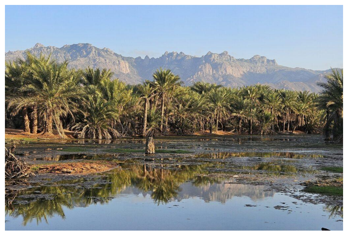
Khor Sirhin