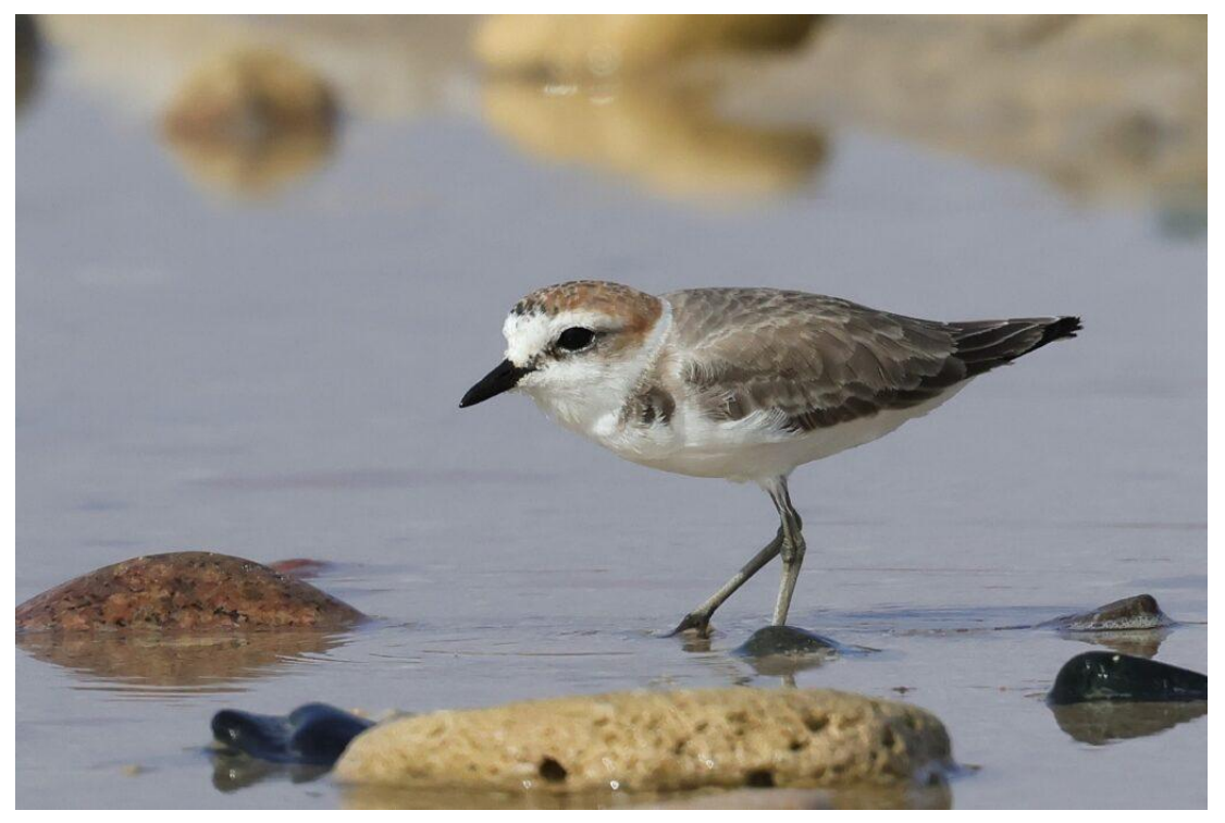
Kentish Plover