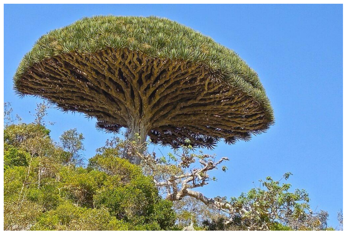
Dragon's Blood Tree