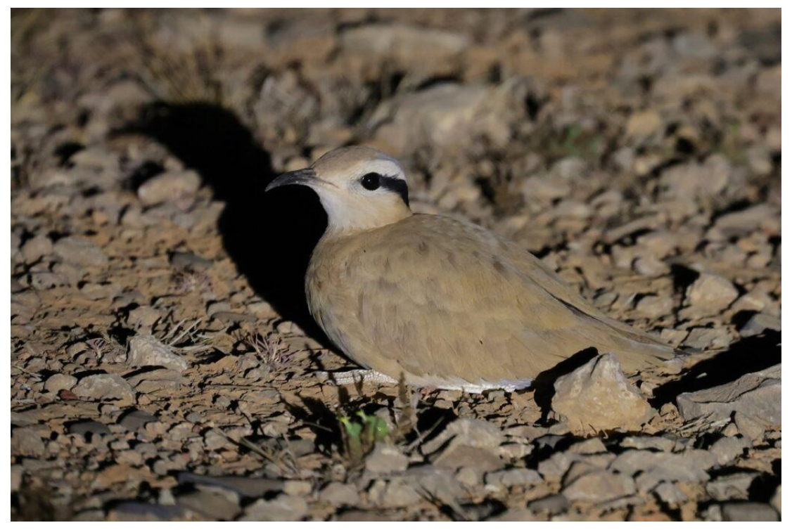
Cream-coloured Courser