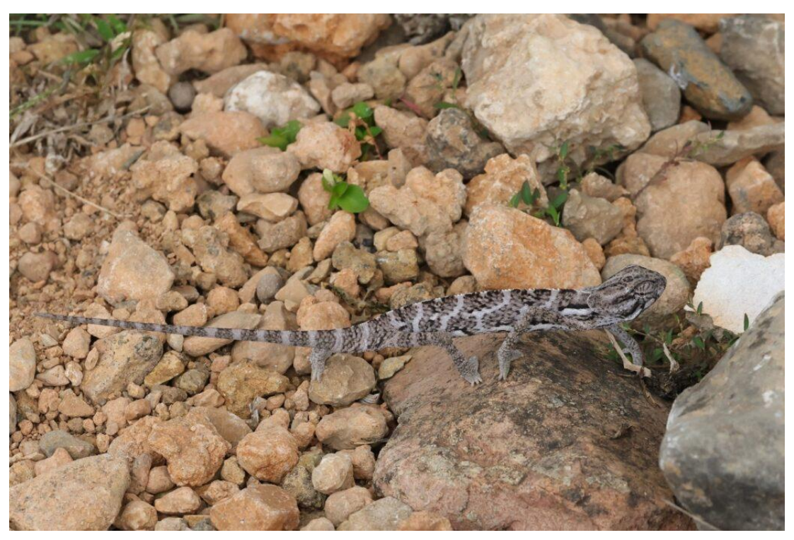
Socotra Chameleon