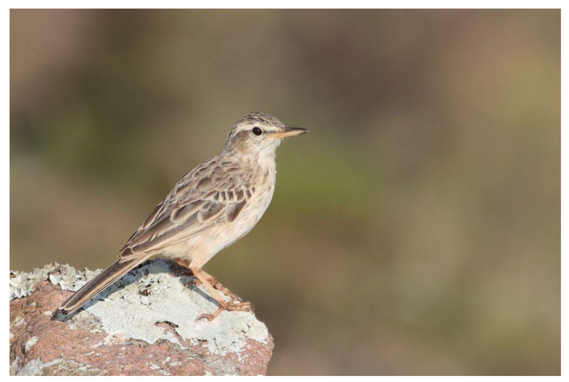
Long-billed Pipit ssp sokotrae