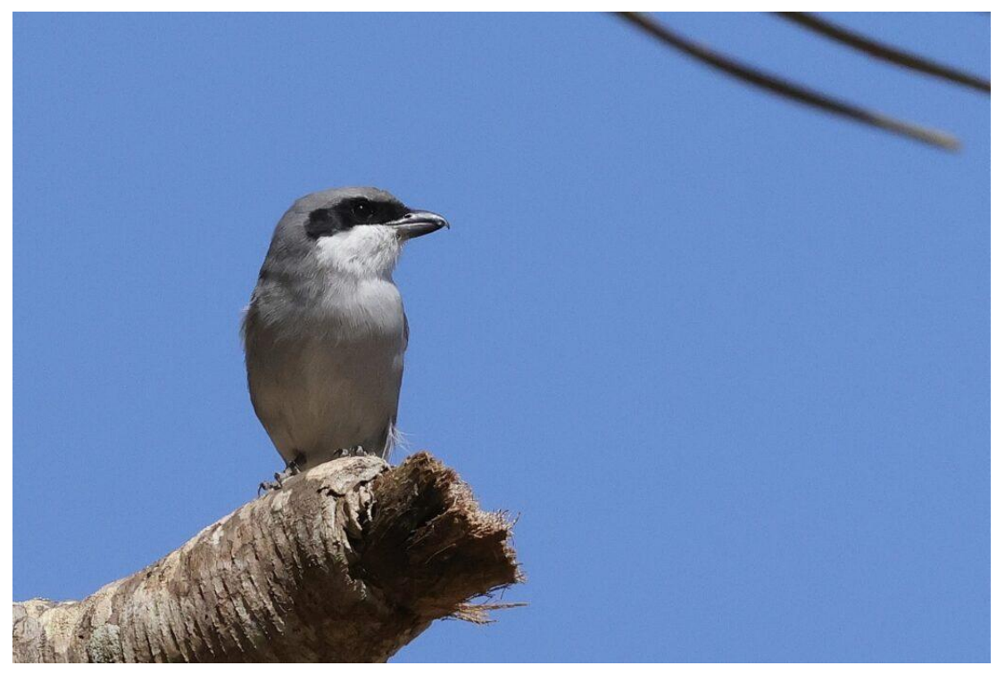
Great Grey Shrike ssp uncinatus