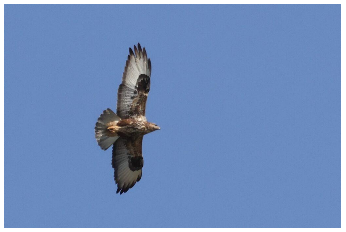
Socotra Buzzard