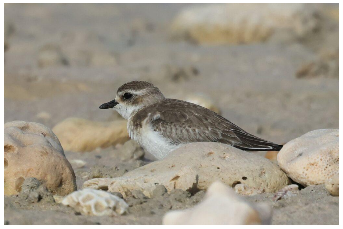
Tibetan Sand Plover