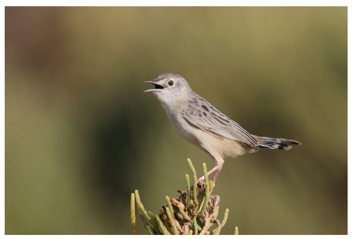
Socotra Cisticola