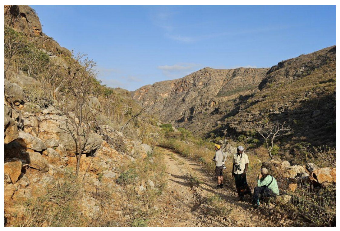
Wadi Ayhaft