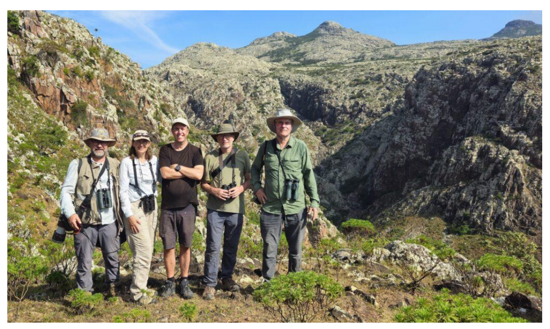
Birding at Meshiri Gorge