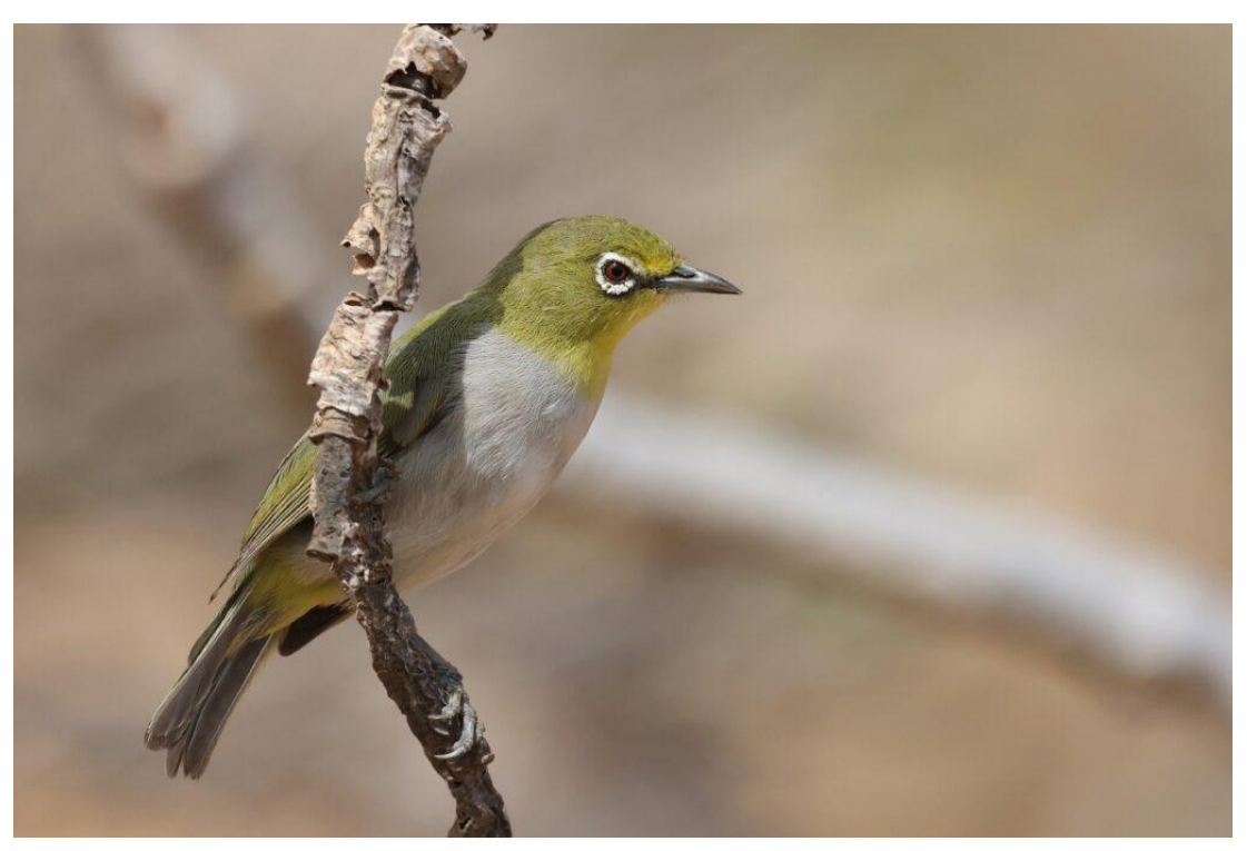
Socotra White-eye