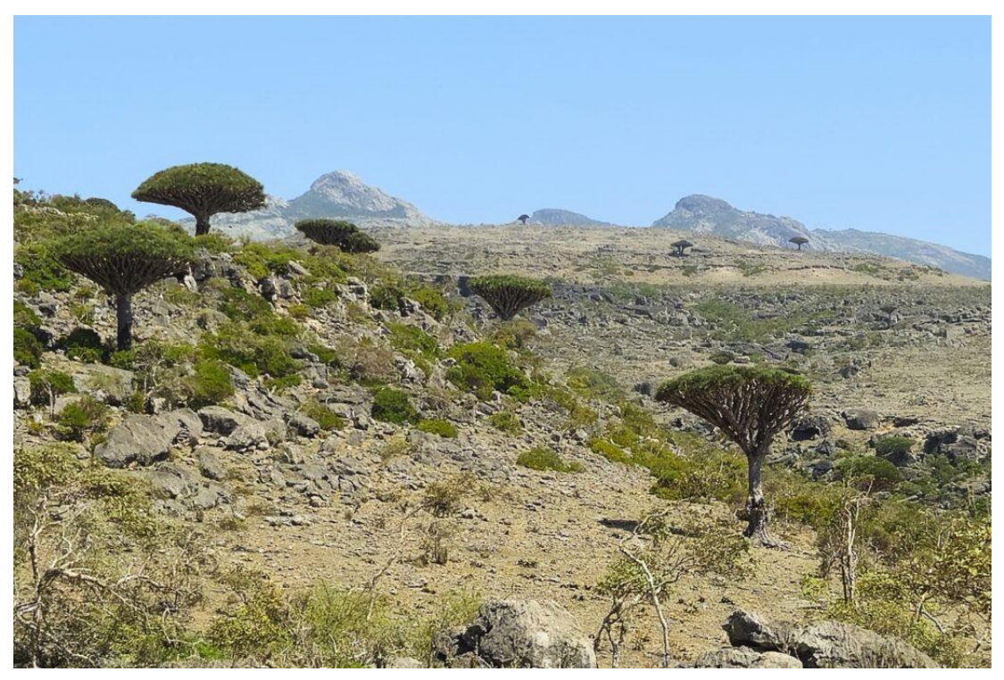
Dixem Plateau