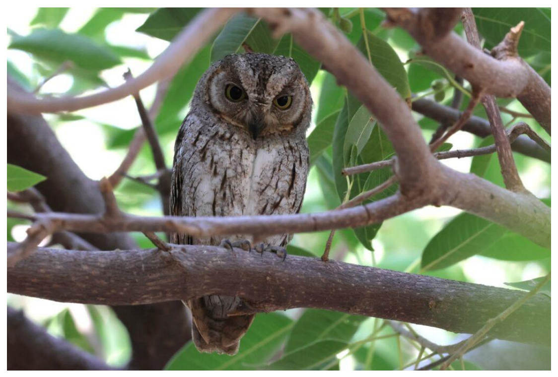
Socotra Scops Owl