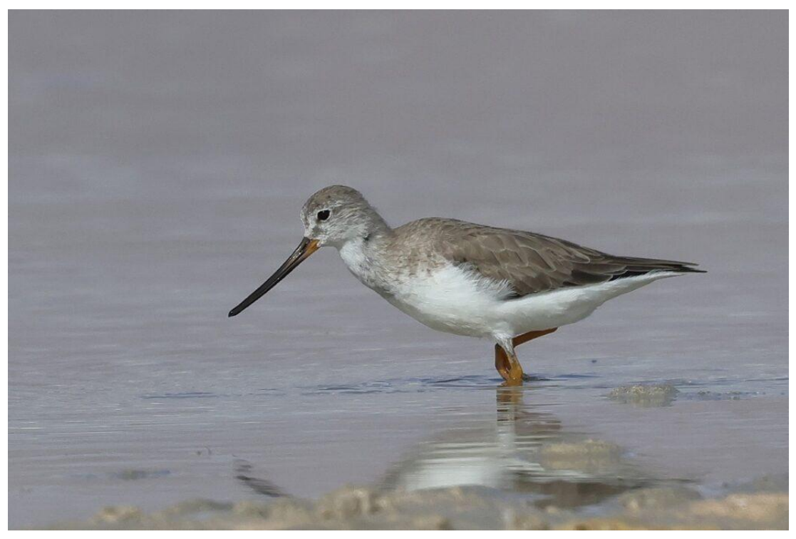
Terek Sandpiper