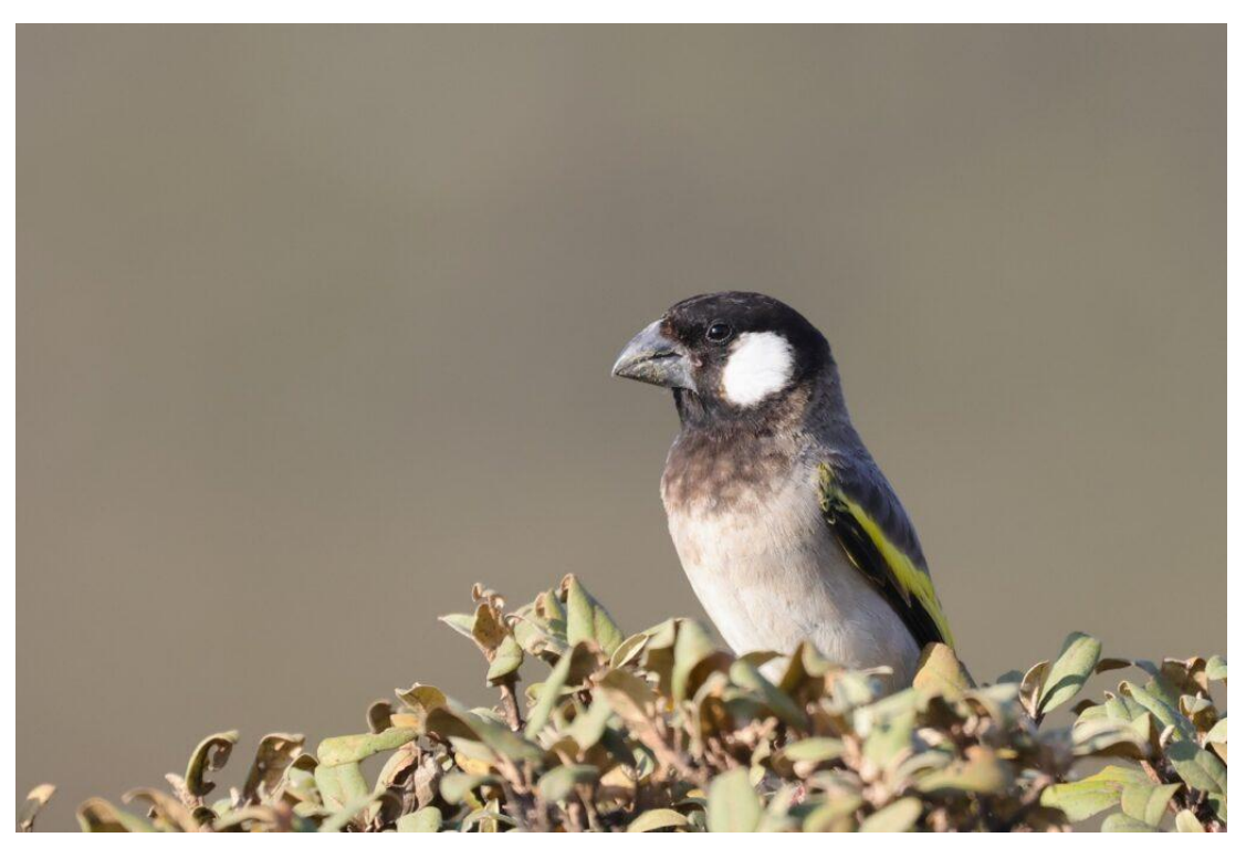
Socotra Golden-winged Grosbeak