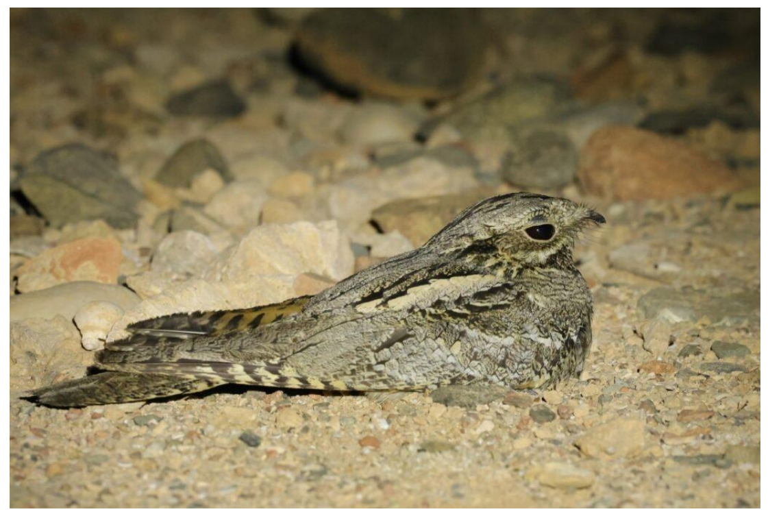
European Nightjar