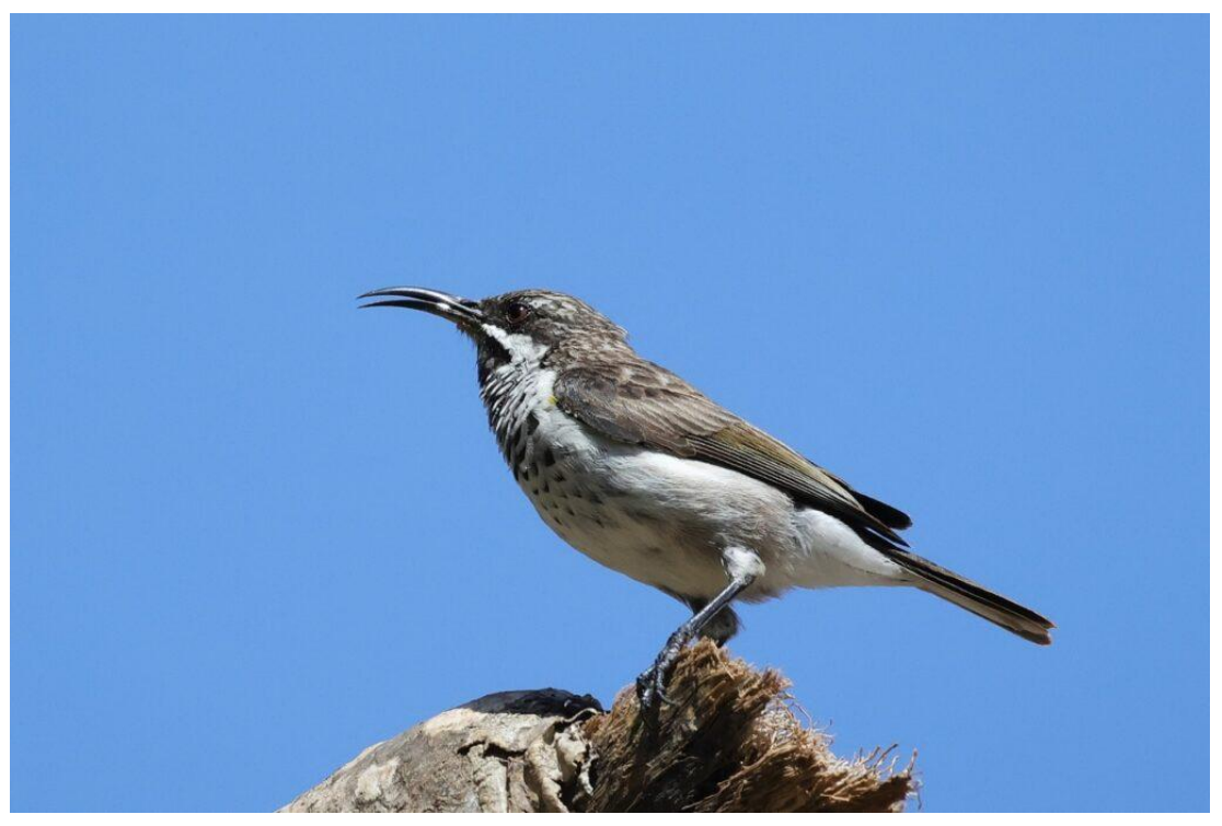
Socotra Sunbird