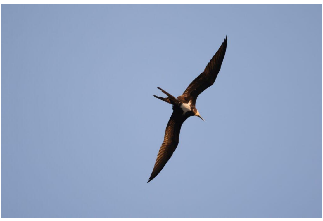
Christmas Frigatebird