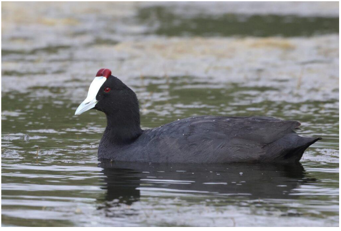
Red-knobbed Coot