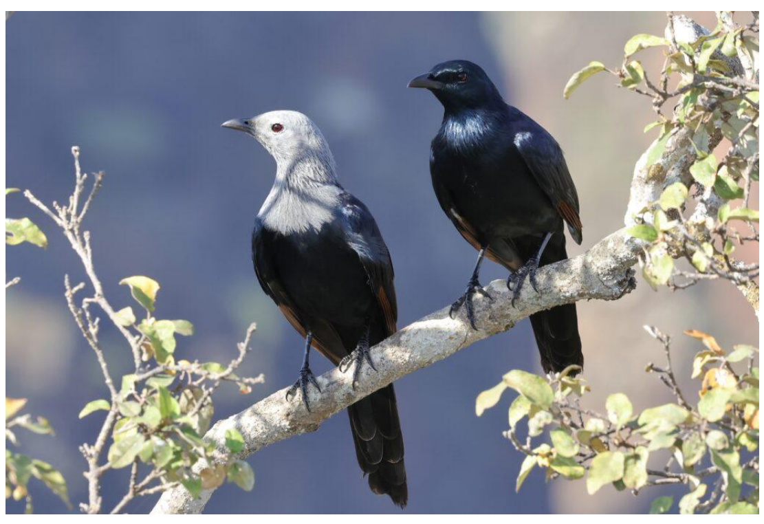
Somali Starlings