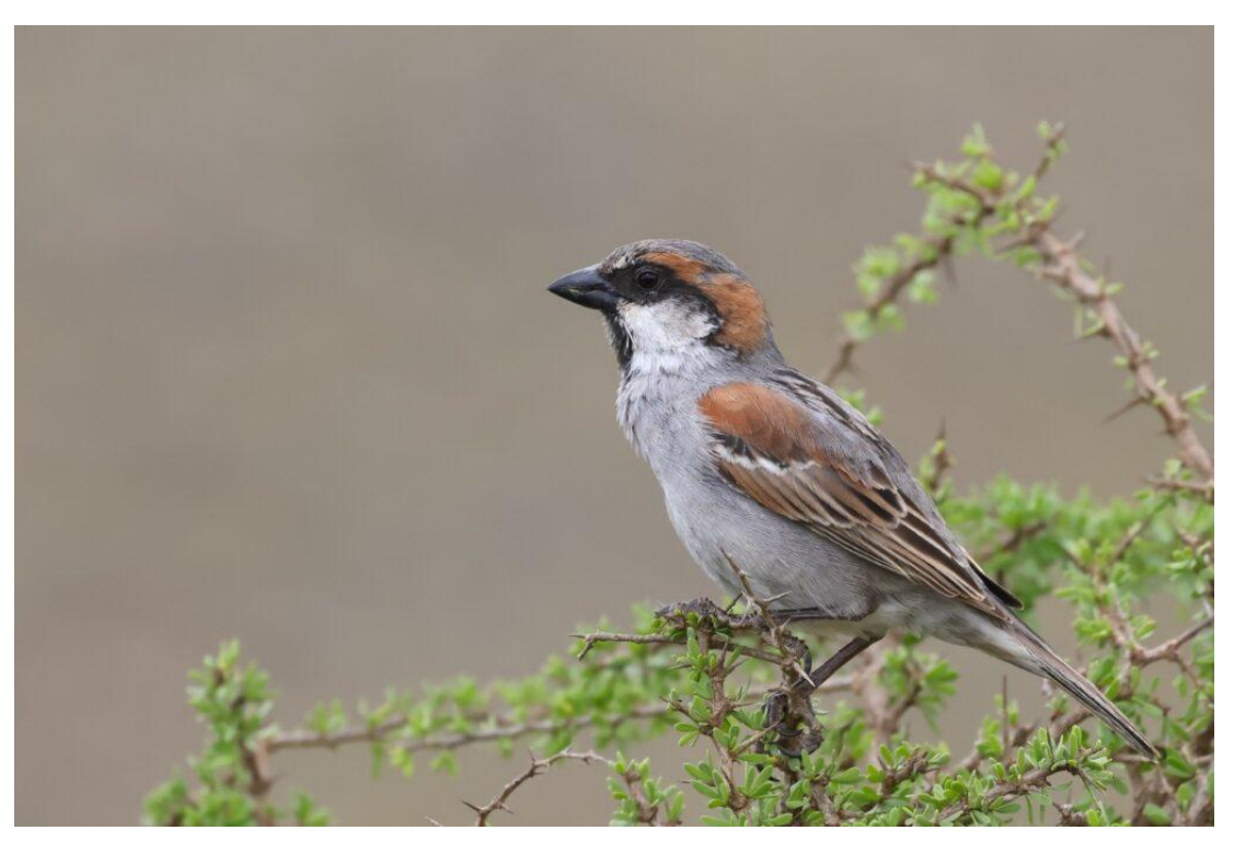
Socotra Sparrow