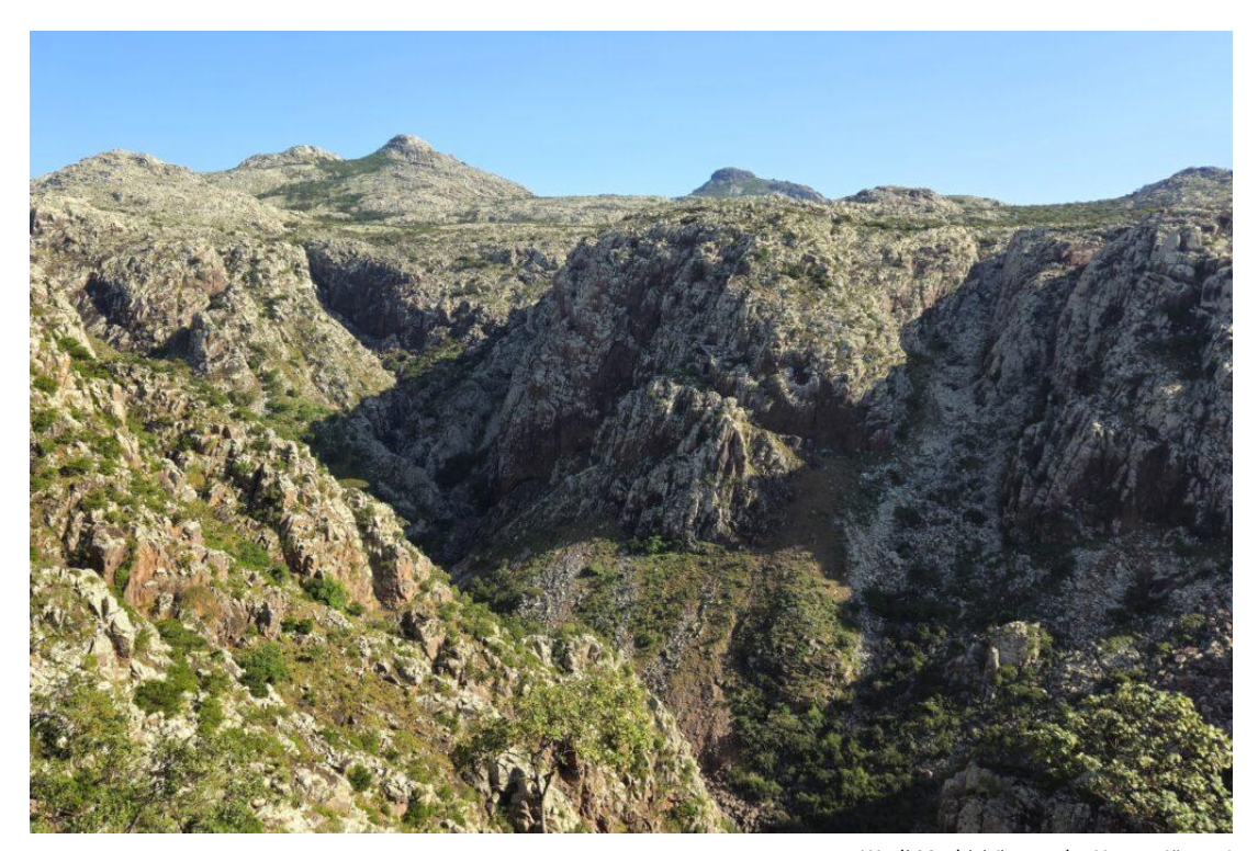
Wadi Meshiri

Socotra Racer Hemerophis socotrae Socotra Chameleon Chamaeleo monachus Socotra Rock Gecko Pristurus sokotranus Socotra Skink Trachylepis socotrana Blanford's Rock Gecko Pristurus insignis