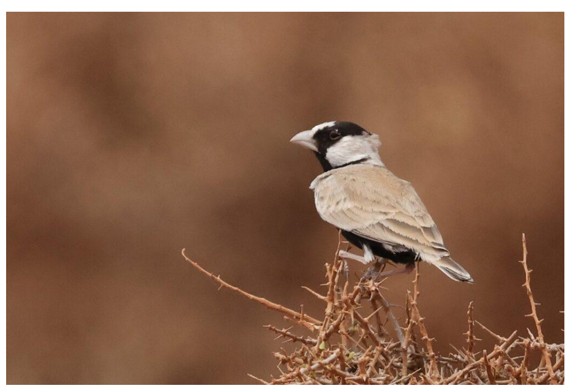
Black-crowned Sparrow-Lark (image by Hannu Jännes)