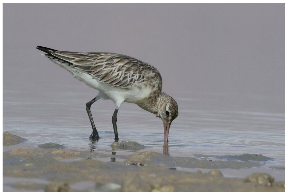
Bar-tailed Godwit