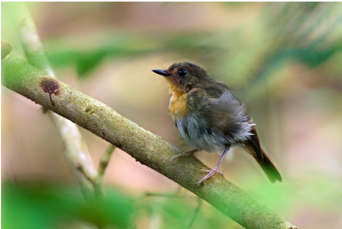
Lompobattang Flycatcher