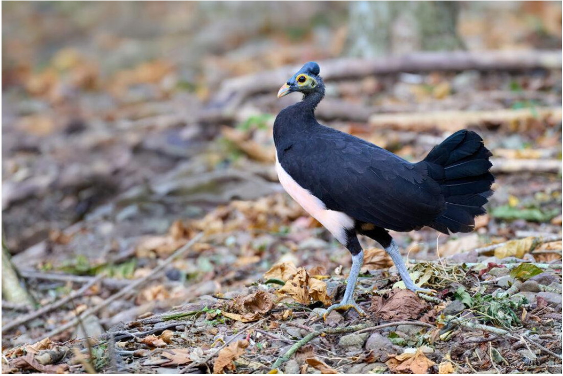
Maleo