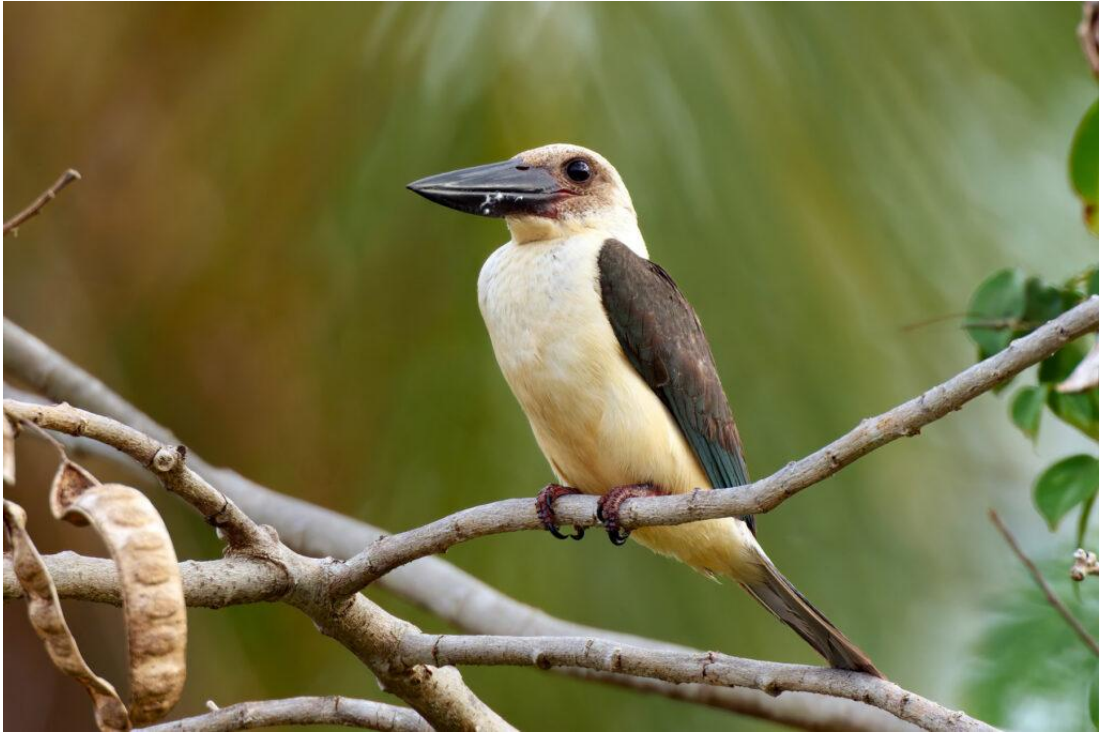
Great-billed Kingfisher