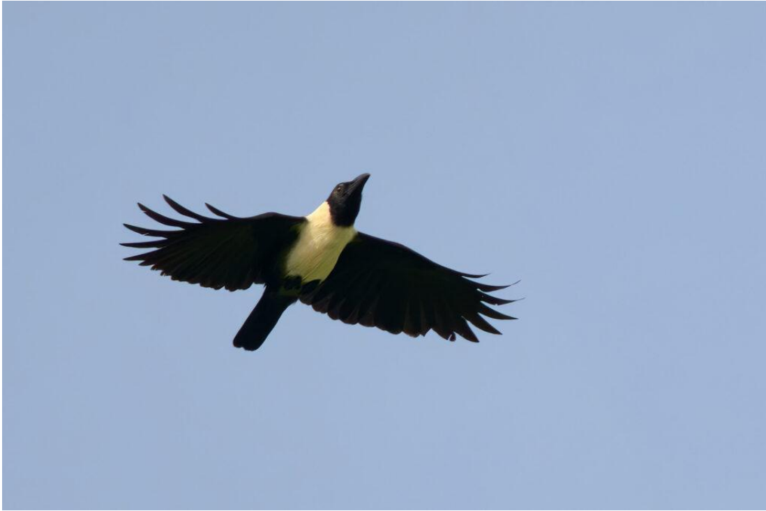
Piping Crow