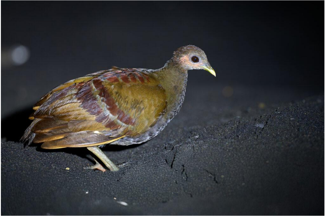
Moluccan Megapode