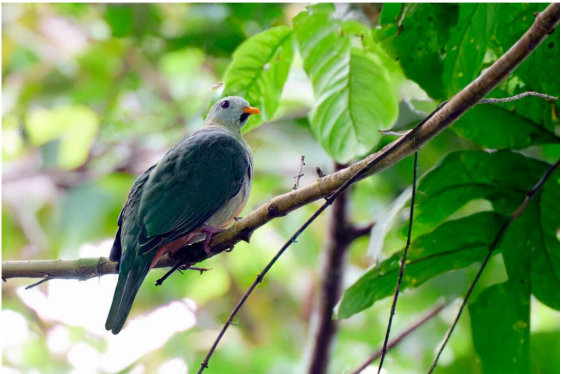
Oberholser's Fruit Dove