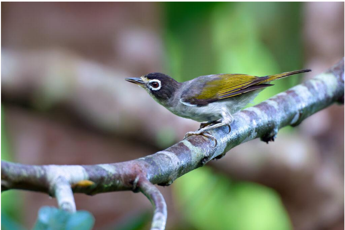
Morotai White-eye