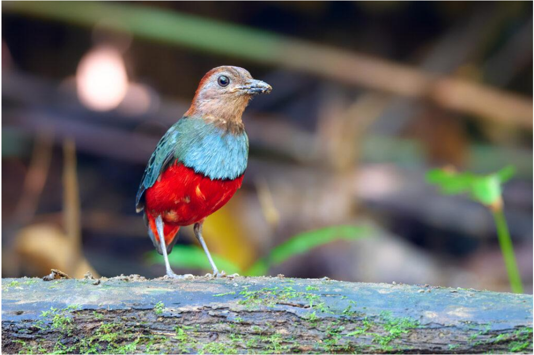
North Moluccan Pitta