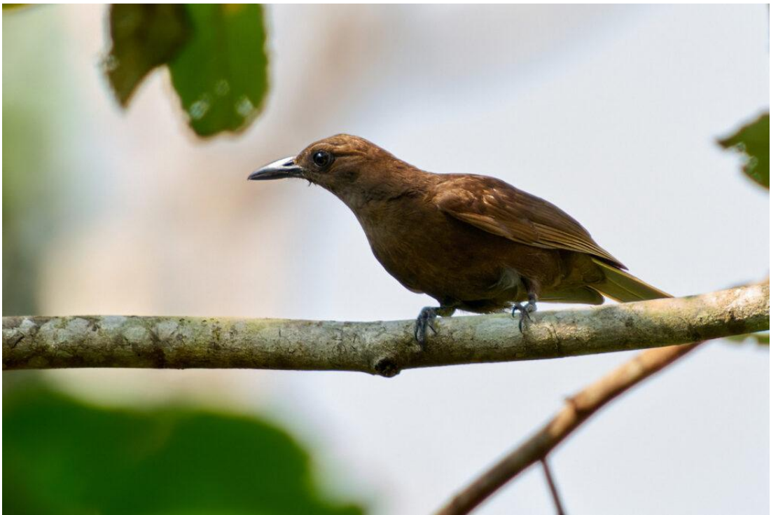
Dusky Brown Oriole