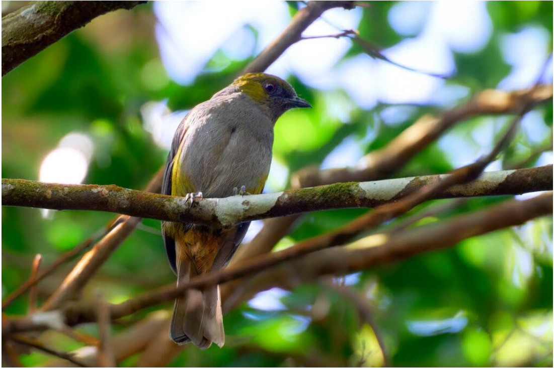
Southern Hylocitrea