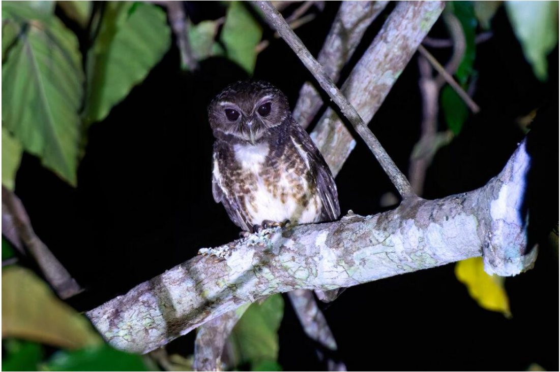
Speckled Boobook