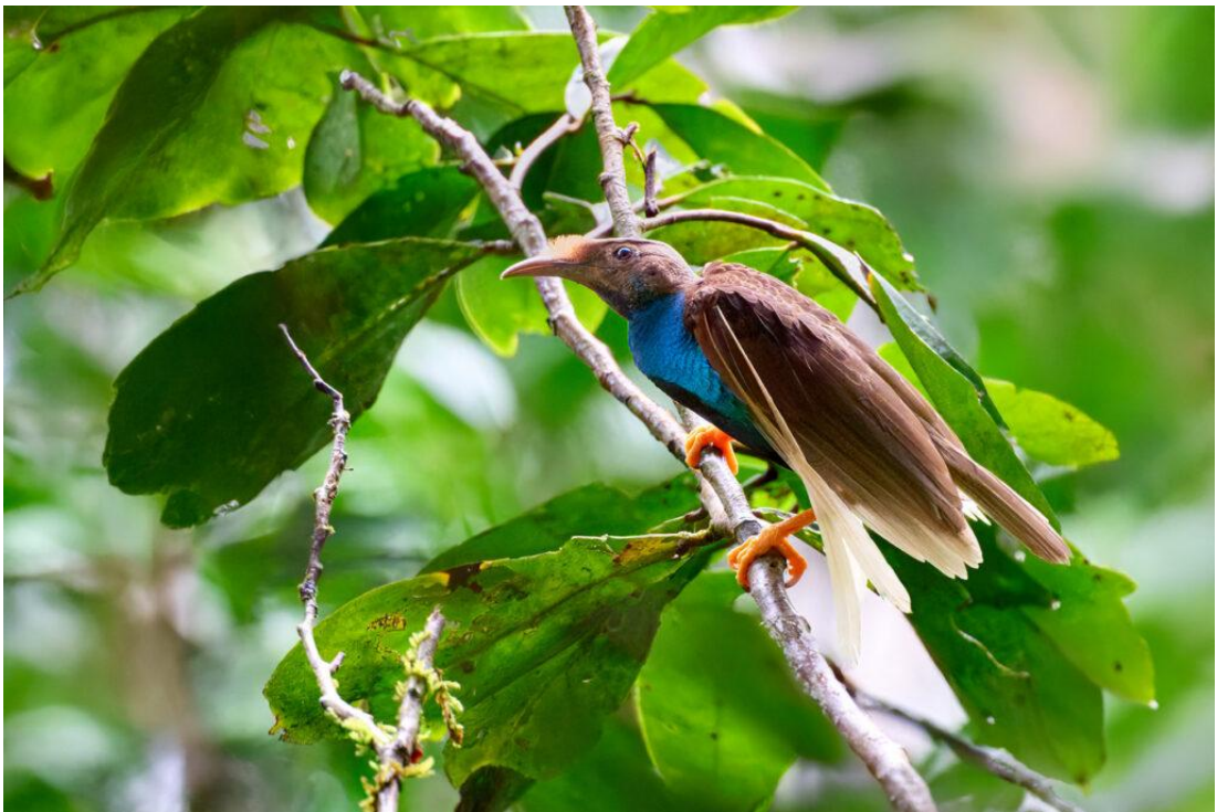
Standardwing