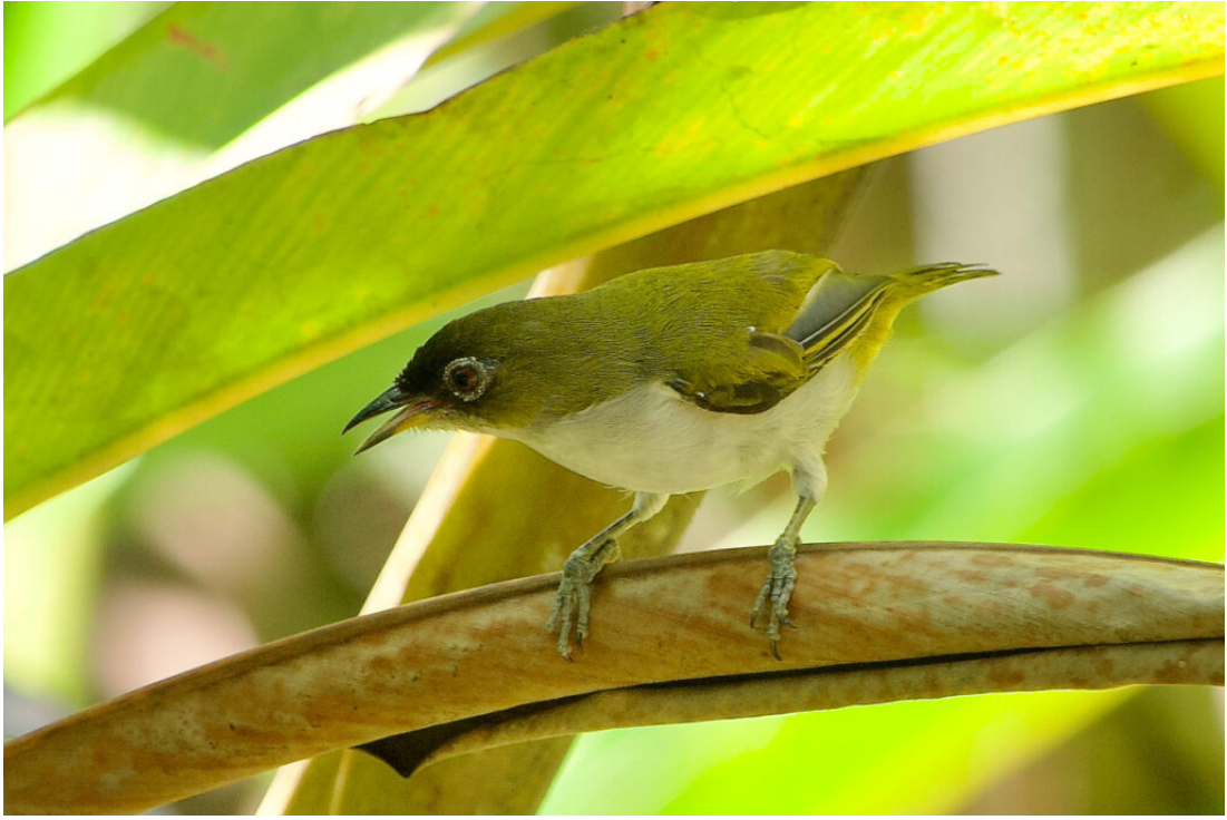
Halmahera White-eye