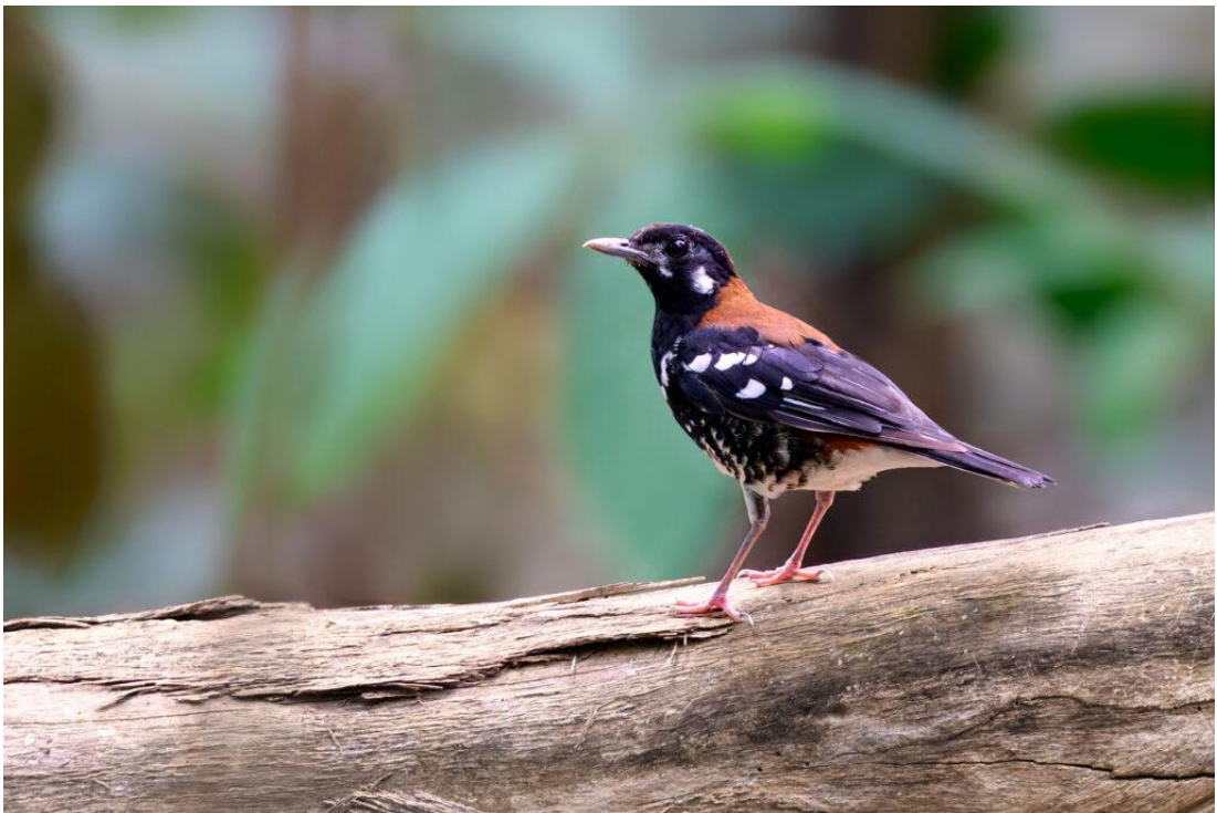
Red-backed Thrush