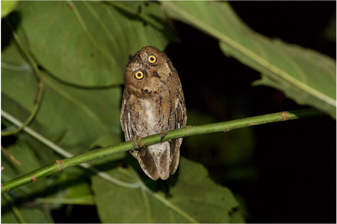
Sulawesi Scops Owl