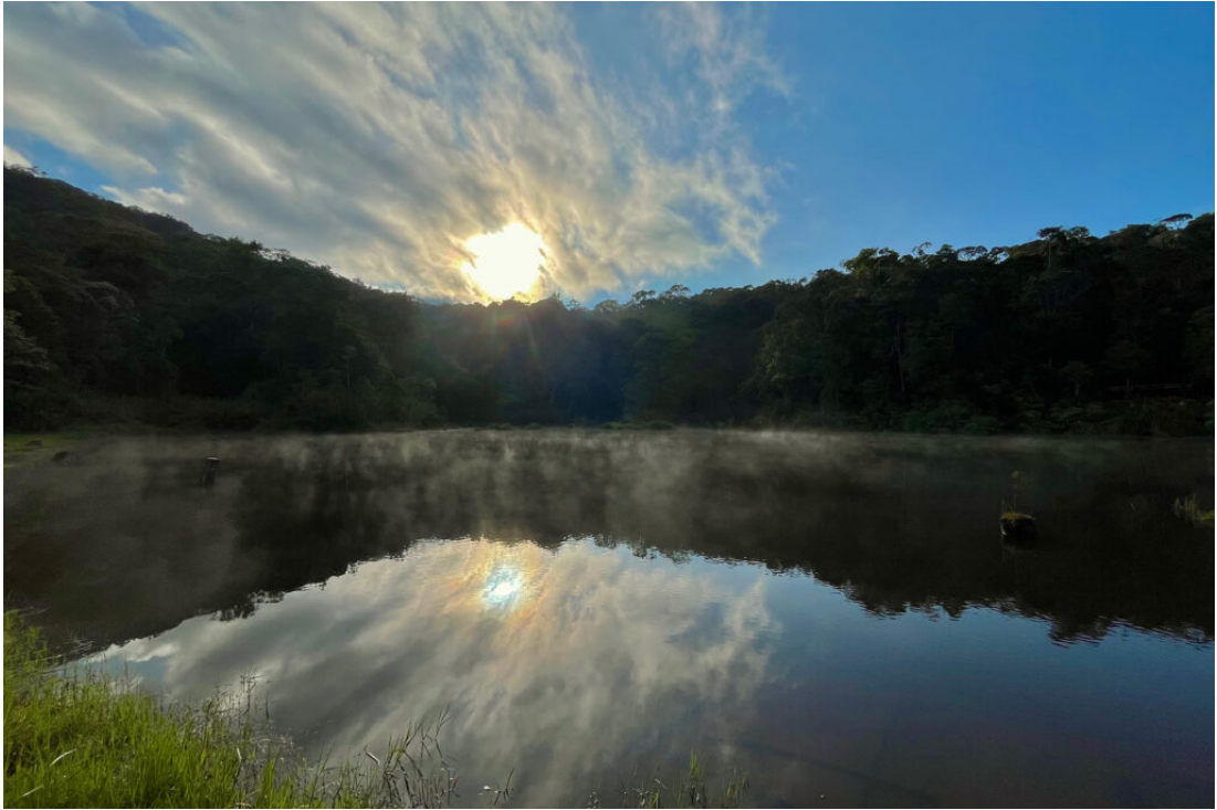
Lake Taming (image by Craig Robson)