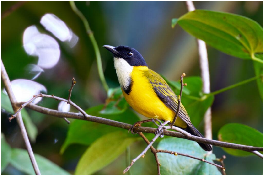
Black-chinned Whistler