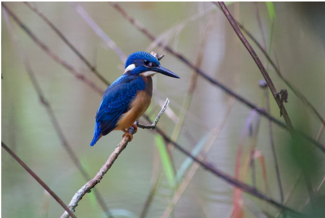
Cobalt-eared (Common) Kingfisher