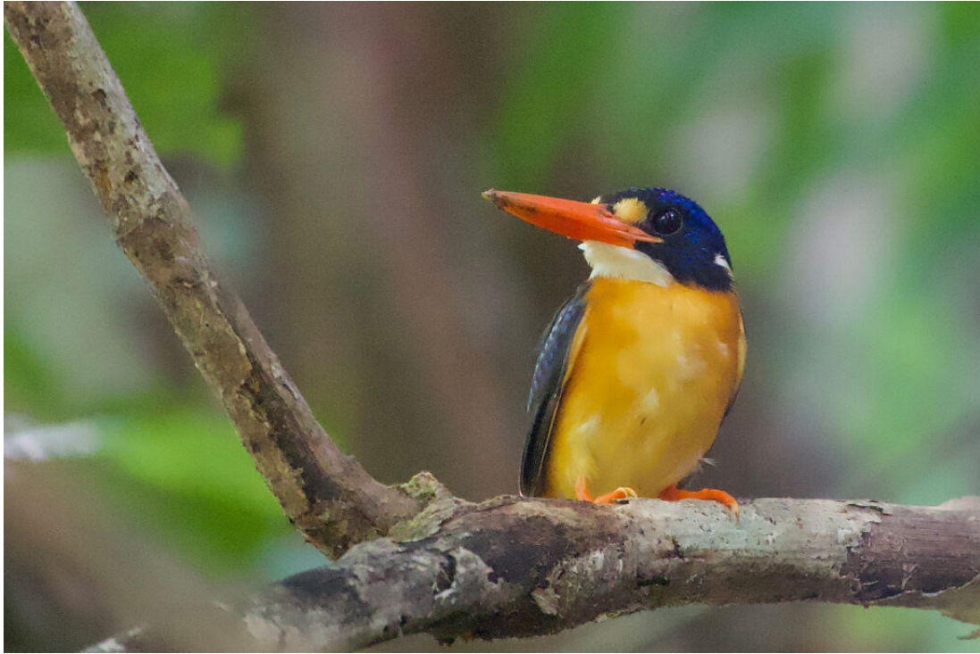
Moluccan Dwarf Kingfisher