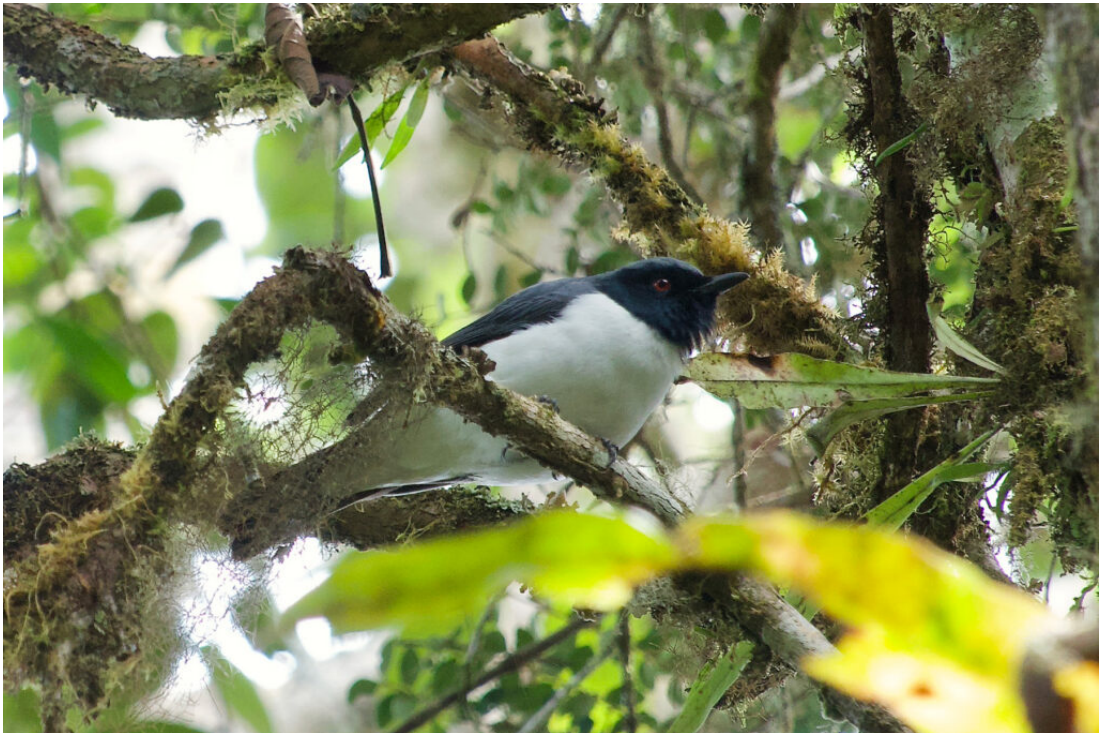
Pygmy Cuckooshrike