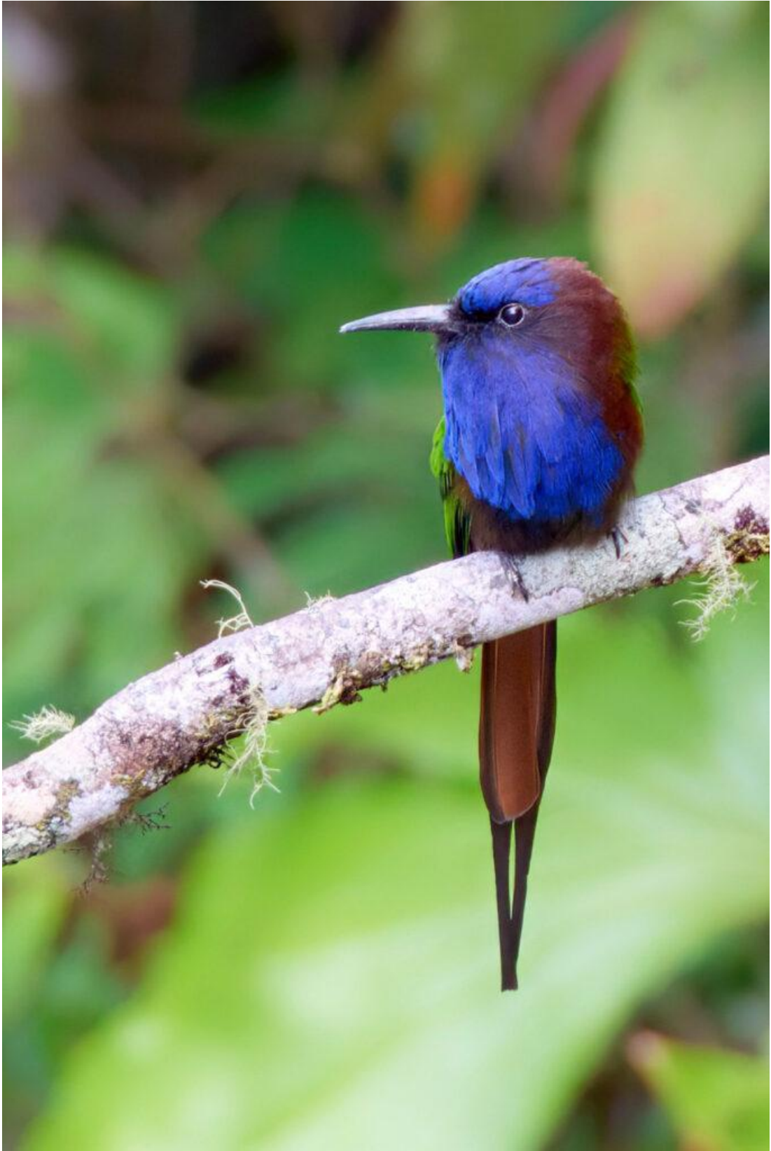
Purple-bearded Bee-eater