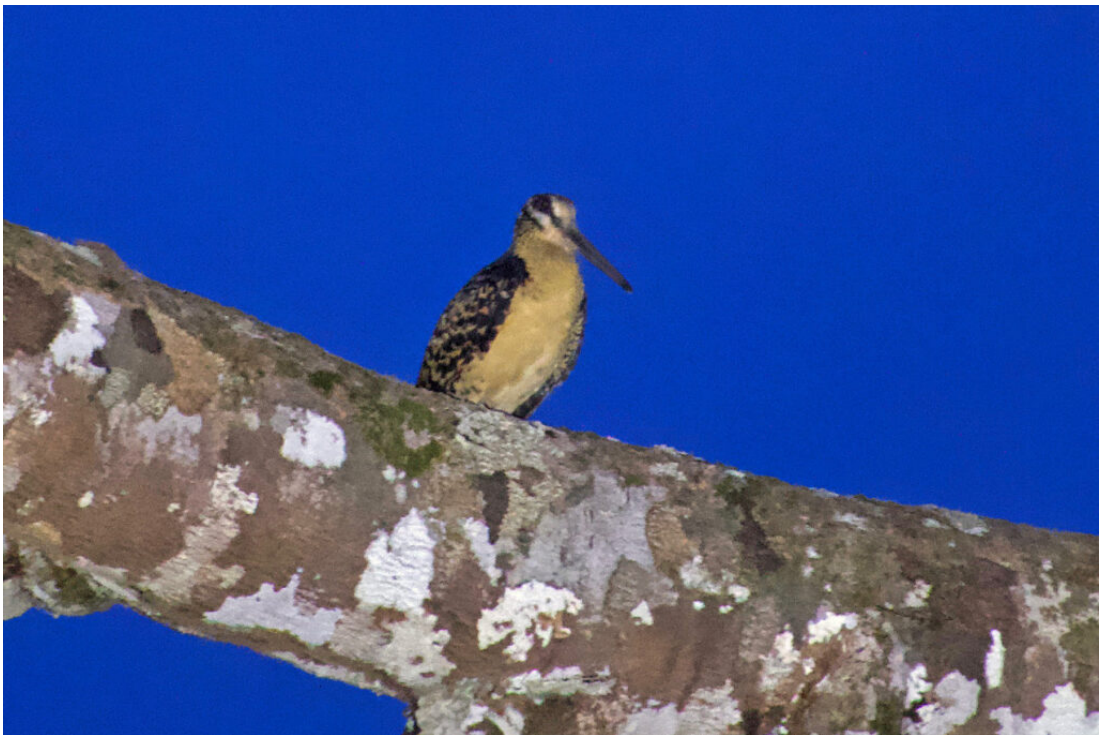
Moluccan Woodcock (image by Craig Robson)