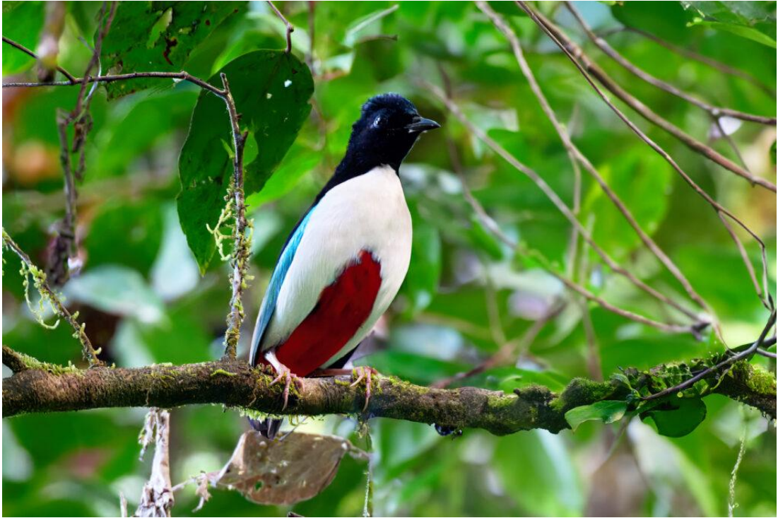
Ivory-breasted Pitta