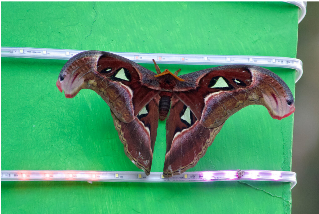
Sulawesi Atlas Moth