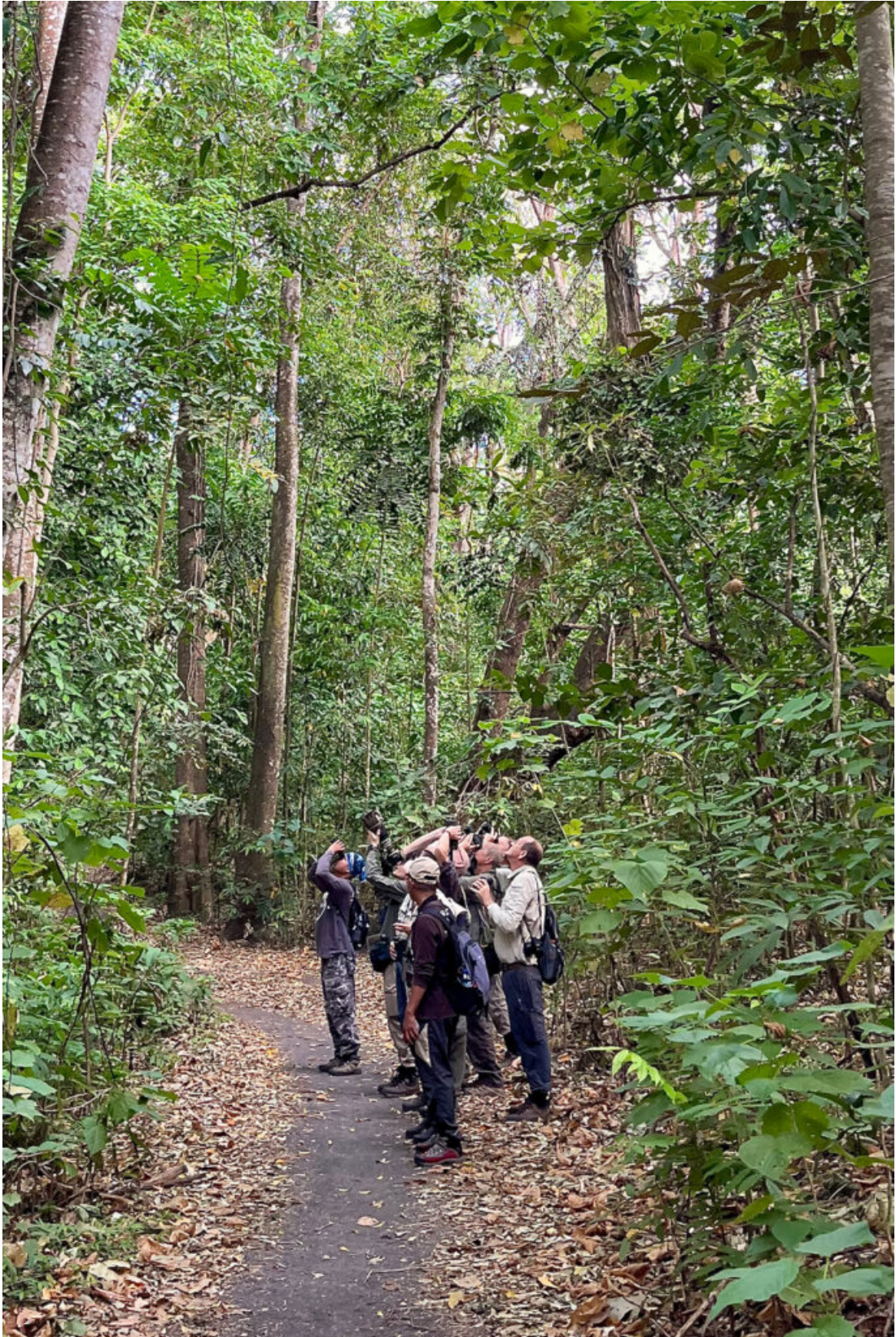
Birding at Tangkoko