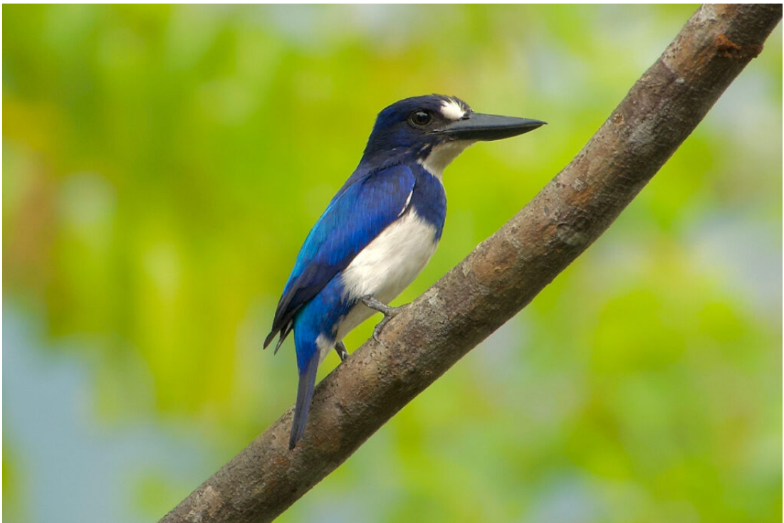
Blue-and-white Kingfisher